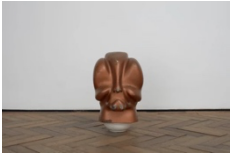
untitled , 2023 wood, enamel, bowl 37 x 20 x 25 cm 14 5/8 x 7 7/8 x 9 7/8 in (MA-SMITM-00195)