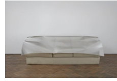
untitled , 2023 couch, mask, light diffusing plastic 75 x 231 x 120 cm 29 1/2 x 91 x 47 1/4 in (MA-SMITM-00196)