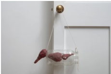
untitled , 2023 string, jar, epoxy putty 42 x 32 x 12 cm 16 1/2 x 12 5/8 x 4 3/4 in (MA-SMITM-00199)