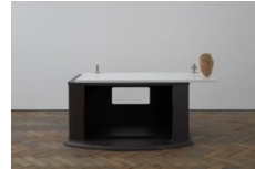
untitled , 2023 tv stand, door, rock 64 x 106.5 x 58 cm 25 1/4 x 41 7/8 x 22 7/8 in (MA-SMITM-00192)