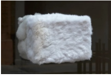
untitled , 2023 fur, shoe boxes, magnets 2 pieces, each: 25 x 16 x 43 cm 9 7/8 x 6 1/4 x 16 7/8 in (MA-SMITM-00194)