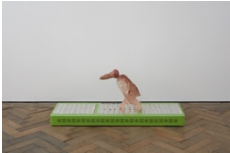
untitled , 2023 plant light, crystal, Plexiglass, epoxy putty 34 x 84 x 27 cm 13 3/8 x 33 1/8 x 10 5/8 in (MA-SMITM-00193)