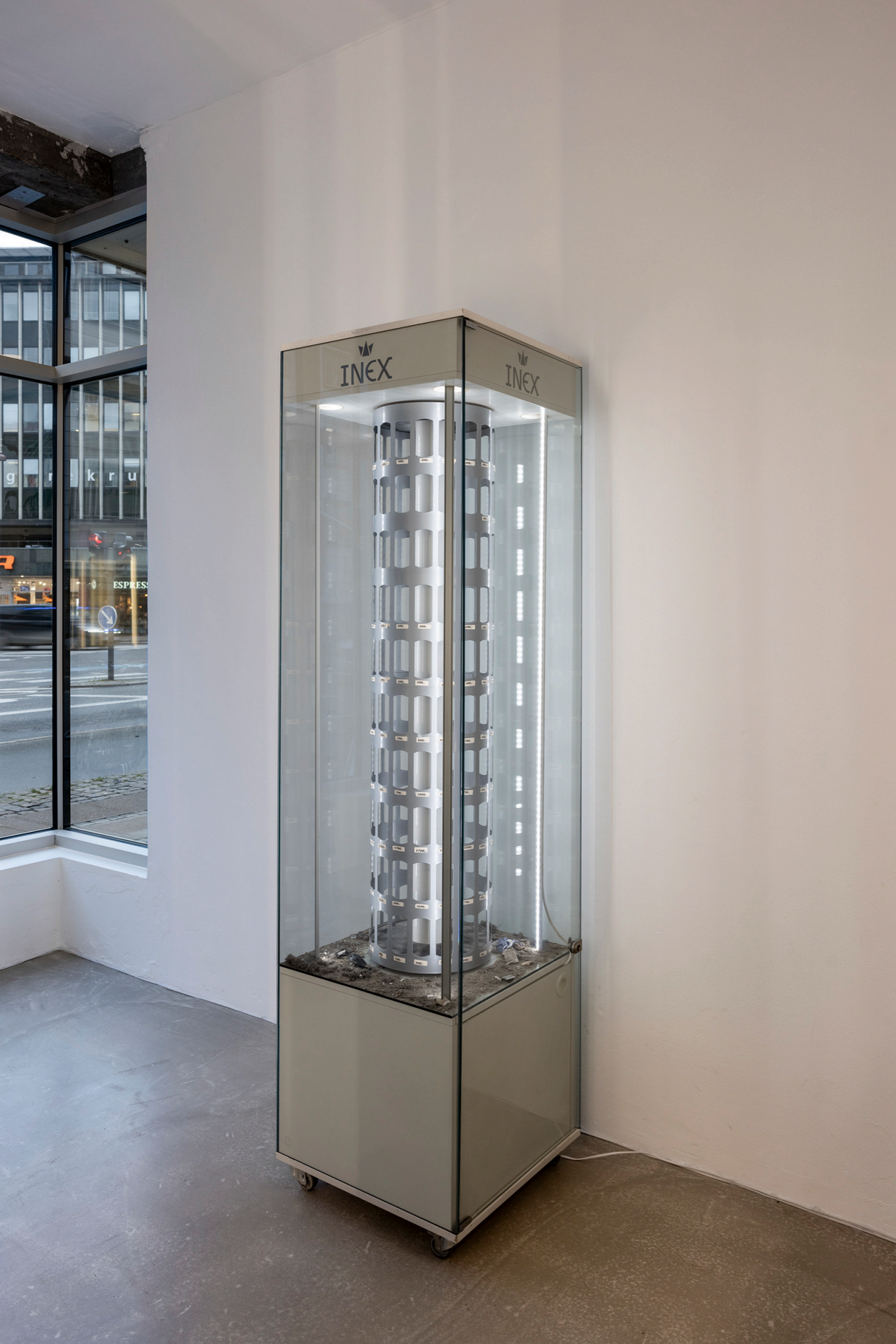
Simon Dybbroe Møller Inex , 2023 Vitrine, dust 196.5 x 50 x 50 cm