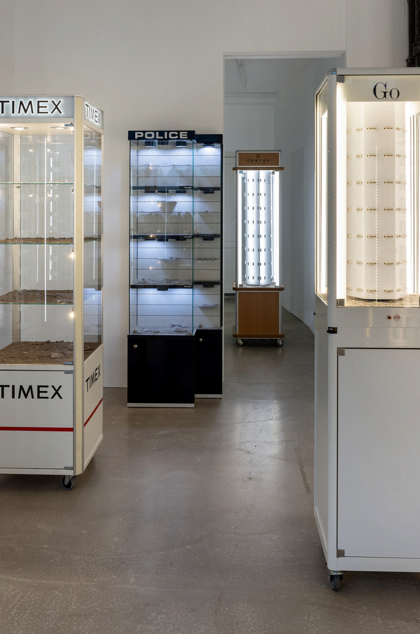
Simon Dybbroe Møller Installation view, All the time in the world palace enterprise