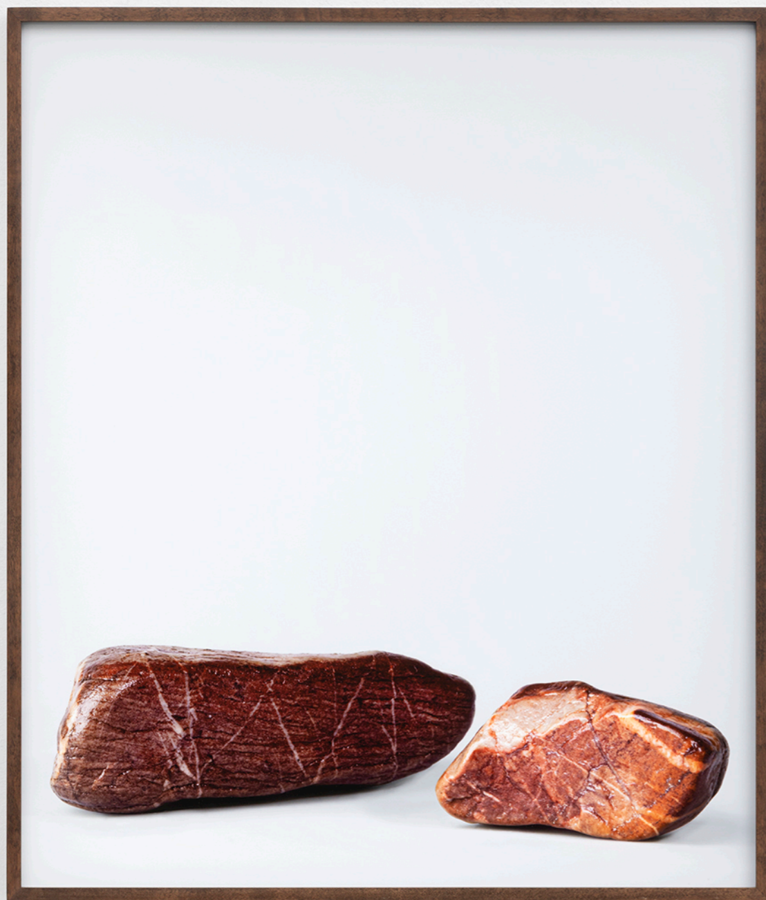
Simon Dybbroe Møller Untitled , 2022 C-print, frame 61 x 52 x 3.5 cm Edition 1/3