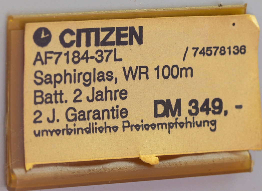
Simon Dybbroe Møller Citizen , 2023 Vitrine, dust 186 x 73 x 73 cm Detail