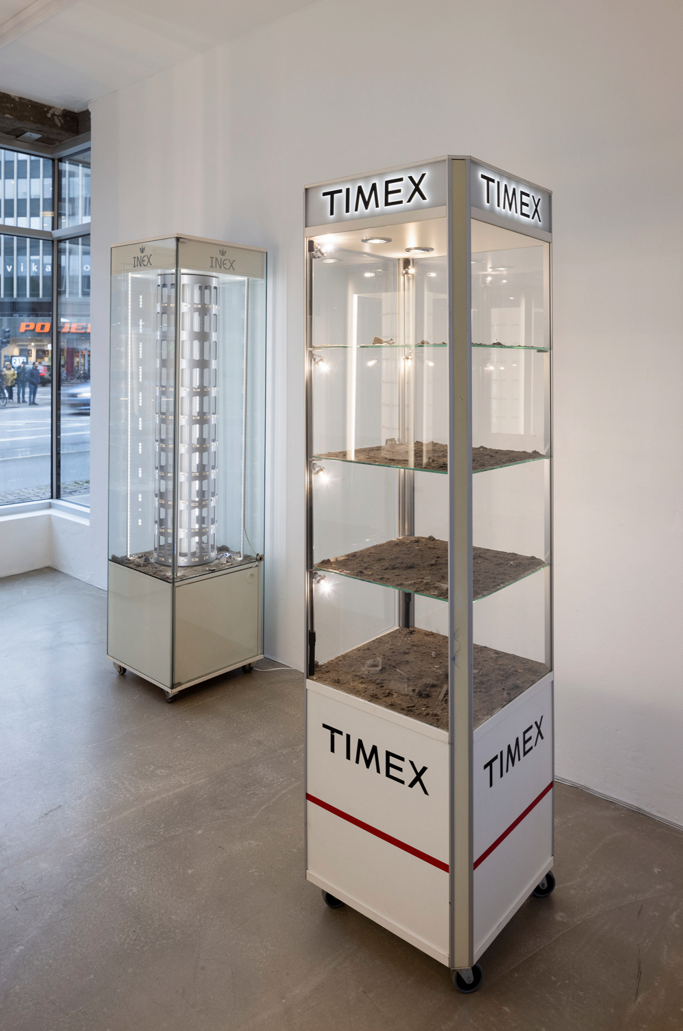
Simon Dybbroe Møller Timex , 2023 Vitrine, dust 190.5 x 50 x 50 cm