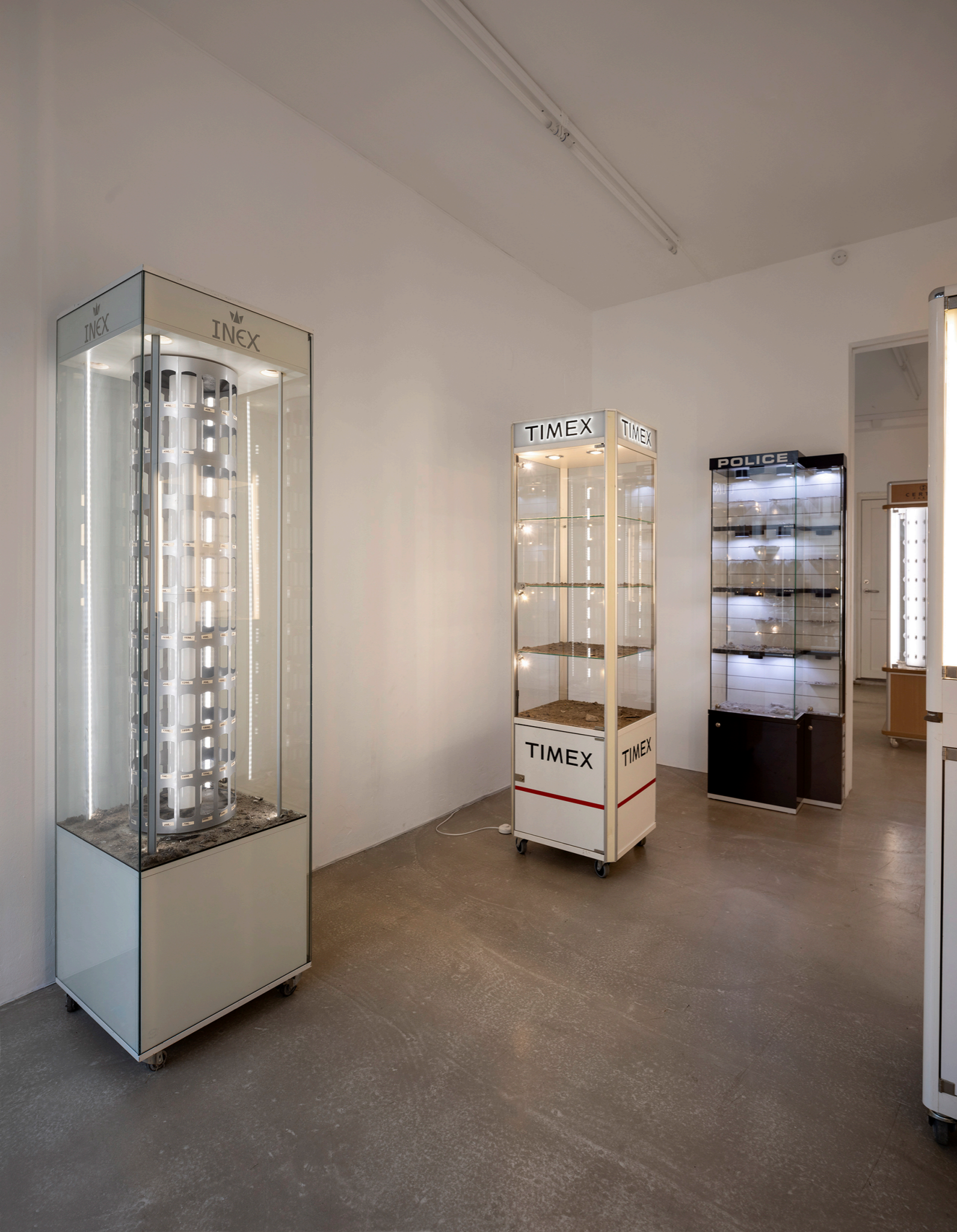
Simon Dybbroe Møller Installation view, All the time in the world palace enterprise