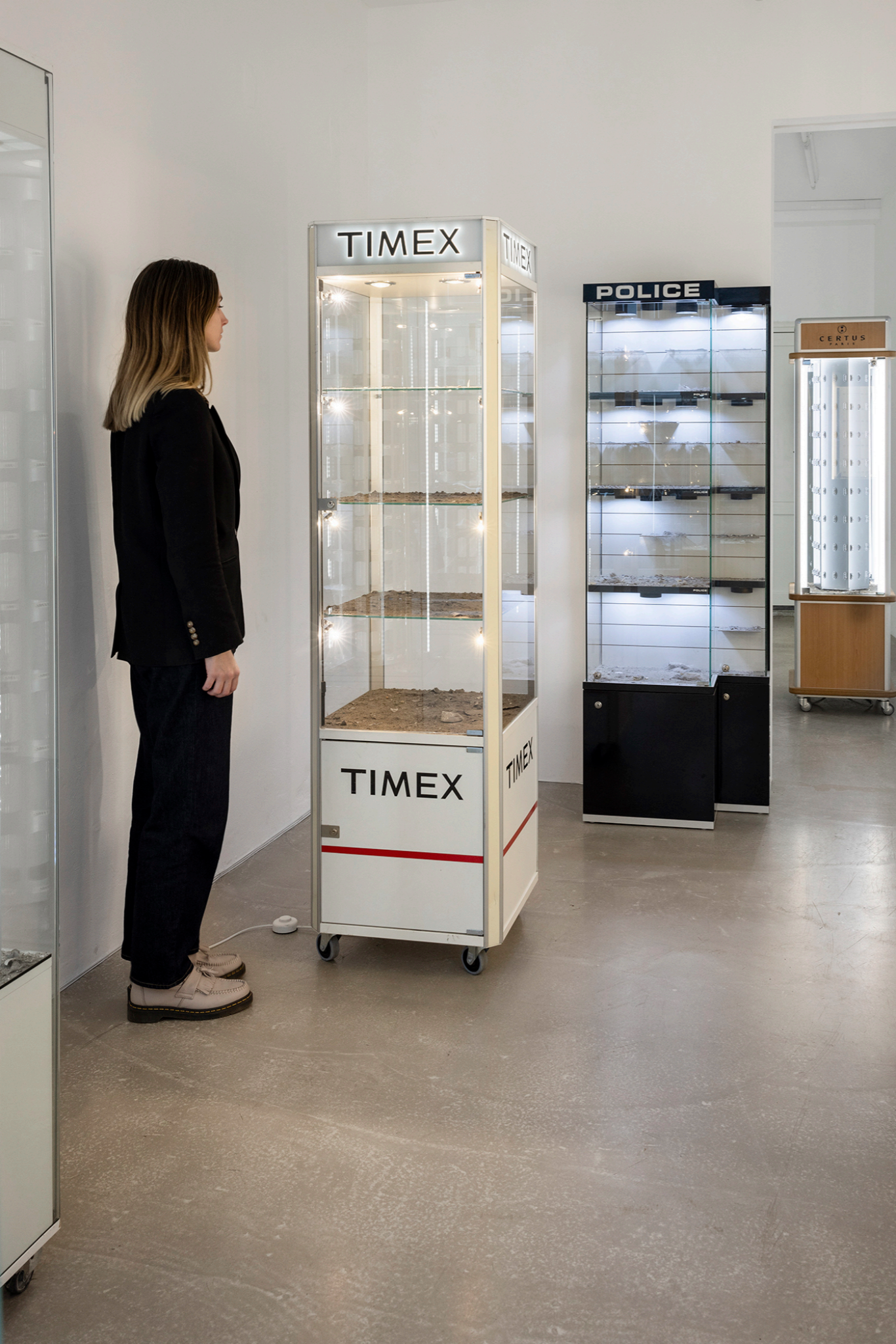
Simon Dybbroe Møller Installation view, All the time in the world palace enterprise