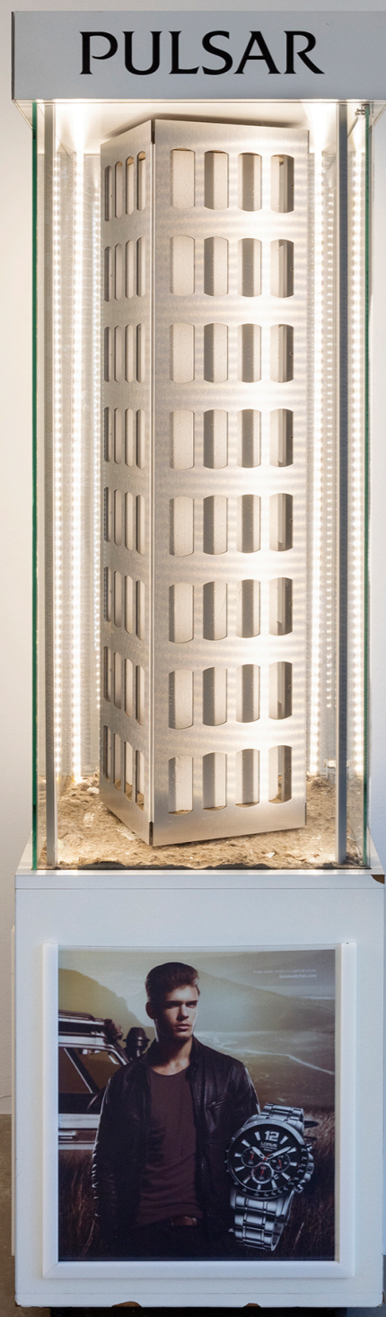
Simon Dybbroe Møller Pulsar , 2023 Vitrine, dust 184.5 x 50 x 50 cm