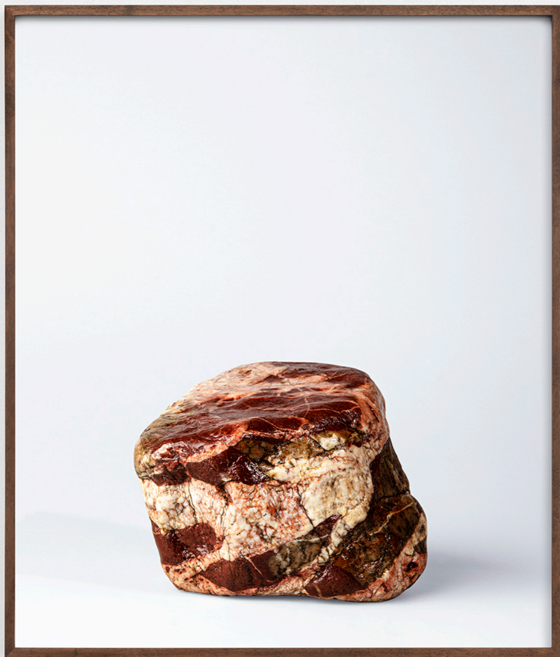
Simon Dybbroe Møller Untitled , 2022 C-print, frame 61 x 52 x 3.5 cm Edition 1/3