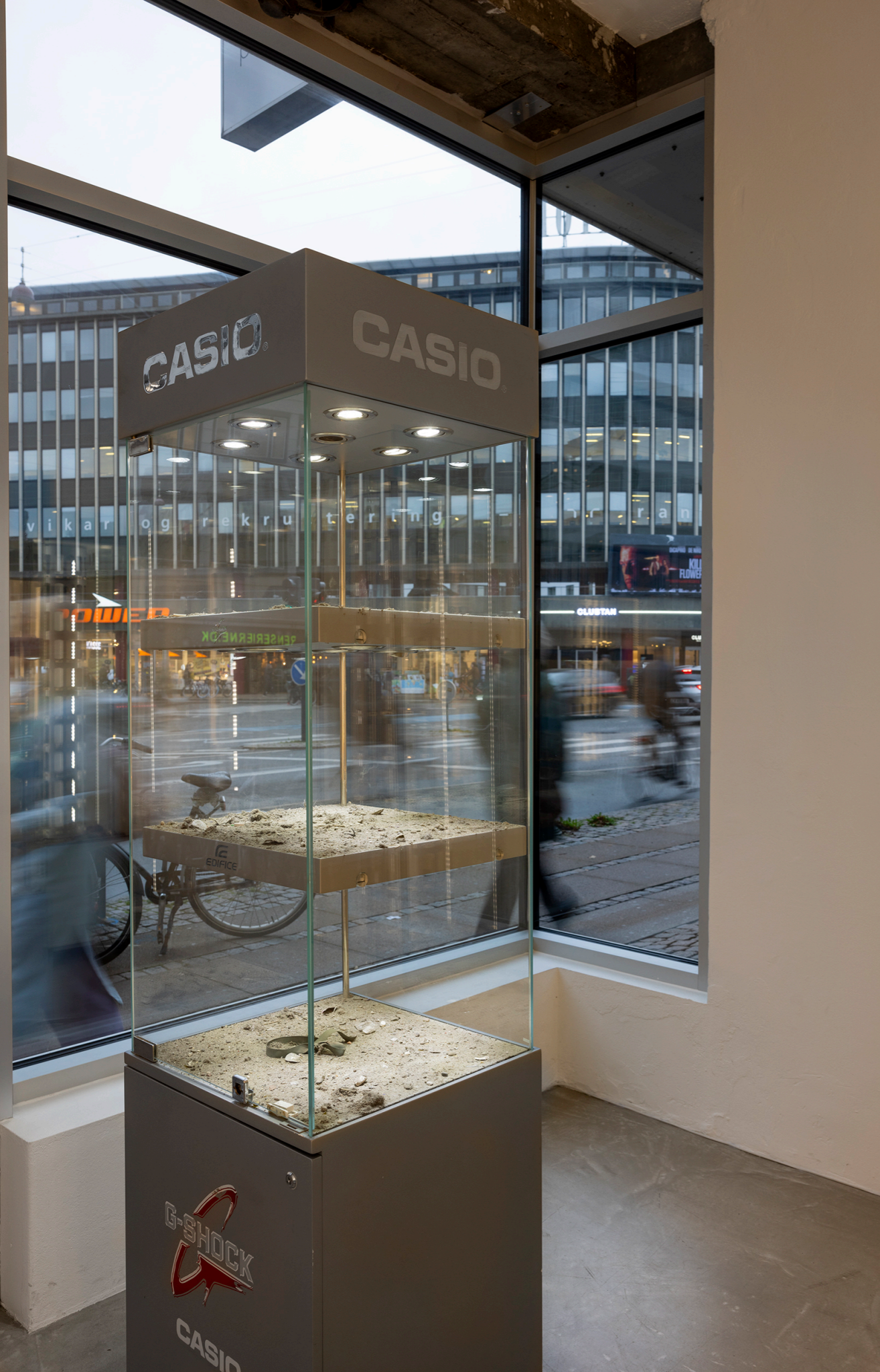
Simon Dybbroe Møller Casio , 2023 Vitrine, dust 186 x 48 x 48 cm