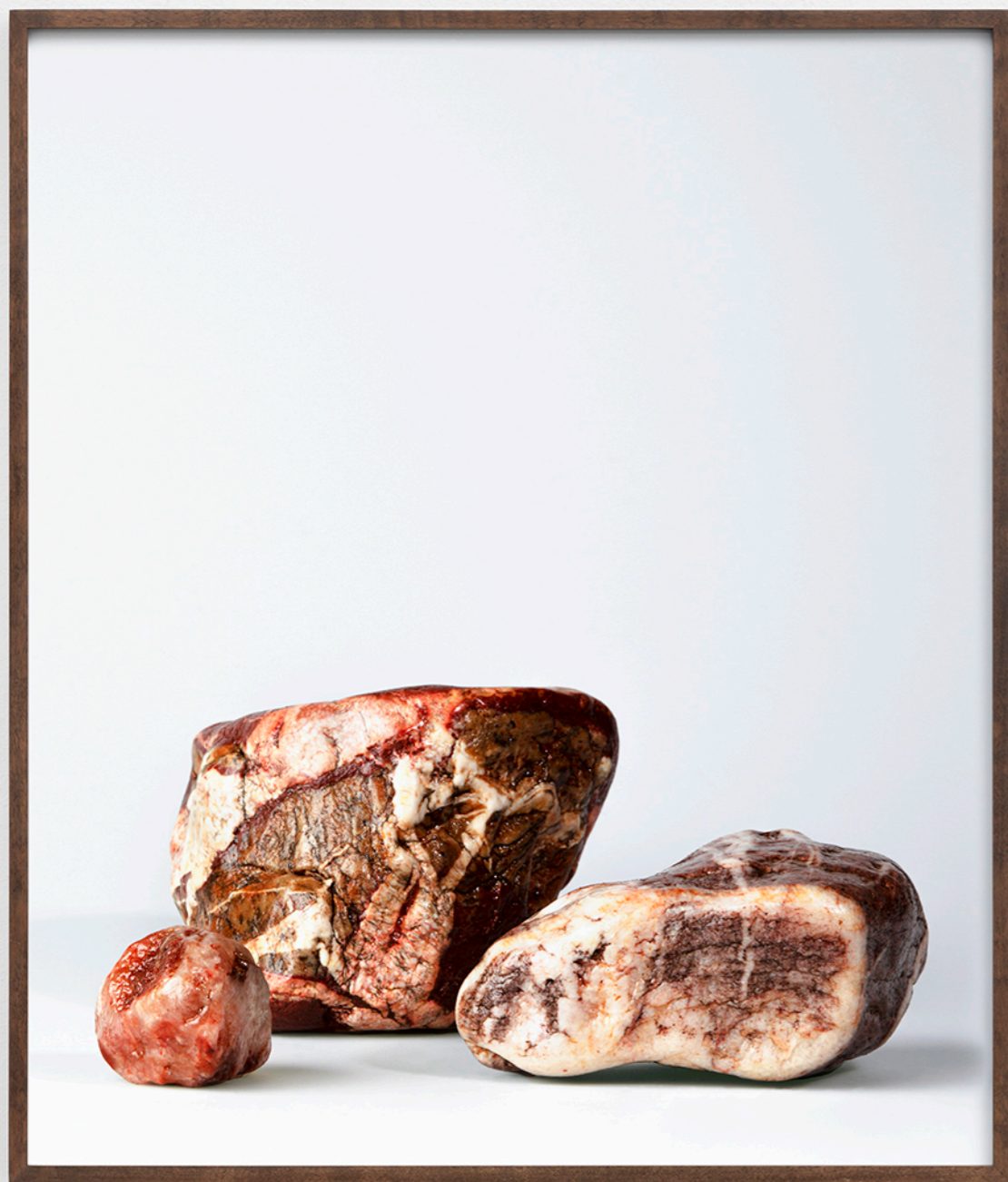
Simon Dybbroe Møller Untitled , 2022 C-print, frame 61 x 52 x 3.5 cm Edition 1/3