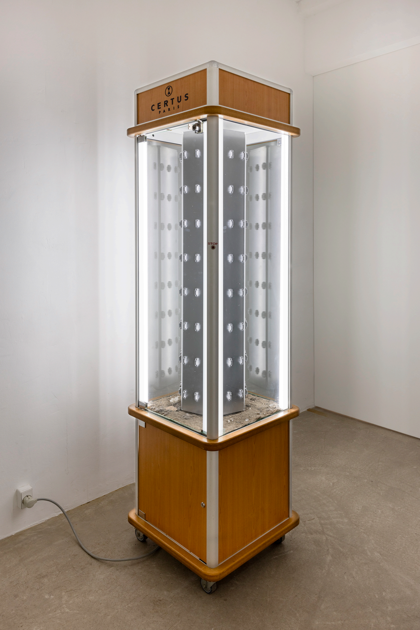
Simon Dybbroe Møller Certus , 2023 Vitrine, dust 195 x 50 x 50 cm