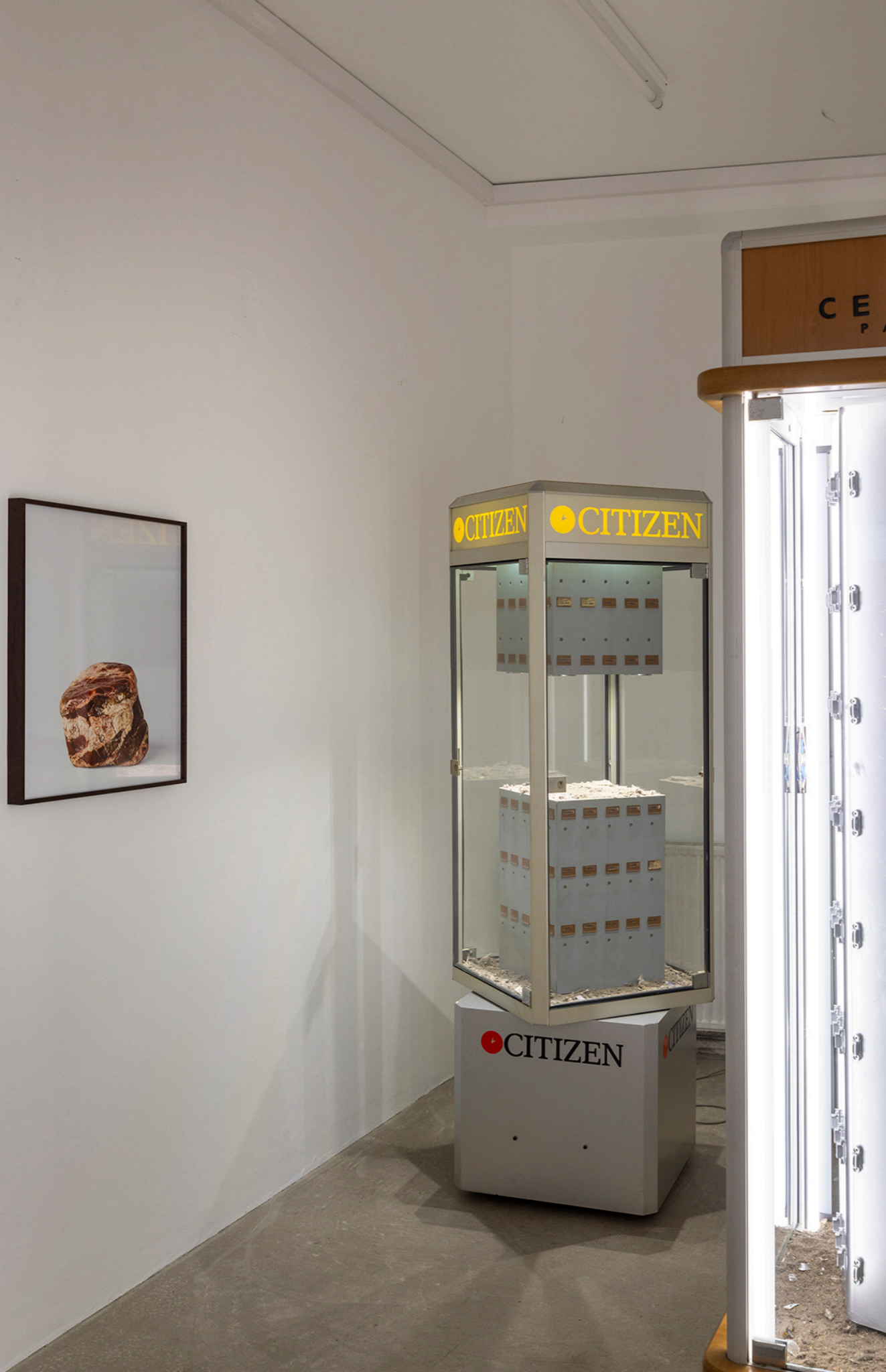
Simon Dybbroe Møller Installation view, All the time in the world palace enterprise