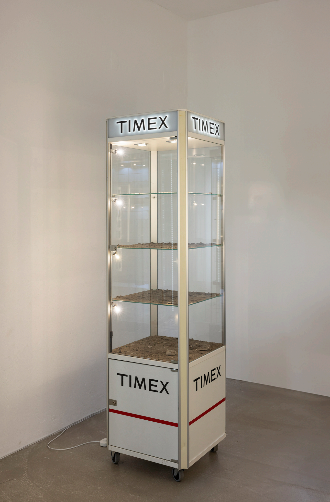
Simon Dybbroe Møller Timex , 2023 Vitrine, dust 190.5 x 50 x 50 cm