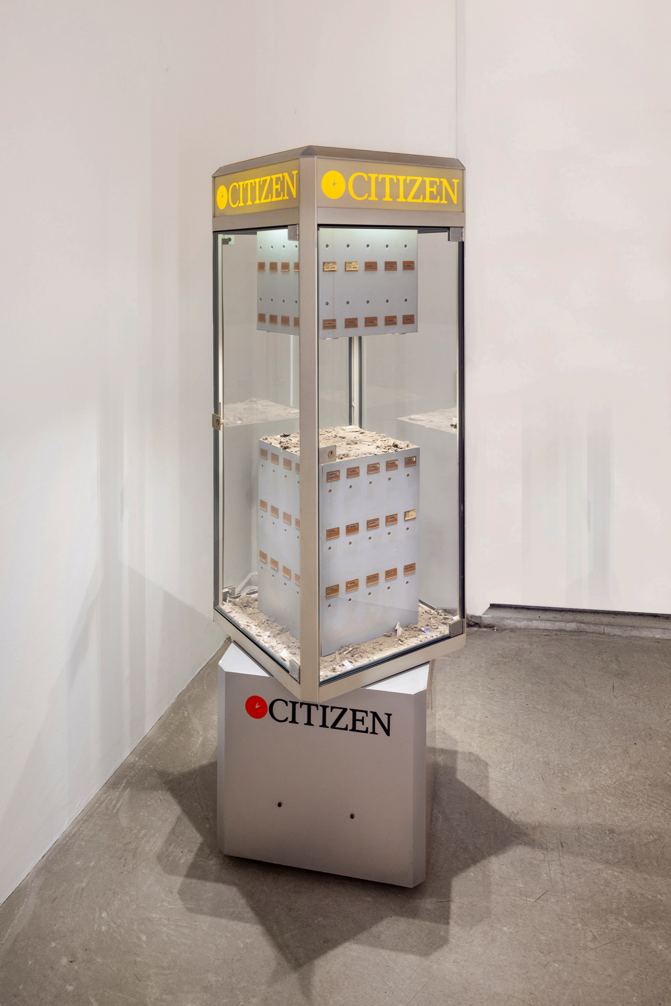
Simon Dybbroe Møller Citizen , 2023 Vitrine, dust 186 x 73 x 73 cm