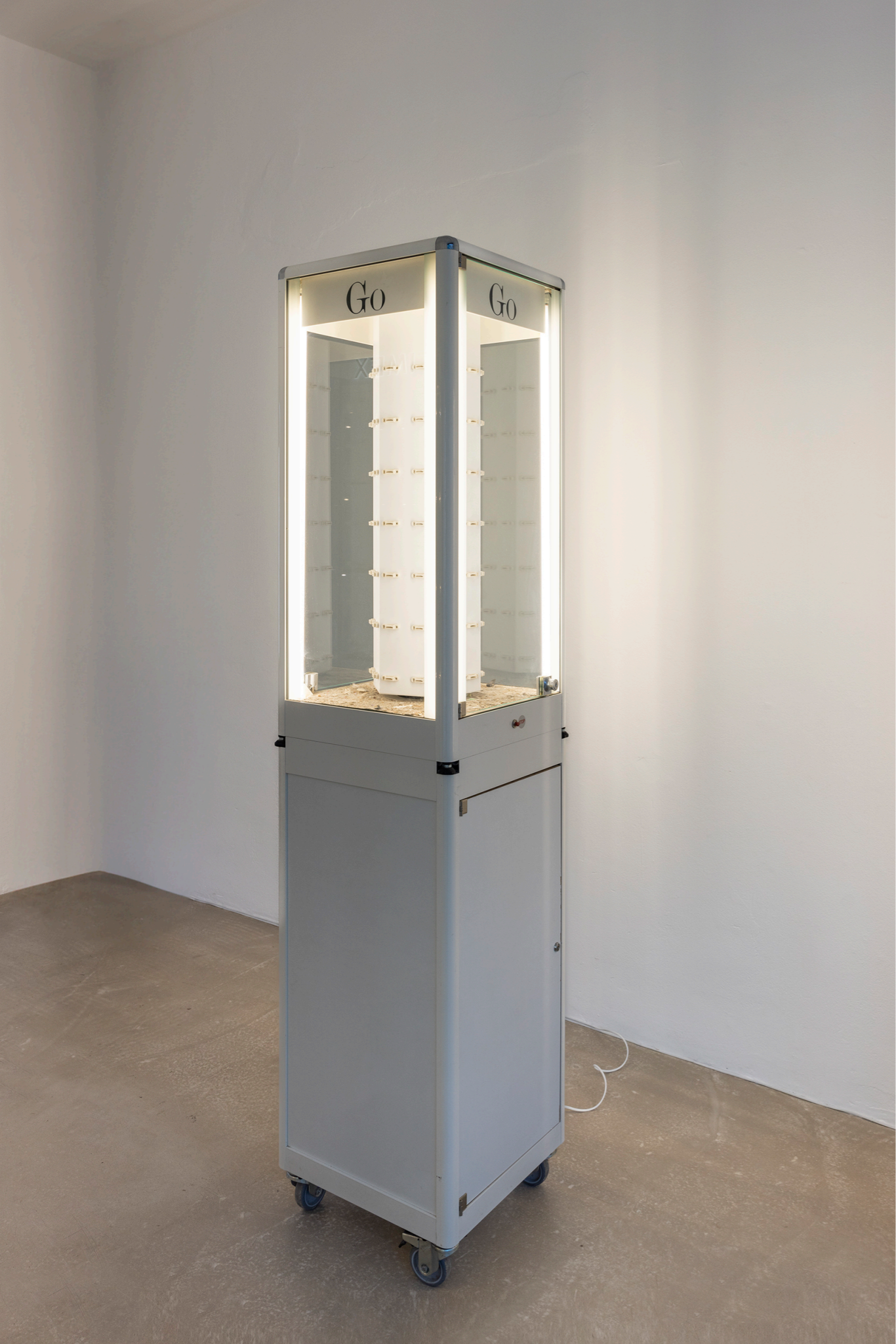
Simon Dybbroe Møller Go , 2023 Vitrine, dust 185.5 x 40 x 40 cm