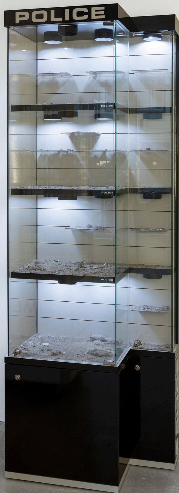
Simon Dybbroe Møller Police , 2023 Vitrine, dust 189.5 x 63 x 35 cm