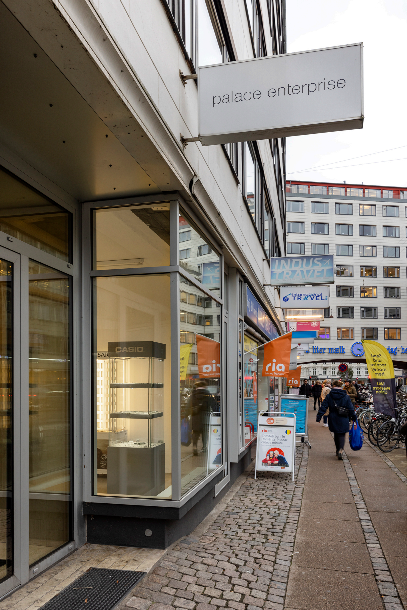
Simon Dybbroe Møller Installation view, All the time in the world palace enterprise