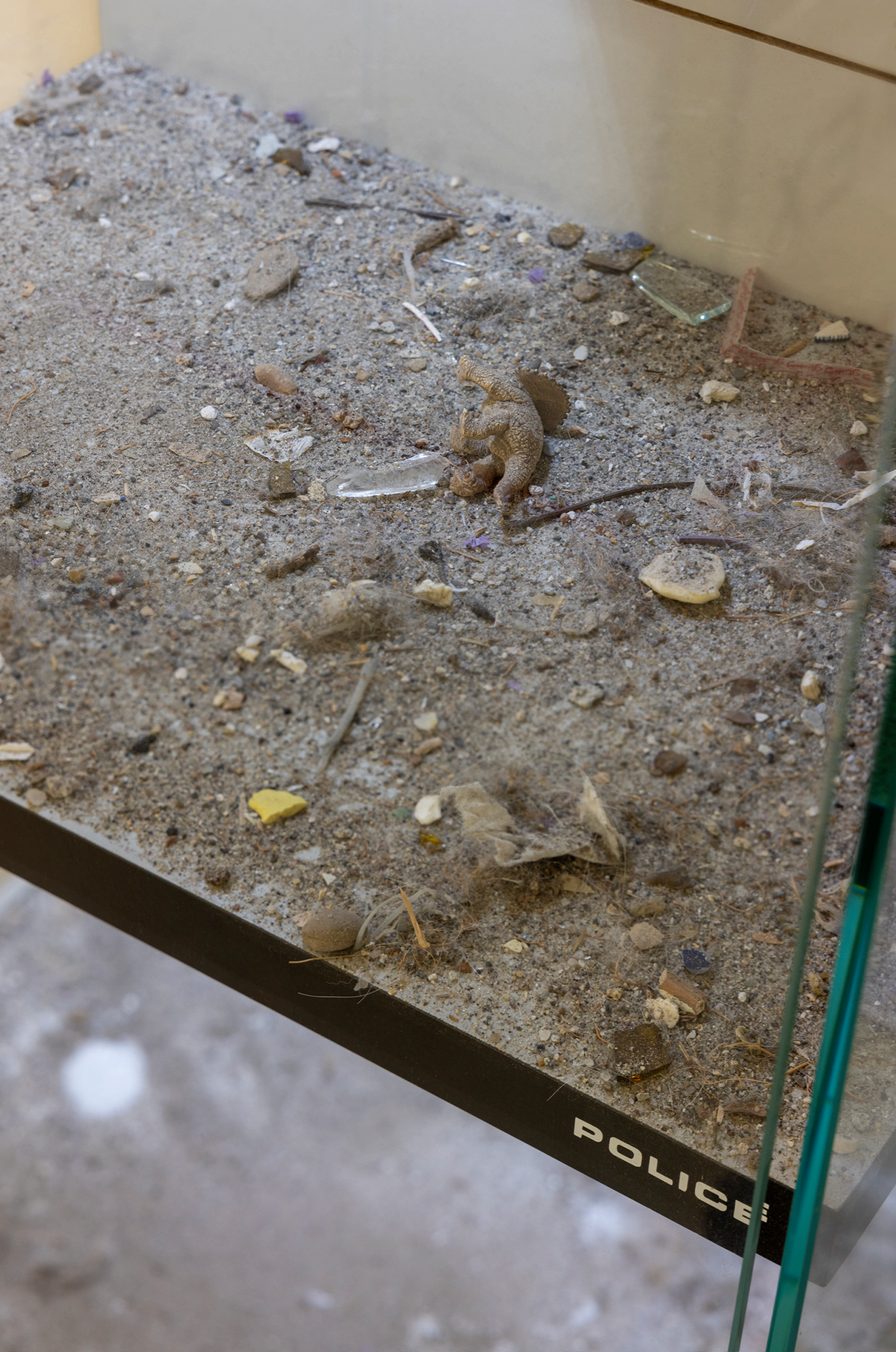
Simon Dybbroe Møller Police , 2023 Vitrine, dust 189.5 x 63 x 35 cm Detail