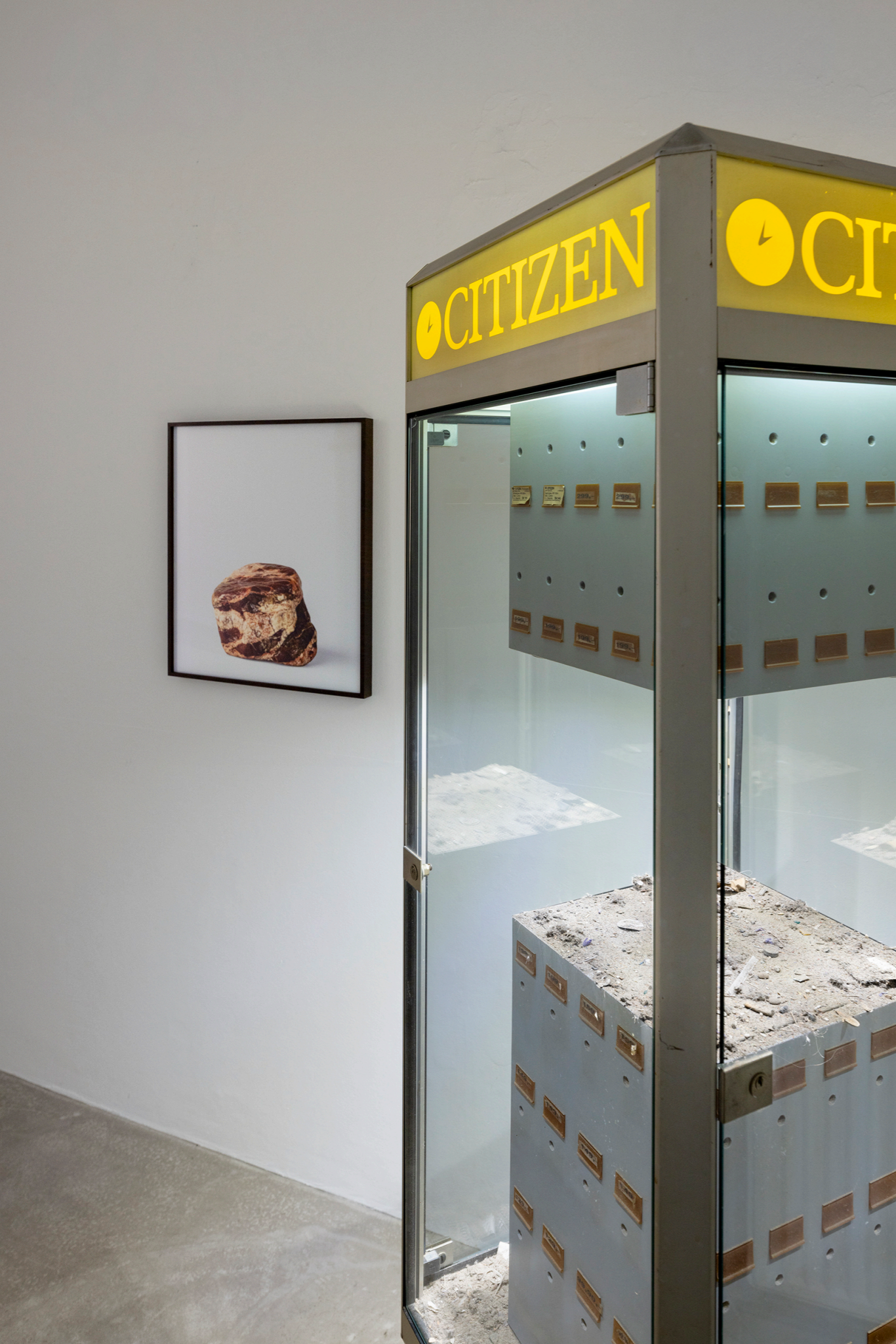
Simon Dybbroe Møller Citizen , 2023 Vitrine, dust 186 x 73 x 73 cm Detail