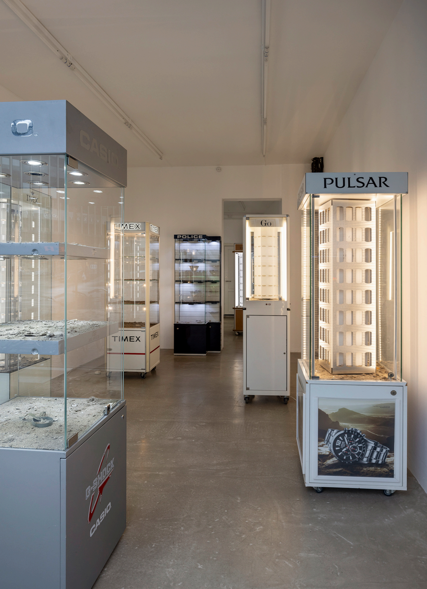
Simon Dybbroe Møller Installation view, All the time in the world palace enterprise