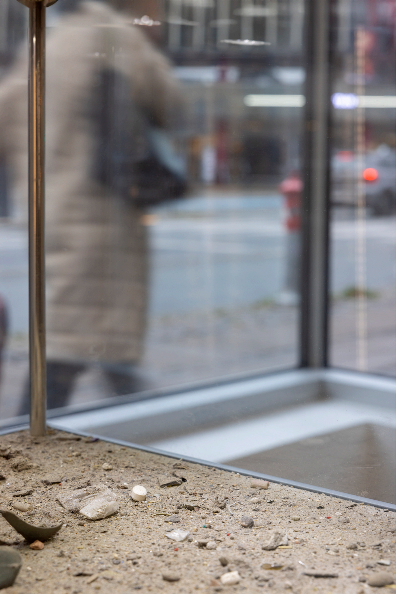
Simon Dybbroe Møller Casio , 2023 Vitrine, dust 186 x 48 x 48 cm Detail