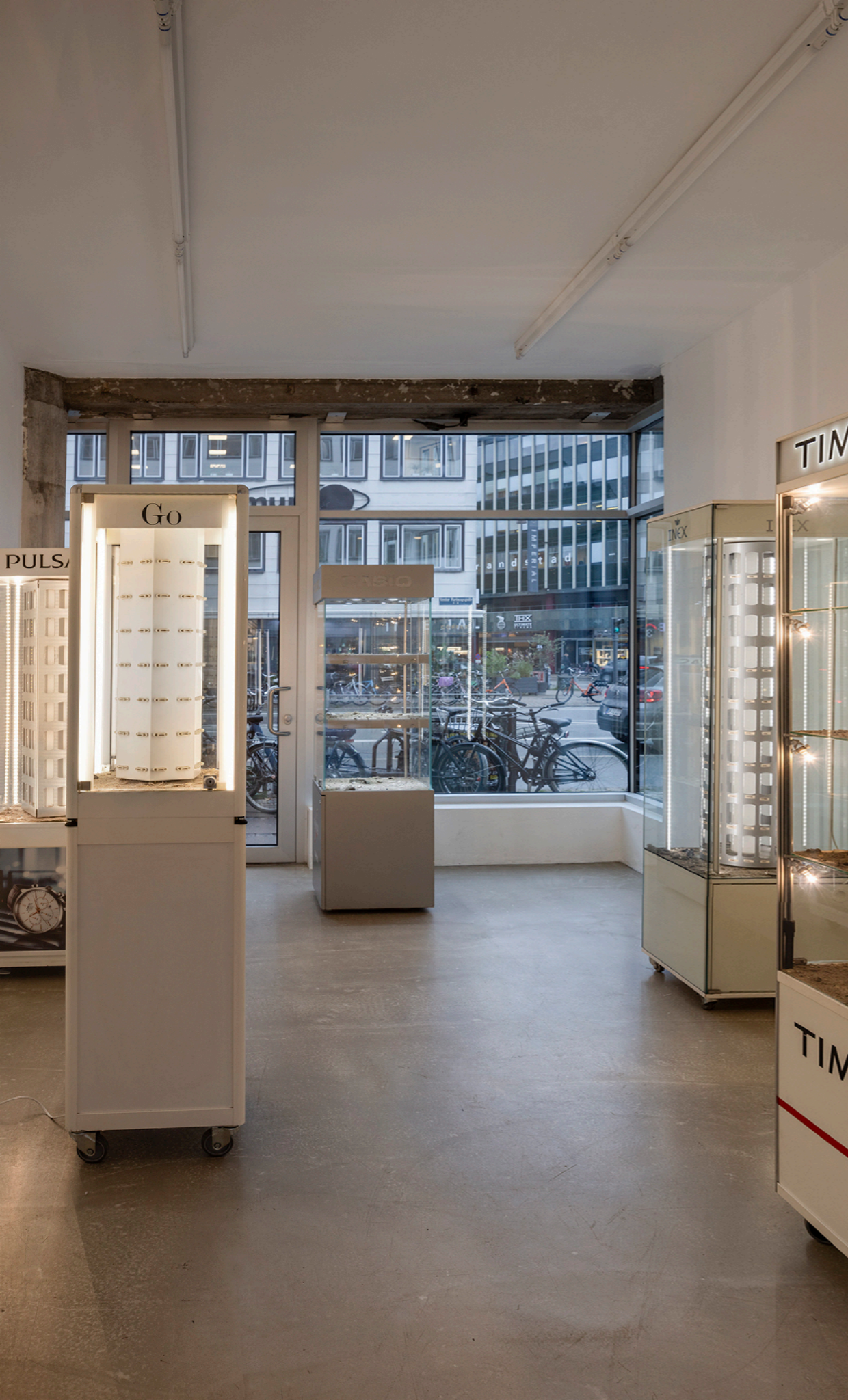
Simon Dybbroe Møller Installation view, All the time in the world palace enterprise