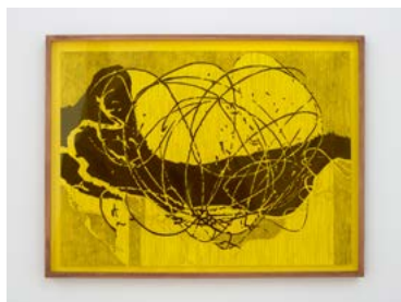
Olivia van Kuiken Untitled , 2023 Ink on paper, artist's frame with colored glass 19 x 24.625 inches (framed) 48.3 x 62.6 cm (framed)