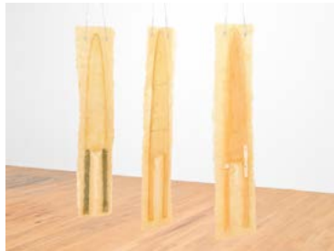
Maureen Gruben Fresh Artifacts , 2017 Cast resin, steel, copper mails, reflective tape, wax 52 x 12 inches each piece 132.1 x 30.5 cm each piece