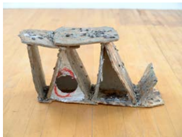
Sophie Friedman-Pappas Prop #1 , 2023 Mixed media 11.5 x 23 x 8 inches 29.2 x 58.4 x 20.3 cm