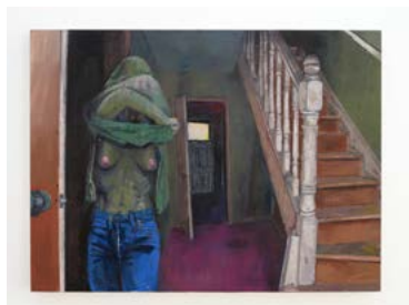
Michelle Uckotter Interior entryway with magenta carpet , 2023 Oil pastel on panel 30 x 40 inches 76.2 x 101.6 cm