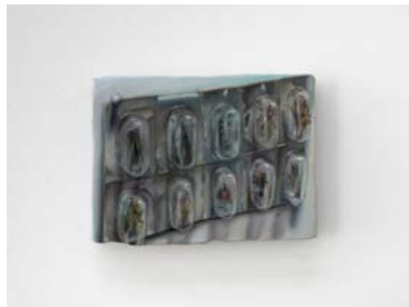
Ella Rose Flood Bug funeral IBGard blister package , 2023 Oil on linen 5 x 7 inches 12.7 x 17.8 cm