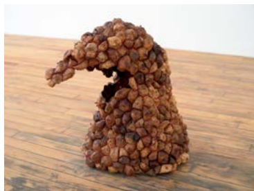
Nöle Giulini Meyerkappe , 2008 Meyer lemon peels, myrrh and frankincense resins, and thread on metal armature 20 x 20 x 15 inches 50.8 x 50.8 x 38.1 cm