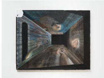
Judith Dean A+E , 2021 Acrylic on linen 16 x 20 inches 40.5 x 51 cm