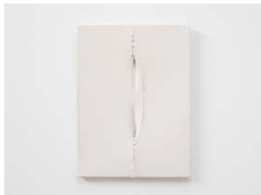
Eli Ping Aphakic , 2023 Cast hydrocal 16 x 12 x 1 inches 40.6 x 30.5 x 2.5 cm