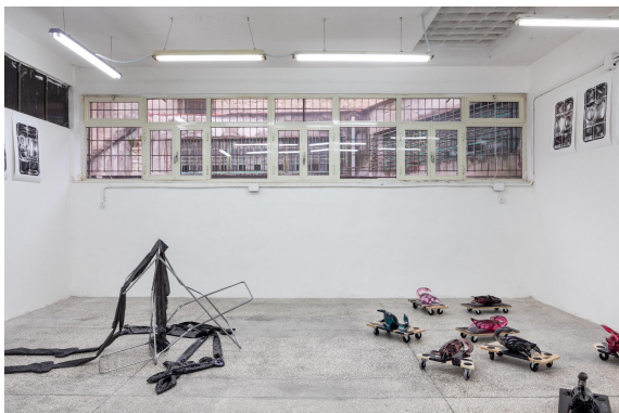
Thomas Liu Le Lann FRENCH TOAST VIN VIN Naples Installation View

Photo: Danilo Donzelli Courtesy: The Artist and VIN VIN Vienna, Naples