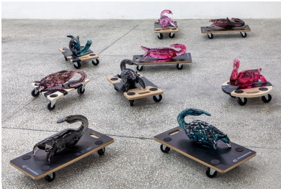
Thomas Liu Le Lann FRENCH TOAST VIN VIN Naples Installation View Penelopes , 2022 Blown glass 40 x 18 x 18 cm each