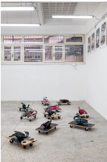
Thomas Liu Le Lann FRENCH TOAST VIN VIN Naples Installation View Penelopes, 2022 Blown glass 40 x 18 x 18 cm each