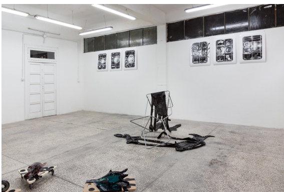
Thomas Liu Le Lann FRENCH TOAST VIN VIN Naples Installation View