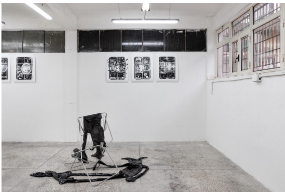
Thomas Liu Le Lann FRENCH TOAST VIN VIN Naples Installation View