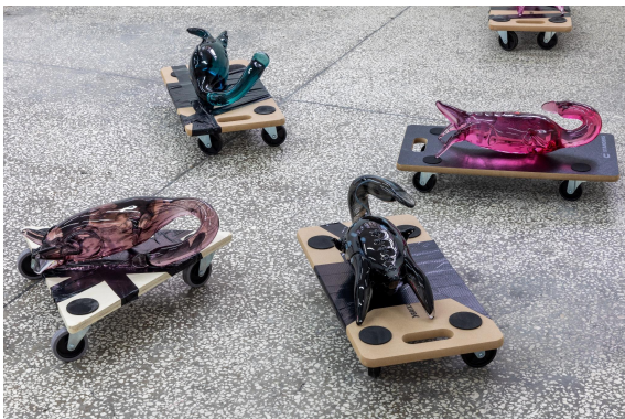
Thomas Liu Le Lann FRENCH TOAST VIN VIN Naples Installation View Penelopes , 2022 Blown glass 40 x 18 x 18 cm each