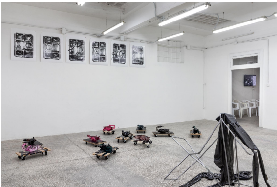
Thomas Liu Le Lann FRENCH TOAST VIN VIN Naples Installation View