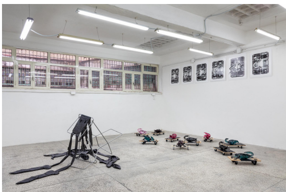
Thomas Liu Le Lann FRENCH TOAST VIN VIN Naples Installation View