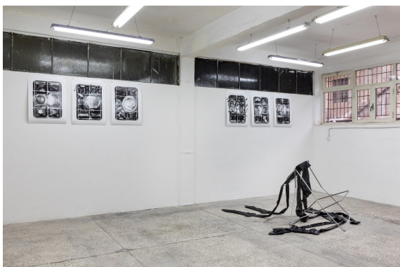
Thomas Liu Le Lann FRENCH TOAST VIN VIN Naples Installation View