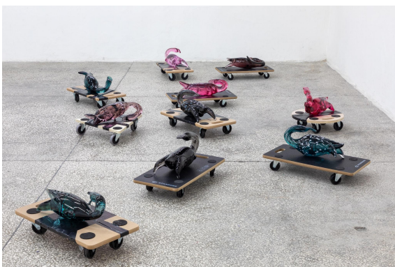
Thomas Liu Le Lann FRENCH TOAST VIN VIN Naples Installation View Penelopes, 2022 Blown glass 40 x 18 x 18 cm each

Photo: Danilo Donzelli Courtesy: The Artist and VIN VIN Vienna,Naples