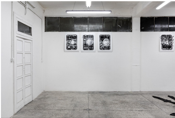
Thomas Liu Le Lann FRENCH TOAST VIN VIN Naples Installation View