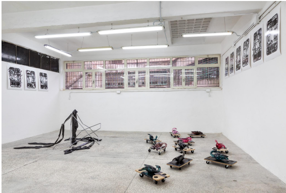
Thomas Liu Le Lann FRENCH TOAST VIN VIN Naples Installation View

Photo: Danilo Donzelli Courtesy: The Artist and VIN VIN Vienna,Naples