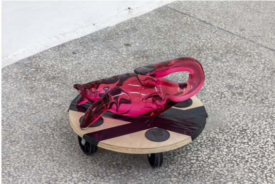
Thomas Liu Le Lann FRENCH TOAST VIN VIN Naples Penelope IX , 2022 Blown glass 40 x 18 x 18 cm