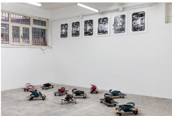
Thomas Liu Le Lann FRENCH TOAST VIN VIN Naples Installation View