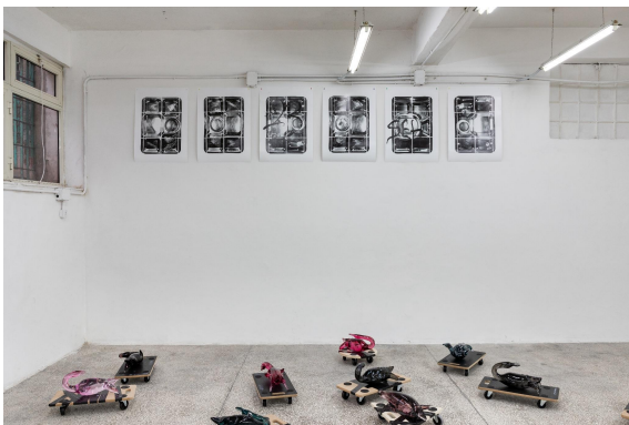
Thomas Liu Le Lann FRENCH TOAST VIN VIN Naples Installation View