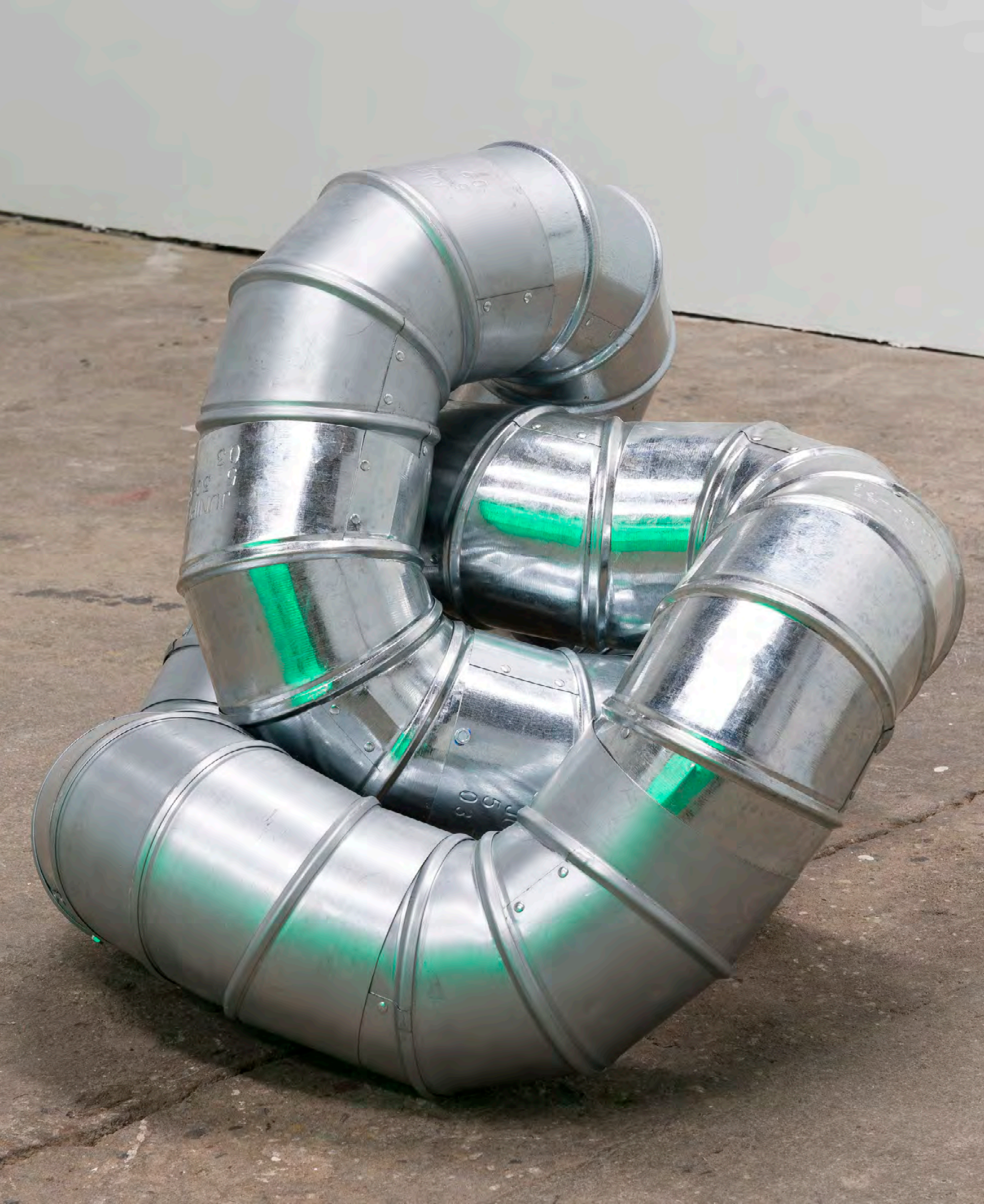
fields harrington Surreptitious Spread (Ventilation Series) , 2023 Aluminum Round Air Duct and hardware 43.2 × 50.8 × 48.3 cm | 17 × 20 × 19 in USD 4.600.00 + VAT / transport