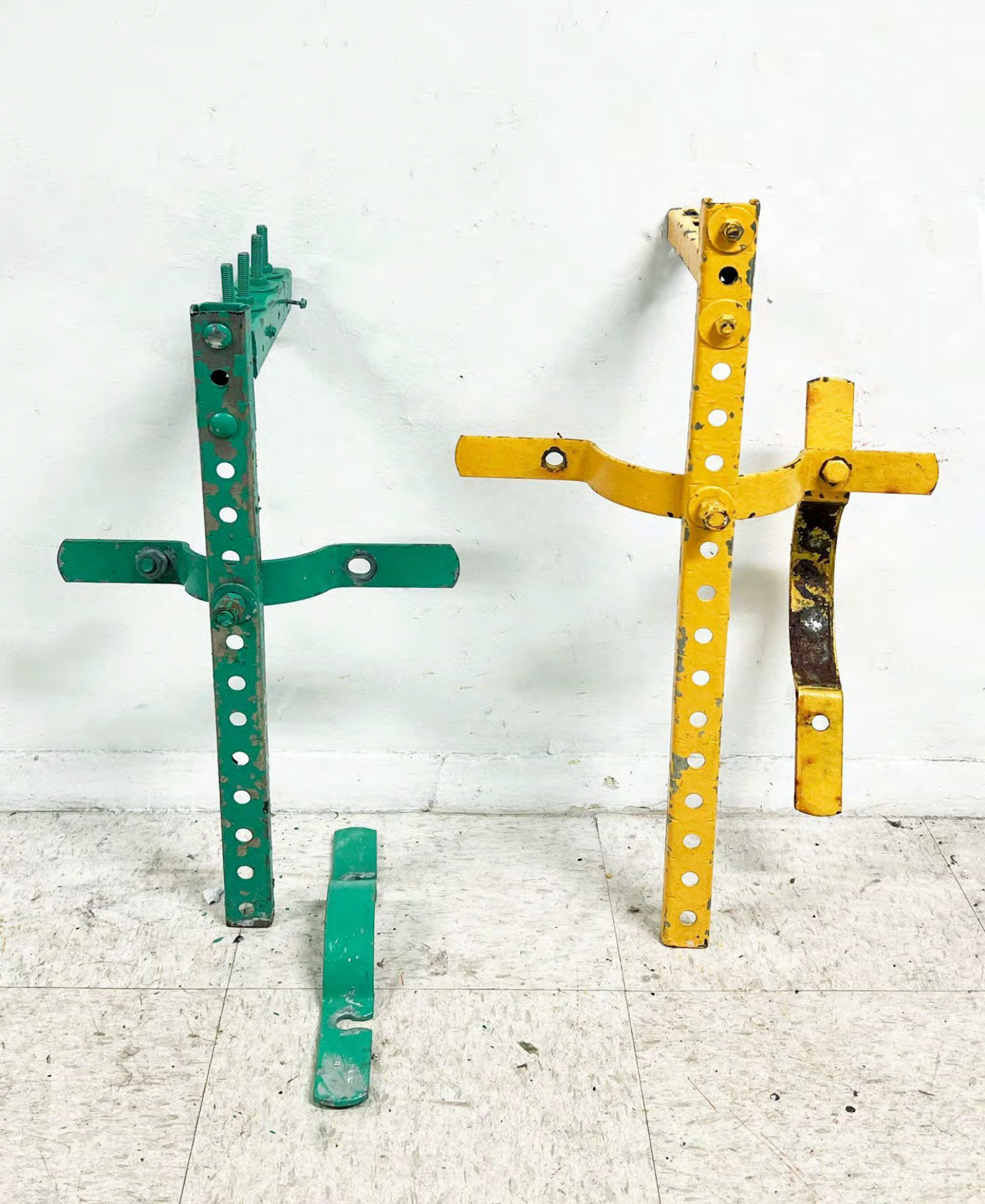
David L. Johnson Loiter (Osmin) , 2023 66 × 66 × 22.2 cm | 26 × 26 × 8 3/4 in USD 7,000.00 + VAT / transport