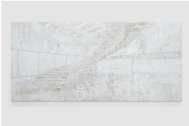
52328 Daniel Senise Untitled (MAM Rio) 2022 wall monotype in fabric and acrylic medium on aluminum plate 150,5 x 325 x 5,5 cm