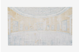
49486 Daniel Senise Untitled (Museo Nacional del Prado) 2020 wall monotype in fabric and acrylic medium on aluminum plate 150 x 250 x 5,5 cm