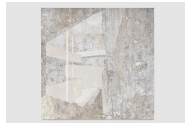
52747 Daniel Senise Untitled (MoAE - Álvaro Siza) 2023 wall monotype in fabric and acrylic medium on aluminum plate 140 x 143 cm