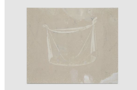
51030 Daniel Senise Verônica (Blanchard Jacques) 2022 wall monotype in fabric and acrylic medium on aluminum plate 149 x 178,8 x 5,3 cm