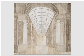
52656 Daniel Senise Untitled (Louvre) 2023 wall monotype in fabric and acrylic medium on polystyrene board 199 x 219,5 x 5,5 cm