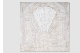
52654 Daniel Senise Untitled (Louvre) 2023 wall monotype in fabric and acrylic medium on polystyrene board 199 x 199 x 5,5 cm