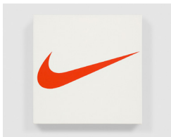
Mathew Cerletty Nike , 2021 Oil on canvas 11 x 11 in (27.9 x 27.9 cm)