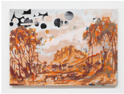
Andrea Fourchy Harvest Moon 2 , 2023 Oil, mylar, and mixed media collage on linen 32 x 45 in (81.3 x 114.3 cm)

Exhibition continues at Derosia, 197 Grand St. 2W.