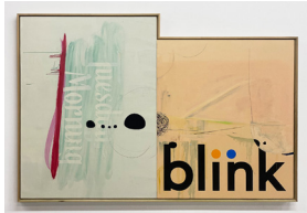
Andy Meerow Blank , 2023 Oil and acrylic on canvas 48 x 72 in (121.9 x 182.9 cm)