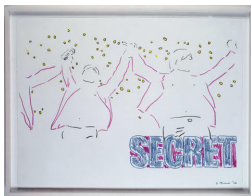
Sarah Morris Secret , 1996 Color pencil on vellum 22 x 30 in (55.9 x 76.2 cm)