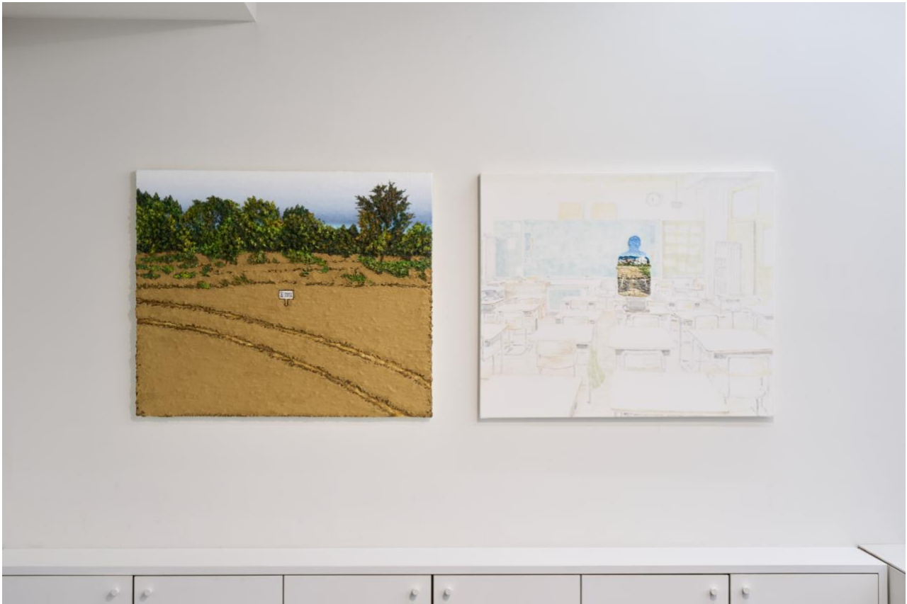
Installation view of “Prayers in the Wind and Soil” at PARCEL, by Osamu Sakamoto