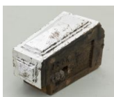
Michelle Grabner Untitled, 2023 masonry artifacts from Pabst Carriage house, silver leaf, oil based sizing 18h x 8.20w x 10d in 45.72h x 20.83w x 25.40d cm MG-23-28