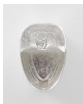
Michelle Grabner Untitled, 2023 steel and silver leaf 6h x 4w x 5d in 15.24h x 10.16w x 12.70d cm MG-23-34