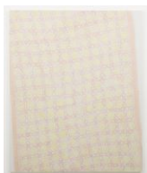
Michelle Grabner Untitled, 2023 oil and enamel on canvas over panel 72h x 59w in 182.88h x 149.86w cm MG-23-03