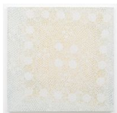
Michelle Grabner Untitled, 2023 oil and enamel on canvas over panel 24h x 24w in 60.96h x 60.96w cm MG-23-15