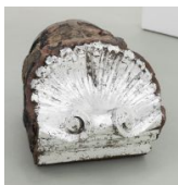
Michelle Grabner Untitled, 2023 masonry artifacts from Pabst Carriage house, silver leaf, oil based sizing 22h x 17w x 14d in 55.88h x 43.18w x 35.56d cm MG-23-25