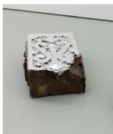
Michelle Grabner Untitled, 2023 masonry artifacts from Pabst Carriage house, silver leaf, oil based sizing 7h x 22w x 12d in 17.78h x 55.88w x 30.48d cm MG-23-30