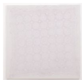
Michelle Grabner Untitled, 2023 oil and enamel on canvas over panel 47h x 47w in 119.38h x 119.38w cm MG-23-06