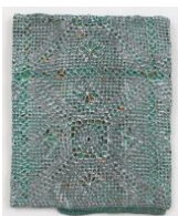
Michelle Grabner Untitled, 2023 oil on patinated bronze 11h x 9w in 27.94h x 22.86w cm MG-23-22