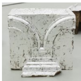
Michelle Grabner Untitled, 2023 masonry artifacts from Pabst Carriage house, silver leaf, oil based sizing 13h x 15w x 12d in 33.02h x 38.10w x 30.48d cm MG-23-29