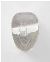
Michelle Grabner Untitled, 2023 steel and silver leaf 6h x 4w x 5d in 15.24h x 10.16w x 12.70d cm MG-23-36