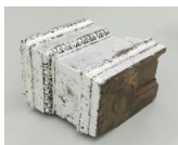
Michelle Grabner Untitled, 2023 masonry artifacts from Pabst Carriage house, silver leaf, oil based sizing 11h x 18w x 8d in 27.94h x 45.72w x 20.32d cm MG-23-27