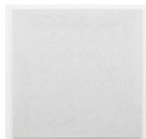
Michelle Grabner Untitled, 2023 oil and enamel on canvas over panel 47h x 47w in 119.38h x 119.38w cm MG-23-05