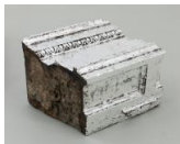
Michelle Grabner Untitled, 2023 masonry artifacts from Pabst Carriage house, silver leaf, oil based sizing 11h x 17w x 11d in 27.94h x 43.18w x 27.94d cm MG-23-31