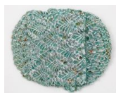
Michelle Grabner Untitled, 2023 oil on patinated bronze 12h x 9w in 30.48h x 22.86w cm MG-23-21