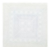
Michelle Grabner Untitled, 2023 oil and enamel on canvas over panel 24h x 24w in 60.96h x 60.96w cm MG-23-13