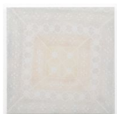
Michelle Grabner Untitled, 2023 oil and enamel on canvas over panel 24h x 24w in 60.96h x 60.96w cm MG-23-14