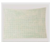
Michelle Grabner Untitled, 2023 oil and enamel on canvas over panel 72h x 59w in 182.88h x 149.86w cm MG-23-04