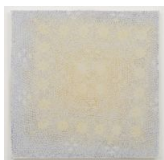
Michelle Grabner Untitled, 2023 oil, enamel and gouache on canvas over panel 24h x 24w in 60.96h x 60.96w cm MG-23-12