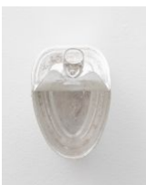
Michelle Grabner Untitled, 2023 steel and silver leaf 6h x 4w x 5d in 15.24h x 10.16w x 12.70d cm MG-23-38