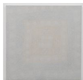
Michelle Grabner Untitled, 2023 oil and enamel on canvas over panel 30h x 30w in 76.20h x 76.20w cm MG-23-07