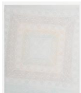
Michelle Grabner Untitled, 2023 oil and enamel on canvas over panel 26h x 32w in 66.04h x 81.28w cm MG-23-17