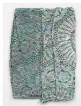
Michelle Grabner Untitled, 2023 oil on patinated bronze 20h x 13.50w in 50.80h x 34.29w cm MG-23-19