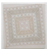
Michelle Grabner Untitled, 2023 oil and enamel on canvas over panel 32h x 30w in 81.28h x 76.20w cm MG-23-35