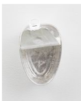
Michelle Grabner Untitled, 2023 steel and silver leaf 6h x 4w x 5d in 15.24h x 10.16w x 12.70d cm MG-23-37