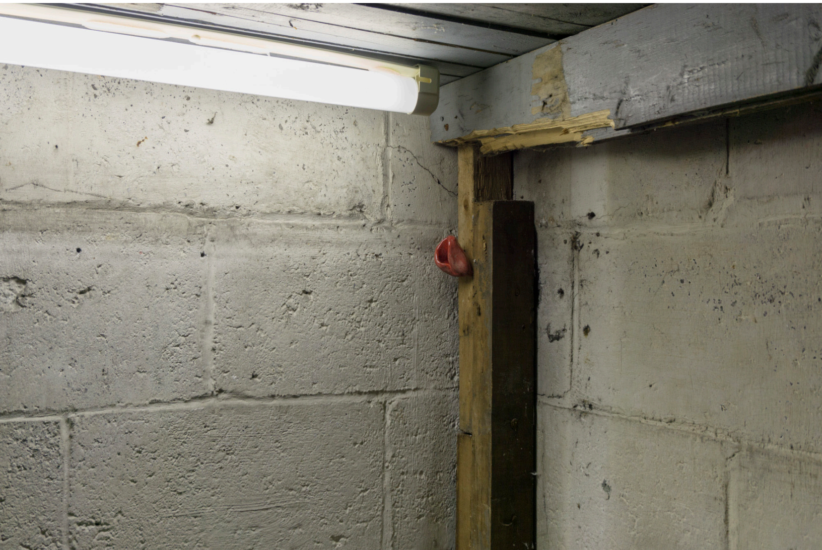
Ai Ikeda, Radiated Organ , 2018, glazed earthenware, 2½ x 1 x 1 inches.