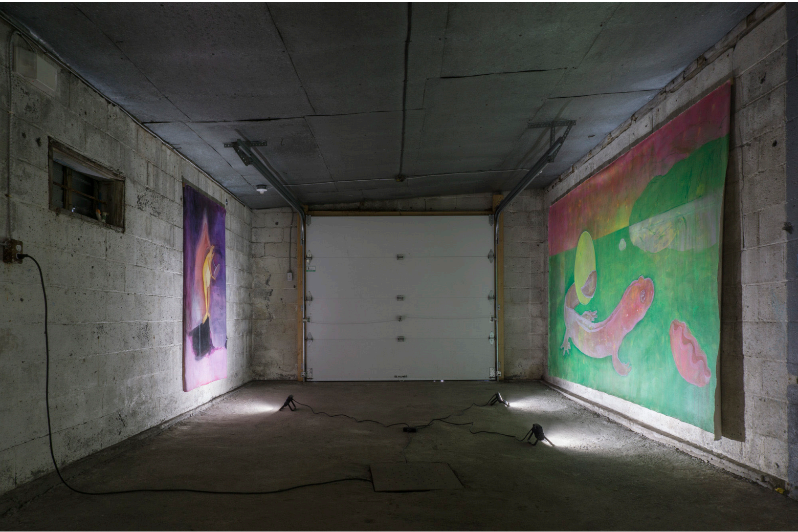
Ai Ikeda, Les temps mutants , 2018, Exhibition view, Calaboose, Montréal.