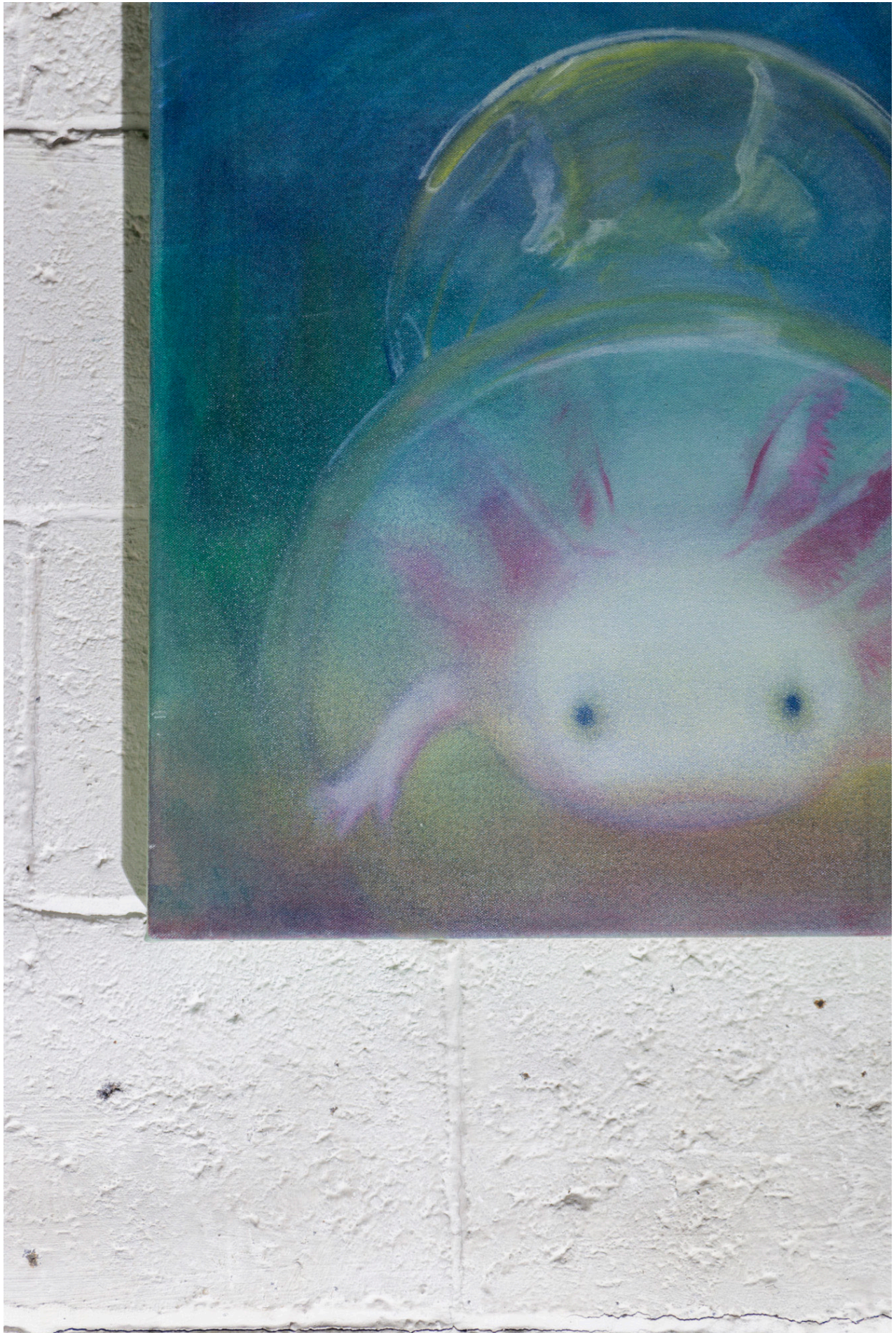
Ai Ikeda, Mutation Series #1 (detail), 2017, oil and acrylic on canvas, 20 x 24 inches.