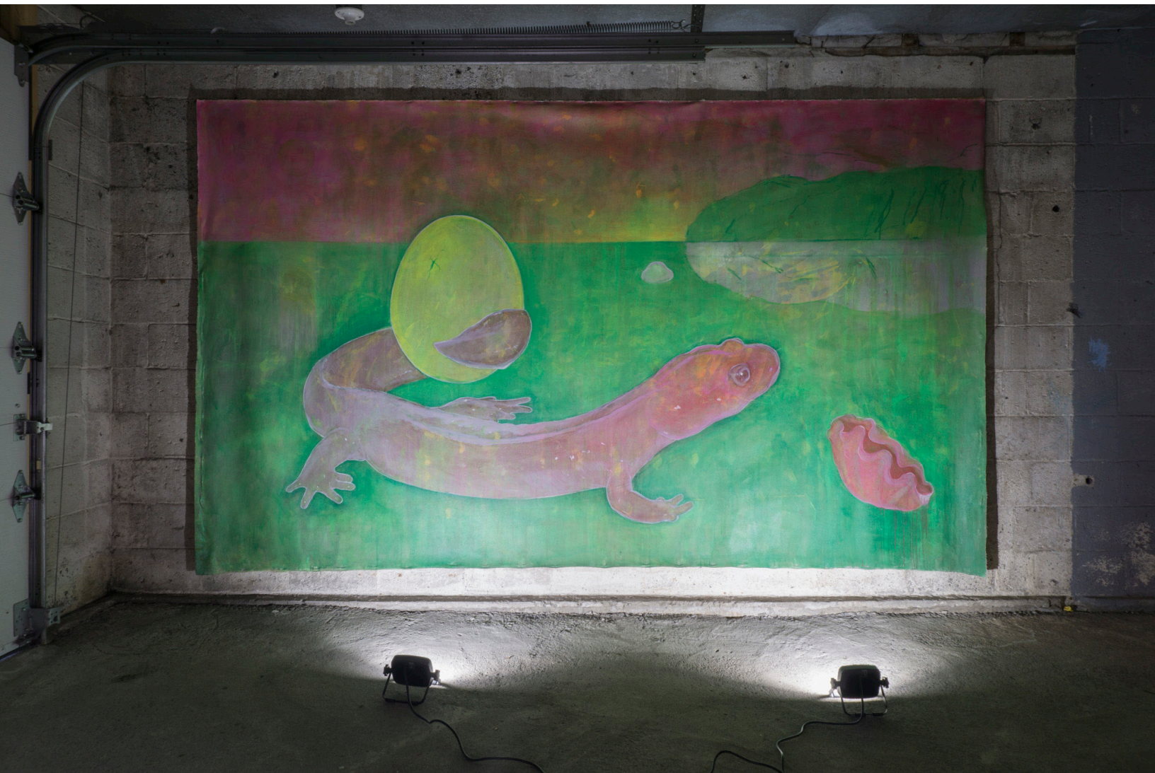
Ai Ikeda, Mutation Series #4 , 2017, acrylic on canvas, 143 x 84 inches.