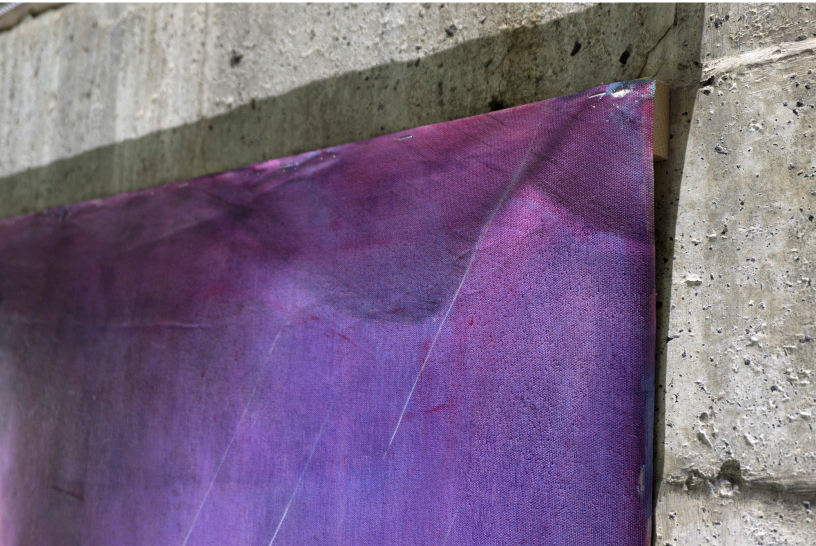
Ai Ikeda, Frolicking Frog (detail), 2017, oil on recycled canvas, 47 x 72½ inches.