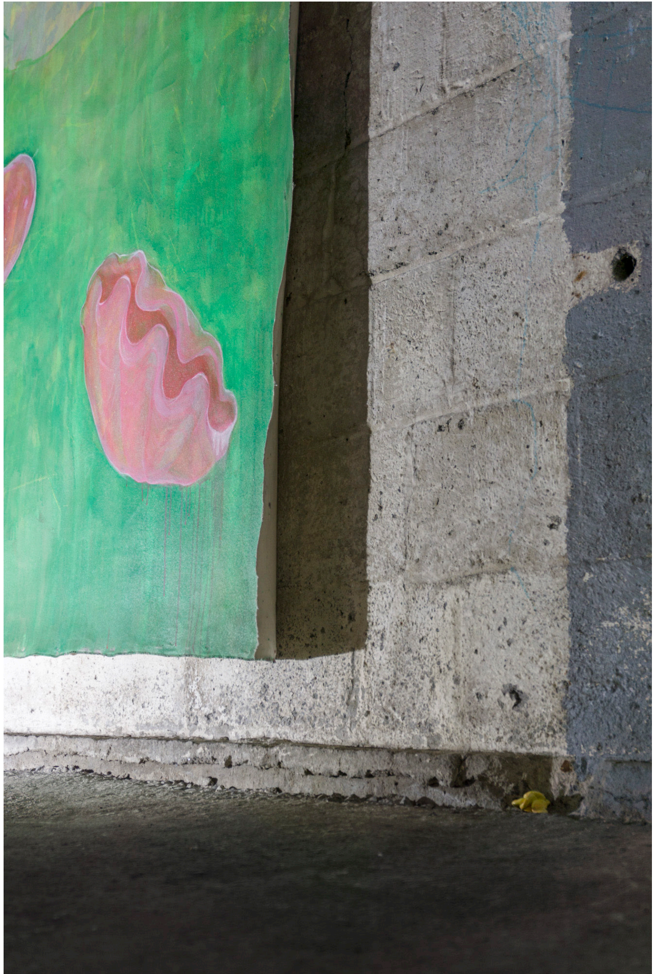
Ai Ikeda, Les temps mutants , 2018, Exhibition view, Calaboose, Montréal.