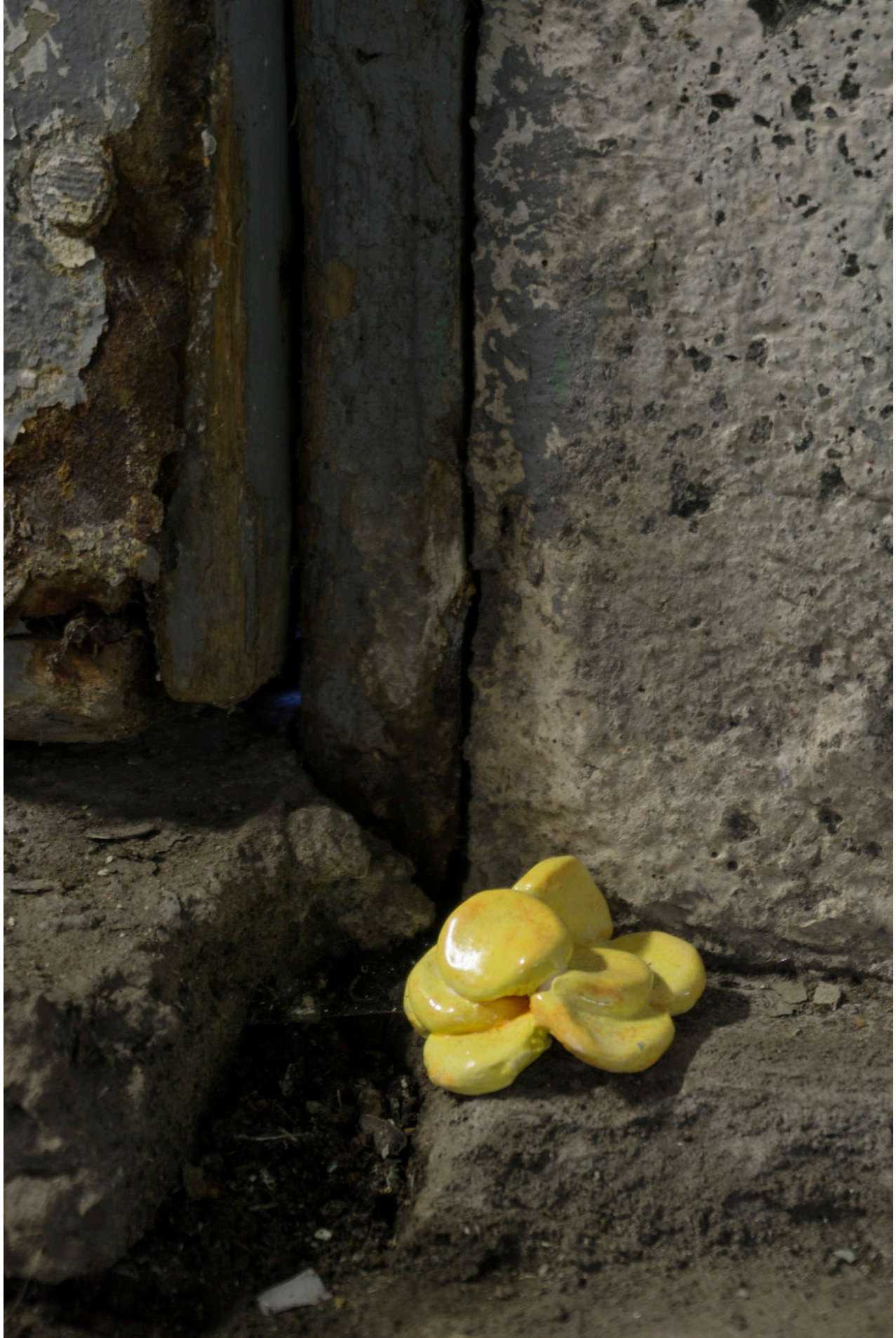
Ai Ikeda, Radiated Coins #2 , 2018, glazed earthenware, 2 x 1 x 1 inches.