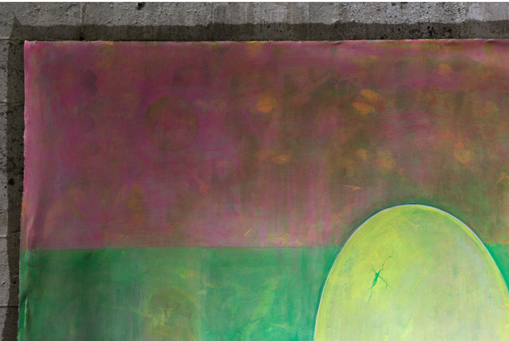
Ai Ikeda, Mutation Series #4 (detail), 2017, acrylic on canvas, 143 x 84 inches.