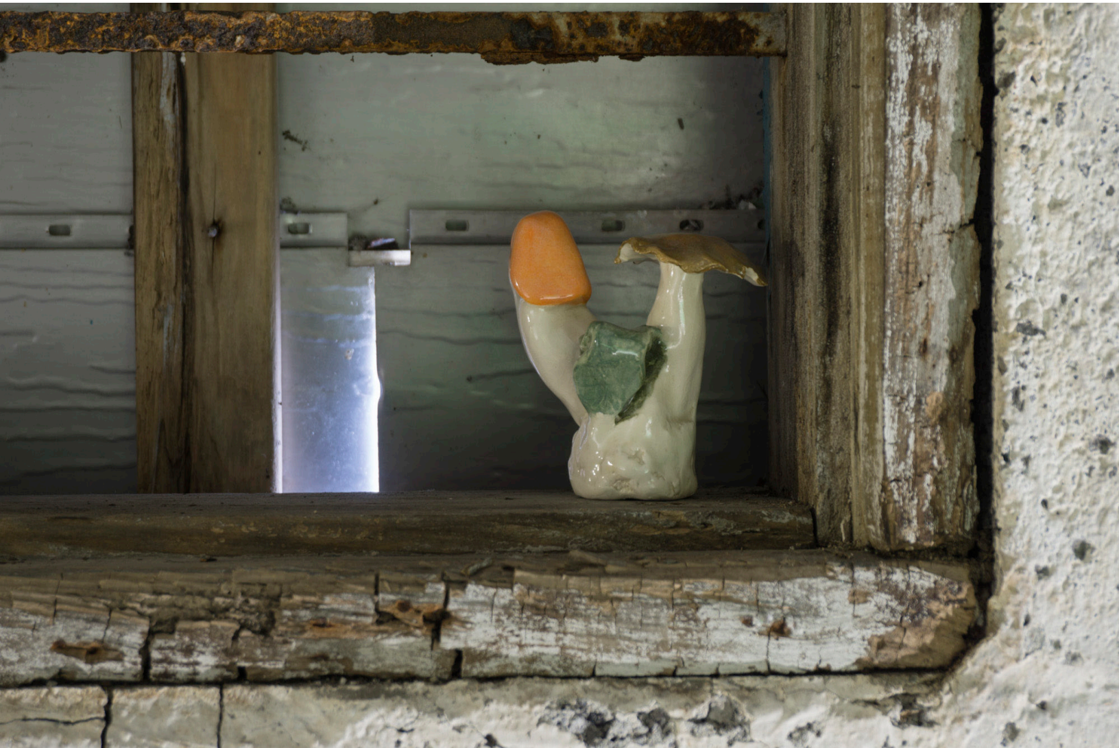
Ai Ikeda, Radiated Mushroom , 2018, glazed earthenware, 2 x 2 x 4 inches.