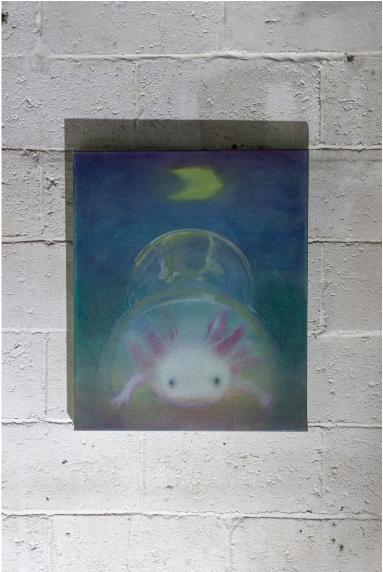
Ai Ikeda, Mutation Series #1 , 2017, oil and acrylic on canvas, 20 x 24 inches.