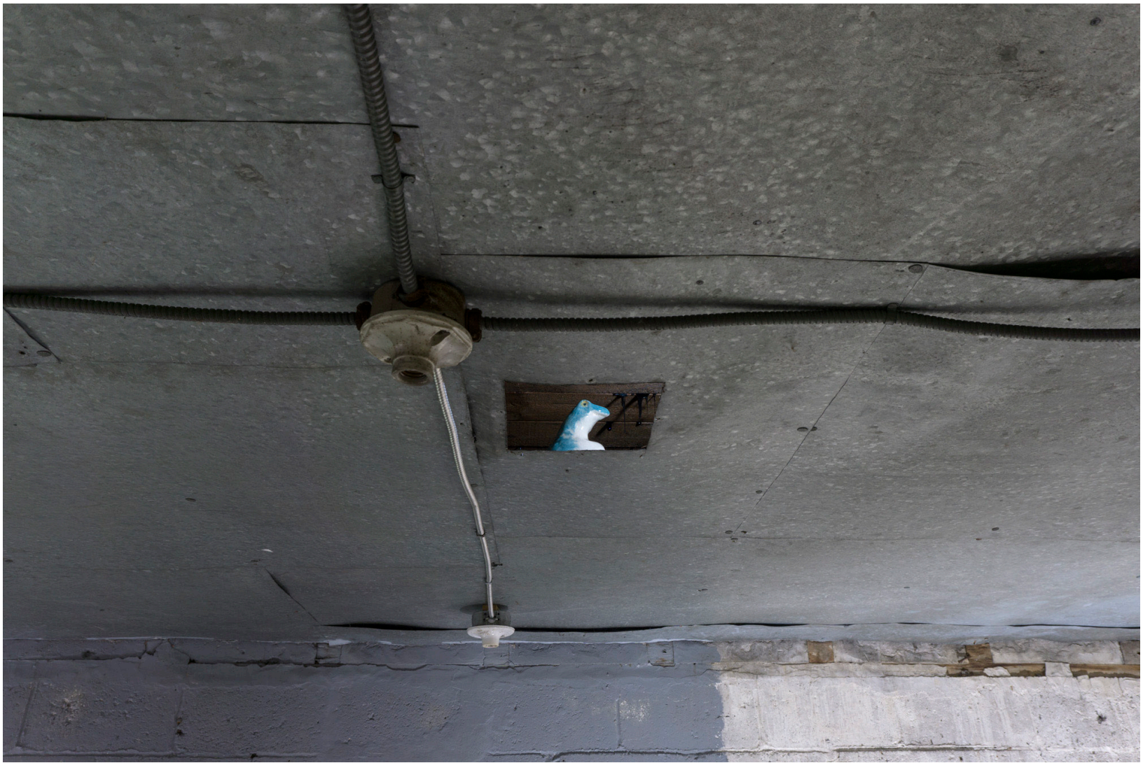
Ai Ikeda, Radiated Frog #2 , 2018, glazed earthenware, 3½ x 2 x 3½ inches.