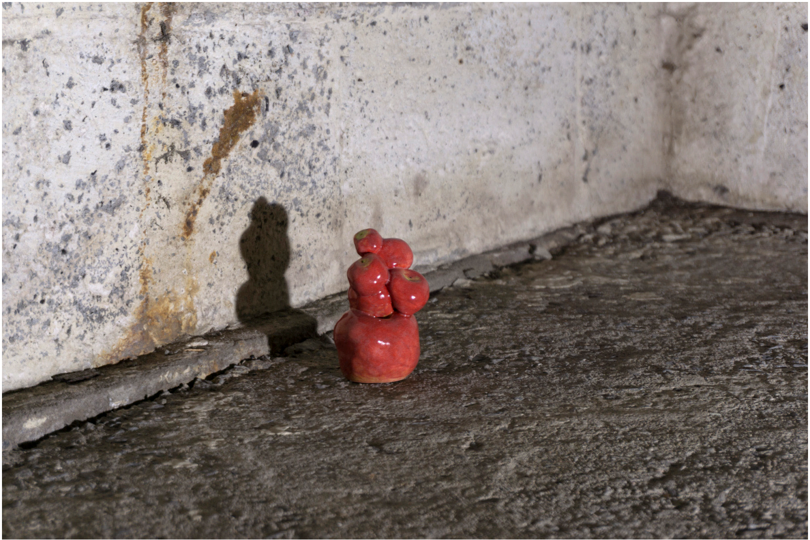
Ai Ikeda, Radiated Apple , 2018, glazed earthenware, 2 x 2 x 4½ inches.