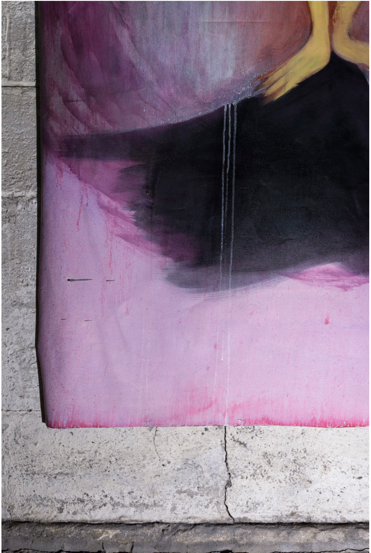
Ai Ikeda, Frolicking Frog (detail), 2017, oil on recycled canvas, 47 x 72½ inches.