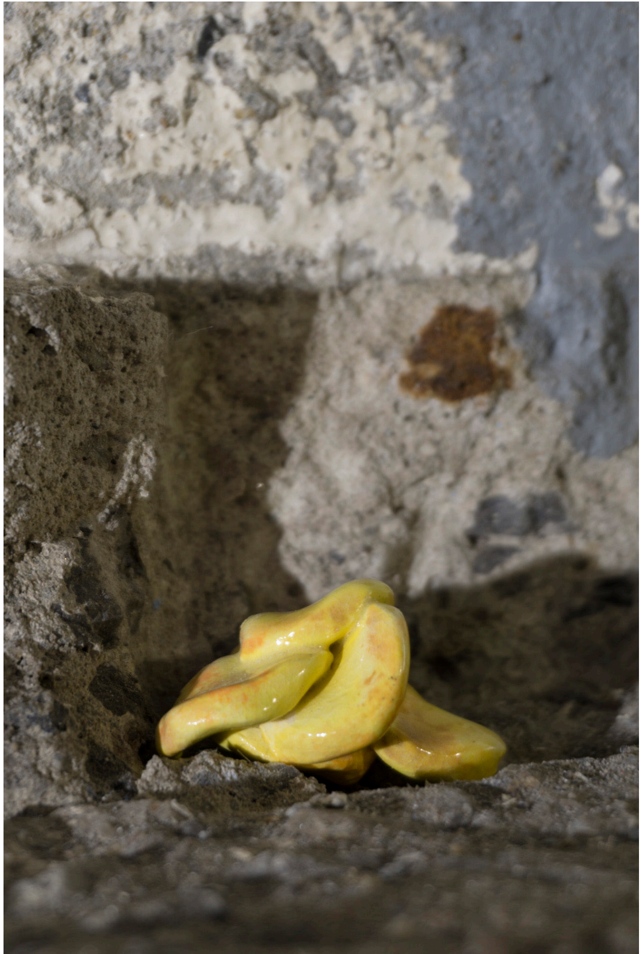
Ai Ikeda, Radiated Coins #1 , 2018, glazed earthenware, 2 x 1 x 1 inches.