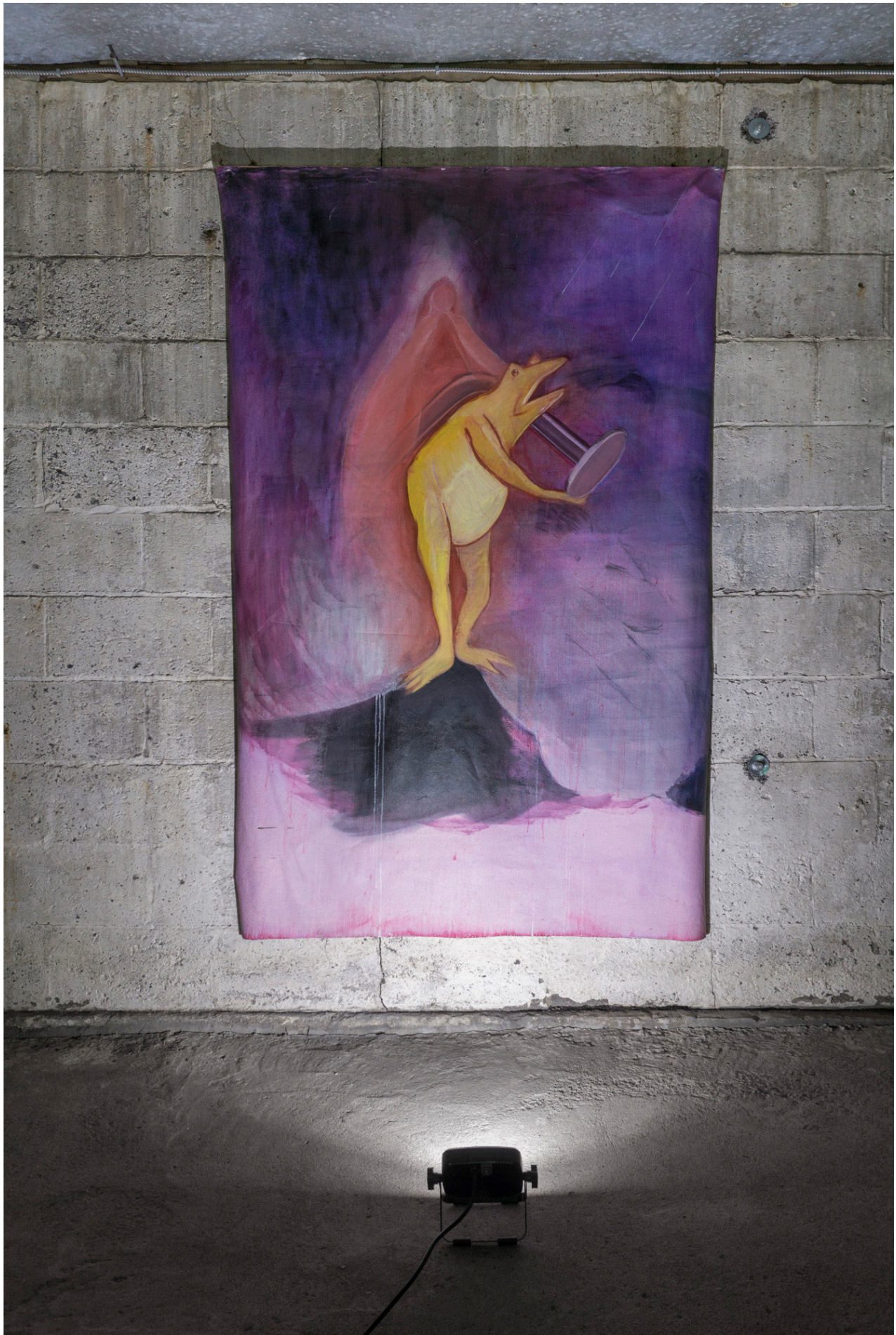
Ai Ikeda, Frolicking Frog , 2017, oil on recycled canvas, 47 x 72½ inches.