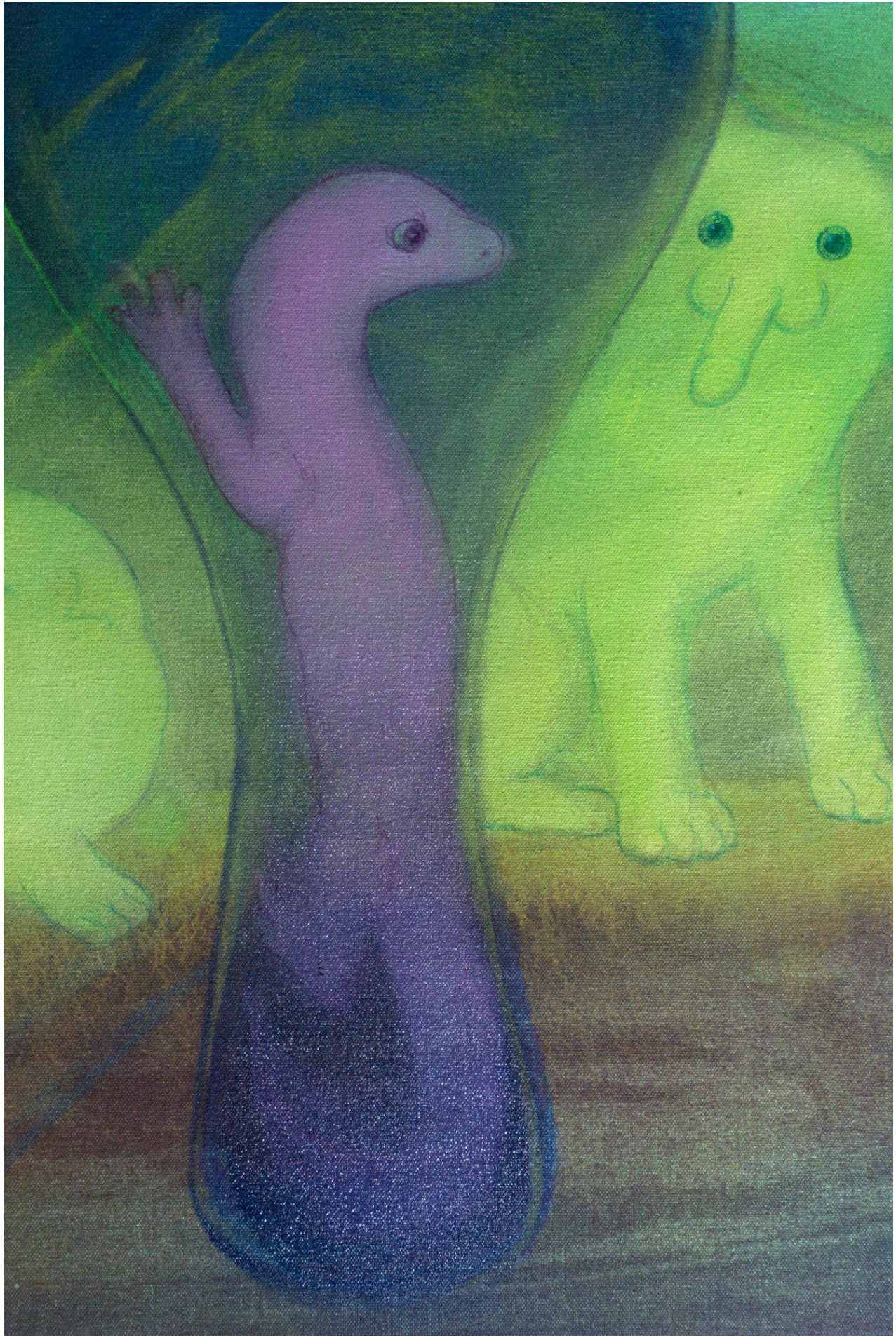
Ai Ikeda, Mutation Series #3 (detail), 2017, oil and acrylic on canvas, 20 x 24 inches.