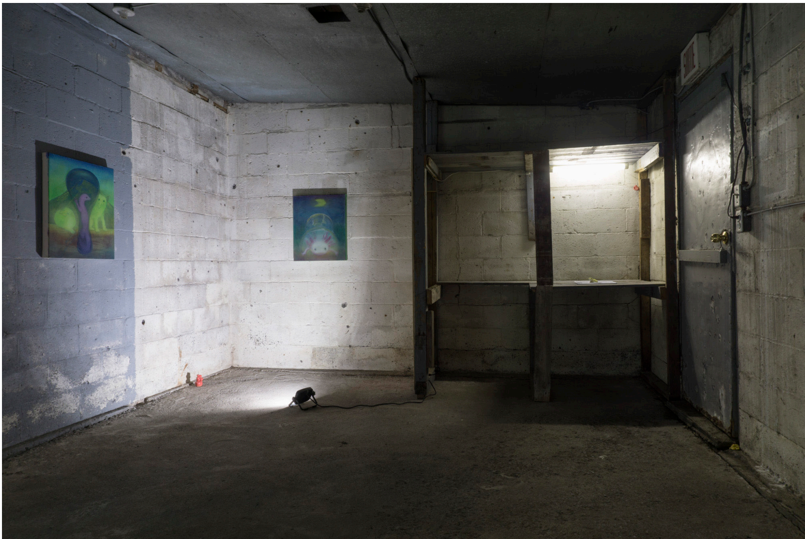
Ai Ikeda, Les temps mutants , 2018, Exhibition view, Calaboose, Montréal.