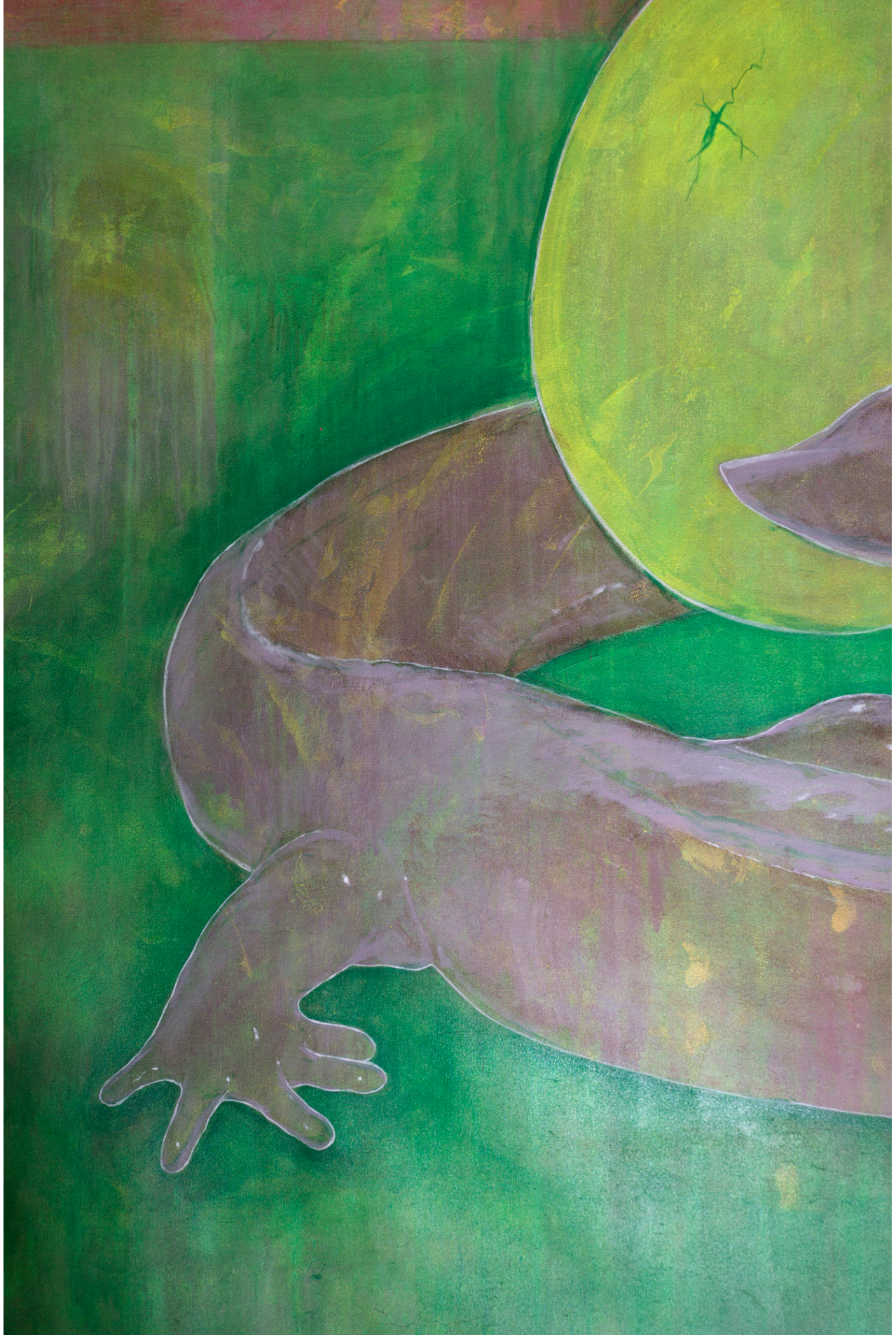
Ai Ikeda, Mutation Series #4 (detail), 2017, acrylic on canvas, 143 x 84 inches.