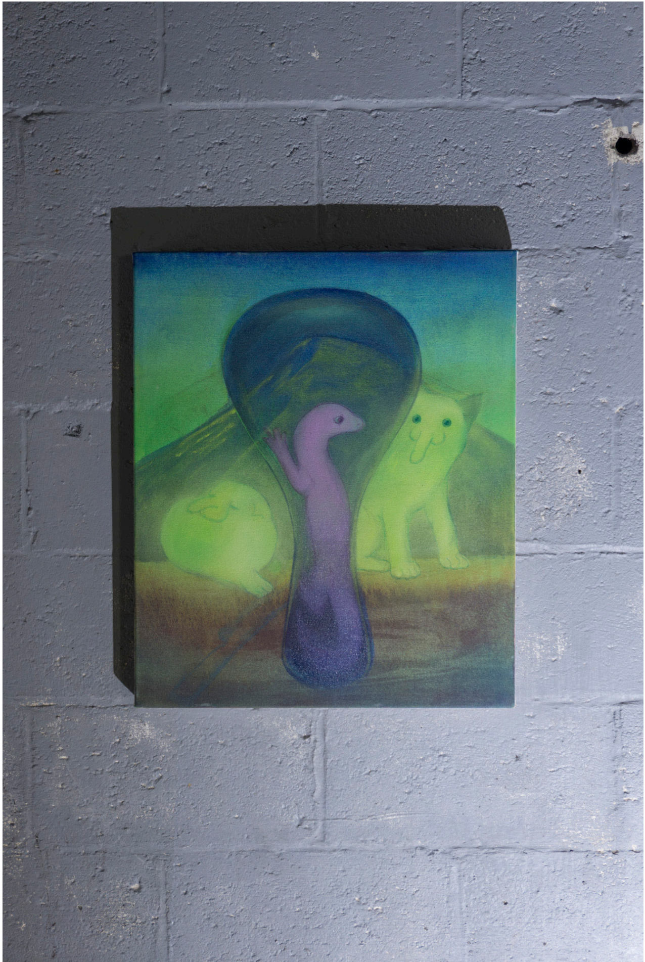
Ai Ikeda, Mutation Series #3 , 2017, oil and acrylic on canvas, 20 x 24 inches.