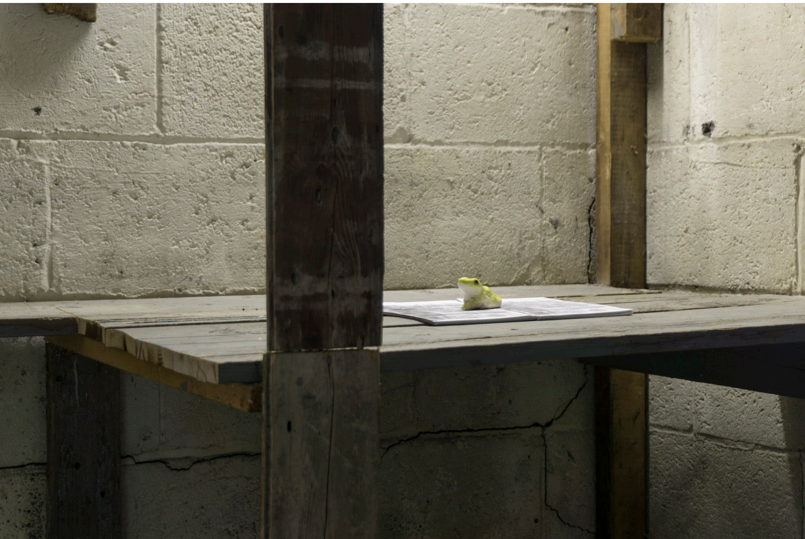
Ai Ikeda, Les temps mutants , 2018, Exhibition view, Calaboose, Montréal.