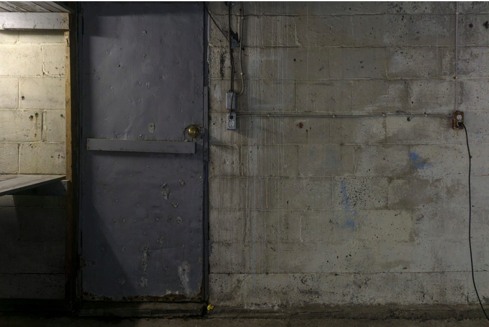
Ai Ikeda, Les temps mutants , 2018, Exhibition view, Calaboose, Montréal.