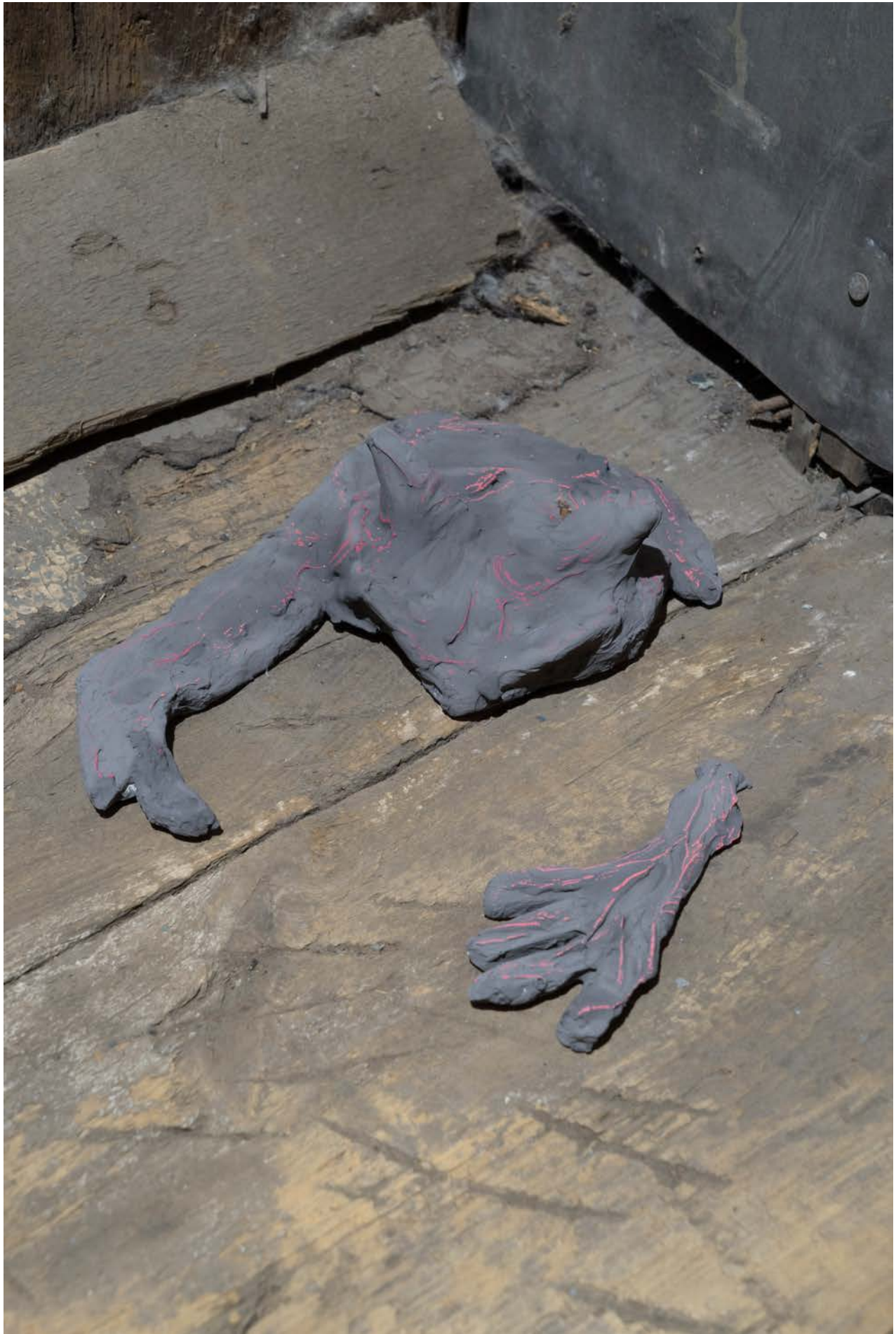
Loris Keczaj, fireclown , 2019, unfired clay, grout, pastel, 9" x 8" x 2¾".