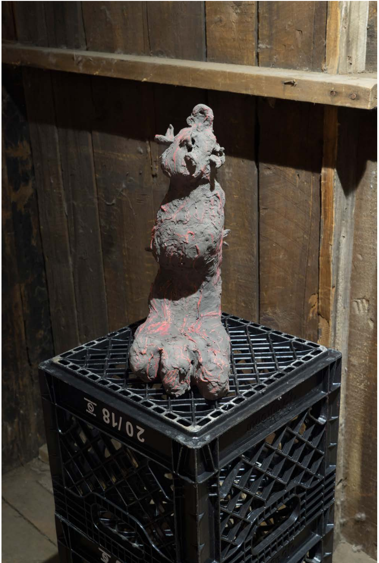
Loris Keczaj, Vessel , 2019, unfired clay, grout, pastel, 12" x 6½" x 15¾".