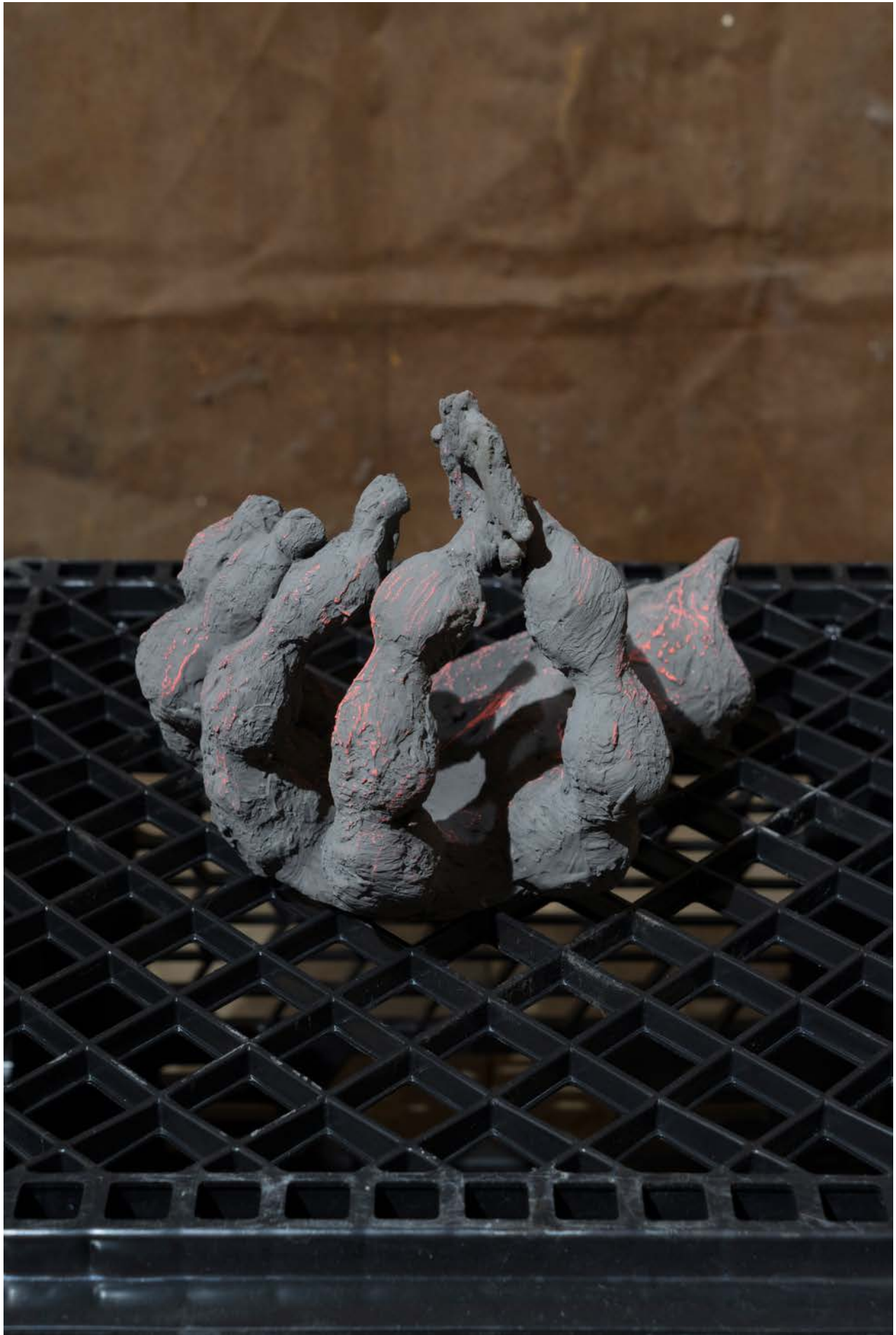
Loris Keczaj, The Dealer , 2019, unfired clay, grout, pastel, 6" x 6" x 5½".