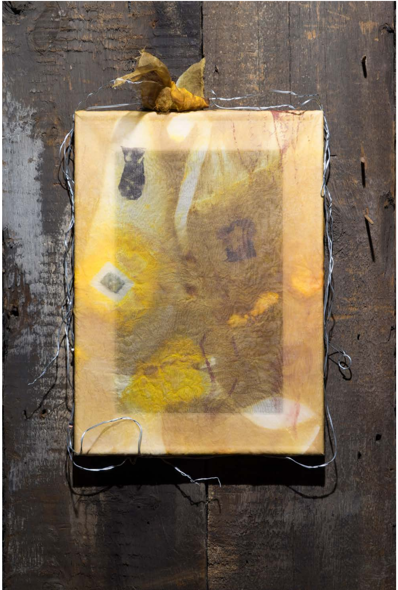
Clara Talajic, One (untitled) , 2019, onion, turmeric and coffee dyed silk, etching ink, wire, beads, 10" x 14".