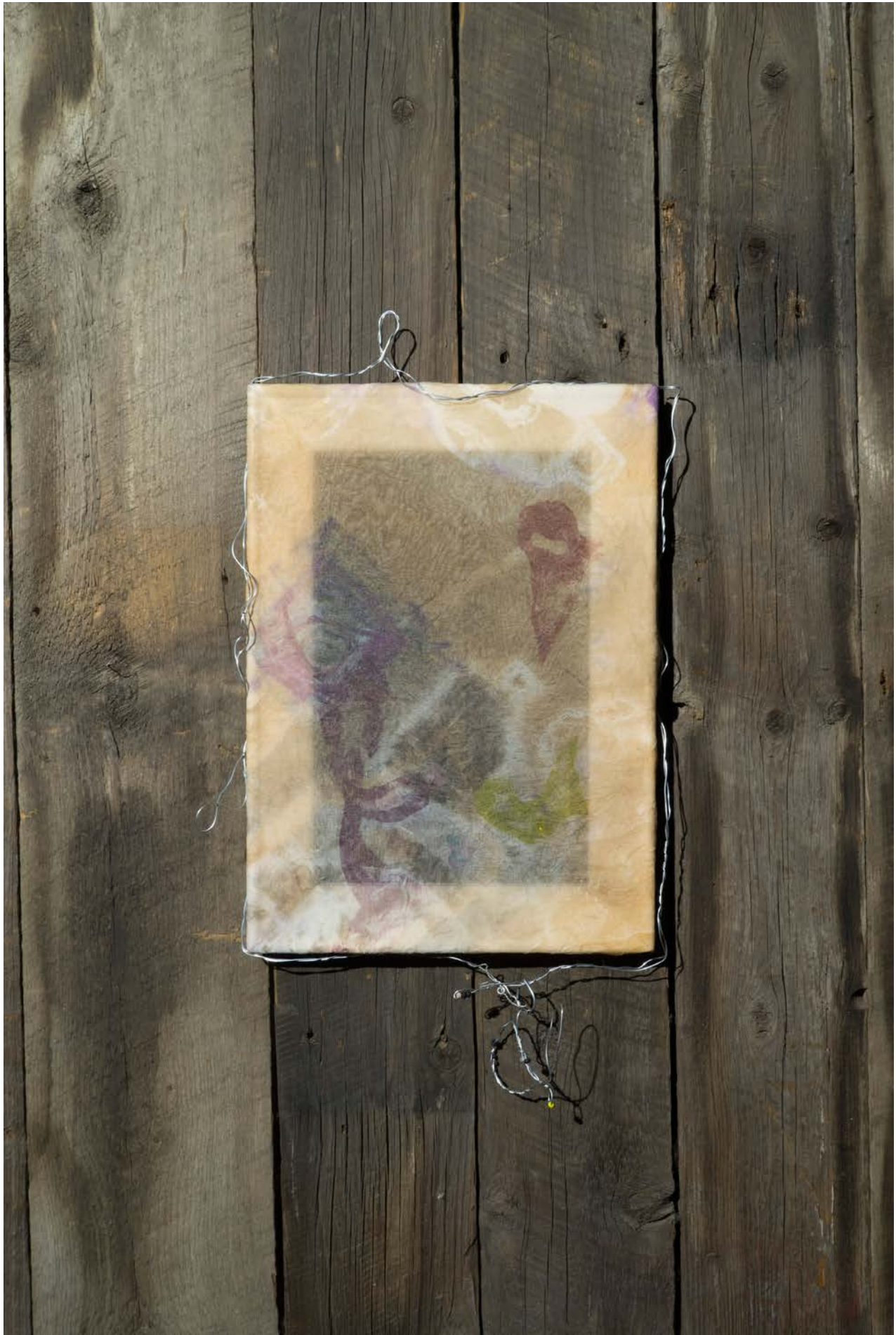
Clara Talajic, Two (untitled), 2019, cabbage, spinach and black bean dyed silk, etching ink, wire, beads, 10" x 14".