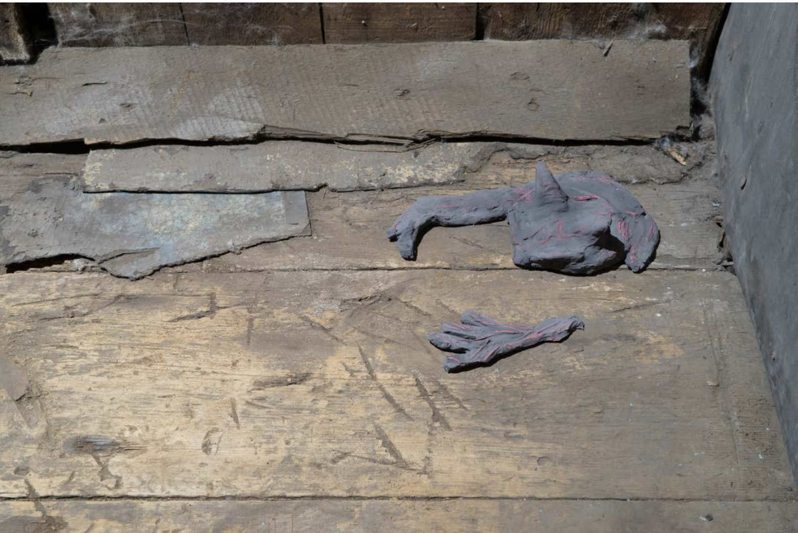
Loris Keczaj, fireclown , 2019, unfired clay, grout, pastel, 9" x 8" x 2 \frac{3}{4} ".