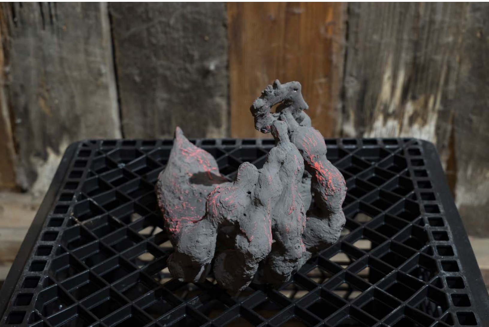
Loris Keczaj, The Dealer , 2019, unfired clay, grout, pastel, 6" x 6" x 5½".