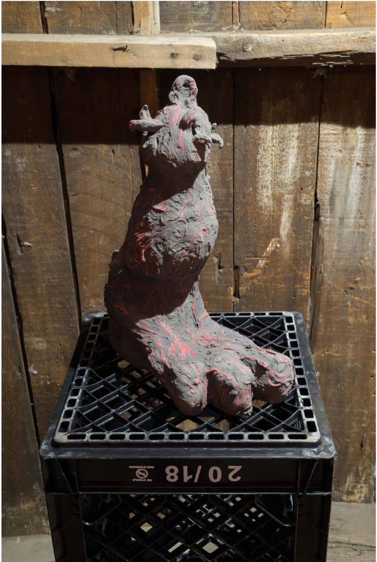
Loris Kecaj, Vessel , 2019, unfired clay, grout, pastel, 12" x 6½" x 15¾".