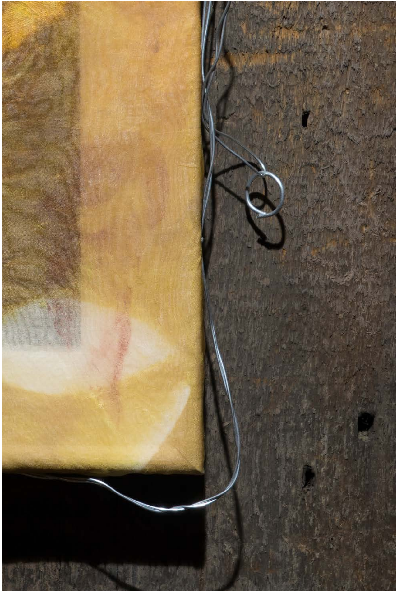
Clara Talajic, One (untitled, detail), 2019, onion, turmeric and coffee dyed silk, etching ink, wire, beads, 10" x 14".