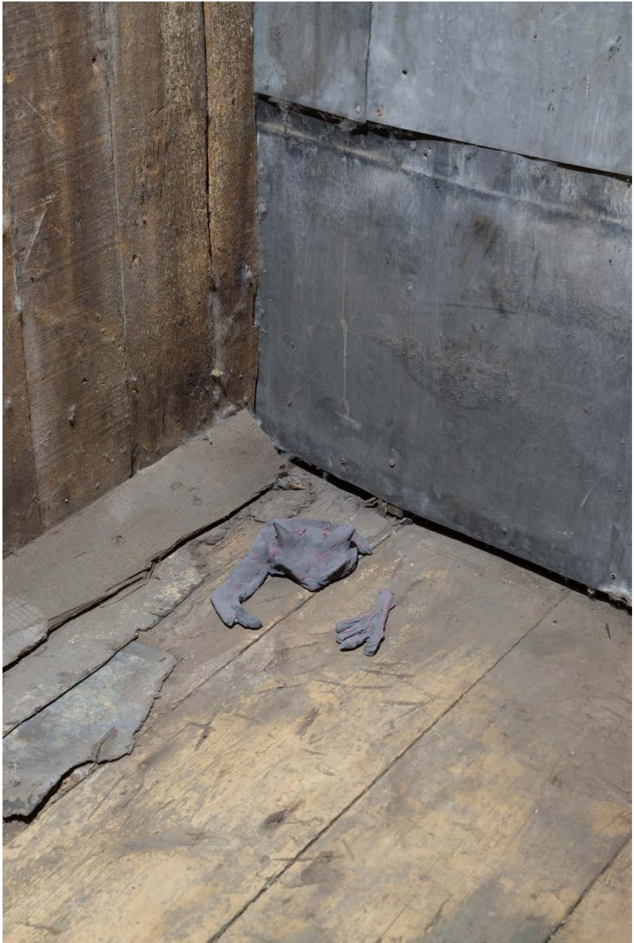
Loris Keczaj, fireclown , 2019, unfired clay, grout, pastel, 9" x 8" x 2¾".