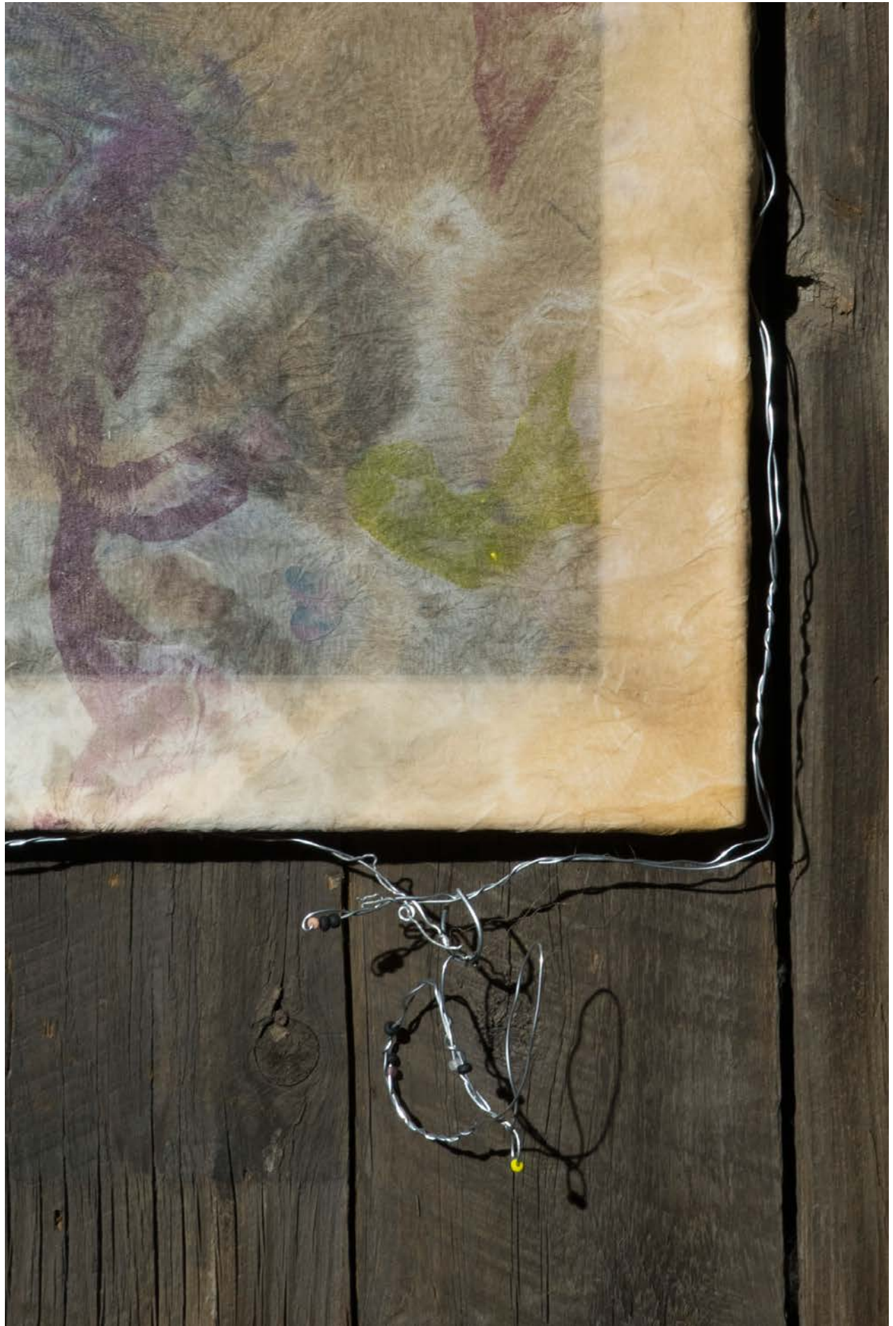
Clara Talajic, Two (untitled), 2019, cabbage, spinach and black bean dyed silk, etching ink, wire, beads, 10" x 14".