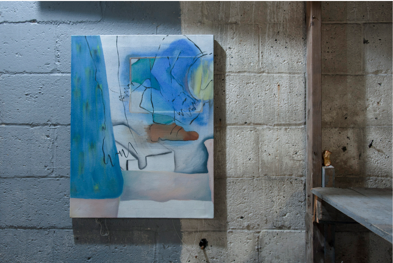
Misplaced Keys (formymother), 2017, oil on jute, 72cm x 56cm.