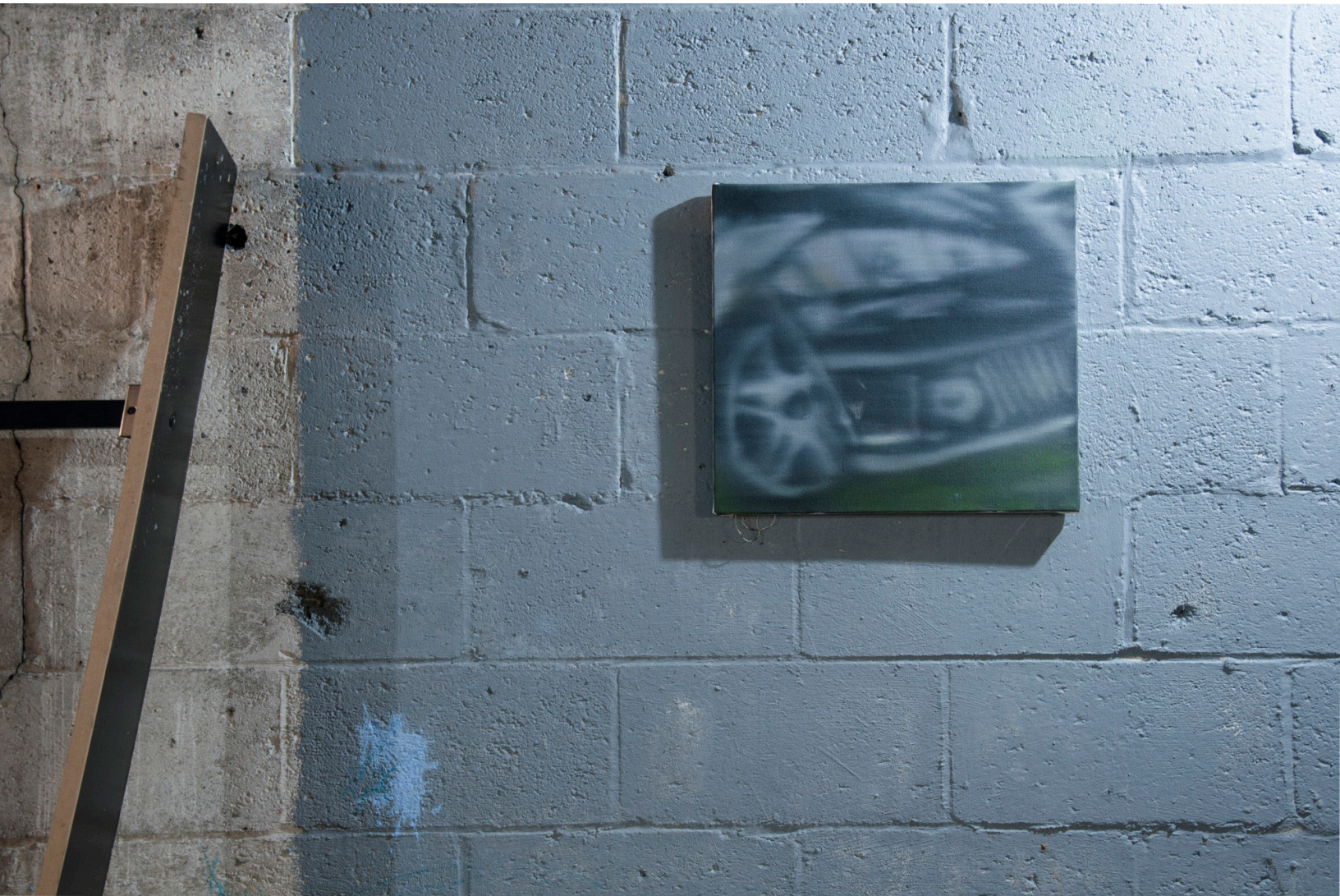
45 degrees, 2017, oil on canvas, 30cm x 30cm.