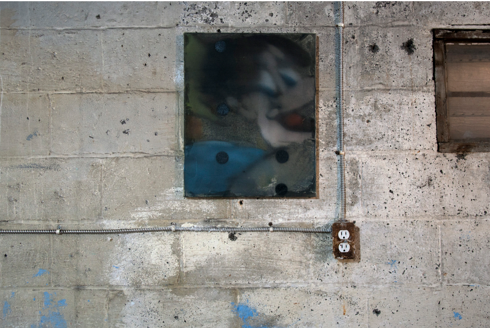
L'Entier Naturel Après Quatre , 2017, oil on jute, 60cm x 40cm.