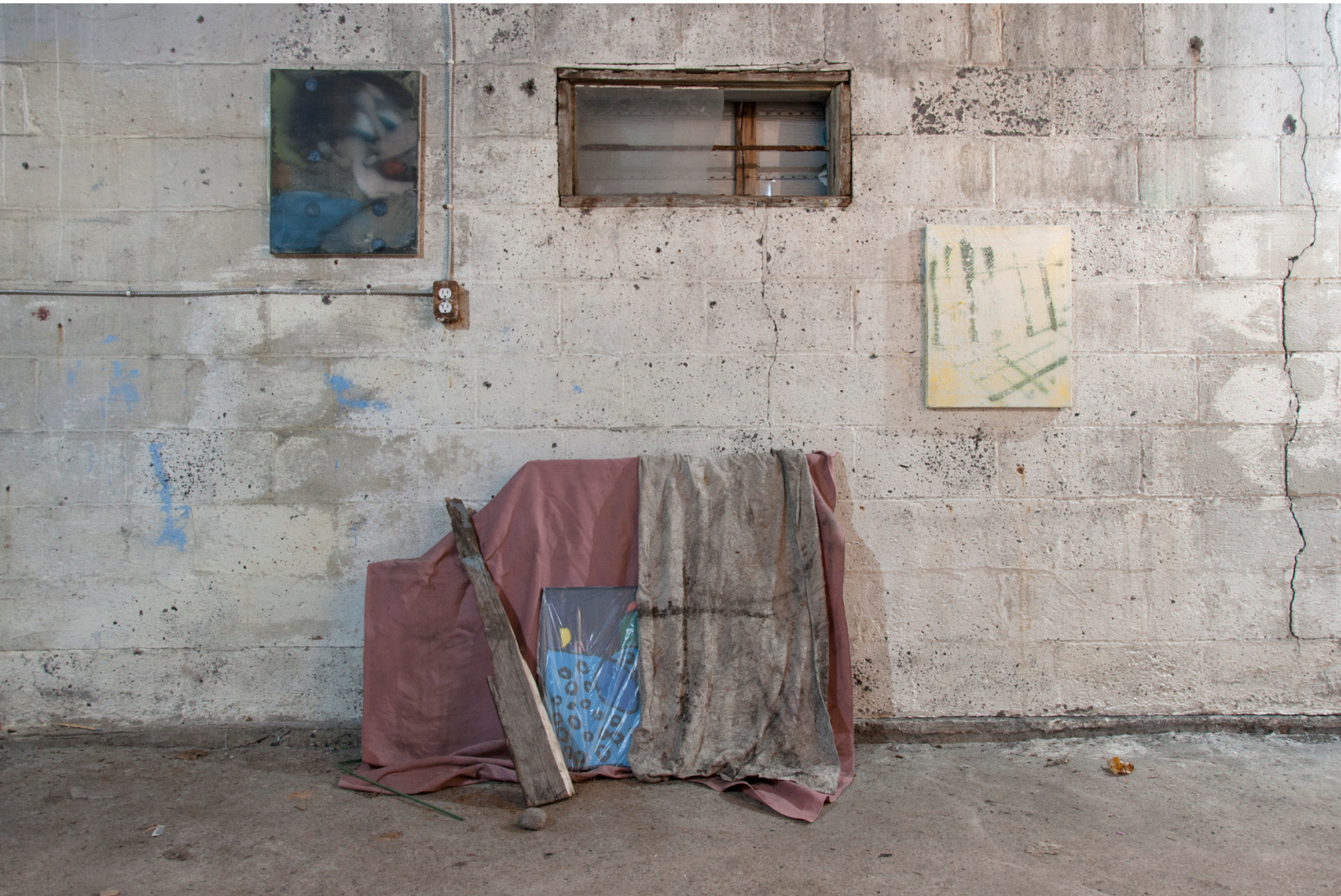
Vincent Larouche, Back-Talk , 2017, Exhibition view, Calaboose, Montréal.