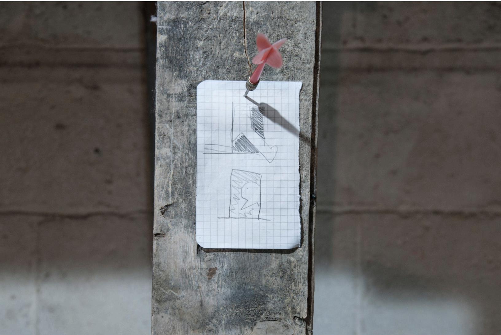
Vincent Larouche, Back-Talk , 2017, Exhibition view, Calaboose, Montréal.