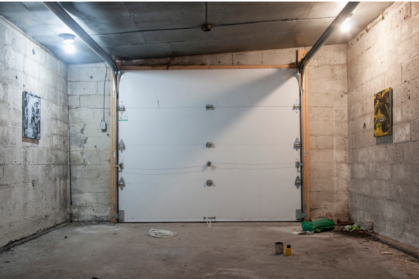
Vincent Larouche, Back-Talk , 2017, Exhibition view, Calaboose, Montréal.