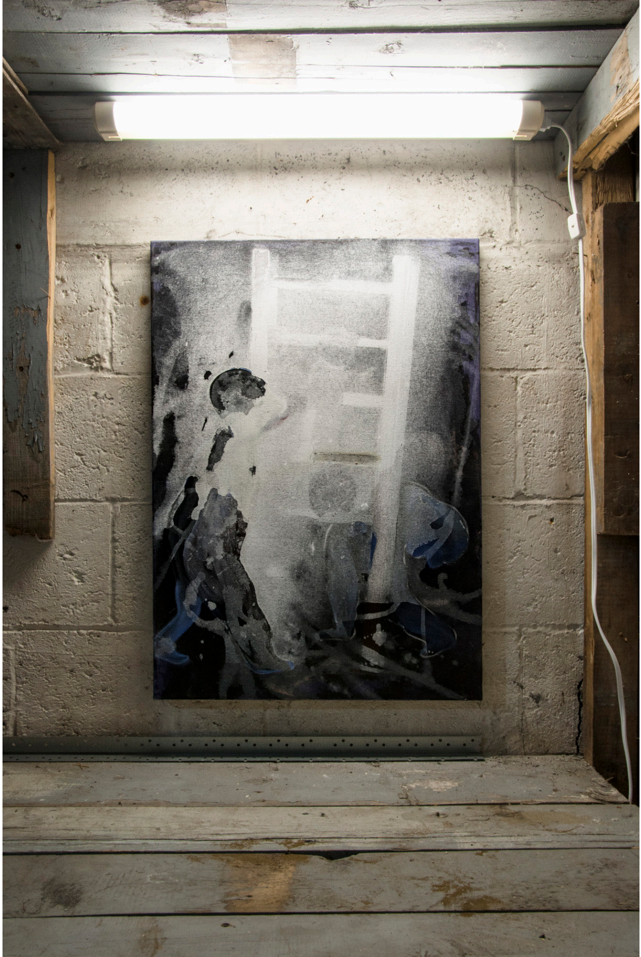
Got My Feets In The Bucket ( Upbeat In The Back ), 2017, oil and acrylic on canvas, 71cm x 51cm.