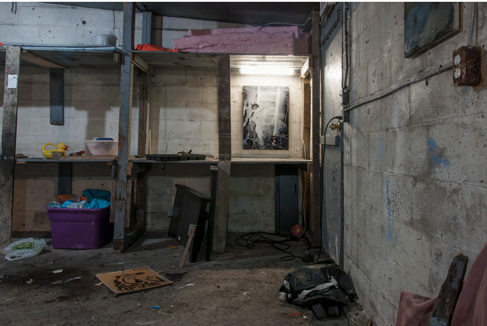
Vincent Larouche, Back-Talk , 2017, Exhibition view, Calaboose, Montréal.