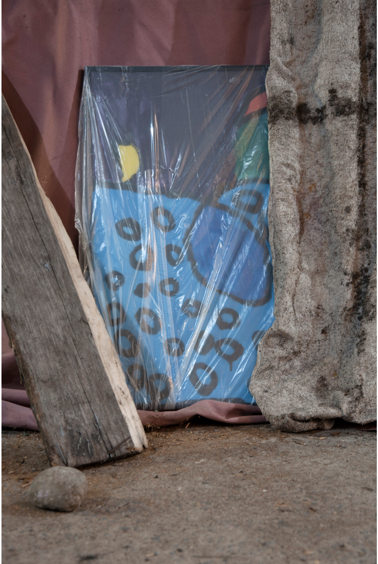
Dragon at Sea , 1999, detail, gouache on paper, 50cm x 70cm.