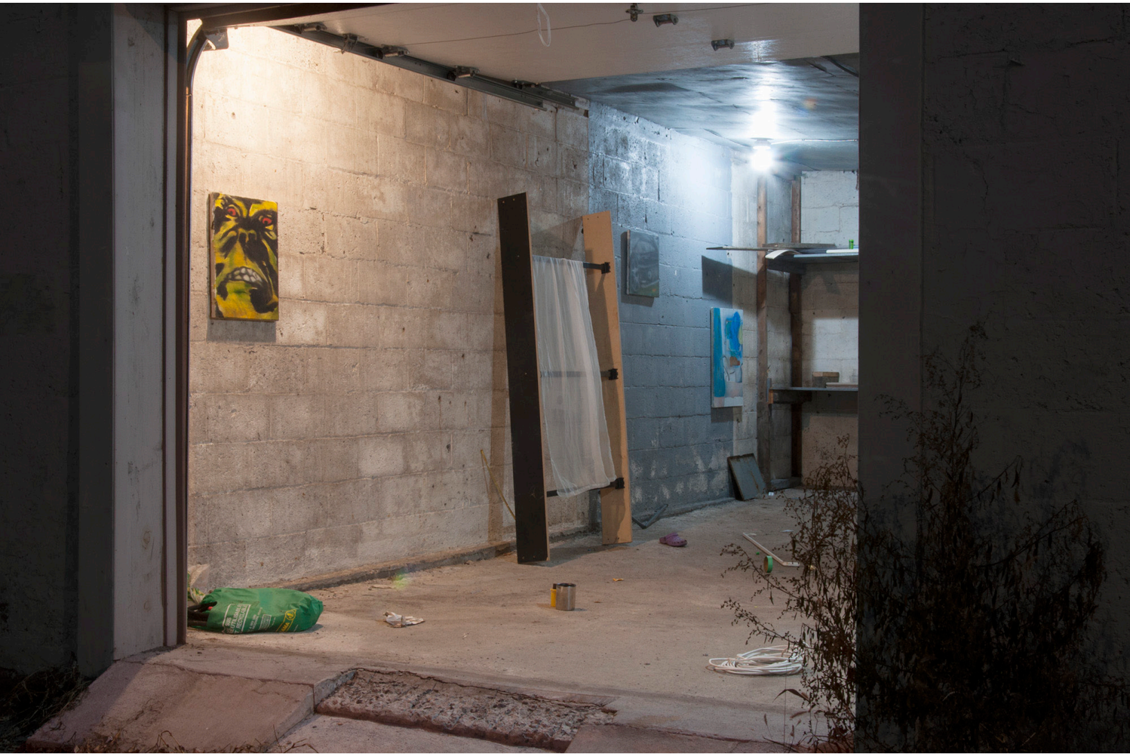
Vincent Larouche, Back-Talk , 2017, Exhibition view, Calaboose, Montréal.