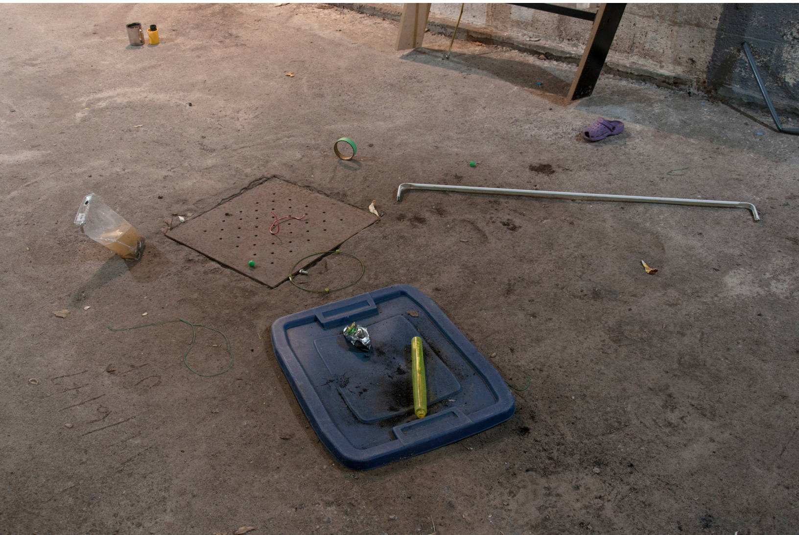
Vincent Larouche, Back-Talk , 2017, Exhibition view, Calaboose, Montréal.