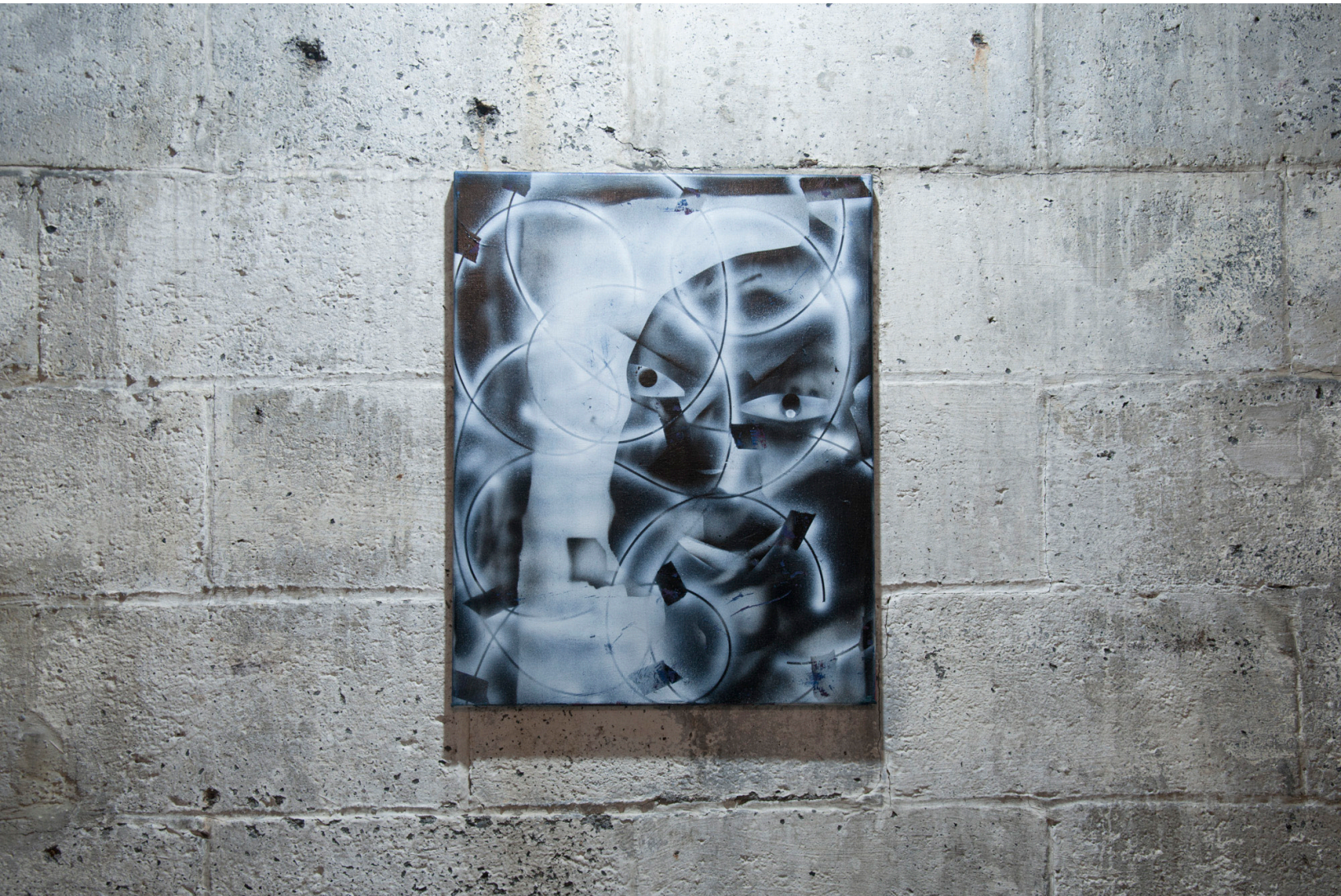
Saïa Saïa. Les Vendeurs d'Alouettes Sautent Par Dessus Des Étangs Bien Trop Profonds , 2017, oil and acylic on canvas, 60cm x 40cm.