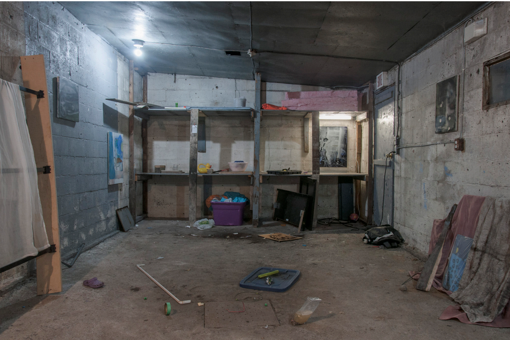
Vincent Larouche, Back-Talk , 2017, Exhibition view, Calaboose, Montréal.