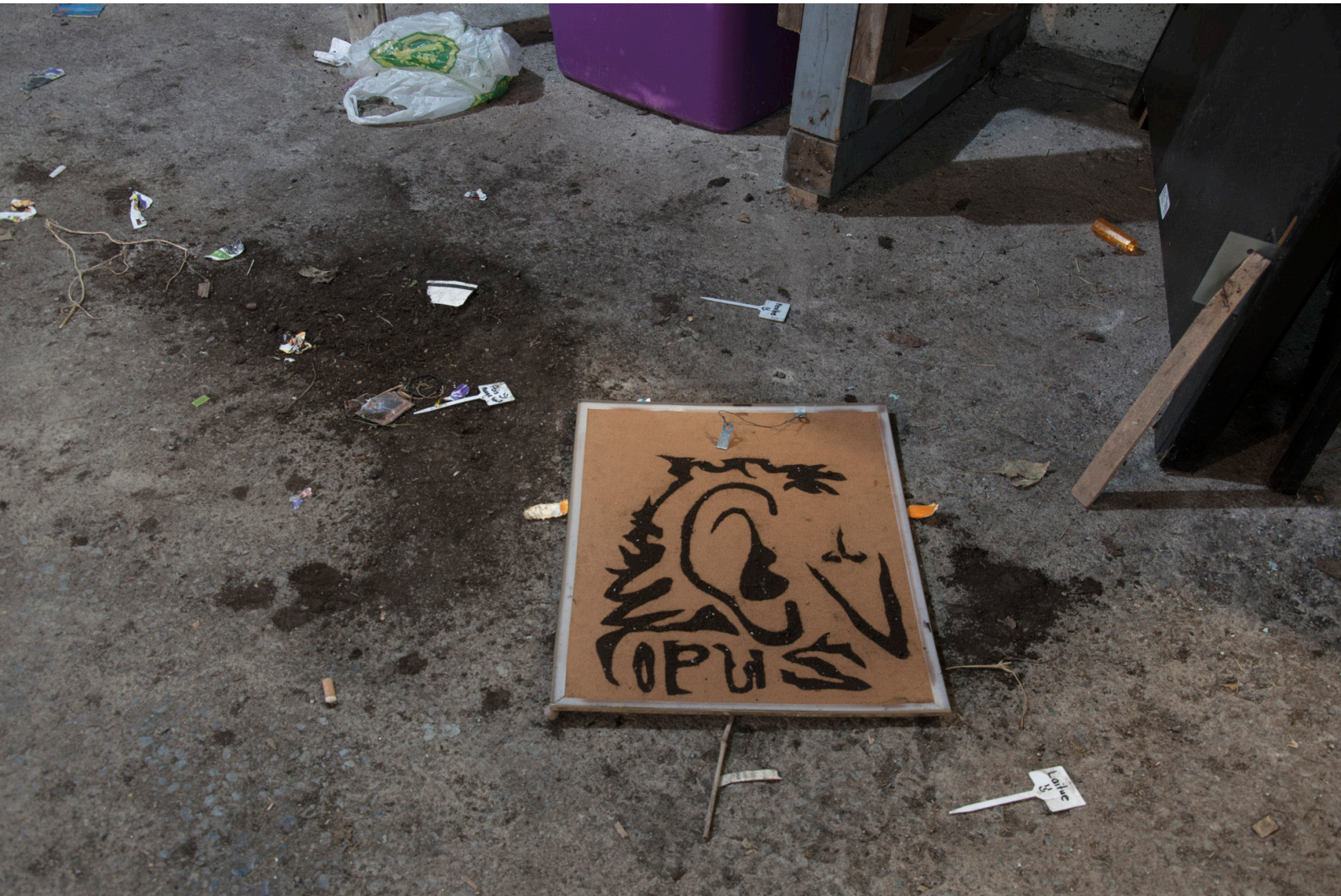
Vincent Larouche, Back-Talk , 2017, Exhibition view, Calaboose, Montréal.