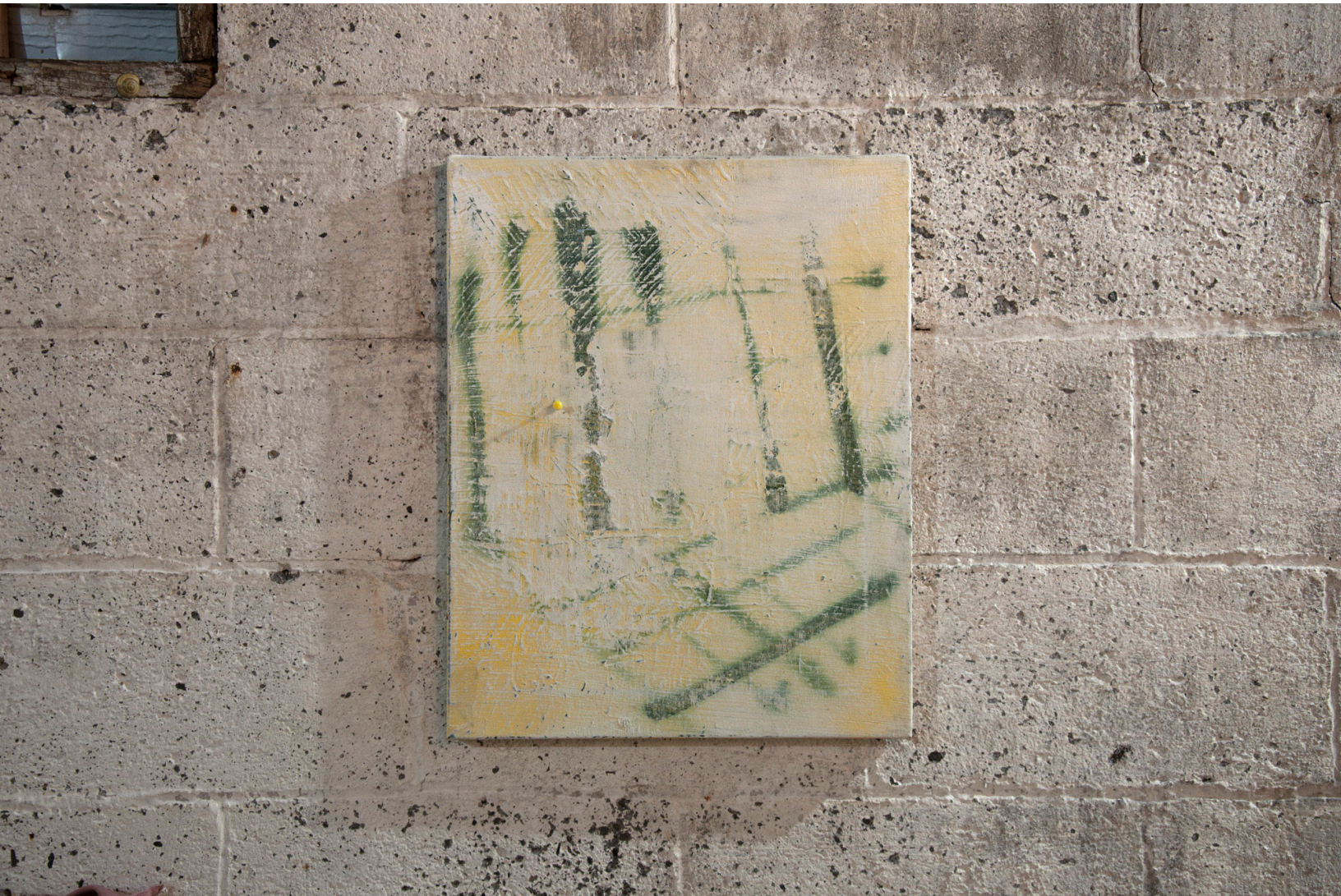
Untitled System 5, 2017, oil and push-pin on canvas, 60cm x 40cm.