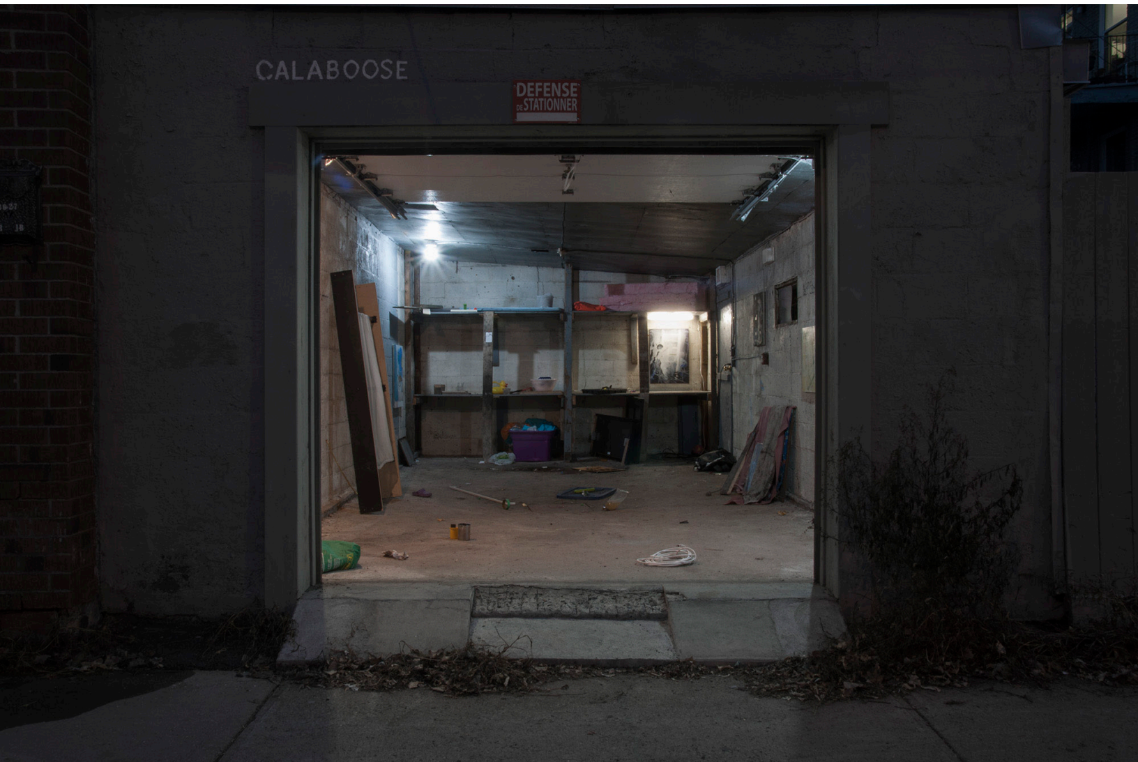
Vincent Larouche, Back-Talk , 2017, Exhibition view, Calaboose, Montréal.