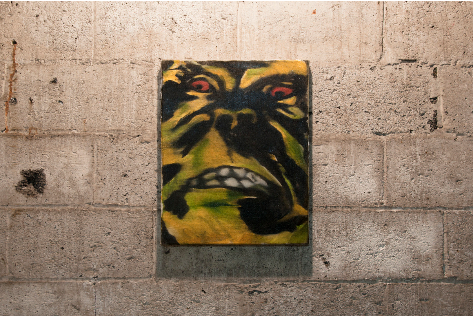
Gravillon, 2017, oil on jute, 60cm x 40cm.