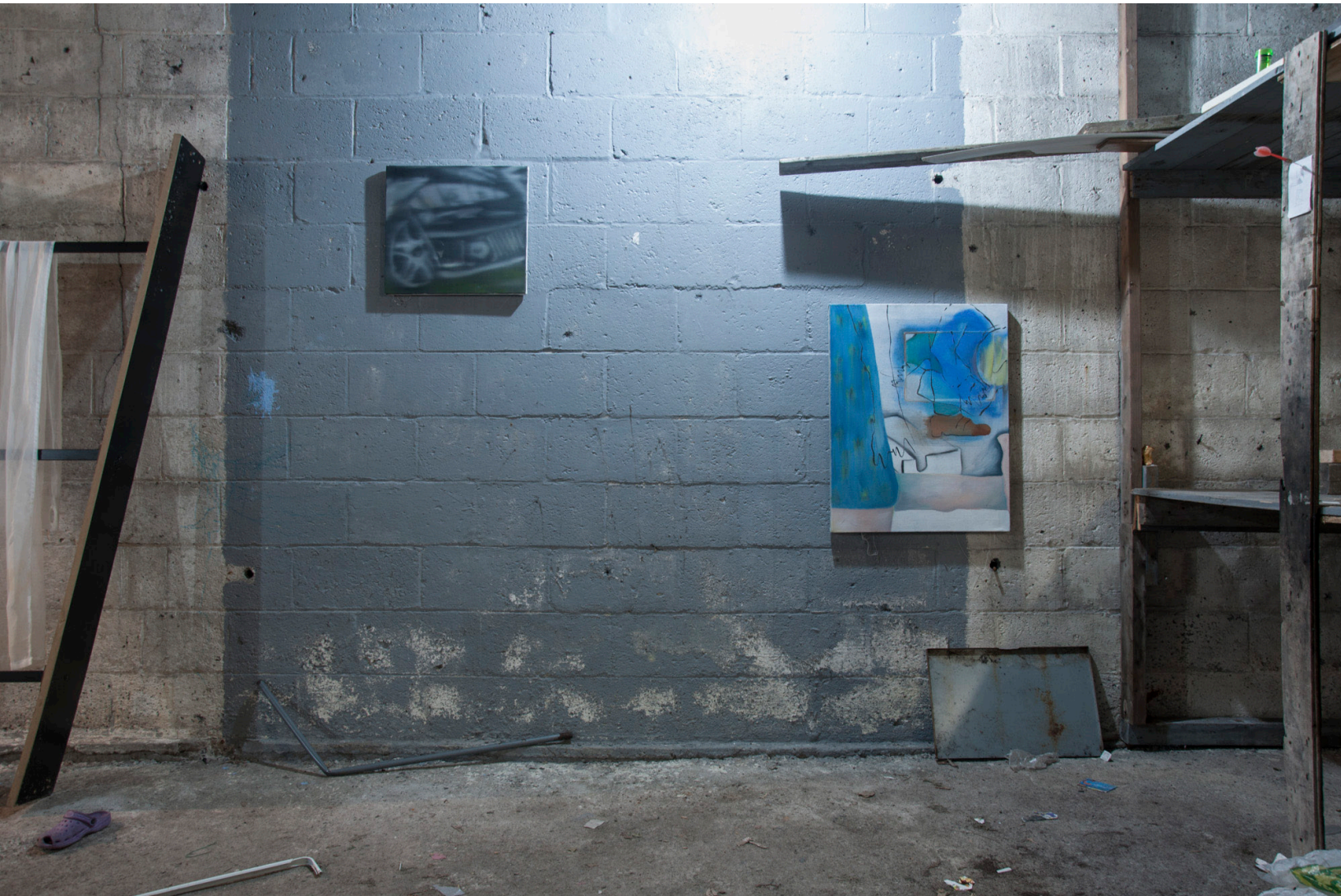
Vincent Larouche, Back-Talk , 2017, Exhibition view, Calaboose, Montréal.