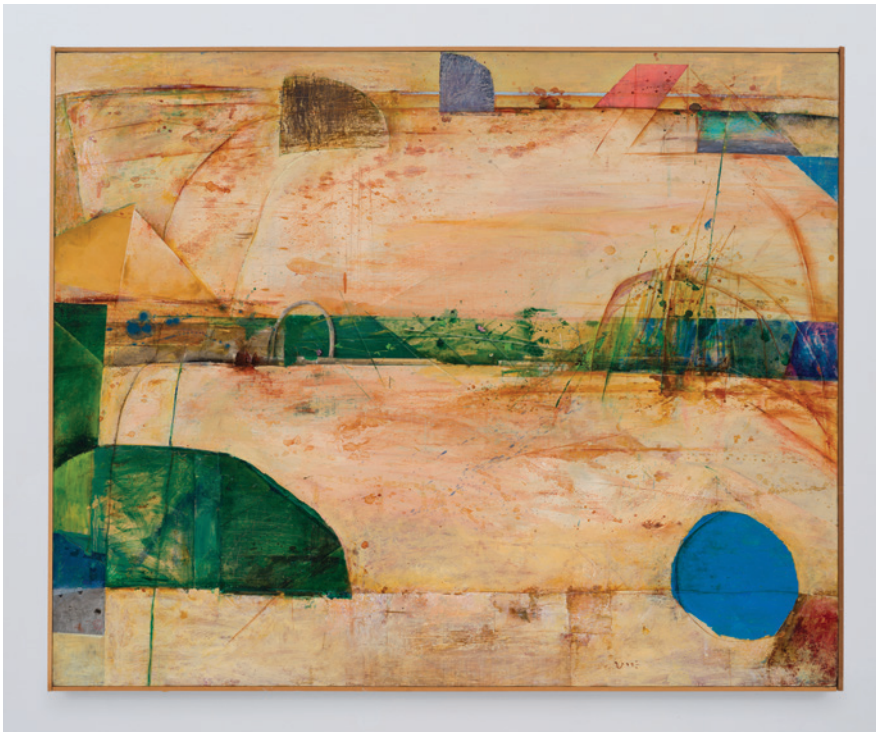
Scenes Passed By , 1993, oil on canvas, 130.7 x 161.7 cm