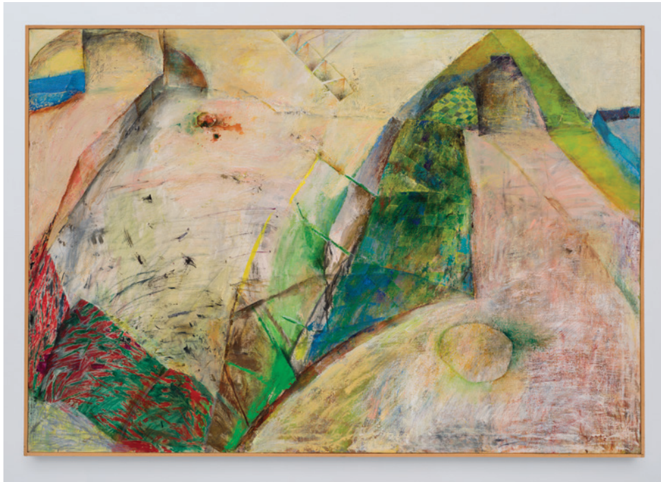
Scenes Passed By , 2000, oil on canvas, 111.7 x 161.7 cm