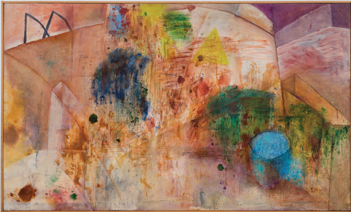
Garden , 1996, oil on canvas, 96.7 x 162.3 cm

ART WEEK TOKYO 2023: November 2 - 5, 2023 10am - 6pm ( https://www.artweektokyo.com/ )