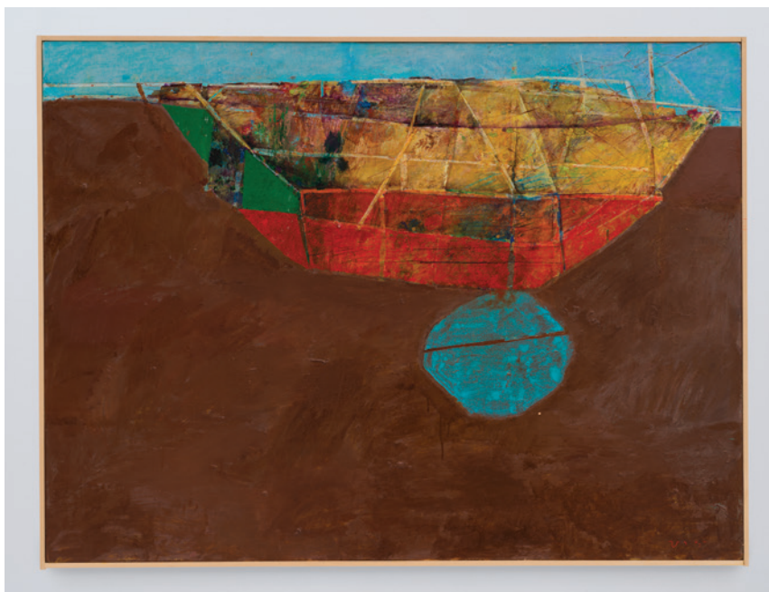
Raft (Boat) , 2015, oil on canvas, 96.7 x 130.5 cm