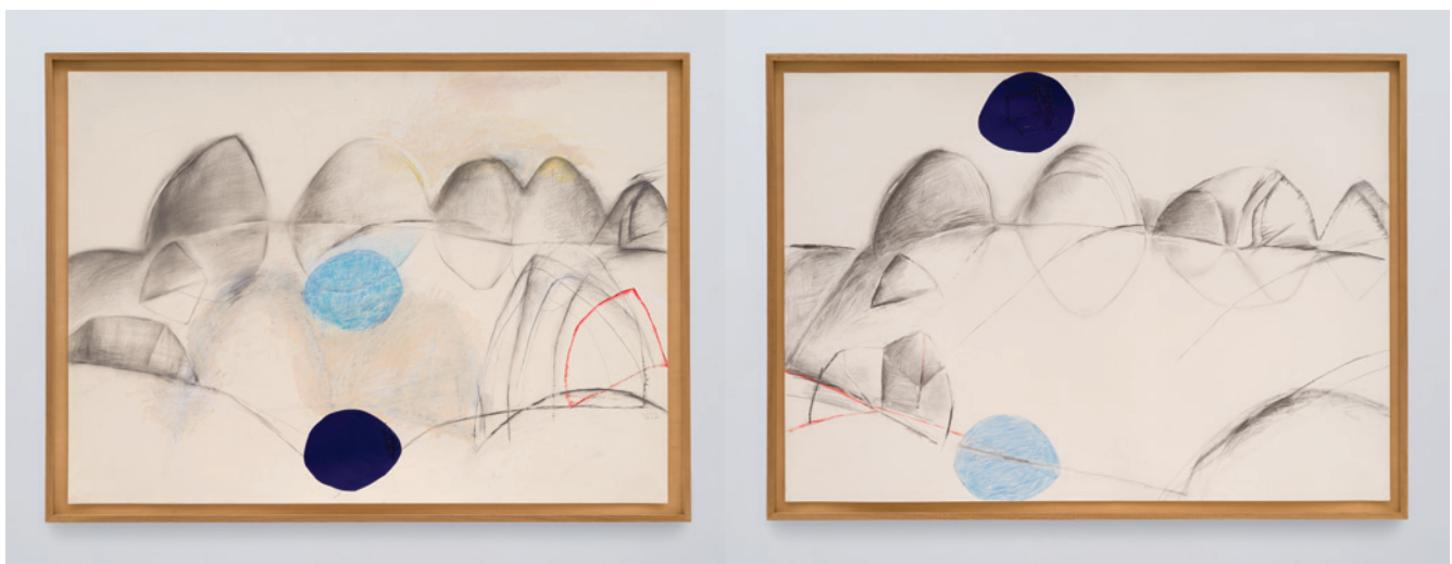
Mountains, 2007, pencil and colored pencil on paper 73.7 x 103.7 cm (each)