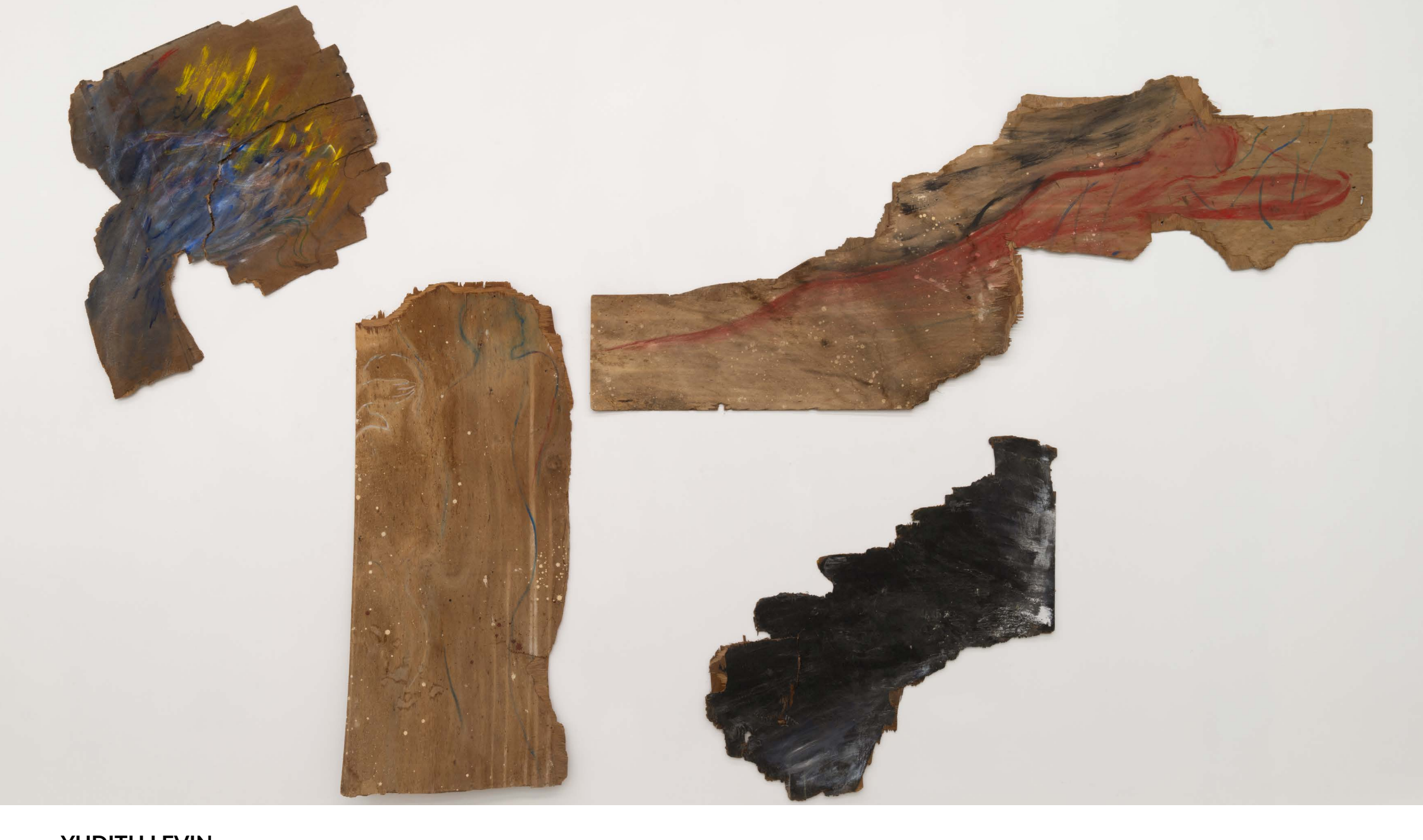
YUDITH LEVIN Sleeping Amor (Amor & Psyche), 1984 plywood 215 x 356 cm, unique