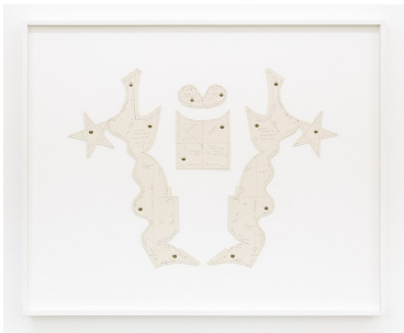
Bruno Zhu American Average Star , 2022 Pencil on card Dimensions variable 29.25 x 35.5 inches 74.3 x 90.1 cm framed 1 + 1 AP