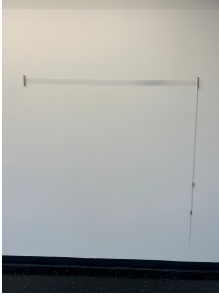
Stefanie Victor Untitled , 2023 Nickel, thread, brass 50 x 60 inches 127 x 152.40 cm