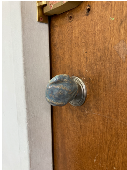
Kate Newby There's more , 2023 Ceramics 3 x 3 x 2.25 inches 7.6 x 7.6 x 5.7 cm