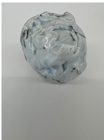
Kate Newby There's more , 2023 Ceramics 3 x 3 x 3 inches 7.6 x 7.6 x 7.6 cm