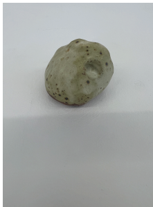
Kate Newby There's more , 2023 Ceramics 2 x 2 x 2.5 inches 5.1 x 5.1 x 1.3 cm