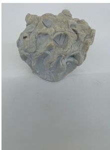
Kate Newby There's more , 2021 Ceramics 2.75 x 2.75 x 3.25 inches 7 x 7 x 8.3 cm