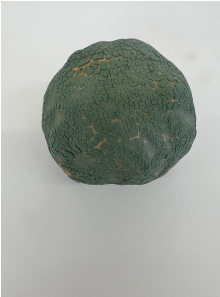
Kate Newby There's more , 2021 Ceramics 3 x 3.5 x 3.5 inches 7.6 x 8.9 x 8.9 cm