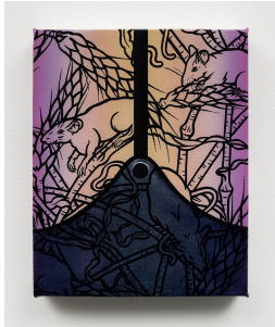
Emily Mae Smith Blue Jean , 2023 Oil on linen 10 x 8 inches 25.4 x 20.3 cm