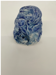
Kate Newby There's more , 2023 Ceramics 3.25 x 3 x 3.5 inches 8.3 x 7.6 x 8.9 cm