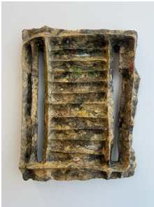
Bill Jenkins Panel Number 7 , 2022 Paper mache 14 x 11 x 2.75 inches 35.6 x 27.9 x 7 cm