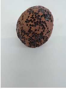
Kate Newby There's more , 2023 Ceramics Dimensions variable 3.75 x 3 x 3 inches 9.5 x 7.6 x 7.6 cm