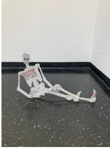
Max Guy Lord of Frenzy , 2023 Collage on cardboard, colored pencil, Chicago screws 36 x 12 inches 91.44 x 30.5 cm