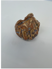
Kate Newby There's more , 2023 Ceramics 2.5 x 2 x 2.5 inches 6.4 x 5.1 x 6.4 cm