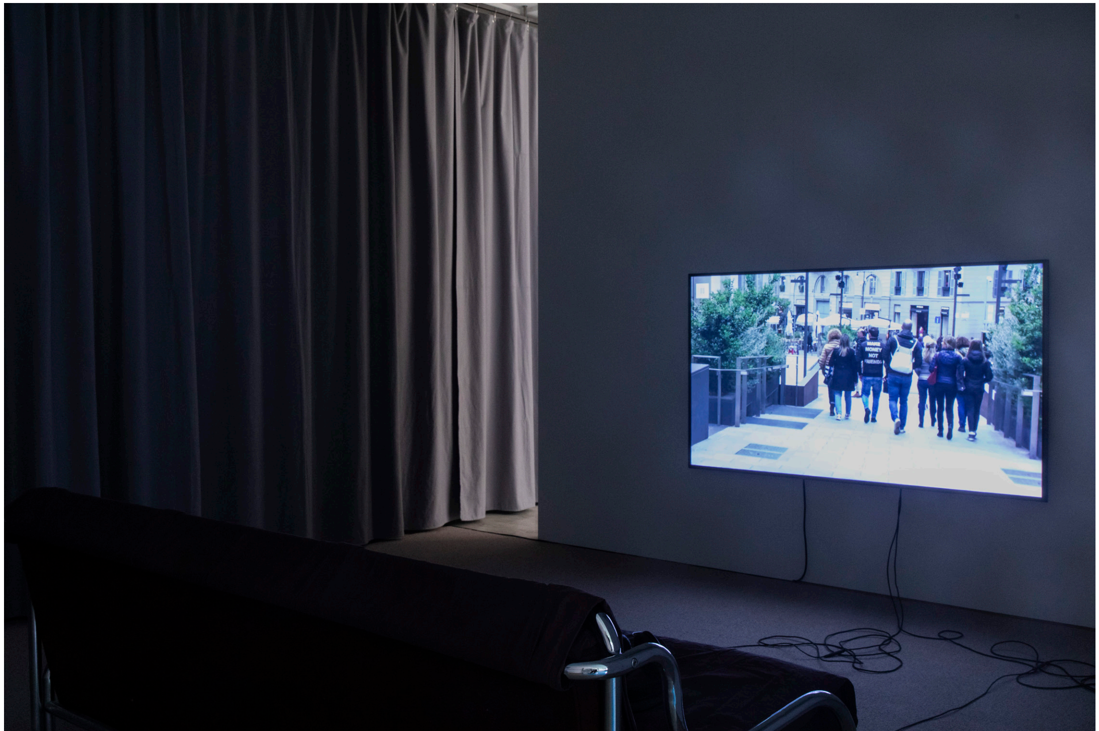
Benedikt Bock Die Zukunft gehört dem Auto 2023 Photo: Nina Rieben