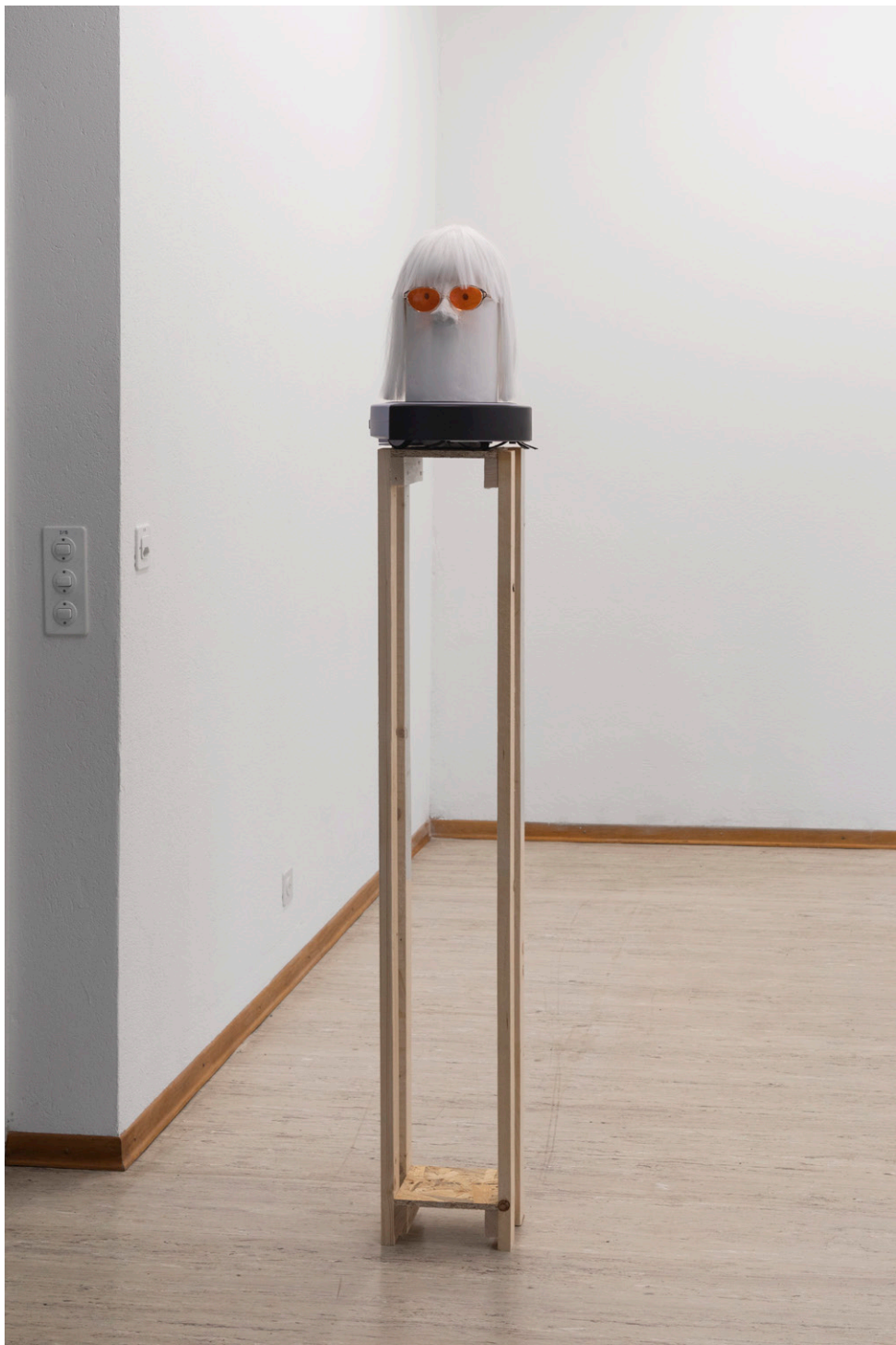
left. Benedikt Bock What People Want is Not What People Need (Rob and Lizzy) 2023 / right. Benedikt Bock What People Want is Not What People Need (Rebekka) 2023