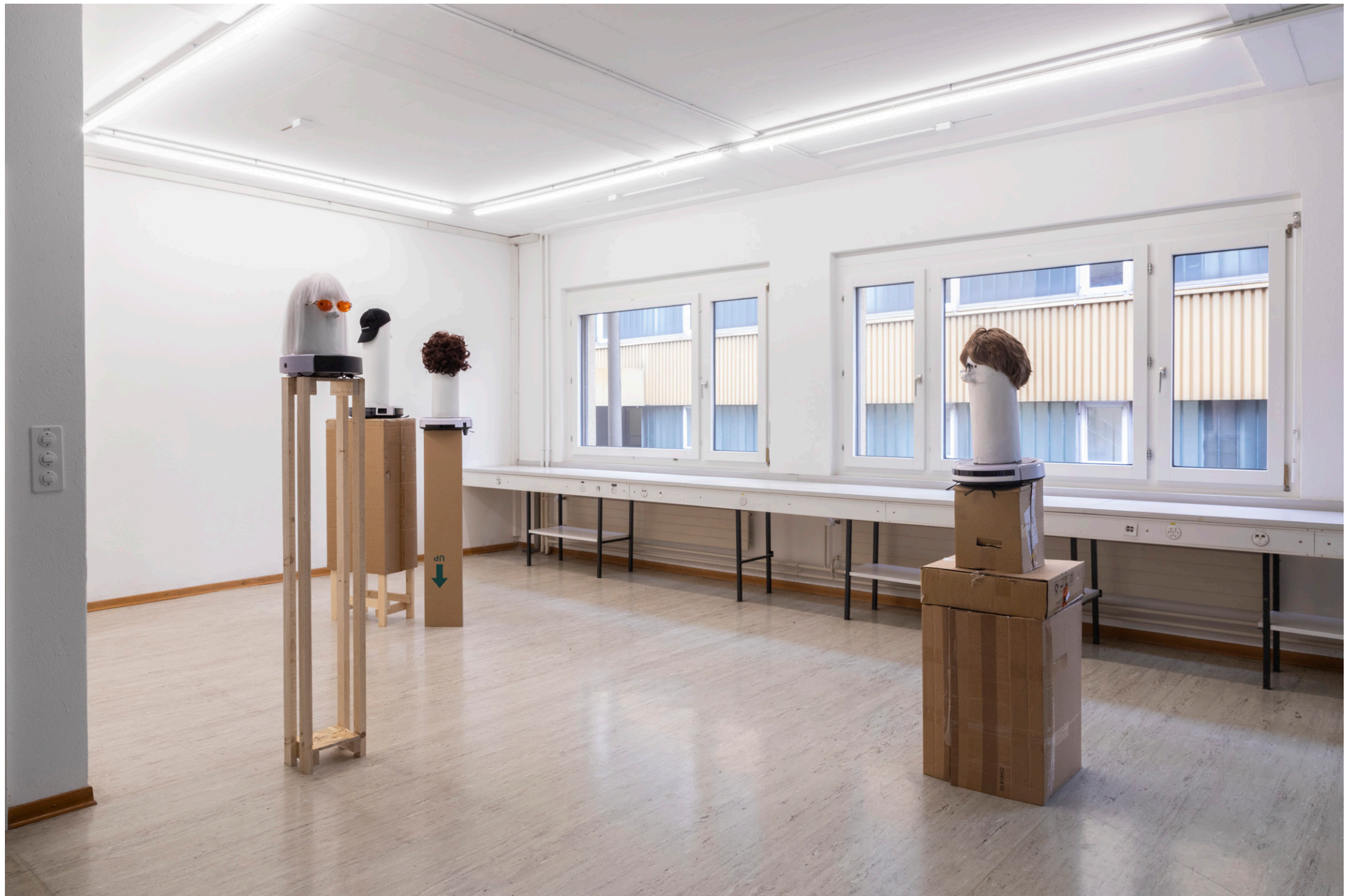
f.l.t.r. Benedikt Bock What People Want is Not What People Need (Rebekka) 2023 / What People Want is Not What People Need (Rob and Lizy) 2023 / What People Want is Not What People Need (Günther) 2023