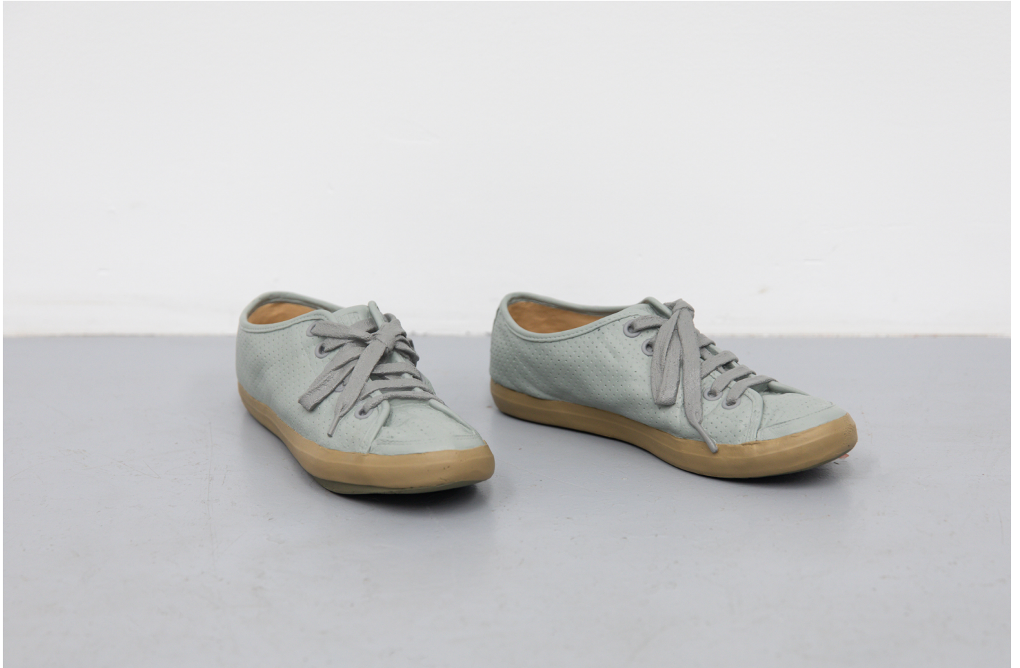
Van Maltese Caitlyn (company), 2023 Oil on cast bronze, socks 2.75 x 3.25 x 10.25 in (7 x 8.3 x 26 cm) each V.M0213