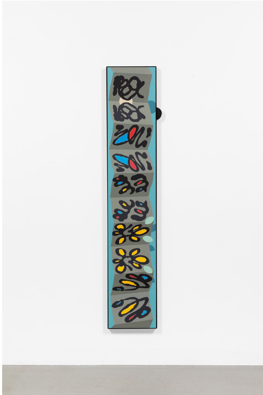
Van Maltese Hypothesizing coincidence no. 6 , 2020 Oil on panel, powder coated steel, wood, magnets 60.25 x 11.25 in (153 x 28.6 cm) V.Maltese0115