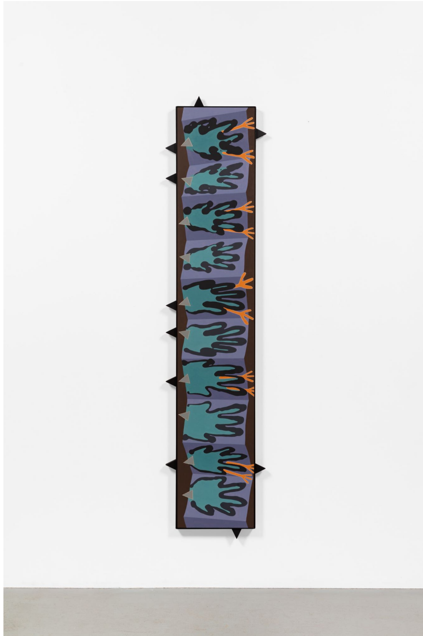
Van Maltese Hypothesizing coincidence no. 4, 2020 Oil on panel, powder coated steel, wood, magnets 60.25 x 11.25 in (153 x 28.6 cm) V.Maltese0113