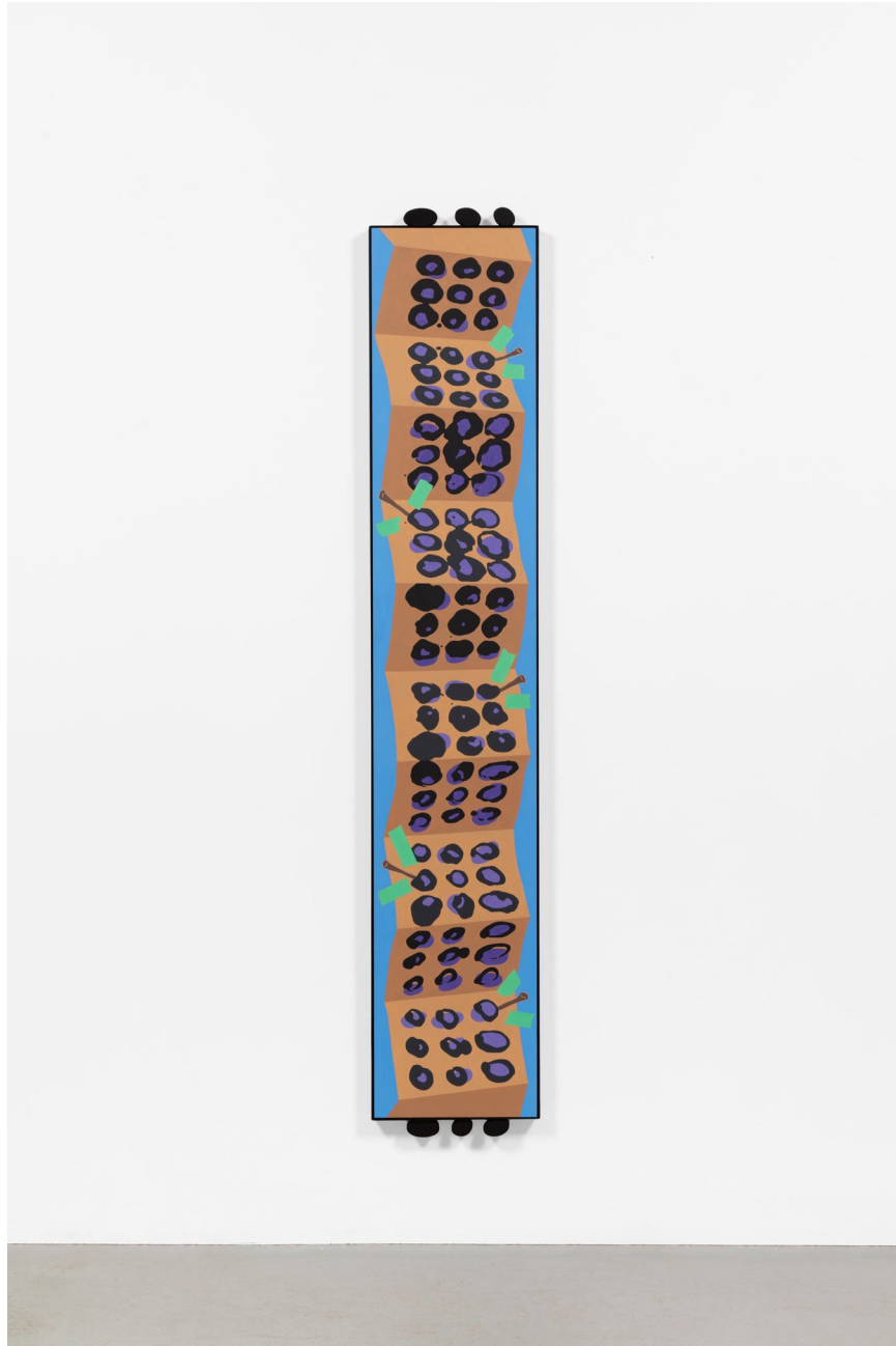
Van Maltese Hypothesizing coincidence no. 5, 2020 Oil on panel, powder coated steel, wood, magnets 60.25 x 11.25 in (153 x 28.6 cm) V.Maltese0114