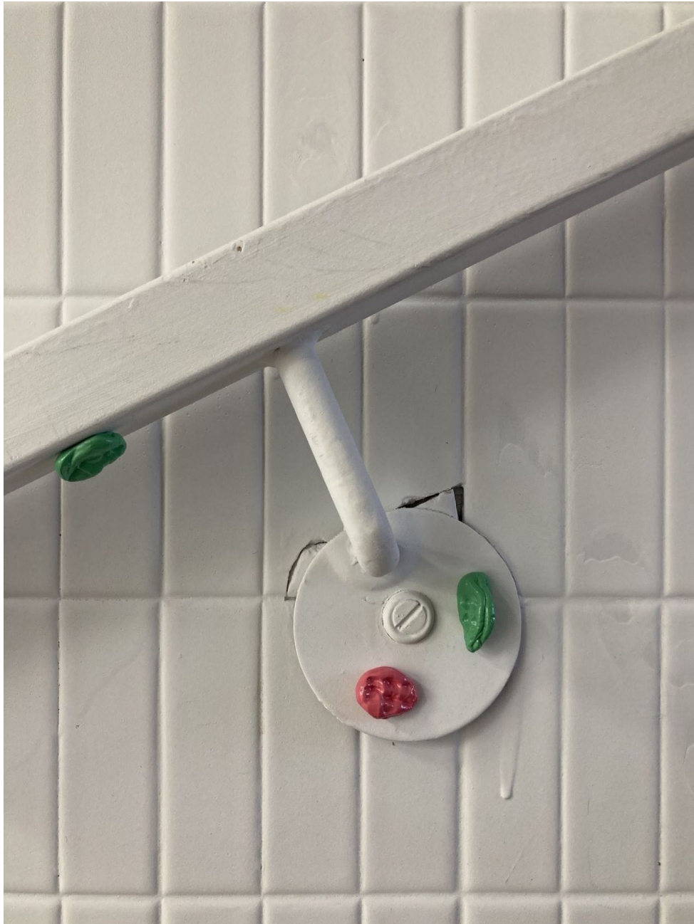
Van Maltese Habit, 2023 Enamel on bronze, magnet 1 x \frac{3}{4} x \frac{1}{2} in (2.5 x 1.9 x 1.3 cm) V.M0214