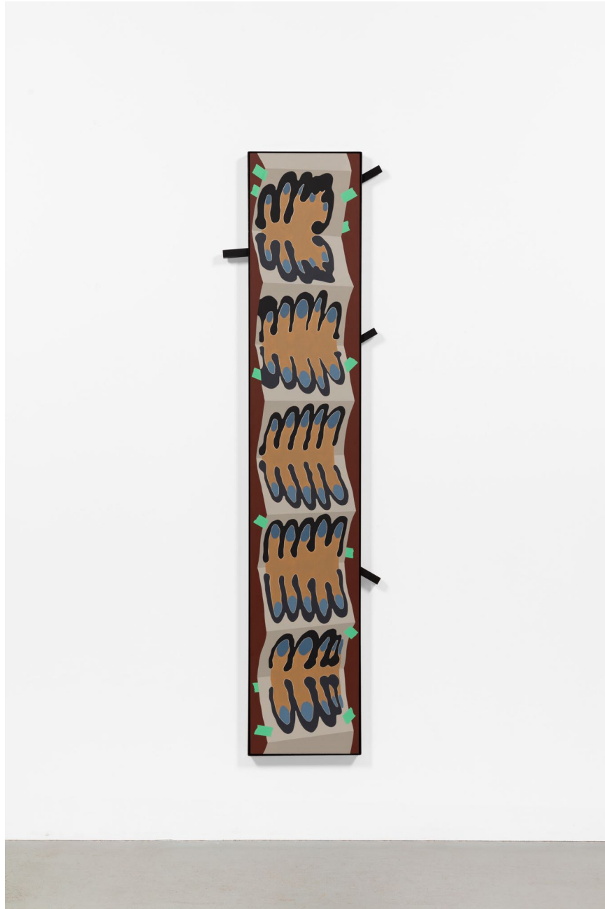
Van Maltese Hypothesizing coincidence no. 3 , 2020 Oil on panel, powder coated steel, wood, magnets 60.25 x 11.25 in (153 x 28.6 cm) V.Maltese0112