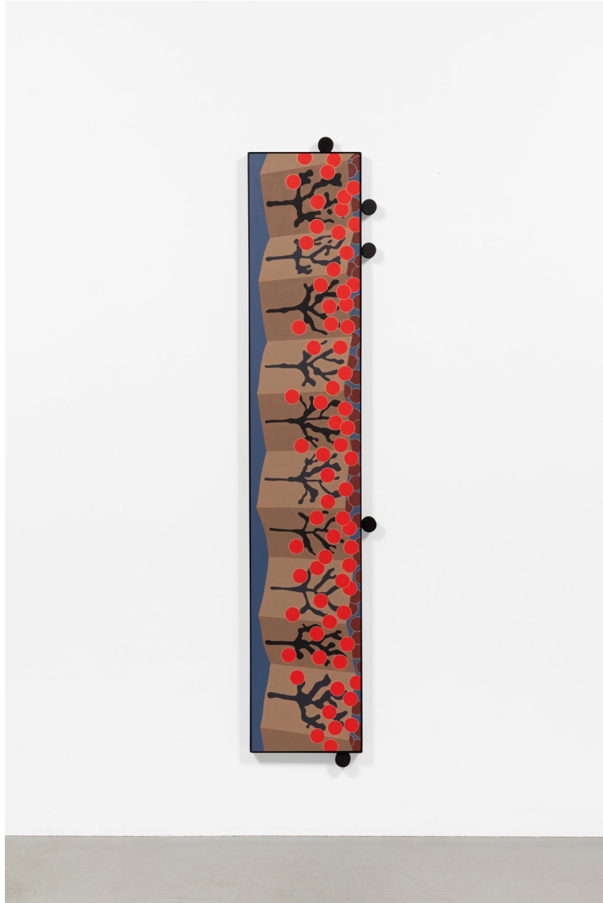
Van Maltese Hypothesizing coincidence no. 1, 2020 Oil on panel, powder coated steel, wood, magnets 60.25 x 11.25 in (153 x 28.6 cm) V.Maltese0110