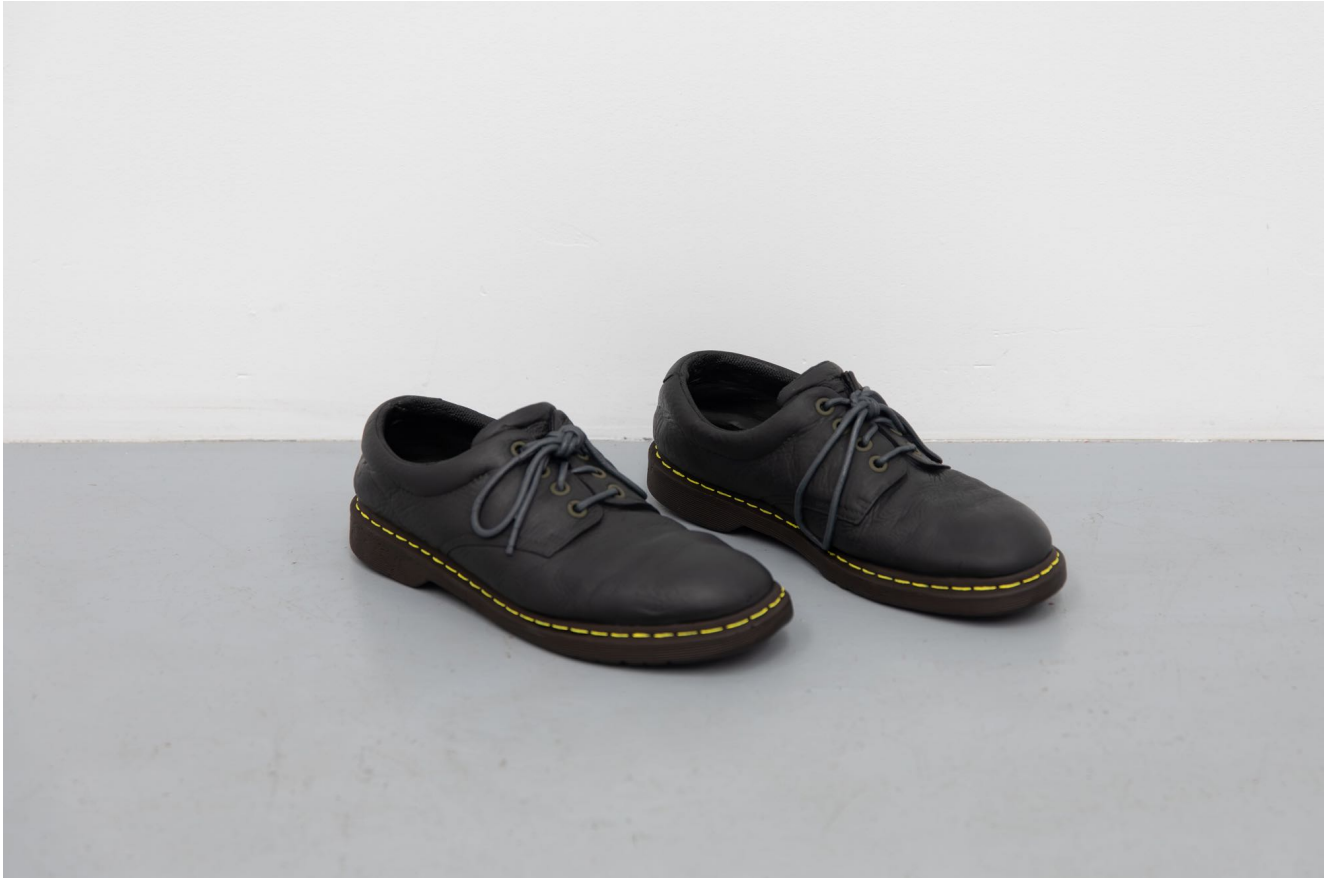
Van Maltese Simon (company), 2016 Oil on cast aluminium 4.75 x 4.5 x 12.5 in (12.1 x 11.4 x 31.8 cm) each V.Maltese0107