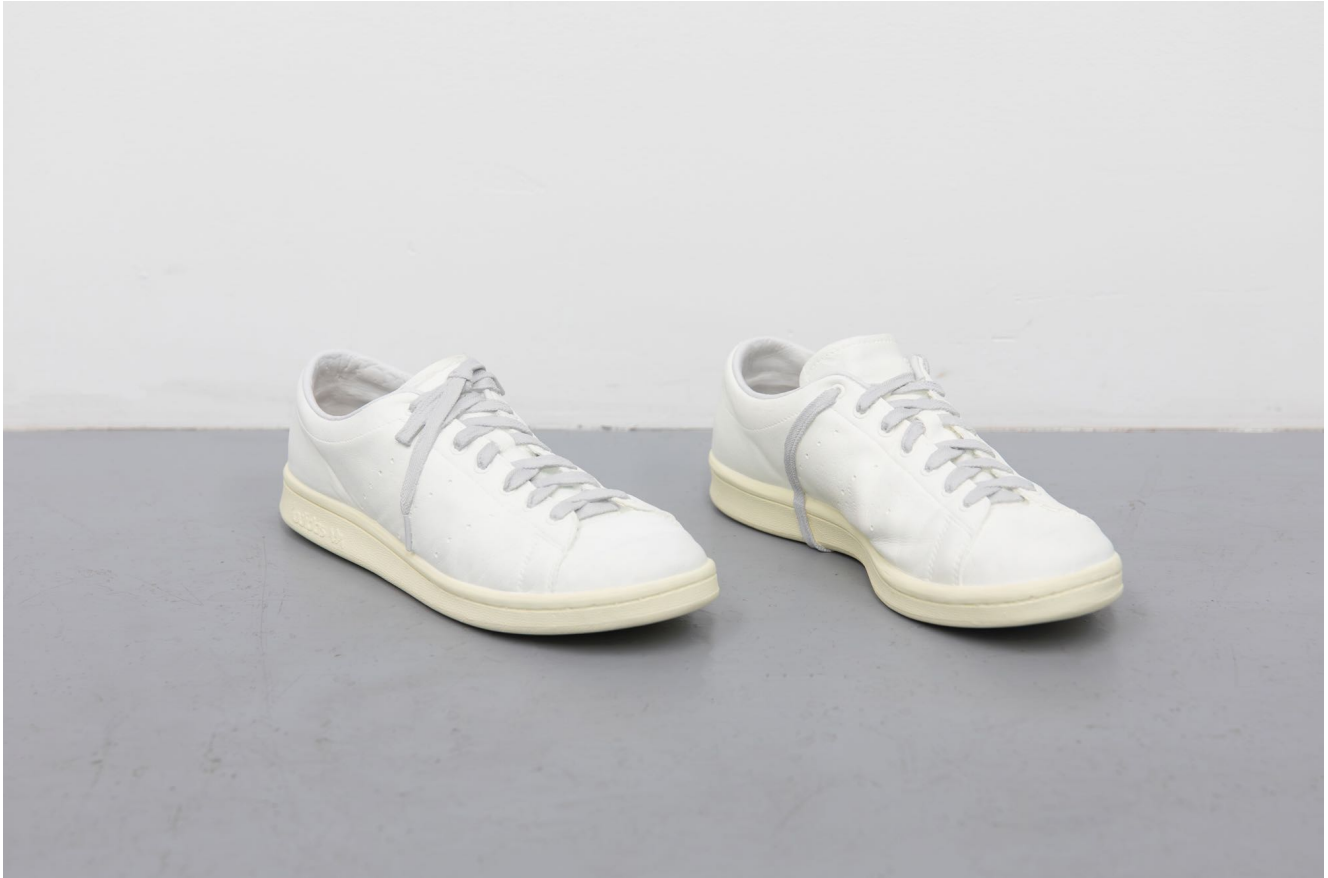
Van Maltese Ari (company) , 2016 Oil on cast aluminium 4 x 4 x 12 in (10.2 x 10.2 x 30.5 cm) each V.Maltese0104