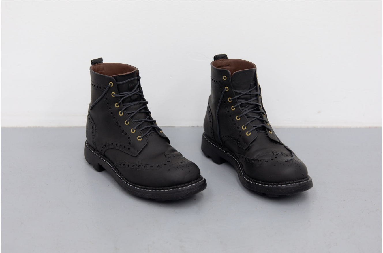
Van Maltese Georgia (company), 2016 Oil on cast aluminium 7.5 x 4.25 x 11 in (19.1 x 10.8 x 27.9 cm) each V.Maltese0103