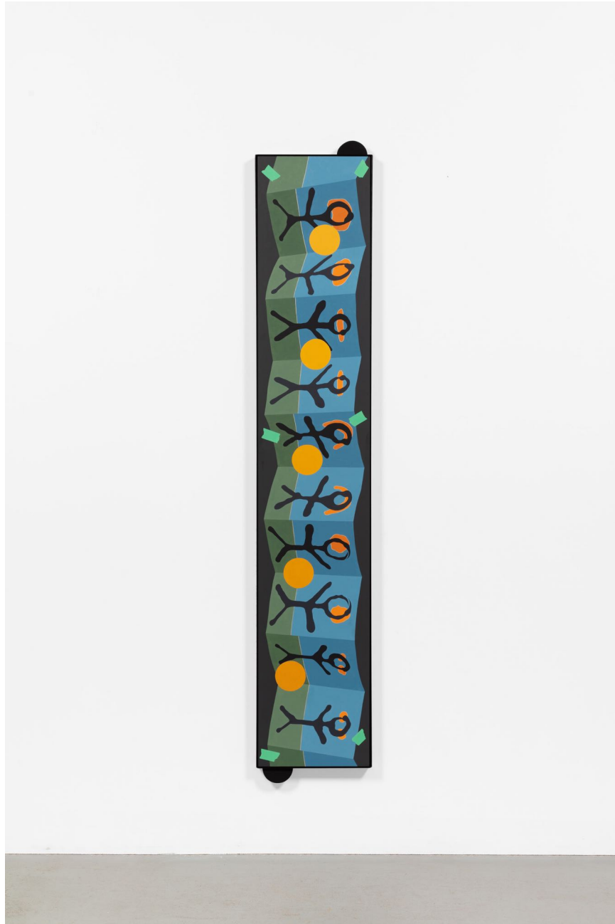
Van Maltese Hypothesizing coincidence no. 2, 2020 Oil on panel, powder coated steel, wood, magnets 60.25 x 11.25 in (153 x 28.6 cm) V.Maltese0111