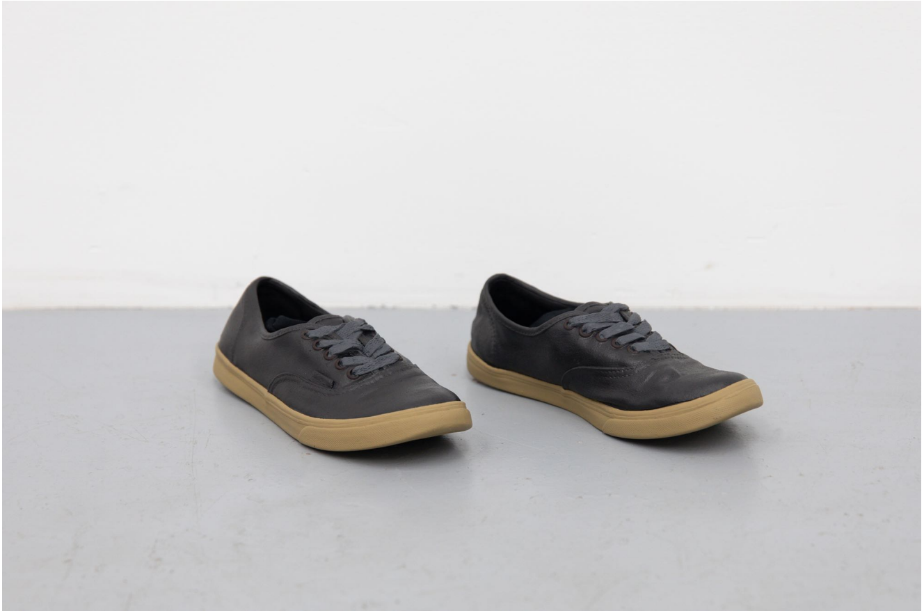
Van Maltese Val (company) , 2016 Oil on cast aluminium 2.75 x 3.5 x 10 in (7 x 8.9 x 25.4 cm) each V.Maltese0098