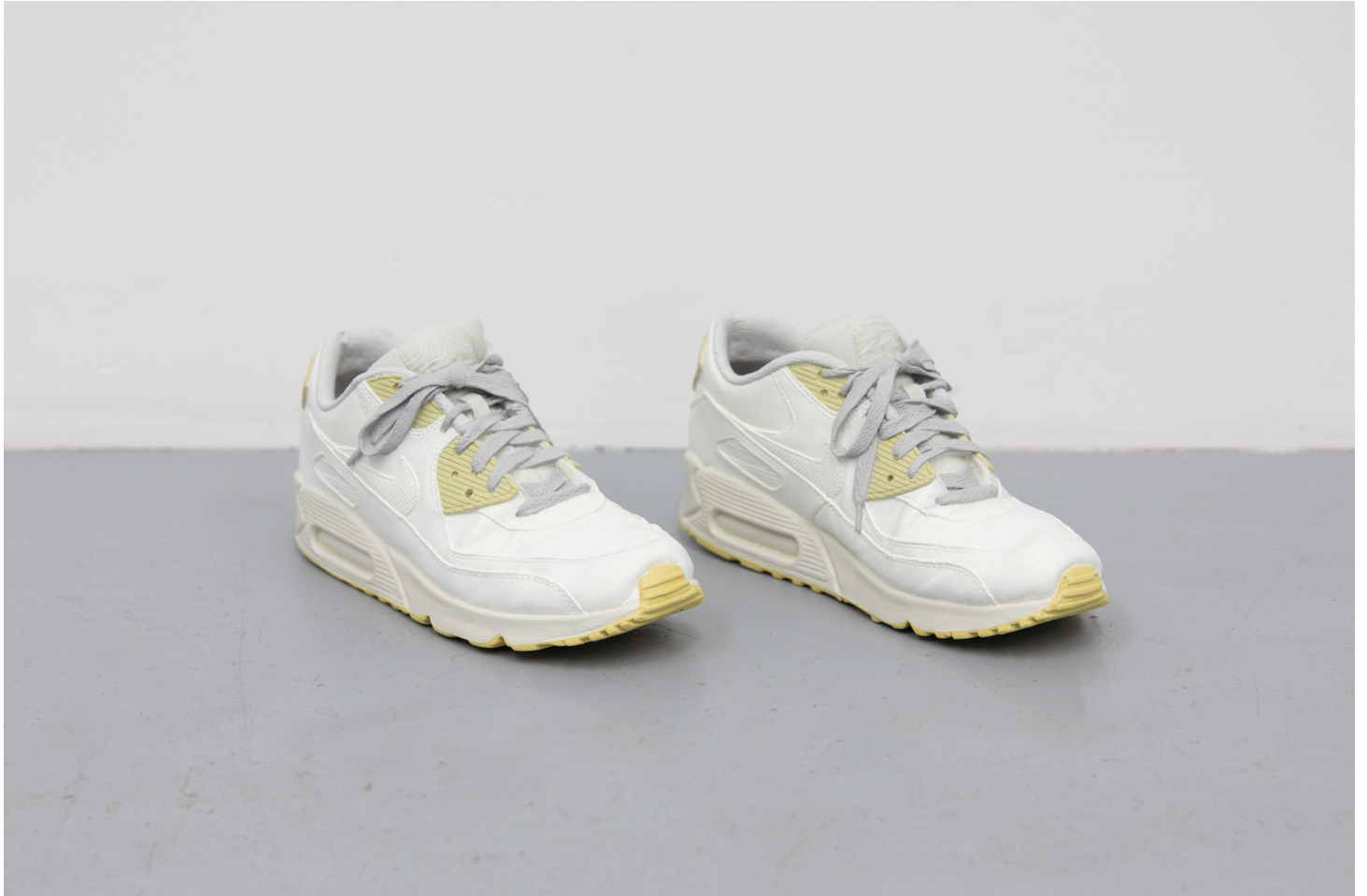
Van Maltese Abby (company), 2018 Oil on cast aluminium 5 x 3.5 x 10.5 in (12.7 x 8.9 x 26.7 cm) each V.Maltese0108