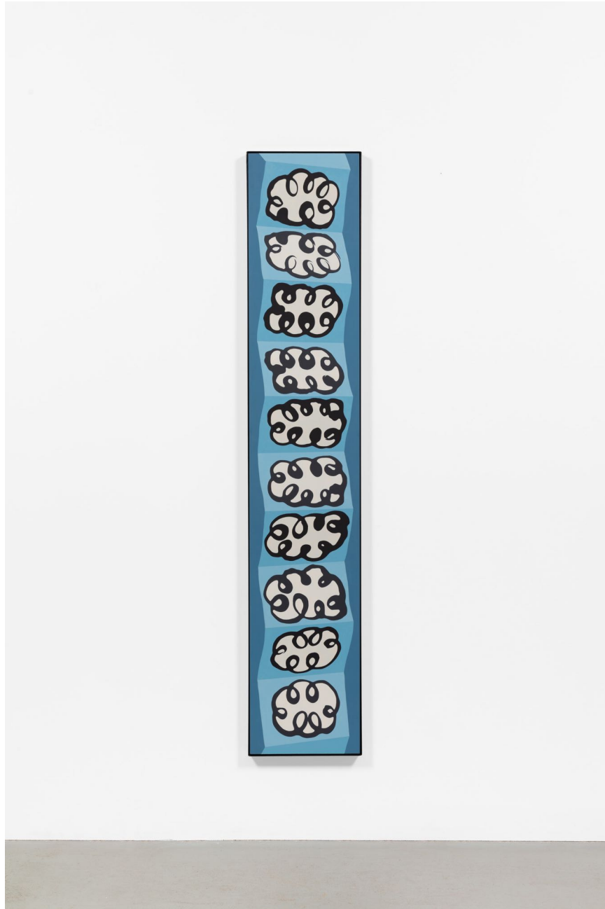
Van Maltese Hypothesizing coincidence no. 7, 2020 Oil on panel, powder coated steel 60.25 x 11.25 in (153 x 28.6 cm) V.Maltese0116