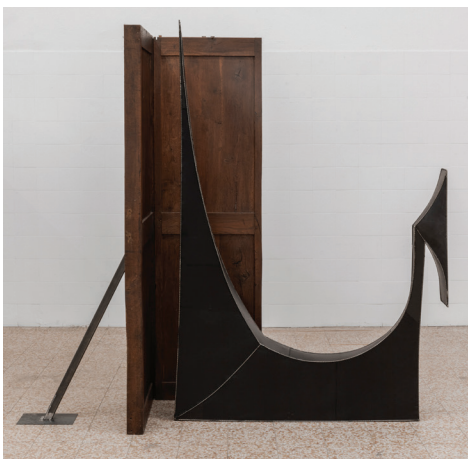
Speaker's lament (syncopated), 2023

Metal, leather, deconstructed wooden closet walls