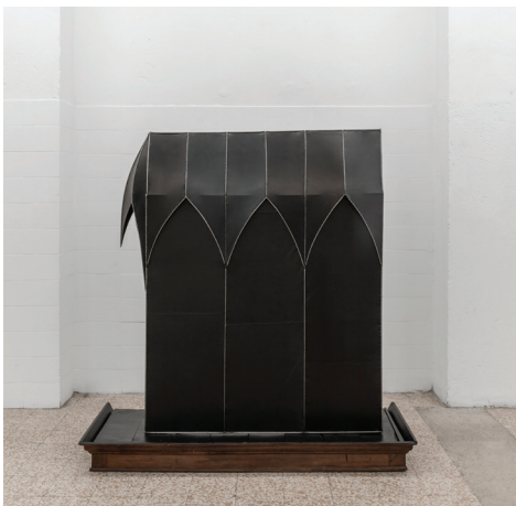
Sealed Cathedral, 2023

Metal, leather, deconstructed wooden closet part, magazine, piano lesson book