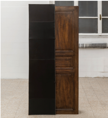
Play, Part, Cut, 2023

Deconstructed wooden closet doors, metal, digital print, piano lessons book.