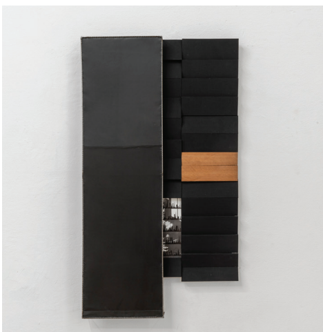
Dwelling Boy, 2023

Leather, metal, jewelry displays, pencil on magazine image, wooden floor