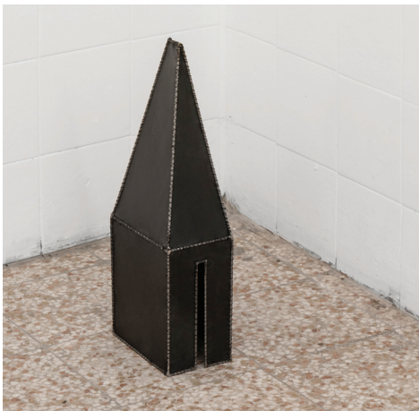
Leather House, 2023