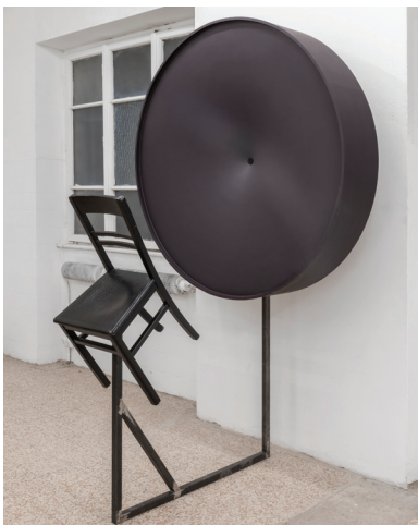
A hole is a slit (made open by time), 2023