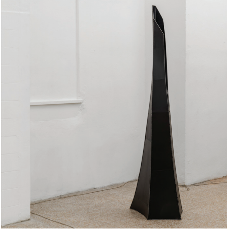
The Fool, 2023