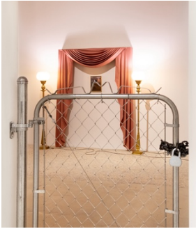
Past, 2023 Fence, chain, lock, keys, curtain, two lamps, gloss C- Type print, solid brass frame Dimensions variable