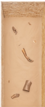
Diamond's Box 2 , 2023

Chipboard box, silica sand, bronze casts 36 x 36 x 84 inches (91 x 91 x 213 cm)