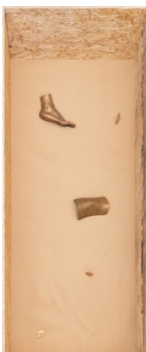
Diamond's Box 3 , 2023

Chipboard box, silica sand, bronze casts 36 x 36 x 84 inches (91 x 91 x 213 cm)