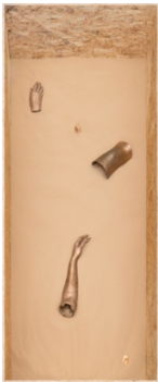
Diamond's Box 1 , 2023

Long Jump, silica sand, bronze casts 16 x 629 1/2 x 144 inches (41 x 1599 x 366 cm)