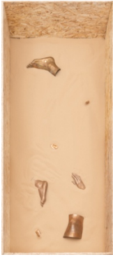
Diamond's Box 4, 2023 Chipboard box, silica sand, bronze casts 36 x 36 x 84 inches (91 x 91 x 213 cm)