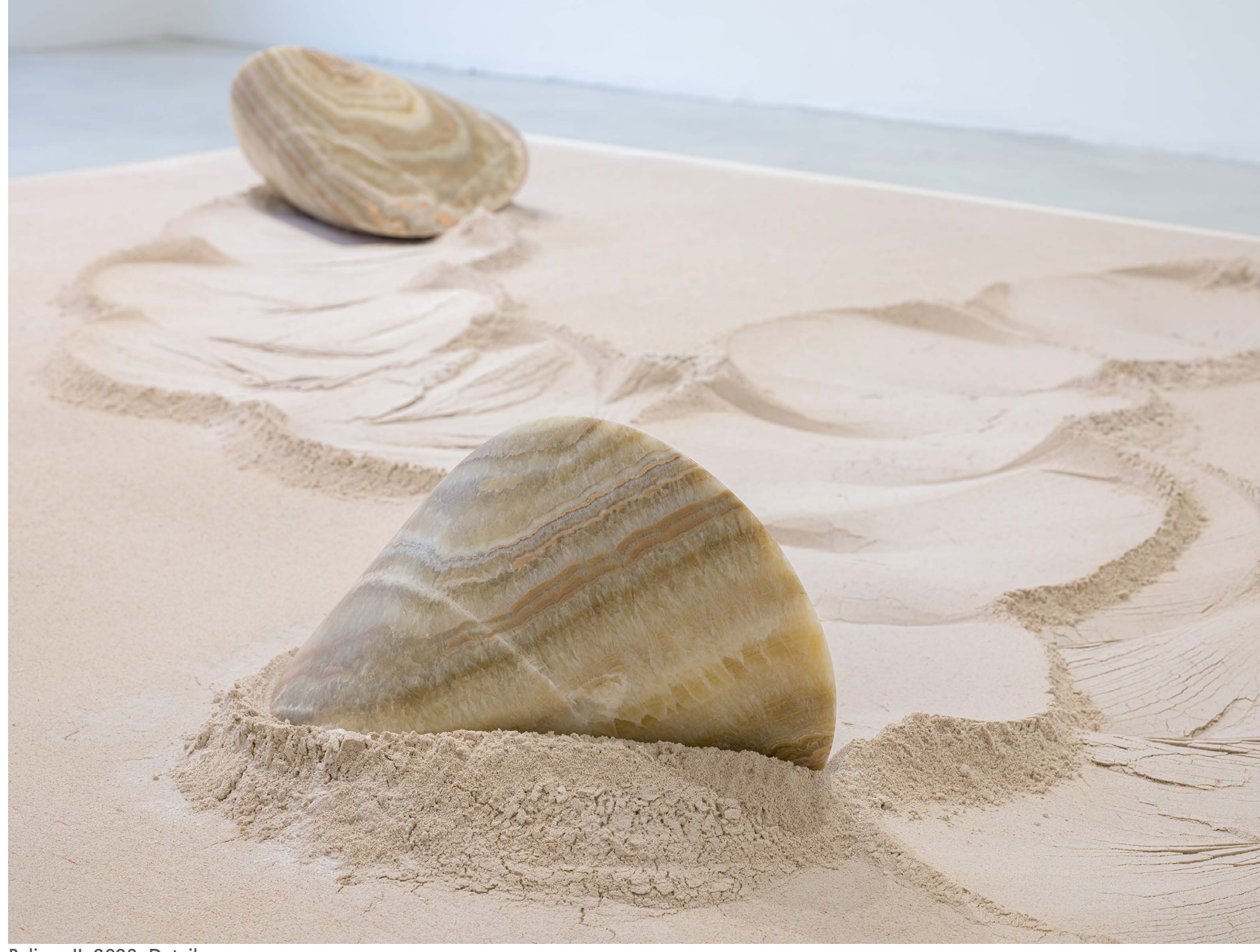
Relieve II, 2023, Detail