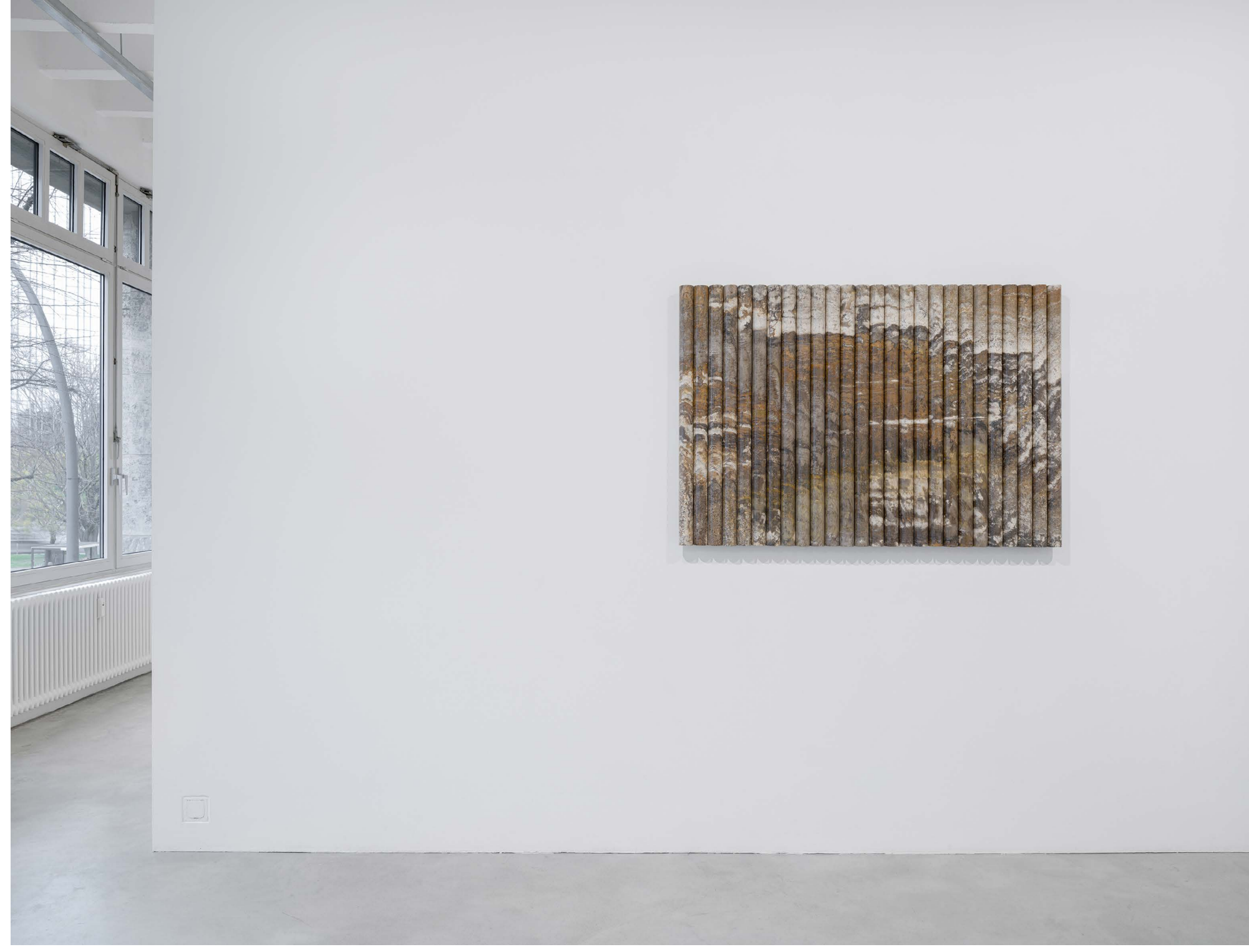
Testigos IV, 2022, Installation view