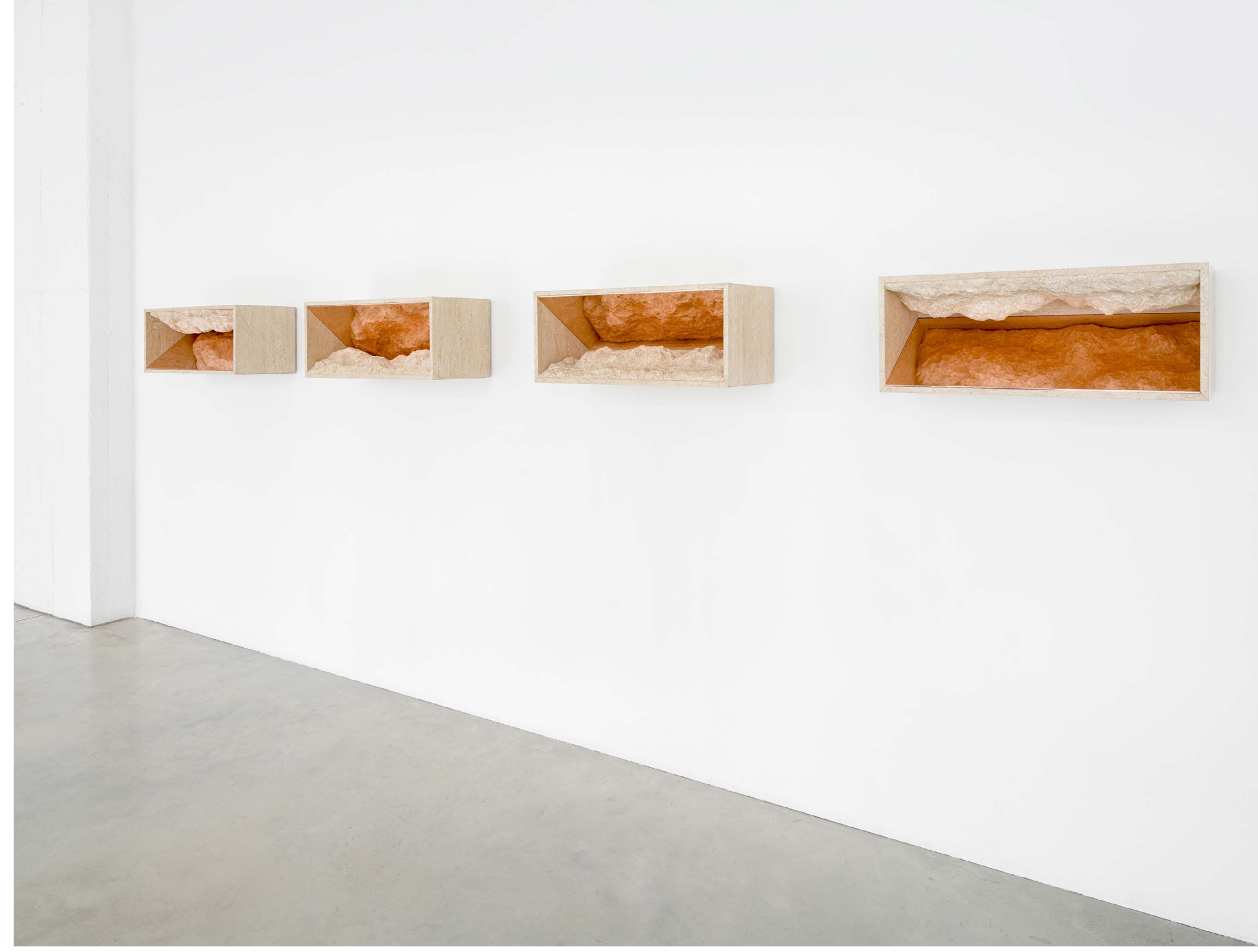
Unfoldings I - IV, 2023, Installation view