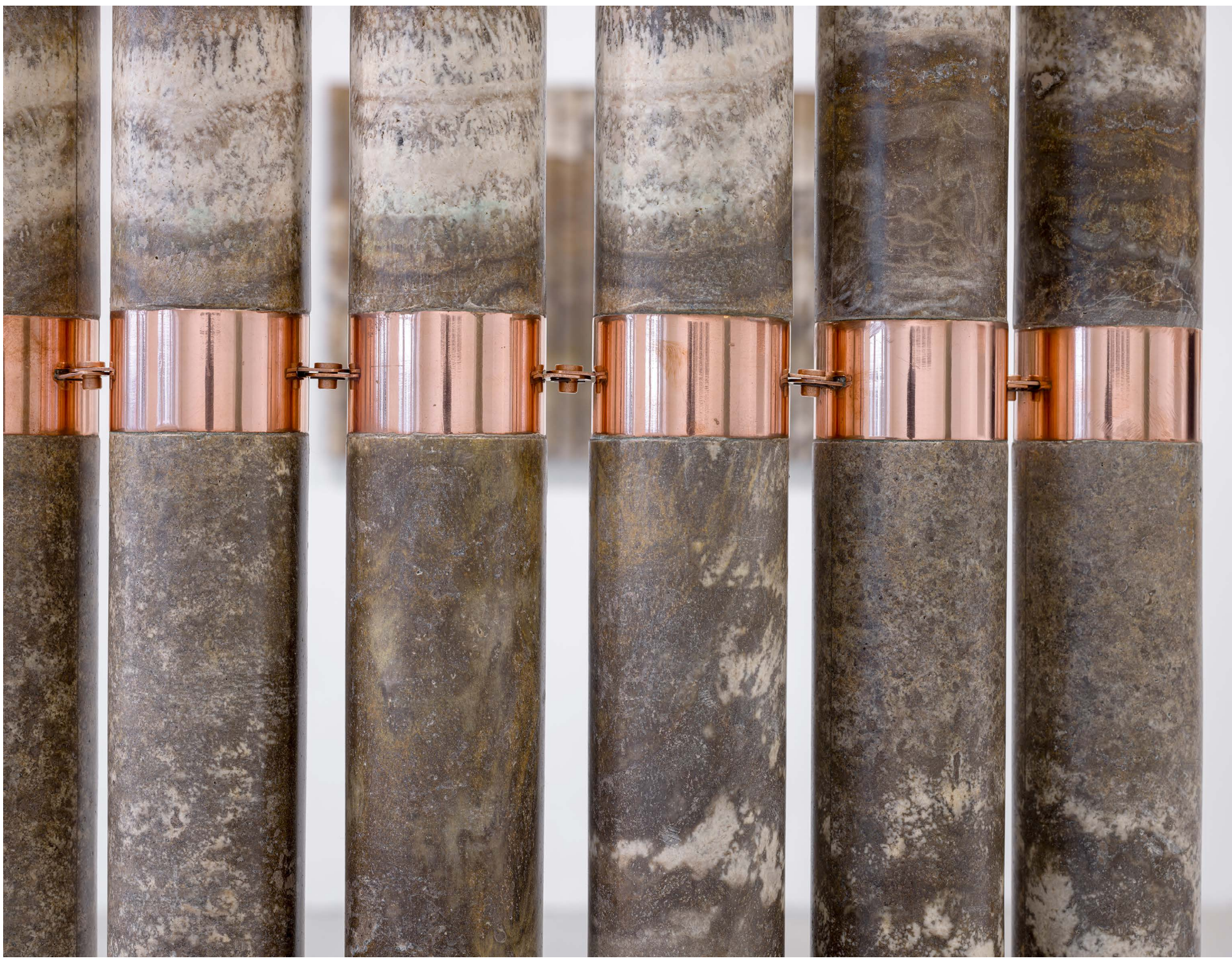
Testigos (after A. Aalto), 2023, Detail