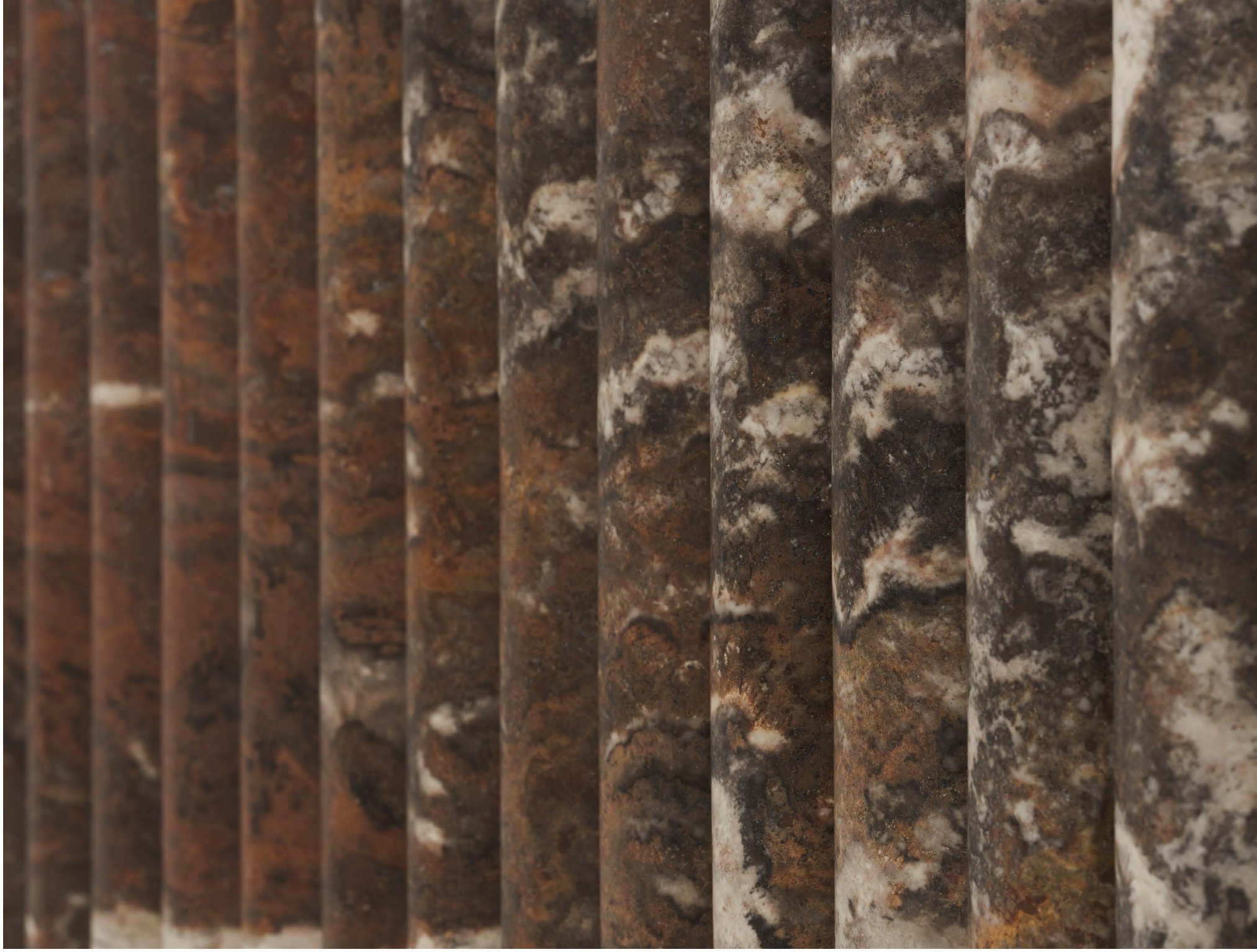
Testigos IV, 2022, Detail