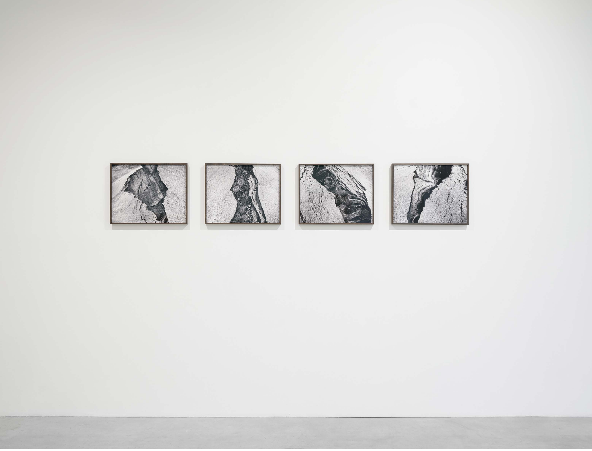
Tellurian signals N.1 - 4, 2023, Installation view