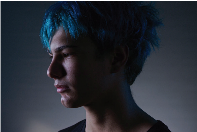
Alejandro Cesarco, video stills from Figuratively , 2021

© Alejandro Cesarco. Courtesy of the artist and Maumaus/Lumiar Cité