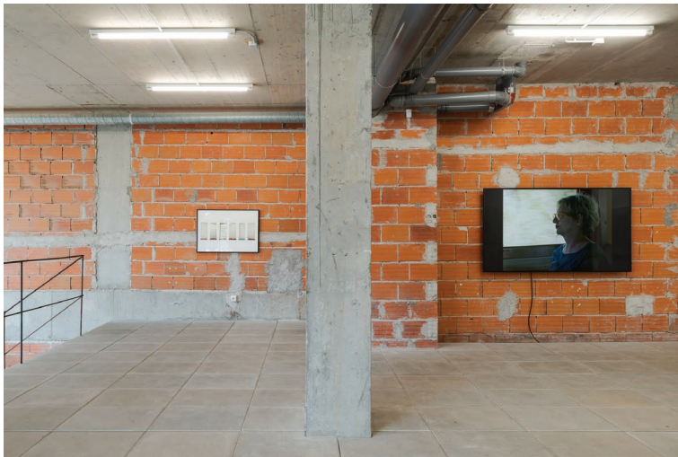
Alejandro Cesarco, Other Recent Examples , installation view, 2023 Alejandro Cesarco-4.tiff