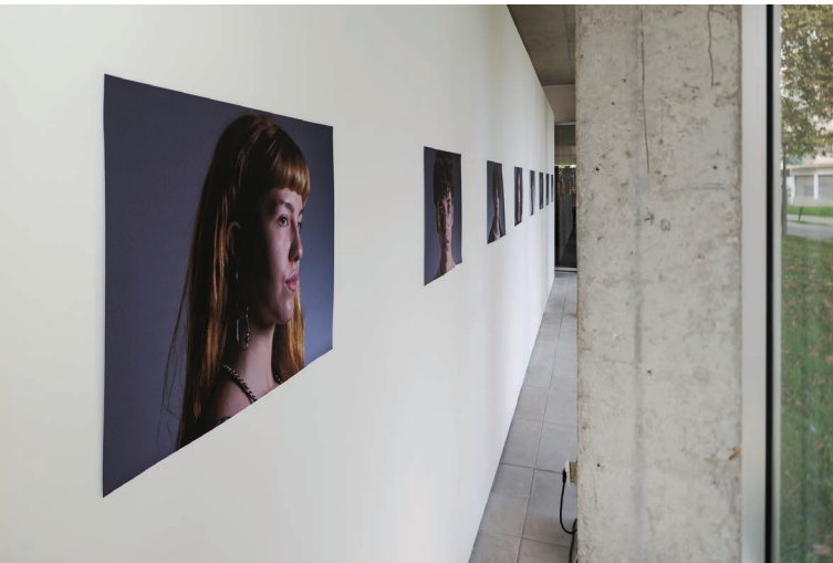
Alejandro Cesarco, video stills from Figuratively , 2021 Alejandro Cesarco-15.tiff