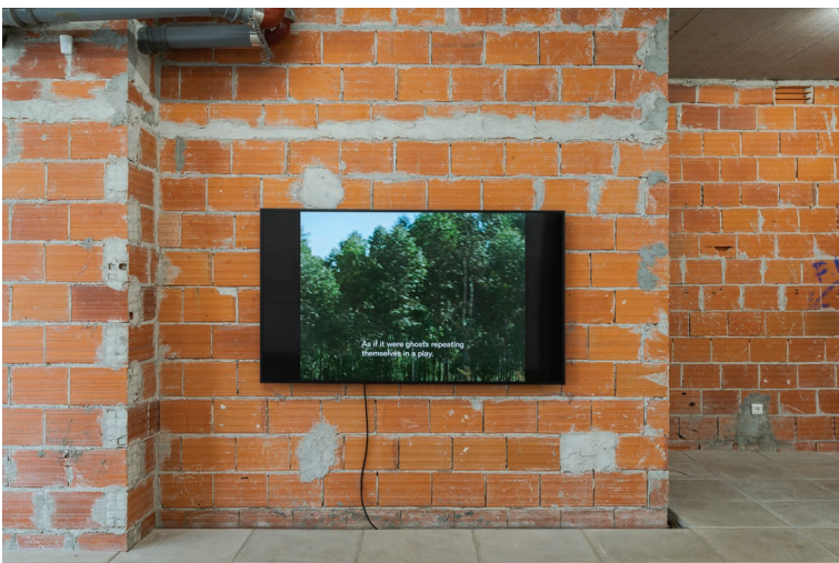
Alejandro Cesarco, Learning the Language (Present Continuous II) , 2018 Alejandro Cesarco-6.tiff