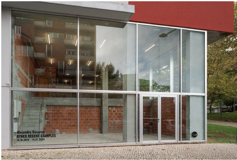
Alejandro Cesarco, Other Recent Examples , installation view, 2023