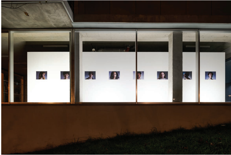
Alejandro Cesarco, video stills from Figuratively , 2021