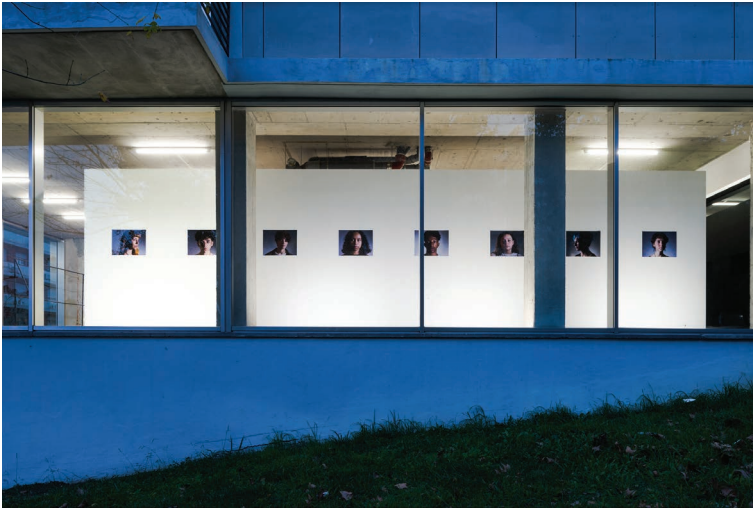
Alejandro Cesarco, video stills from Figuratively , 2021 Alejandro Cesarco-14.tiff