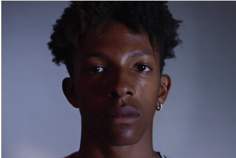
Alejandro Cesarco, video stills from Figuratively , 2021

© DMF. Courtesy of the artist and Maumaus/Lumiar Cité