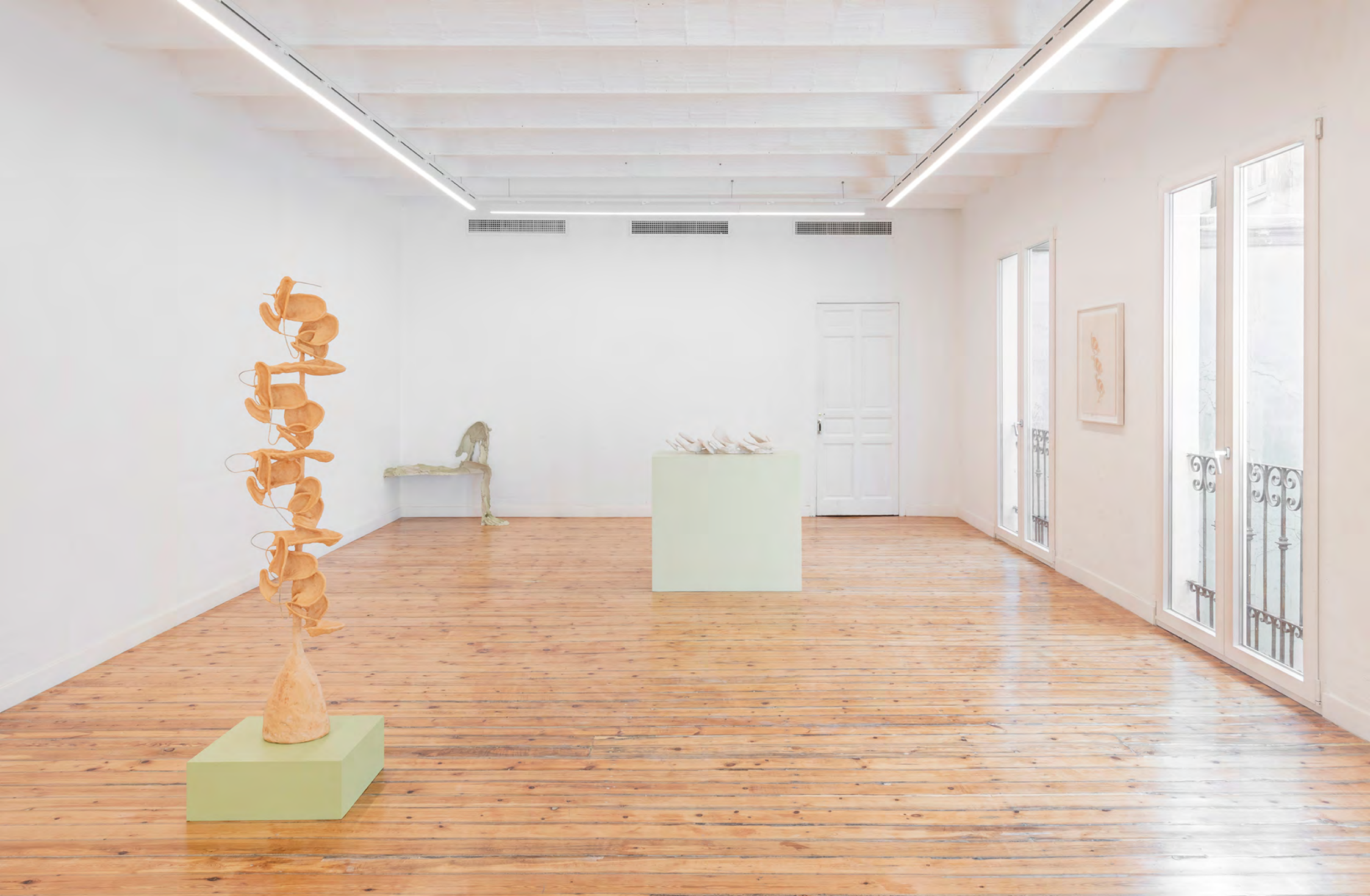
Installation view at NoguerasBlanchard Madrid