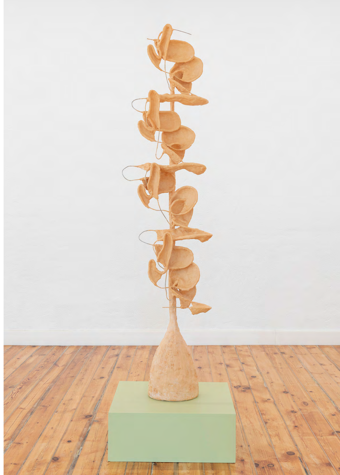
Juliana Cerqueira Leite Wash hands , 2023 Steel, plaster, jesmonite, pigment, wax 160 × 40 × 19 cm