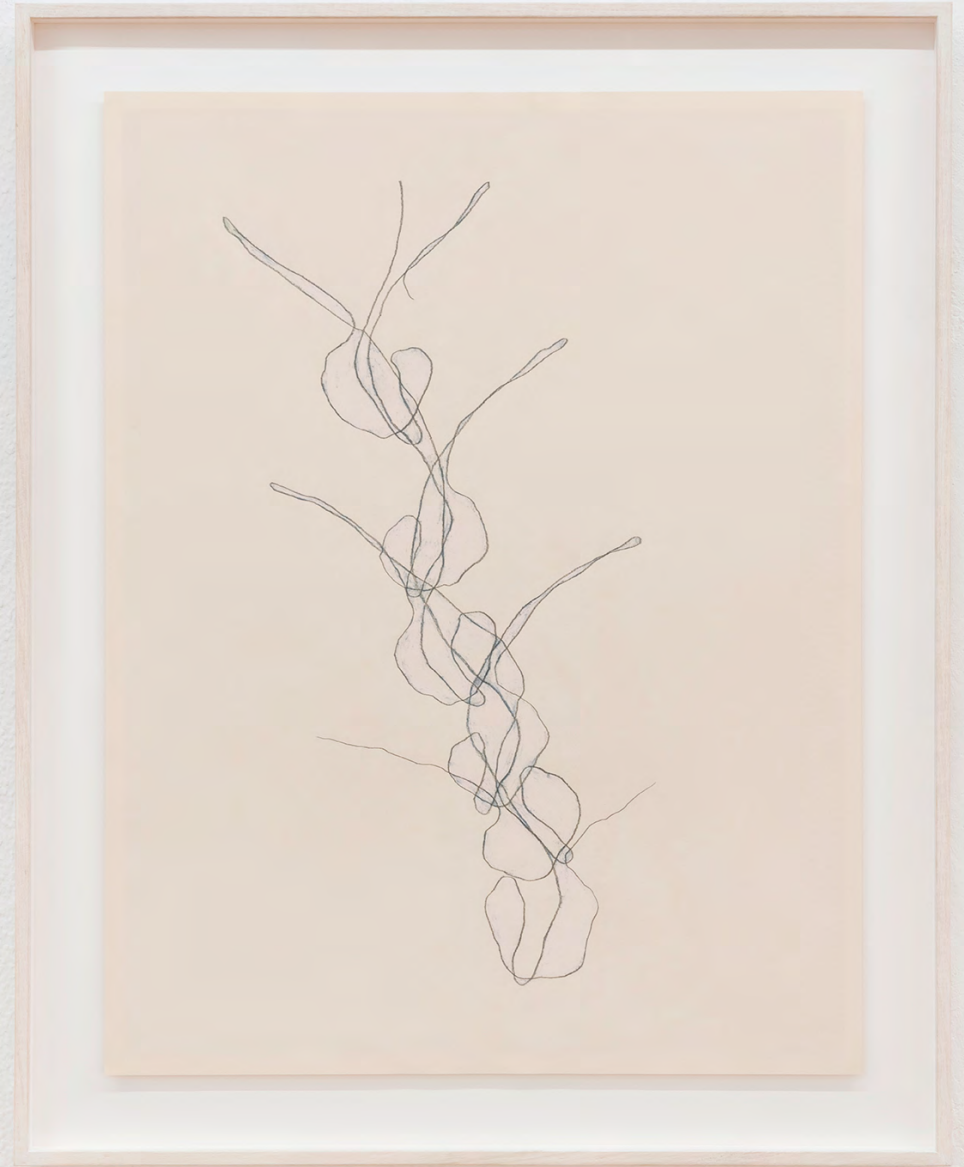
Juliana Cerqueira Leite Wash hands (quickly leaving thumbs dirty) 3, 2023 Graphite and colored Luminance pencil on paper 76,5 × 61,5 × 3,8 cm