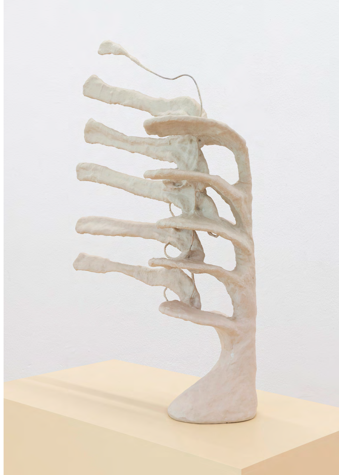
Juliana Cerqueira Leite Stir , 2023 Steel, plaster, jesmonite, pigment, wax 80,5 × 53 × 24 cm