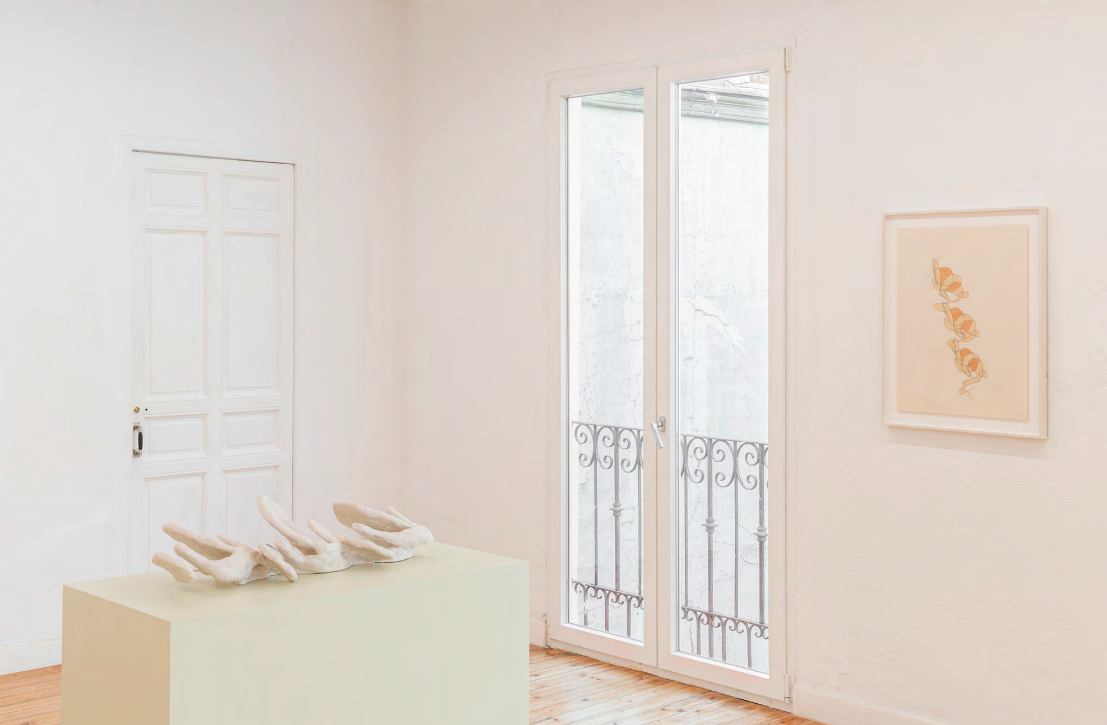
Installation view at NoguerasBlanchard Madrid