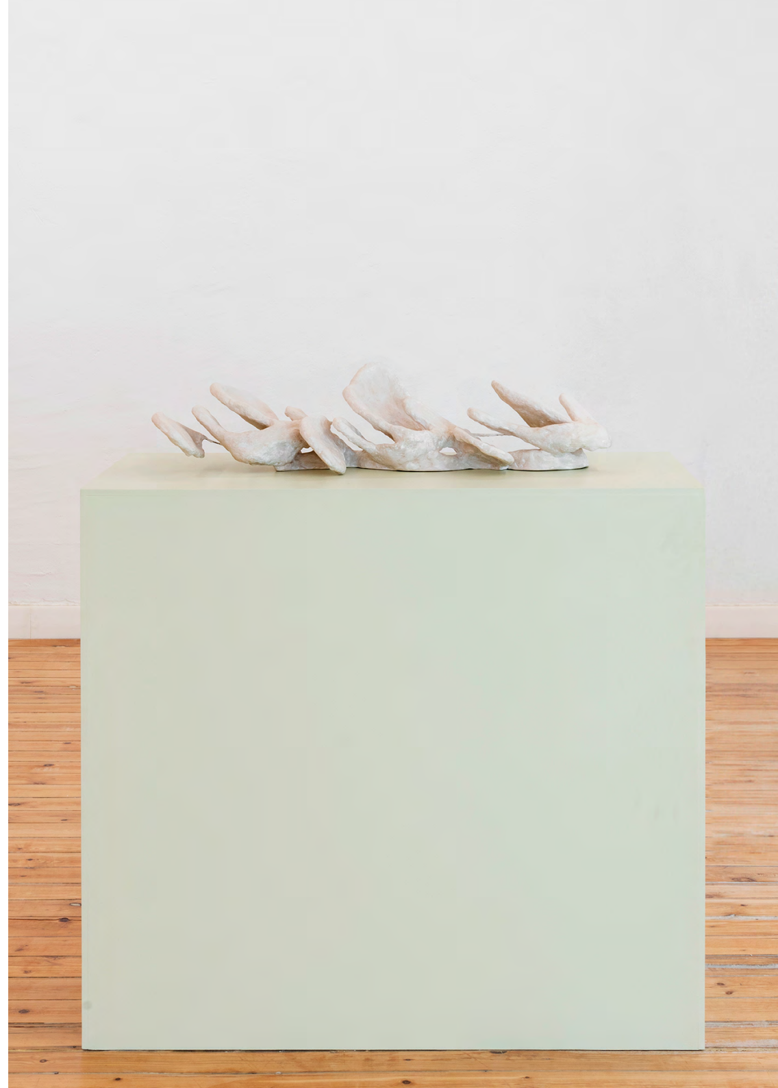
Juliana Cerqueira Leite Flip , 2023 Steel, plaster, jesmonite, pigment, wax 17,5 × 80 × 33 cm