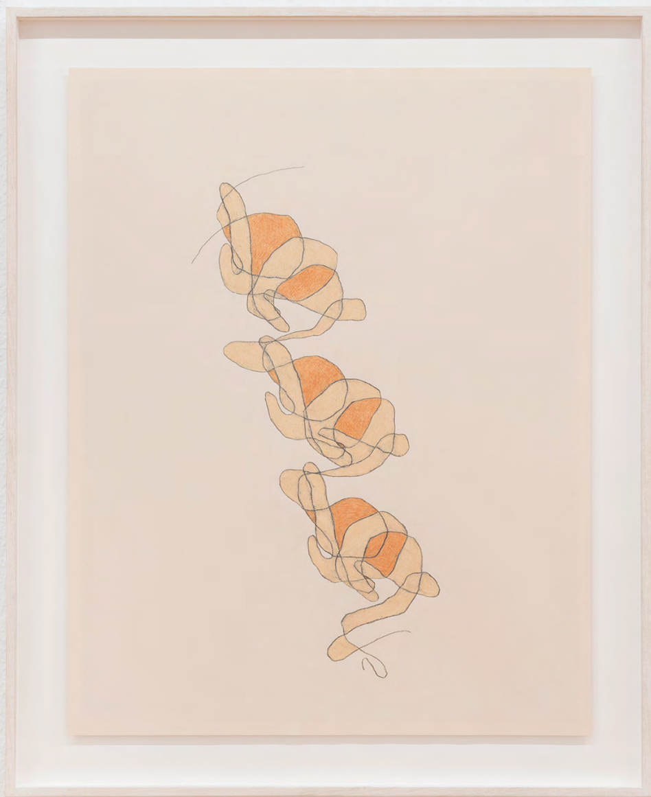
Juliana Cerqueira Leite Wash hands (or apply lotion) 2 , 2023 Graphite and colored Luminance pencil on paper 76,5 × 61,5 × 3,8 cm