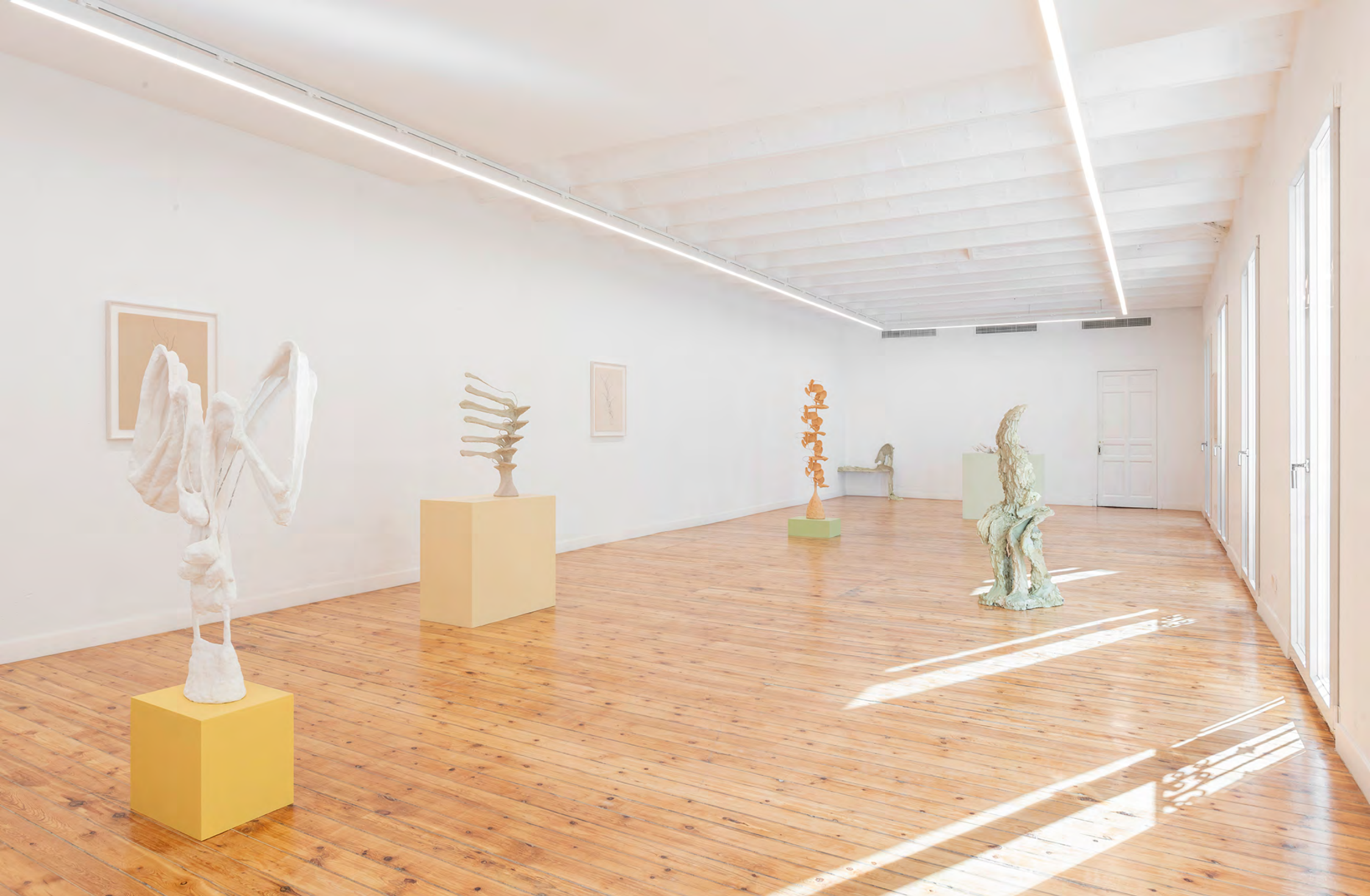
Installation view at NoguerasBlanchard Madrid