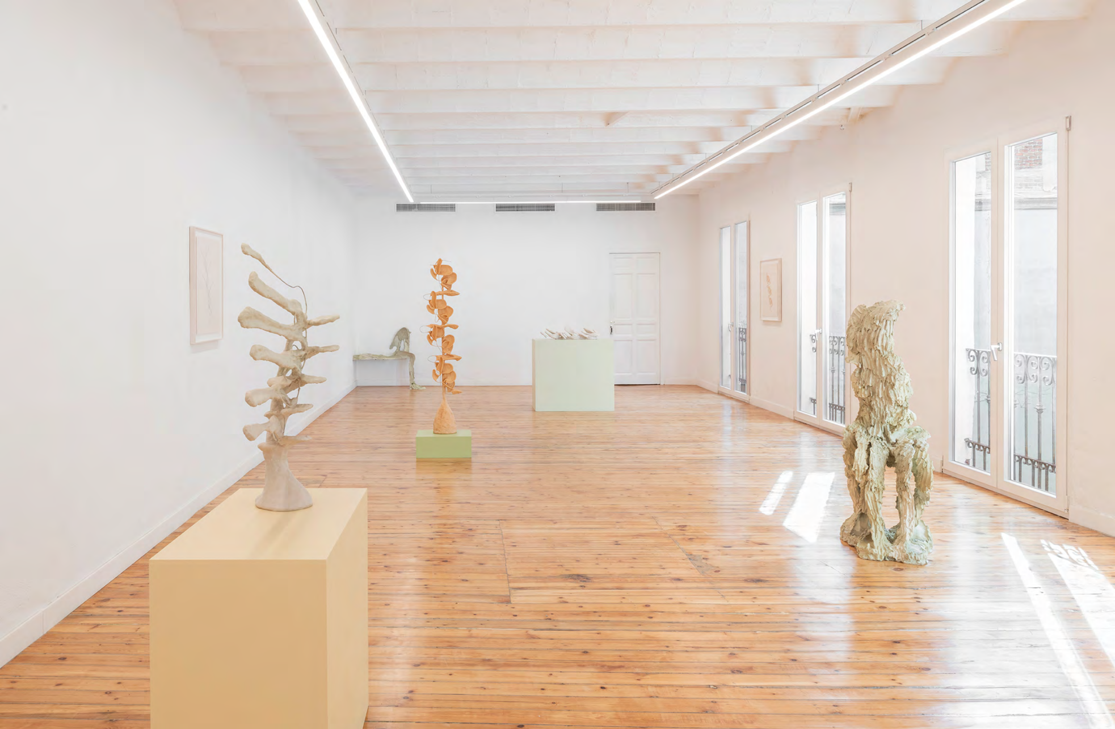
Installation view at NoguerasBlanchard Madrid