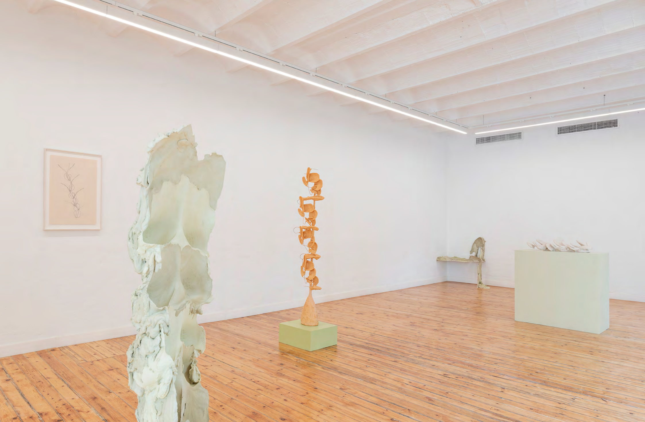
Installation view at NoguerrasBlanchard Madrid