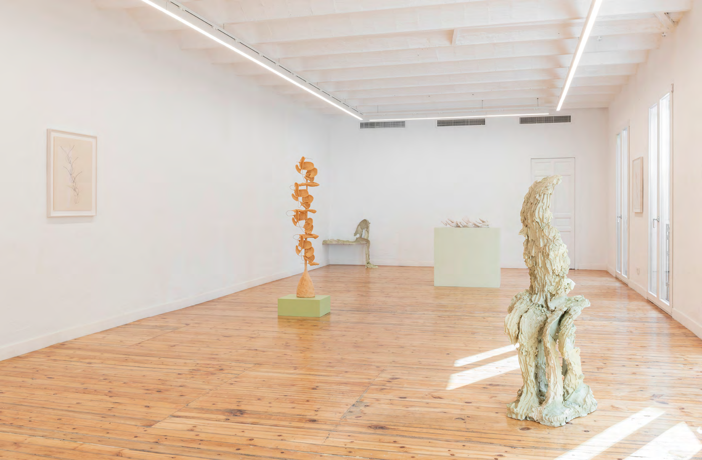
Installation view at NoguerasBlanchard Madrid