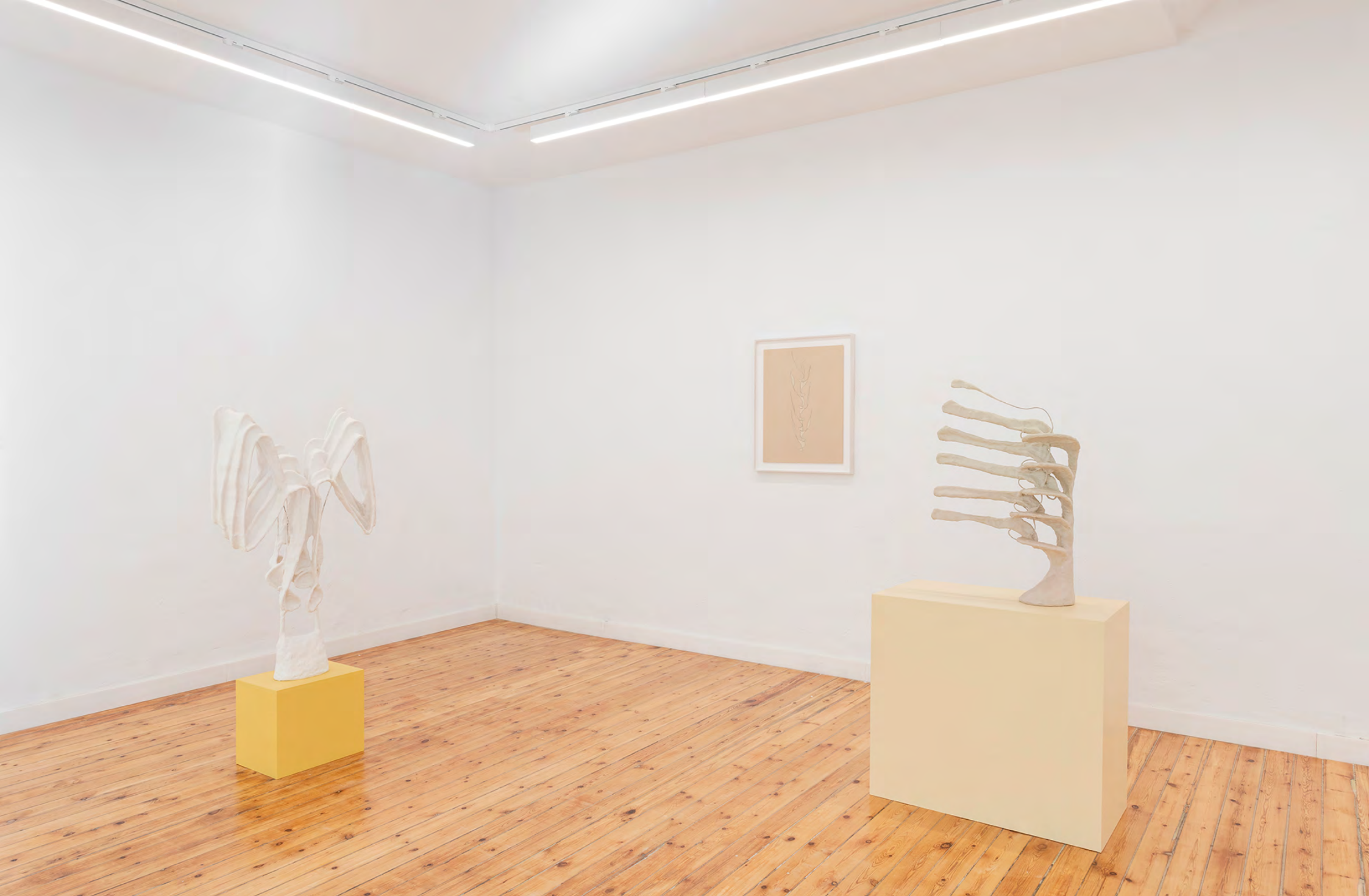
Installation view at NoguerasBlanchard Madrid