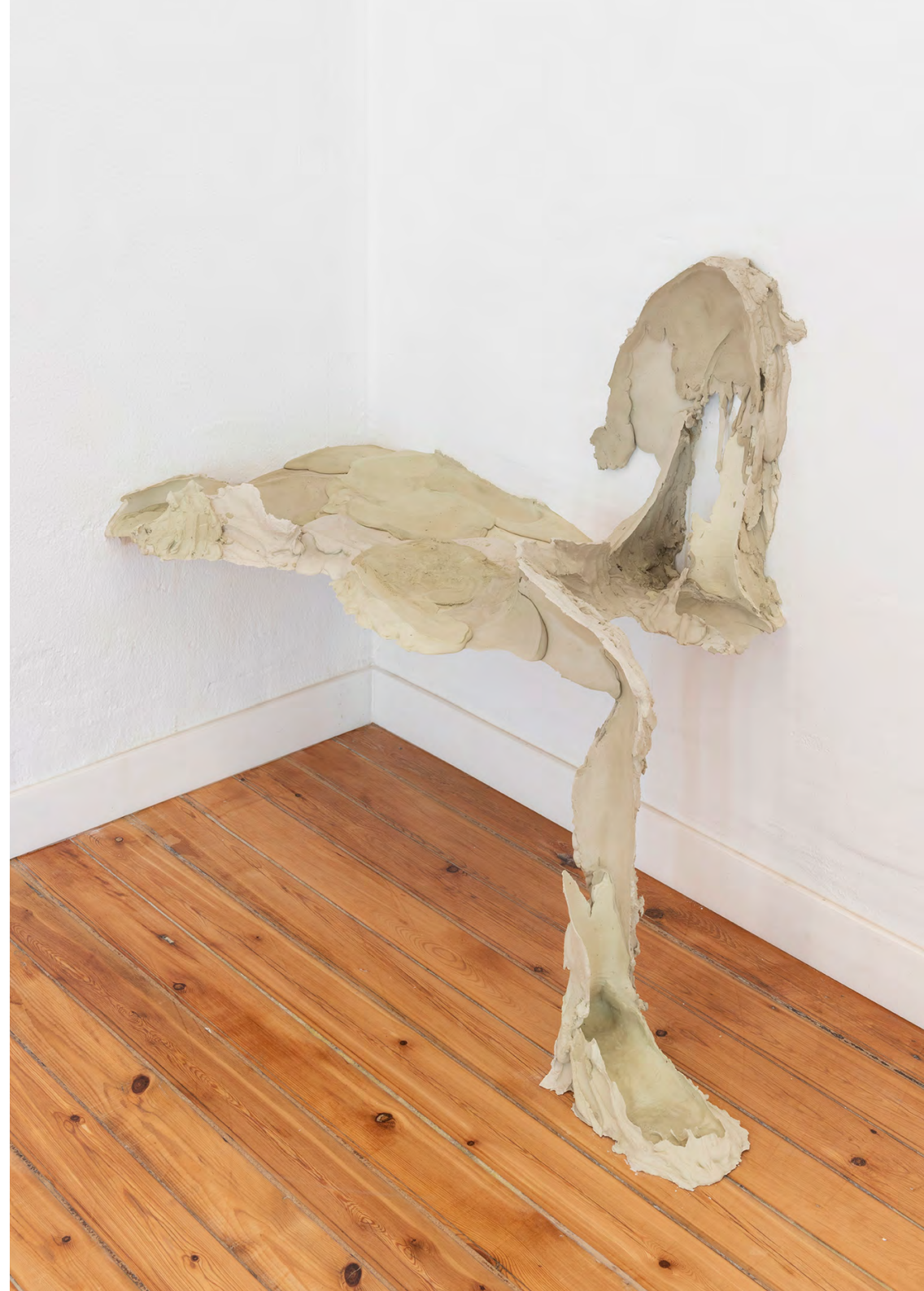
Juliana Cerqueira Leite Lay , 2023 CalCast 300 alpha plaster, stainless steel, aluminum, pigment and wax 96 × 117 × 53 cm