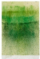
Izidora I LETHE blowout iv, 2023 Monotype (oil and pigment on paper) 121 x 80 cm