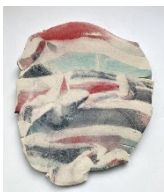
Andrea Heller Untitled, 2023 Monotype (pigment on ceramic) 27 x 23 x 1,5 cm