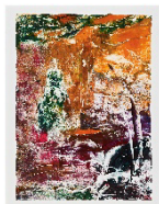
Rebekka Steiger Untitled, 2023 Monotype (oil on paper) 106 x 80 cm