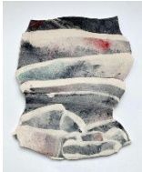
Andrea Heller Untitled, 2023 Monotype (pigment on ceramic) 26 x 23 x 1,5 cm