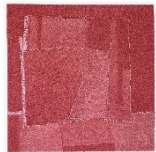
Cédric Eisenring Untitled, 2023 Monoprint (woodprint on velvet) 85 x 85 cm