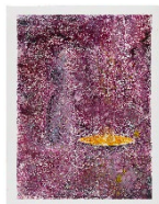
Rebekka Steiger Untitled, 2023 Monotype (oil on paper) 106 x 80 cm