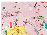
Charlotte Herzig Untitled, 2023 Monotype (oil on paper) 60 x 79 cm