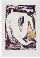
Ralph Bürgin salon nude II, 2023 Monotype (oil on paper) 117 x 80 cm