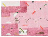
Charlotte Herzig Untitled, 2023 Monotype (oil on paper) 60 x 79 cm