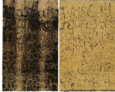
donna Kukama amidst all the uncertainty that came with darkness, the stars still recognised us as their own flesh, 2023 Monotype (oil on paper) Diptych: each 120 x 75 cm (total: 120 x 150 cm)