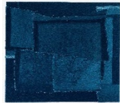
Cédric Eisenring Untitled, 2023 Monoprint (woodprint on velvet) 75 x 85 cm