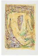
Ralph Bürgin salon nude III, 2023 Monotype (oil on paper) 117 x 80 cm