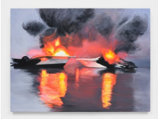
Lyndsey Marko Quiet Flight , 2023 oil on canvas 58 x 78 in 147.3 x 198.1 cm (LMa 003)