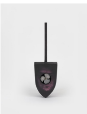
Nicholas Sullivan Iron Fan (color) , 2023 steel, charcoal, xerox on newsprint 15 1/2 x 6 x 4 1/2 in 39.4 x 15.2 x 11.4 cm (NSu 012)