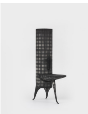
Nicholas Sullivan Plaid Stove Black and White , 2023 steel, charcoal, xerox on newsprint 23 x 13 x 5 in 58.4 x 33 x 12.7 cm (NSu 013)