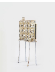
Nicholas Sullivan Rosette Stove , 2023 steel, paint 23 x 14 x 5 1/2 in 58.4 x 35.6 x 14 cm (NSu 009)