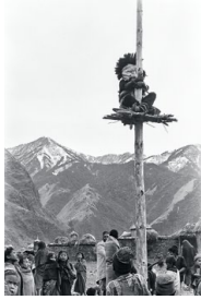
Michael Oppitz Final initiation act in solitude: blindfolded on elevated platform, 1978 silver gelatin print, 2021 42 x 28 cm Edition 3 + 1 AP MOP/F 1978/24_M