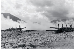
Michael Oppitz Bridge of hope, 1984 silver gelatin print, 2021 28 x 42 cm Edition 3 + 1 AP MOP/F 1984/05_M