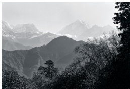
Michael Oppitz Approaching the border of fate, 1984 silver gelatin print, 2021 28 x 42 cm Edition 3 + 1 AP MOP/F 1984/09_M