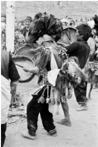
Michael Oppitz Wild dance around tree of ritual birth, 1978 silver gelatin print, 2021 60 x 40 cm Edition 3 + 1 AP MOP/F 1978/04_L