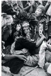
Michael Oppitz Neophyte with heart of ram and twig of life tree, 1978 silver gelatin print, 2021 42 x 28 cm Edition 3 + 1 AP MOP/F 1978/23_M