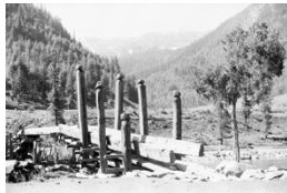
Michael Oppitz Log bridge over Uttar Ganga, 1984 silver gelatin print, 2021 28 x 42 cm Edition 3 + 1 AP MOP/F 1984/12_M