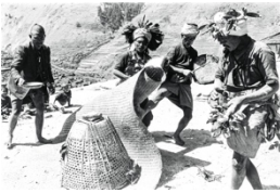
Michael Oppitz Looking for a fugitive soul under world mat, 1979 silver gelatin print, 2021 28 x 42 cm Edition 3 + 1 AP MOP/F 1979/02_M