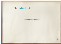
Marcel Broodthaers The Mind of vélo-club avis et Nouvelles, 1973 black and blue print on paper, stamp, inscribed 69.5 x 99 cm (framed: 74 x 104 cm) unique BRO/P 1973/03