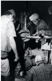
Michael Oppitz Frightening witches with the squeals of a pig, 1979 silver gelatin print, 2021 42 x 28 cm Edition 3 + 1 AP MOP/F 1979/01_M