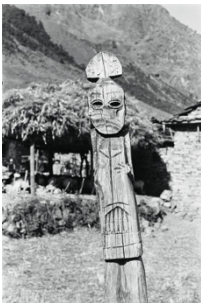
Michael Oppitz Village guardian carved in wood, 1982 silver gelatin print, 2021 42 x 28 cm Edition 3 + 1 AP MOP/F 1982/01_M