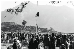
Michael Oppitz Villagers returning to tree of reincarnation, 1984 silver gelatin print, 2021 20 x 30 cm Edition 3 + 1 AP MOP/F 1984/18_S