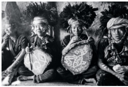
Michael Oppitz Shamans taking rest on porch of neophyte's house, 1984 silver gelatin print, 2021 40 x 60 cm Edition 3 + 1 AP MOP/F 1984/03_L