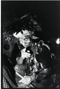
Michael Oppitz Diagnosis in sign language: nine days of danger, 1978 silver gelatin print, 2021 42 x 28 cm Edition 3 + 1 AP MOP/F 1978/14_M