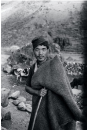
Michael Oppitz Shepherd wrapped in waterproof blanket, 1978 silver gelatin print, 2021 42 x 28 cm Edition 3 + 1 AP MOP/F 1978/11_M