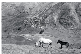
Michael Oppitz Taka, capital of the northern Magar, 1984 silver gelatin print, 2021 28 x 42 cm Edition 3 + 1 AP MOP/F 1984/06_M