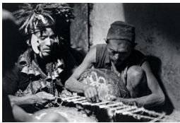
Michael Oppitz Constructing a rope ladder against malignant spirits, 1978 silver gelatin print, 2021 28 x 42 cm Edition 3 + 1 AP MOP/F 1978/15_M