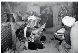
Michael Oppitz Anticipating dancer at the central post of the house, 1984 silver gelatin print, 2021 28 x 42 cm Edition 3 + 1 AP MOP/F 1984/08_M