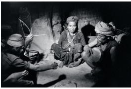
Michael Oppitz Bow and arrow as exorcist tools, 1979 silver gelatin print, 2021 28 x 42 cm Edition 3 + 1 AP MOP/F 1979/06_M