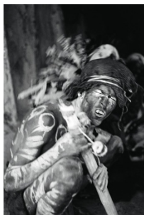
Michael Oppitz The Dumb Dog, genius of obscenities, 1978 silver gelatin print, 2021 42 x 28 cm Edition 3 + 1 AP MOP/F 1978/09_M