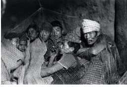
Michael Oppitz Fishing net protecting clan-members against spirit attack, 1978 silver gelatin print, 2021 40 x 60 cm Edition 3 + 1 AP MOP/F 1978/03_L