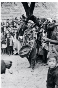
Michael Oppitz Master guru catching twig of life tree for pupil, 1978 silver gelatin print, 2021 42 x 28 cm Edition 3 + 1 AP MOP/F 1978/22_M