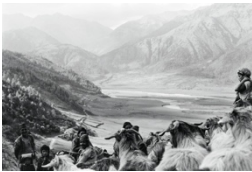
Michael Oppitz Summer migration to alpine pastures, 1981 silver gelatin print, 2021 28 x 42 cm Edition 3 + 1 AP MOP/F 1981/01_M