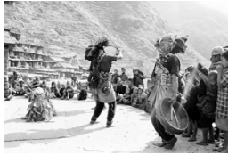
Michael Oppitz Shamans looking out for soul robbers near mat, 1984 silver gelatin print, 2021 40 x 60 cm Edition 3 + 1 AP MOP/F 1984/01_L