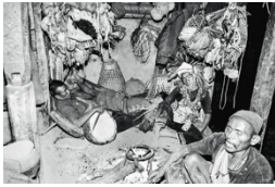
Michael Oppitz Dozing shamans in long-night séance, 1984 silver gelatin print, 2021 40 x 60 cm Edition 3 + 1 AP MOP/F 1984/02_L