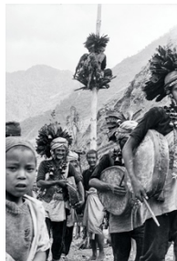
Michael Oppitz Guild of shamans abandoning neophyte for solitary ritual birth, 1981 silver gelatin print, 2021 42 x 28 cm Edition 3 + 1 AP MOP/F 1981/04_M