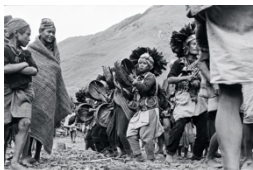
Michael Oppitz Phalanx of shamans dancing to tree of life, 1978 silver gelatin print, 2021 28 x 42 cm Edition 3 + 1 AP MOP/F 1978/19_M