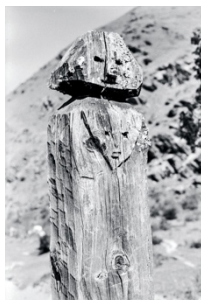
Michael Oppitz Double-faced bridge post, 1984 silver gelatin print, 2021 42 x 28 cm Edition 3 + 1 AP MOP/F 1984/10_M