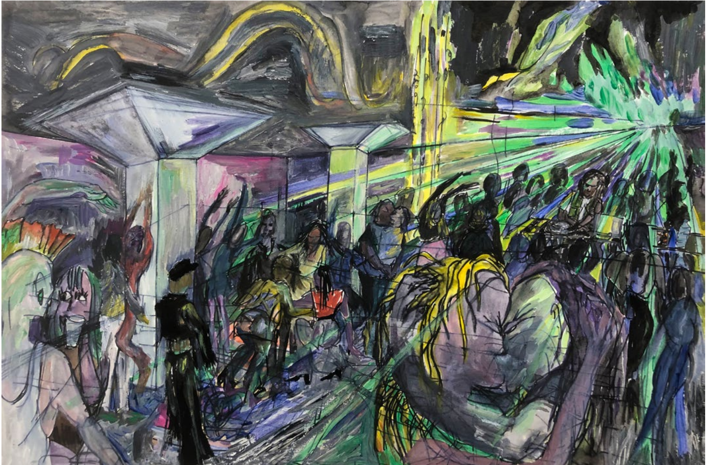
Basel Social CLUB, 2023 Watercolour on paper, clip frame 33,5 × 50 cm