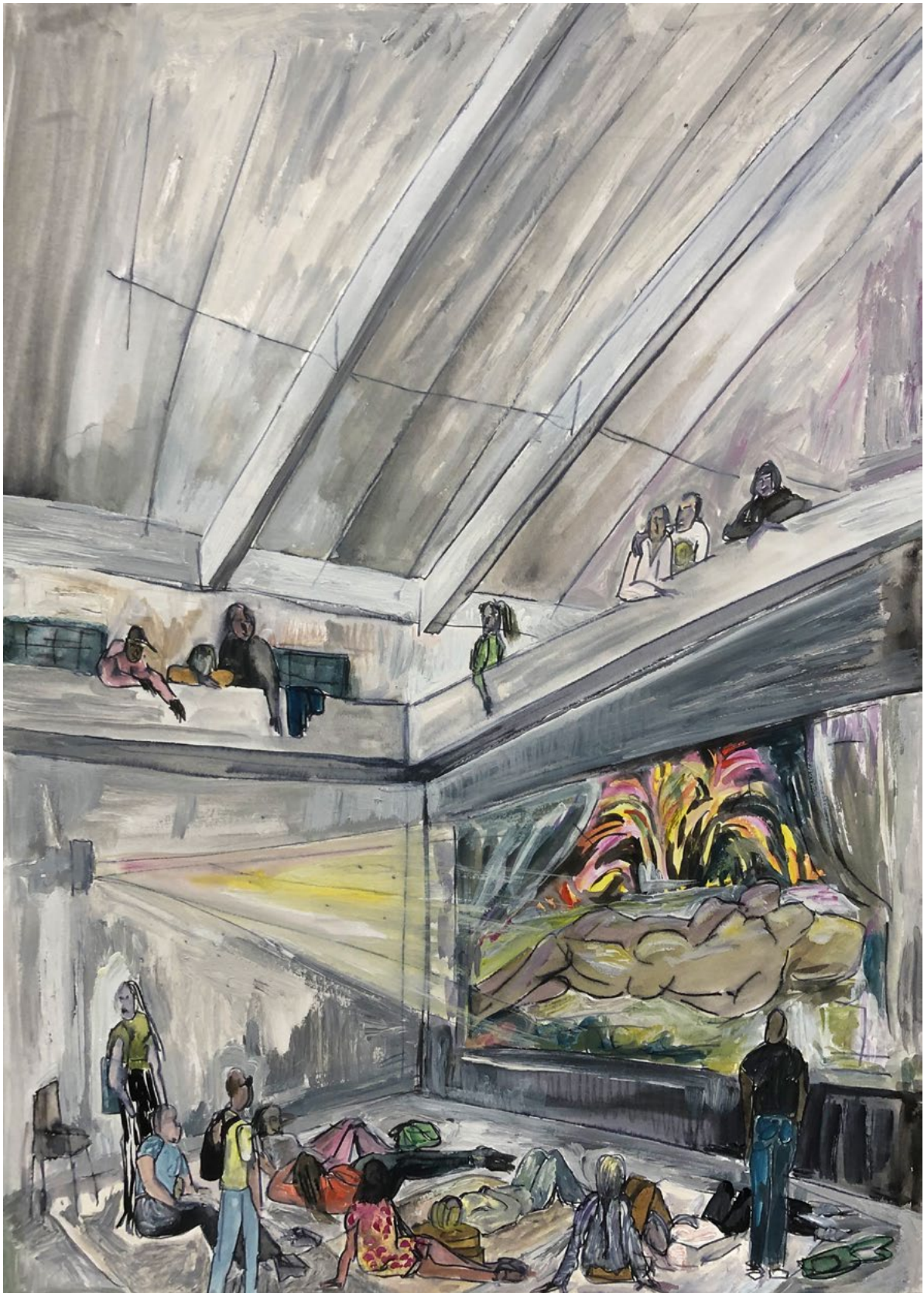
Basel Social Club Cinema, 2023 Watercolour on paper, clip frame 37 x 50 cm