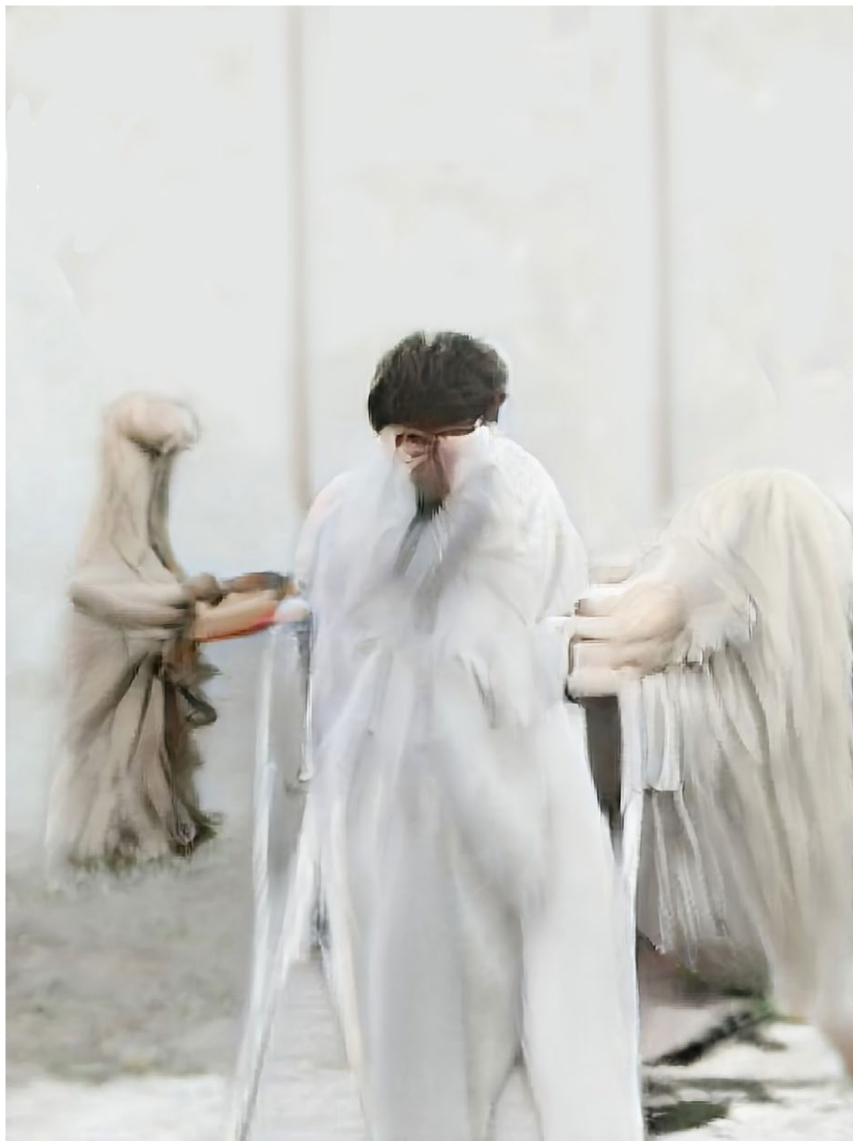
Visibility (In Pale Clothing And With Gesturing Arms), 2022