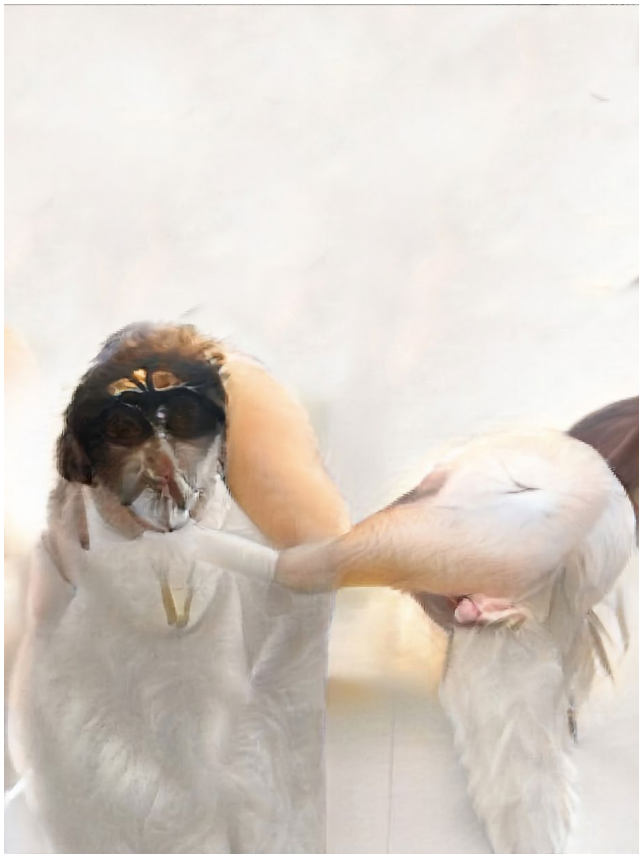
Complex Visibility (In Pale Clothing) , 2022 Printed velvet on stretcher 120 × 91,5 cm; 47 3/8 × 36 in.