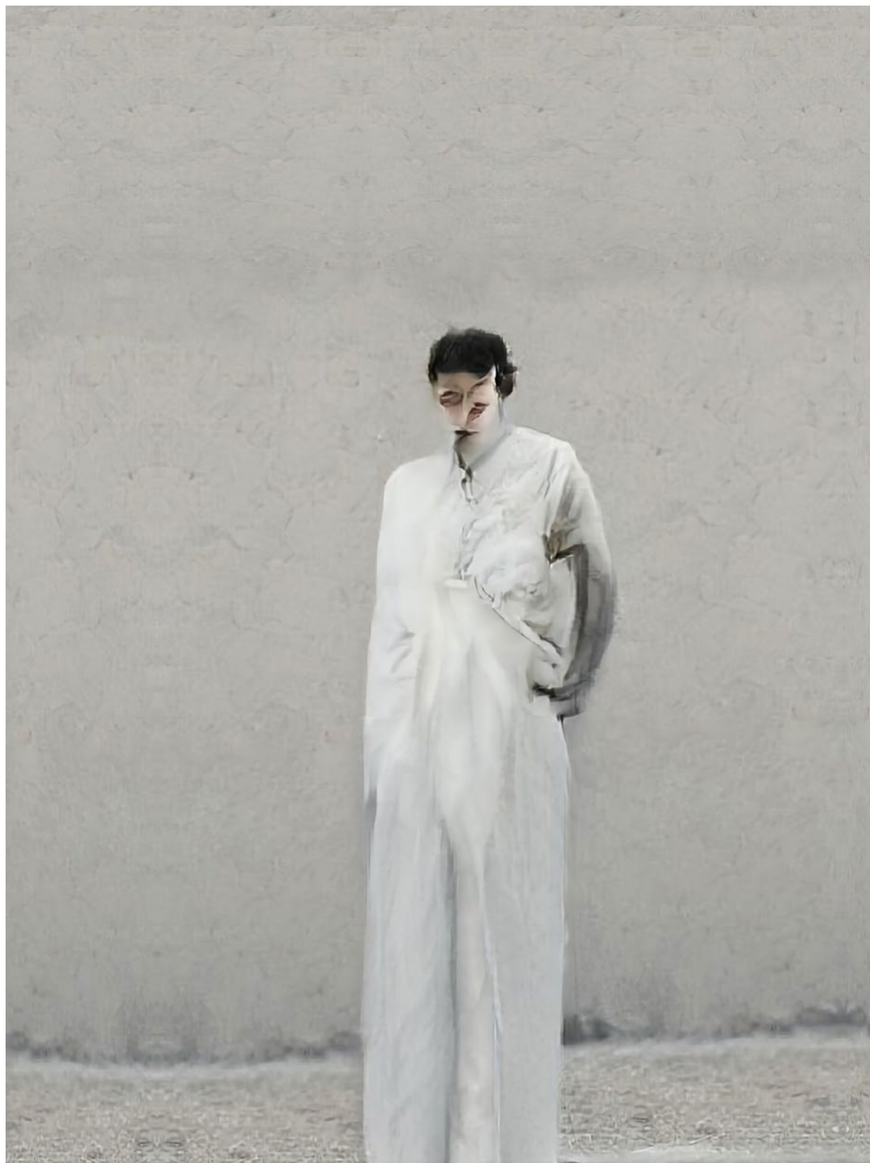
Semi Straightforward Visibility (In Pale Clothing And On Grey Background) , 2022 Printed velvet on stretcher 120 × 91,5 cm; 47 3/8 × 36 in.