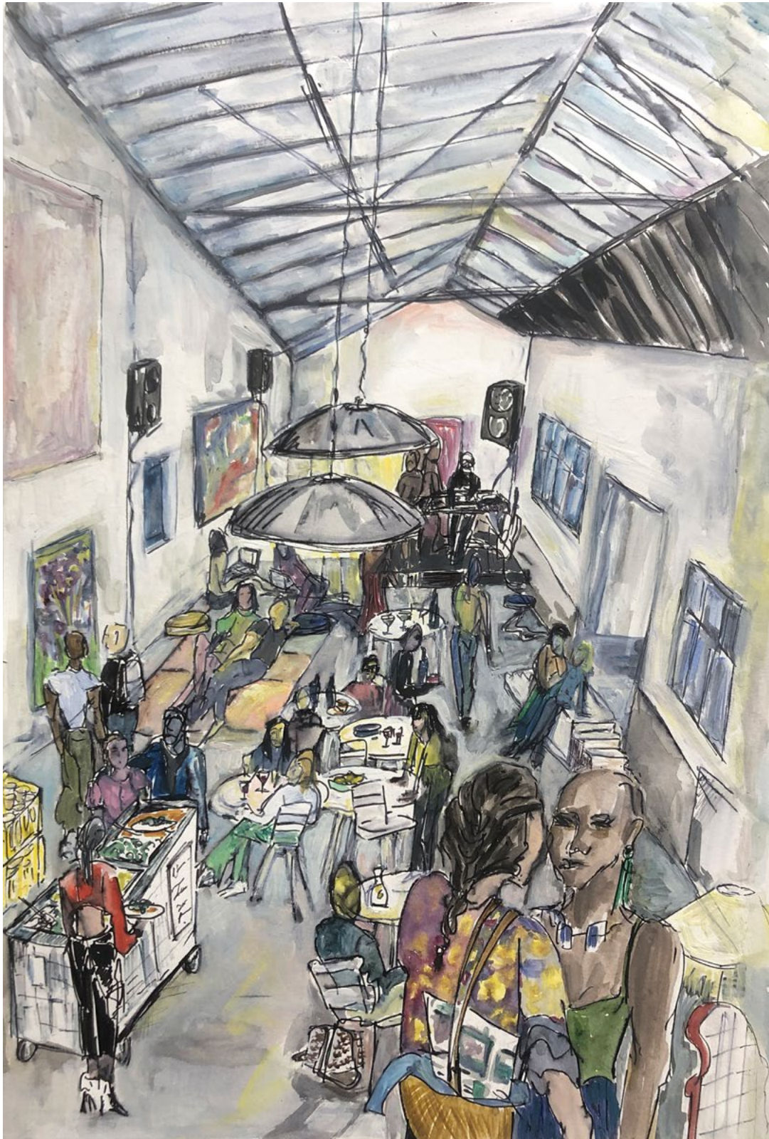
Basel Social Club Advertising, 2023 Watercolour on paper, clip frame 33,5 × 50 cm