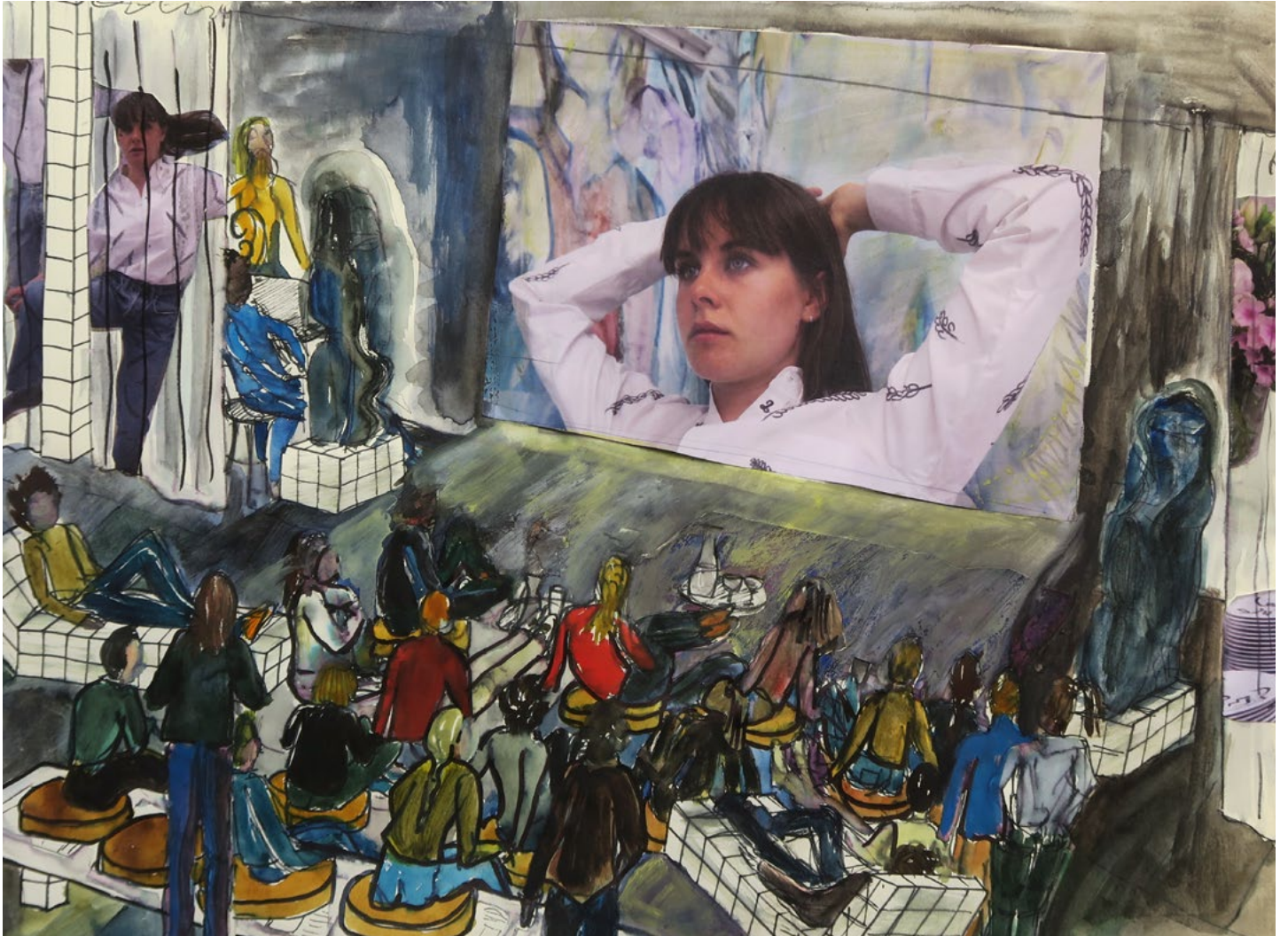
Environment Studies 5, 2017 Watercolour and collage on paper, clip frame 40,5 × 29,5 cm