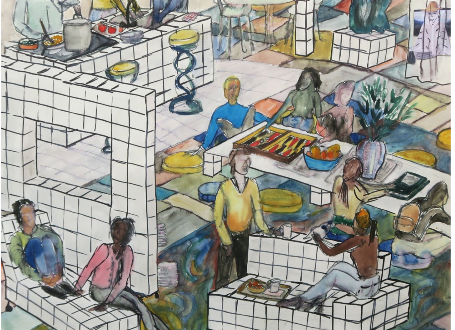
Environment Studies 3, 2017 Watercolour and collage on paper, clip frame 40,5 × 29,5 cm