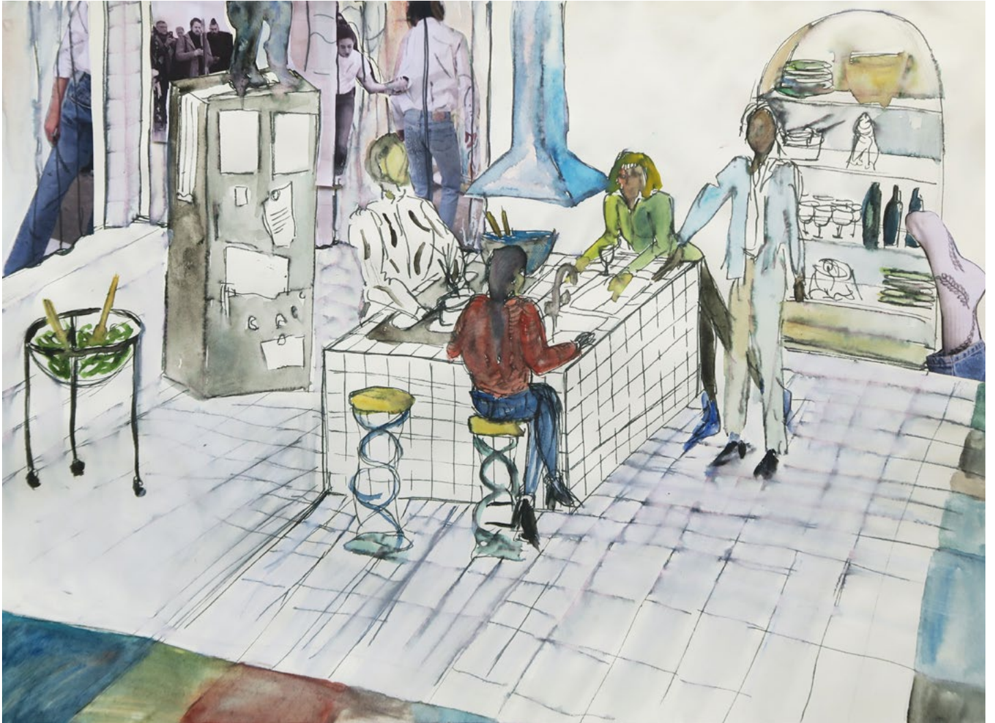
Environment Studies 2, 2017 Watercolour and collage on paper, clip frame 40,5 × 29,5 cm