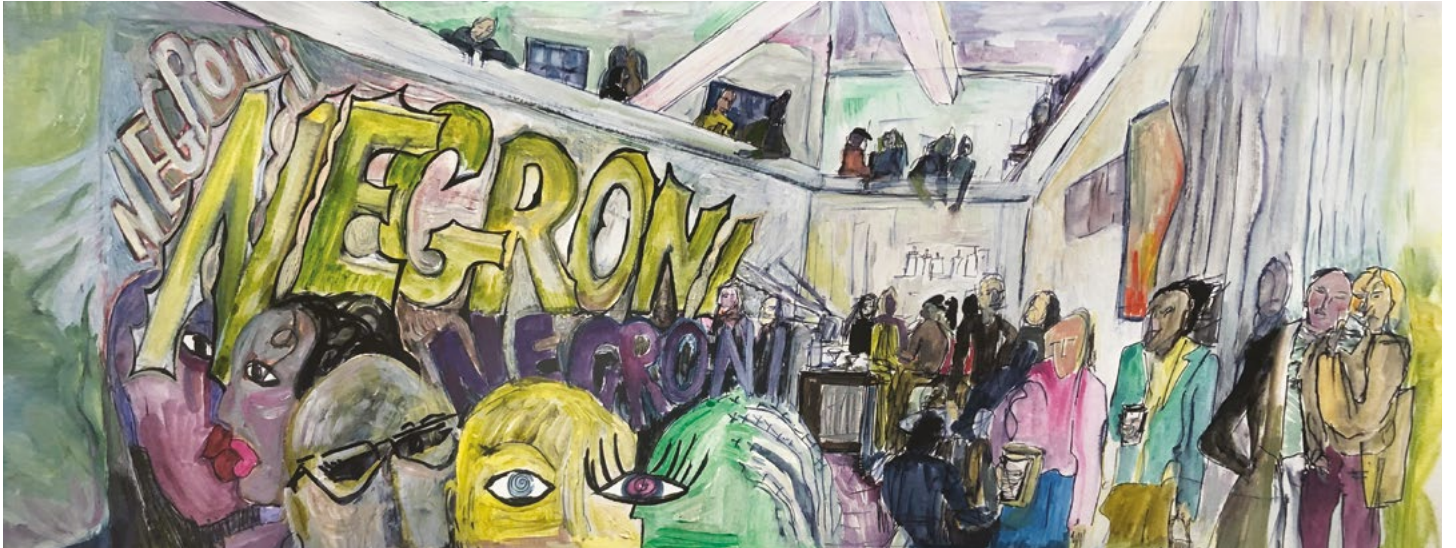
Basel Social Club Negroni Label, 2023 Watercolour on paper, clip frame 63 × 27,5 cm