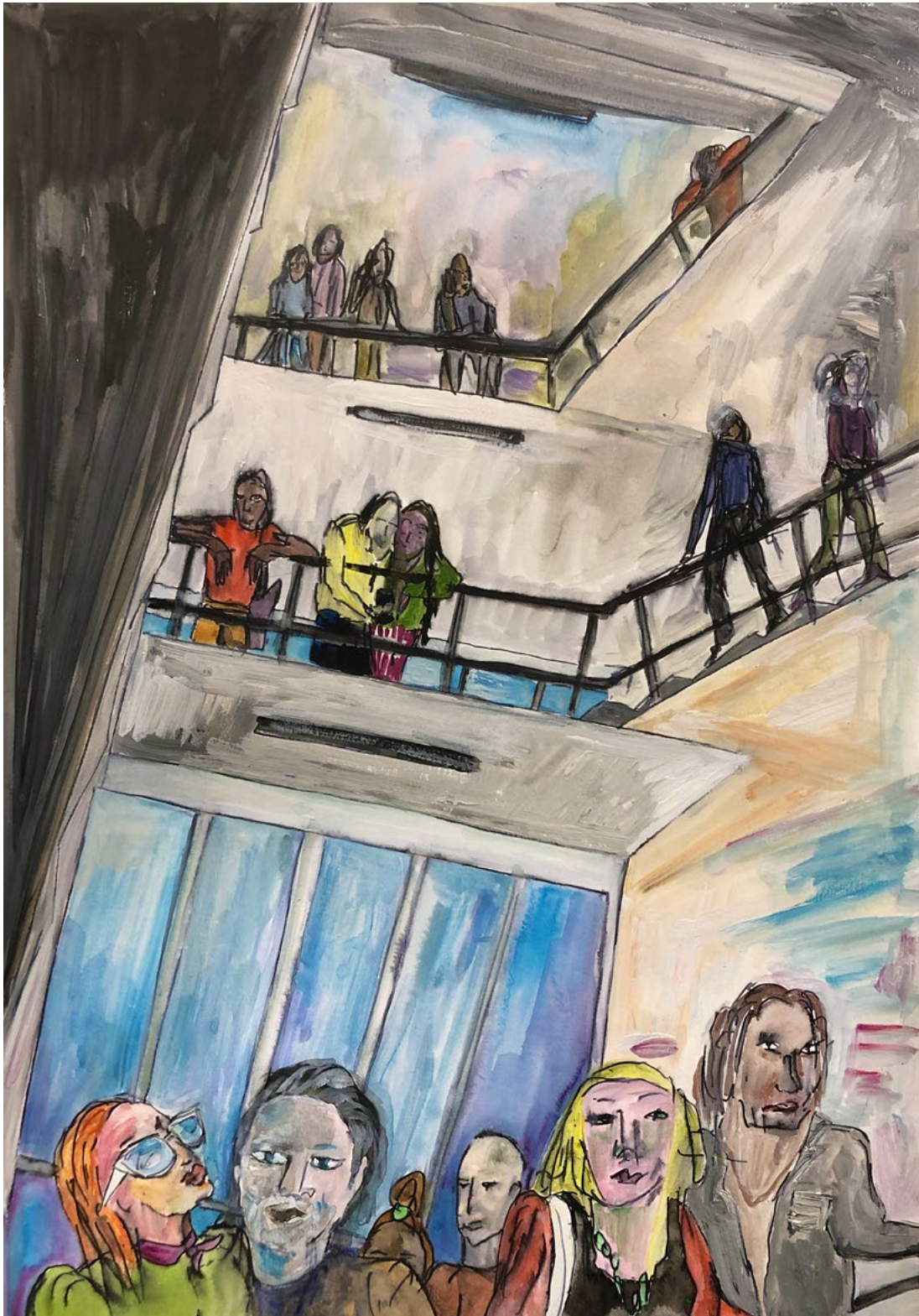
Basel Social Club Mayonnaise Stairwell, 2023 Watercolour on paper, clip frame 35,5 × 50 cm