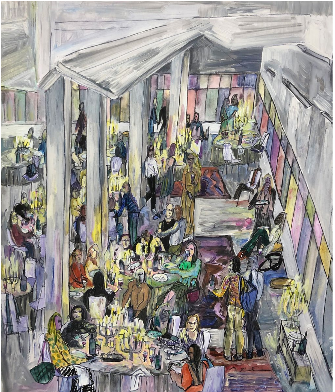
Basel Social Club Menu, 2023 Watercolour on paper, clip frame 42 x 50 cm