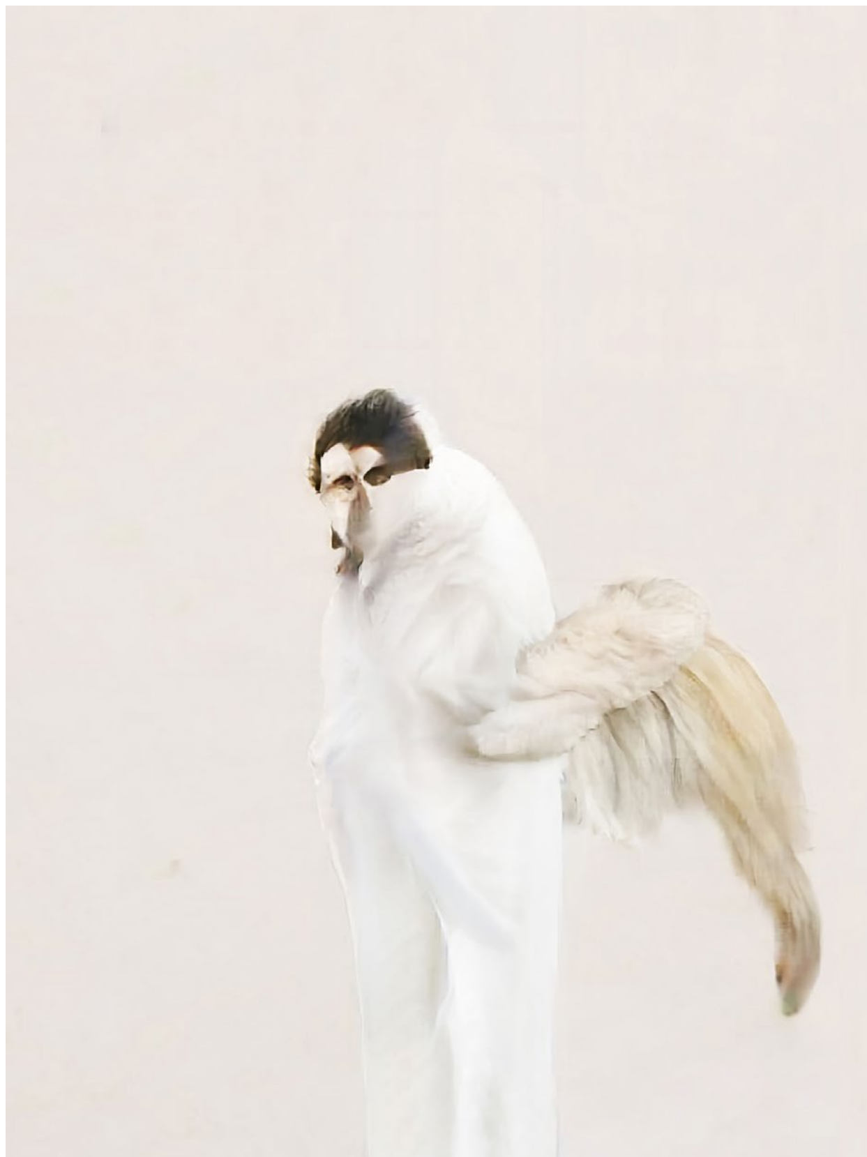
Owlsh Visibility (In Pale Clothing) , 2022 Printed velvet on stretcher 120 × 91,5 cm; 47 3/8 × 36 in.