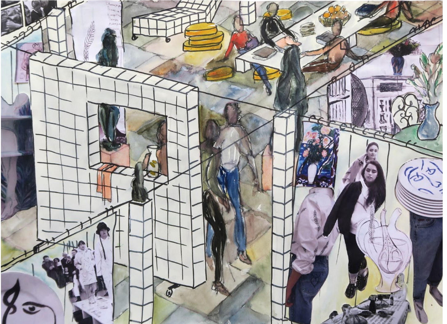
Environment Studies 4, 2017 Watercolour and collage on paper, clip frame 40,5 × 29,5 cm