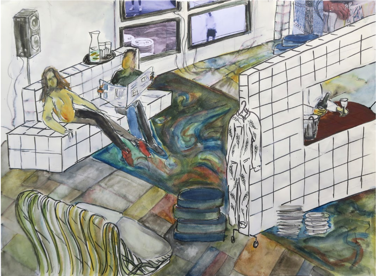
Environment Studies 1, 2017 Watercolour and collage on paper, clip frame 40,5 × 29,5 cm