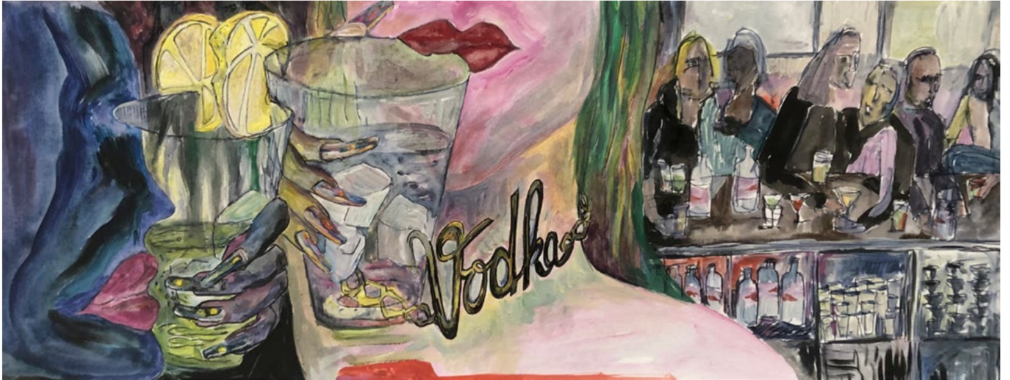
Basel Social Club Vodka Label, 2023 Watercolour on paper, clip frame 52,5 × 21,7 cm