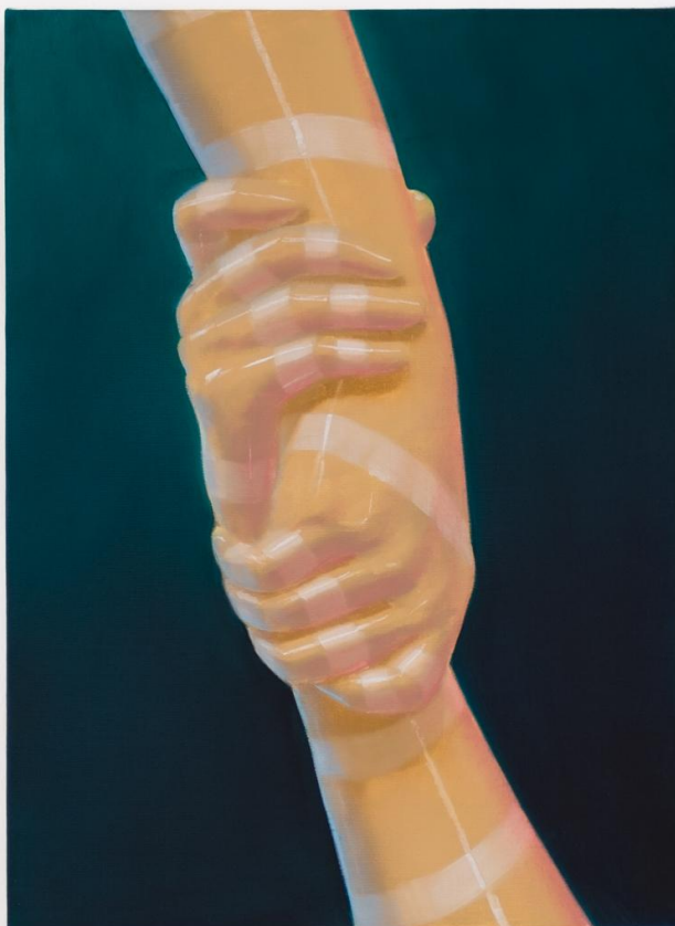
HAMPUS BALANZO WERNEMYR Extension 2023 Olja på duk 42,5 x 31,5cm Signerad a verso