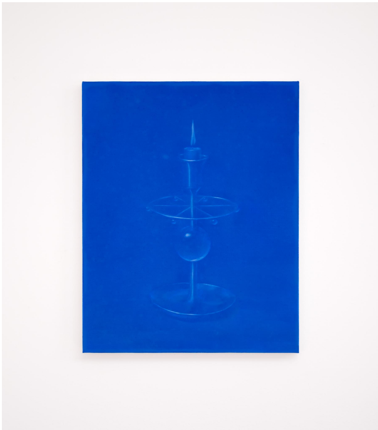
HAMPUS BALANZO WERNEMYR Blue Light 2023 Olja på duk 55,5 x 44,5cm Signerad a verso