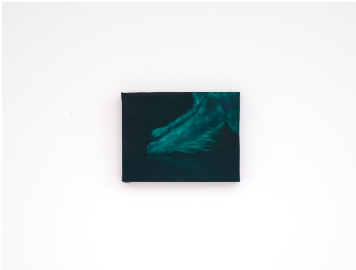
HAMPUS BALANZO WERNEMYR Kitten Paws 2023 Olja på duk 19 x 24,8cm Signerad a verso