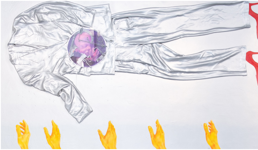
ZOE BARCZA Free Real Estate , 2021 Mixed media 120×200cm