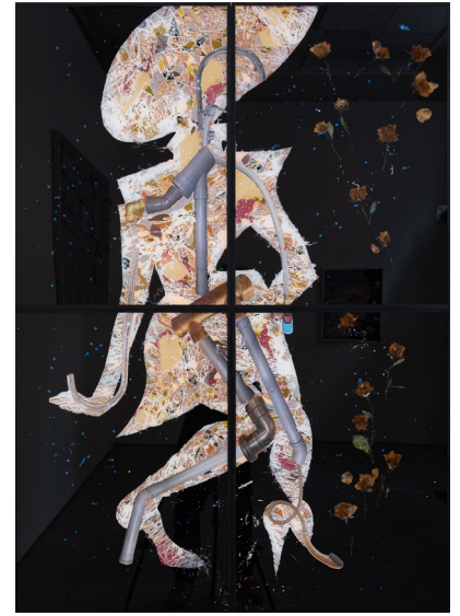
ZOE BARCZA Effluent Macarena , 2021 Acrylic, enamel, collage, glitter, sequins, and roses on plexiglass 140×100cm