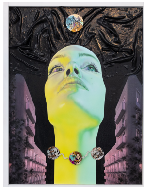
ZOE BARCZA Glam Hat 2 , 2021 Mixed media, artist's frame 85×65cm