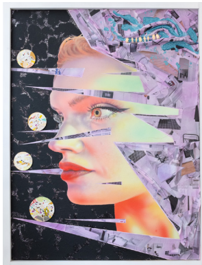
ZOE BARCZA Glam Hat 1 , 2021 Mixed media, artist's frame