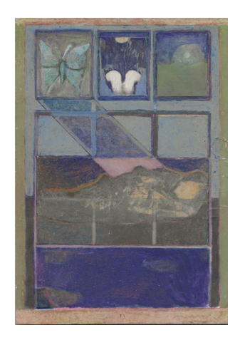
HENNING HAMILTON <u>Moonlight Sonata</u>, 2022 Oil pastel and paper collage on wood, artist's frame 24×17×2 cm