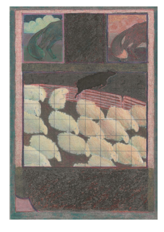
HENNING HAMILTON <u>Sheperd's paj</u>, 2022 Oil pastel and paper collage on wood, artist's frame 24×17×2 cm