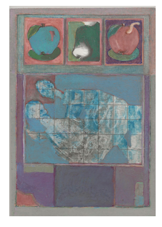
HENNING HAMILTON <u>Bad Apple</u>, 2022 Oil pastel and paper collage on wood, artist's frame 24×17×2 cm