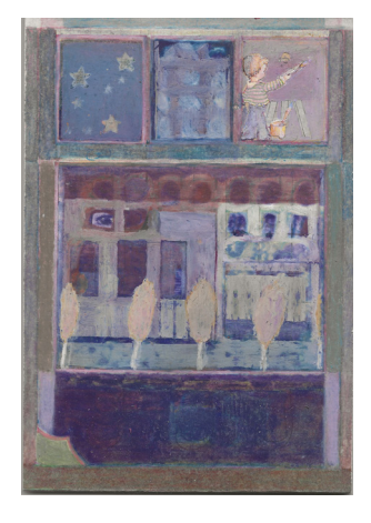
HENNING HAMILTON <u>Young Emerging</u> <u>@ Christophe van</u> <u>de Loo</u>, 2022 Oil pastel and paper collage on wood, artist's frame 24×17×2 cm