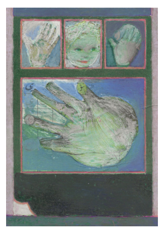
HENNING HAMILTON <u>kupande hjärta</u>, 2022 Oil pastel and paper collage on wood, artist's frame 24×17×2 cm