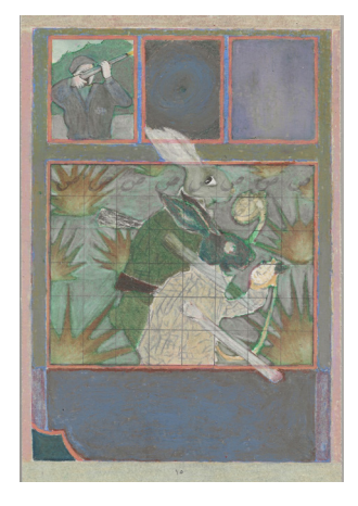
HENNING HAMILTON <u>Maelstrom</u>, 2022 Oil pastel and paper collage on wood, artist's frame 24×17×2 cm