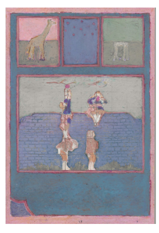
HENNING HAMILTON Dr.Evolution, 2022 Oil pastel and paper collage on wood, artist's frame 24×17×2 cm