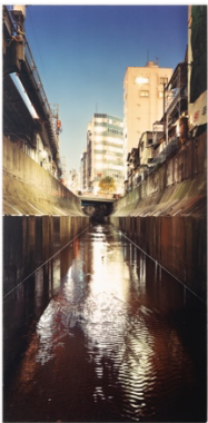
Naoya Hatakeyama River Series, No. 6, 1993/1994 Edition 12/15 C-Print, signed 54 x 26.5 cm