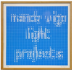
Nanda Vigo Light projects, 1971 Color lithography, framed 50 x 50 cm Edition 206/250, signed