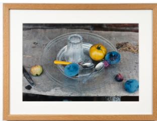
Wolfgang Tillmans August, 2002 C-Print, framed, signed 30 x 40 cm