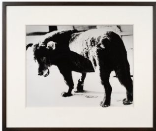
Daido Muryama Stray Dog, 2005 Gelatin Silver Print, framed, signed 40 x 50 cm