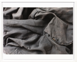
Wolfgang Tillmans Faltenwurf (BW) I, 2011 Inkjet mounted aluminum in artist's frame 61.9 x 76.4 x 3.3 cm Edition 3 + 1 AP