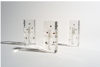
Anicka Yi Biography Line, 2019

Shigenobu Twilight Acrylic and sealed-in ladybugs