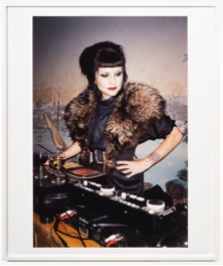
Wolfgang Tillmans Princess Julia Berlin, 2010 C-Print 61 x 50.8 cm Edition 3 + 1 AP