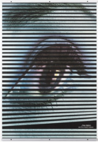
Makoto Nakamura (design) / Noriaki Yokosuka (photography) Poster for Shiseido Institute of Beauty Sciences, 1991 Reproduction, framed 99 x 69 cm