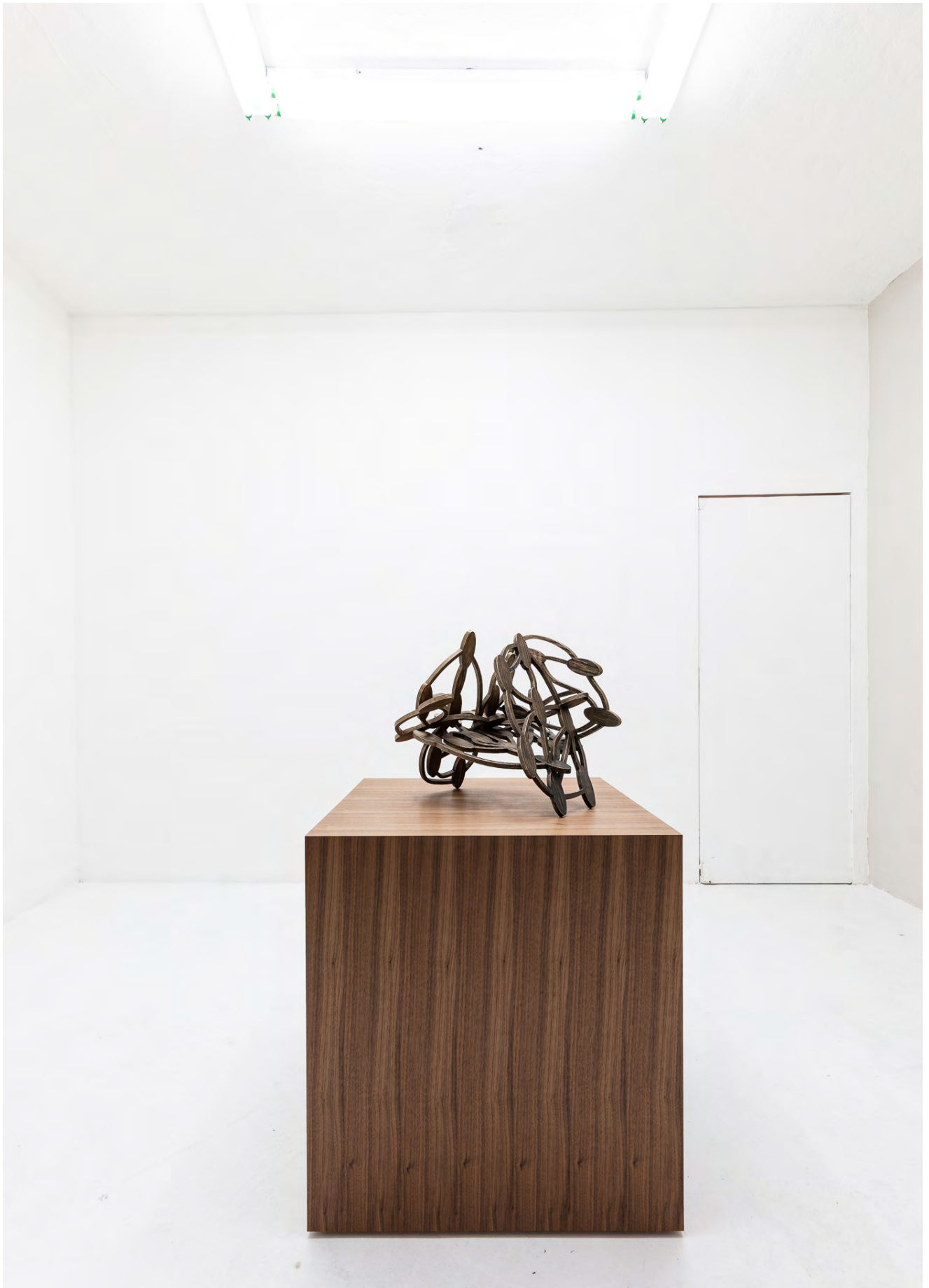
Kyle Thurman, Dream Police , 2023 (Installation View)