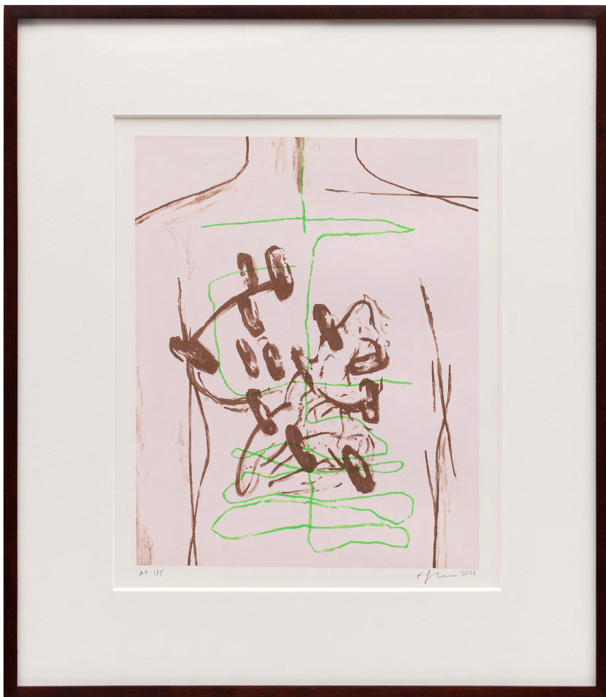
Torso with Crown, 2021 3-color lithograph on paper in artist's frame Image size: 15 x 12 inches Paper size: 22 x 18 ½ inches Frame size: 23 ½ x 20 ½ inches