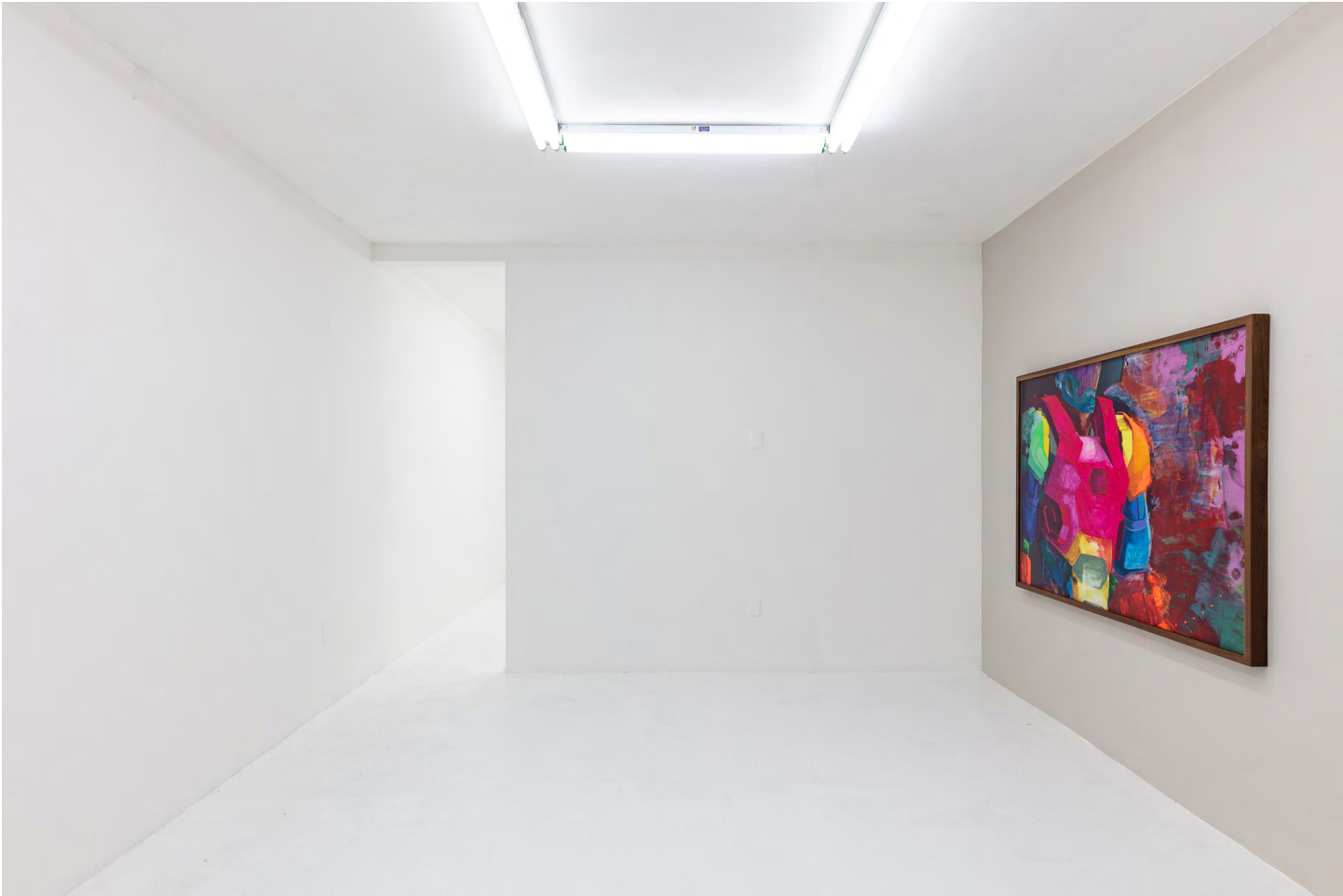
Kyle Thurman, Dream Police , 2023 (Installation View)