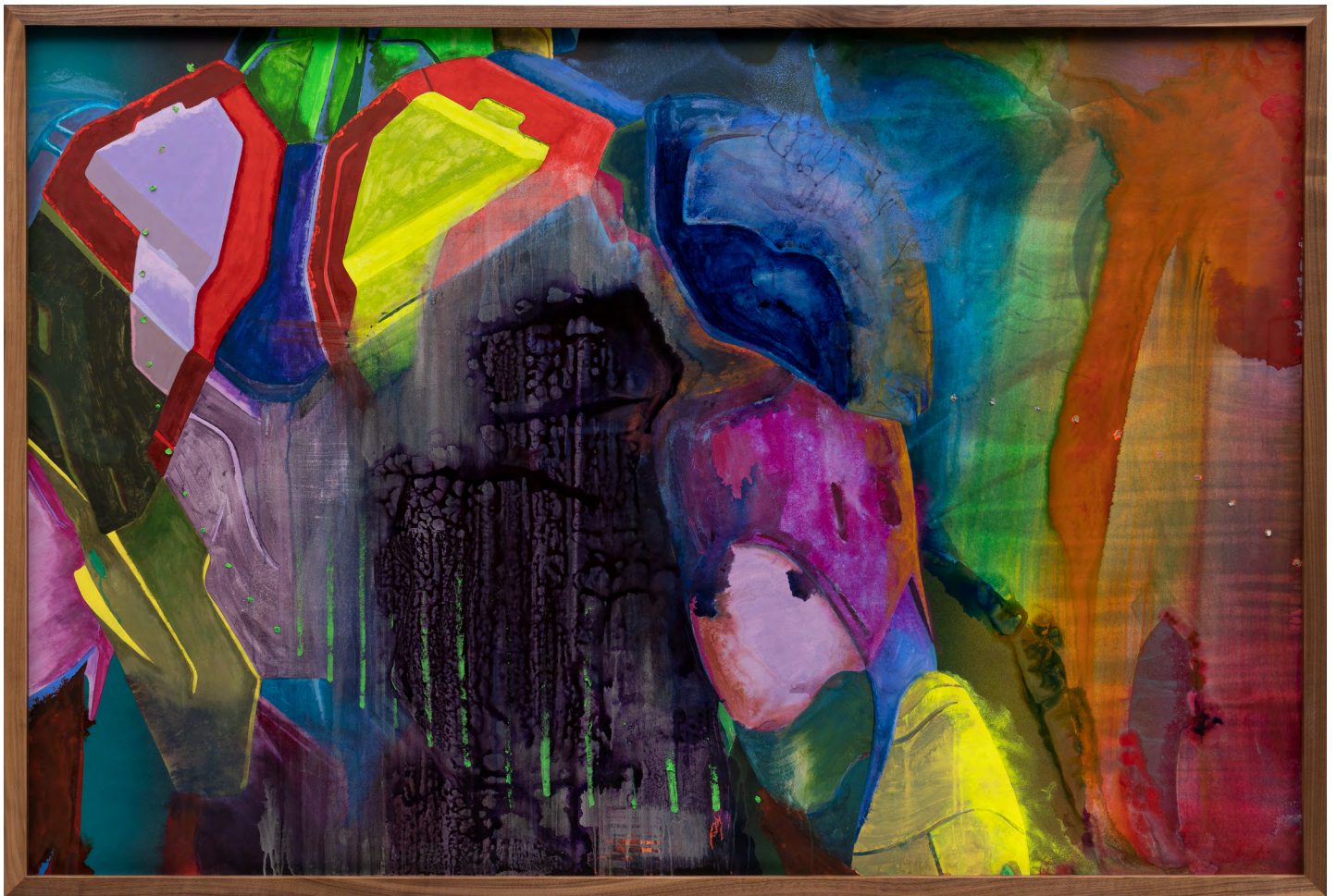
Dream Police (Our spine with shadow) , 2023 Acrylic dispersion, oil, and watercolour on panel in artist's frame 49 7/8 inches x 73 7/8 inches x 2 7/8 inches