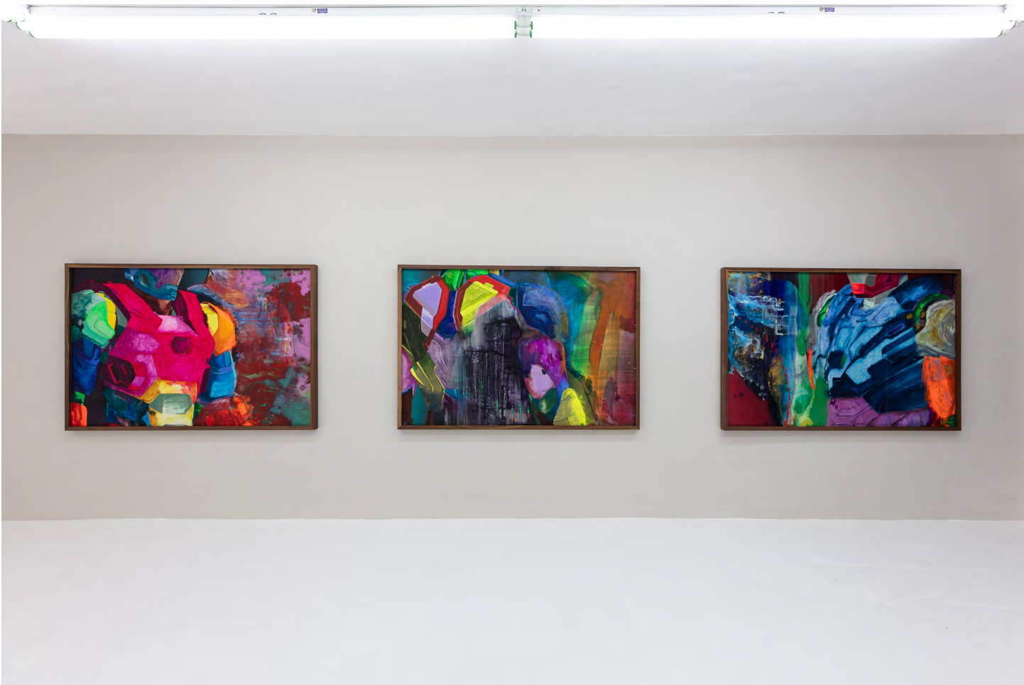
Kyle Thurman, Dream Police , 2023 (Installation View)