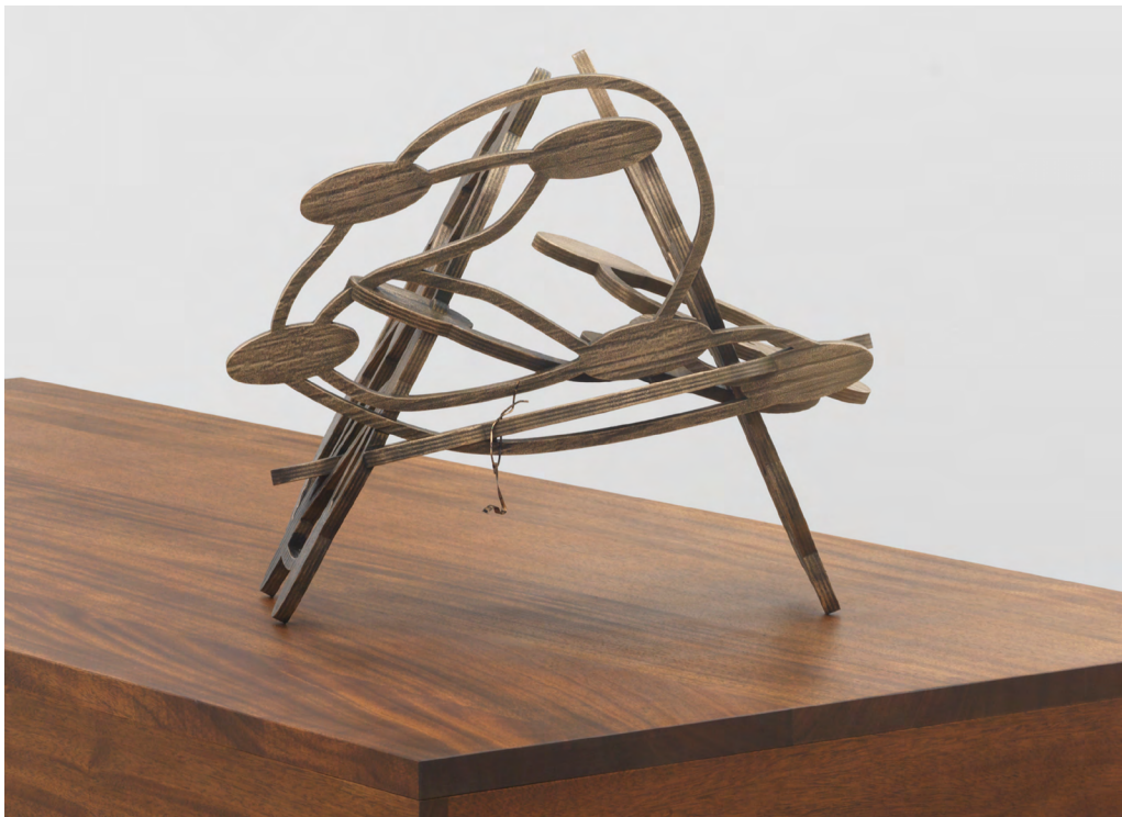
Crown (model monument, emotion), 2022 Patinated bronze 15 x 25 x 18 inches