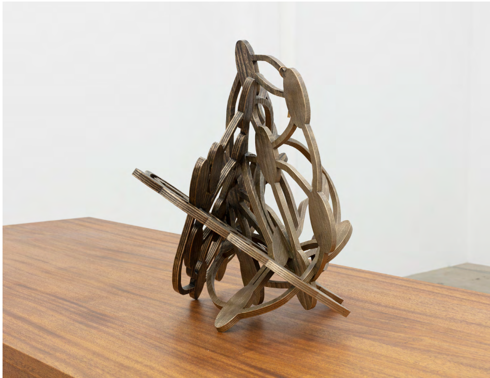
Crown (model monument, emotion), 2022 Patinated bronze 19 x 21 x 20 inches