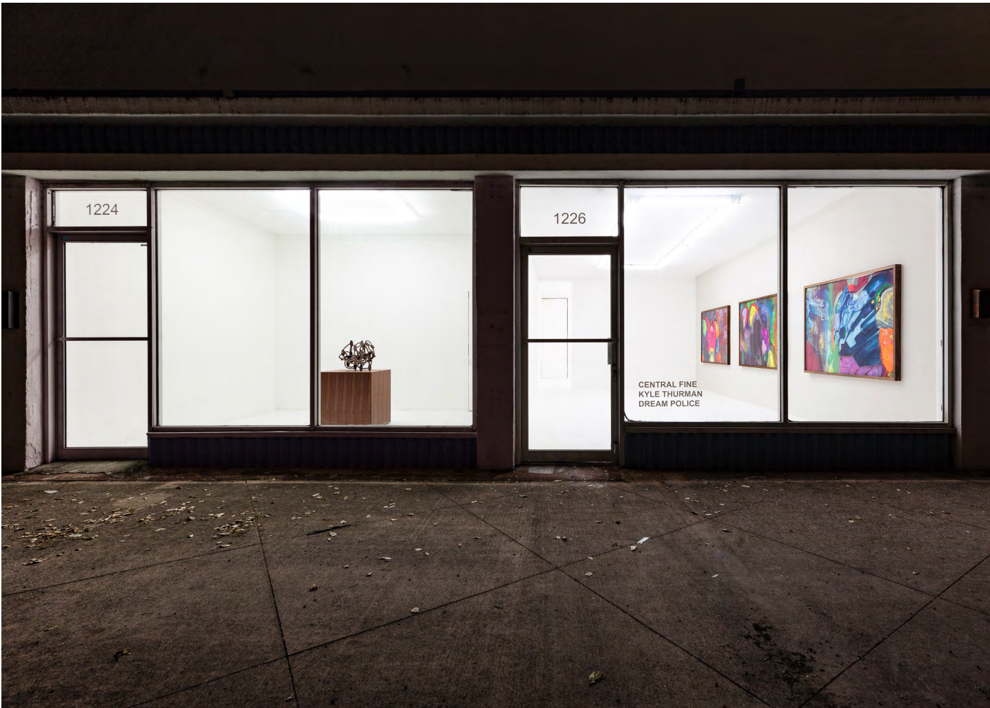
Kyle Thurman, Dream Police , 2023 (Installation View)