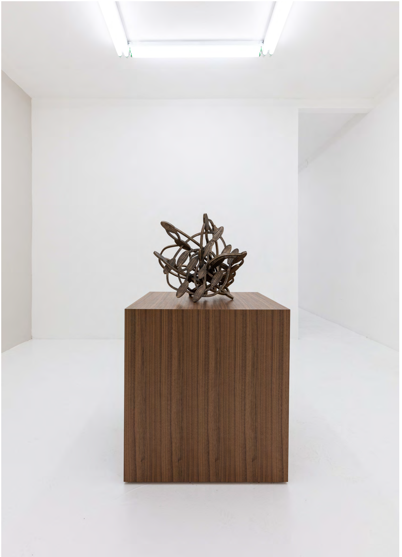
Kyle Thurman, Dream Police , 2023 (Installation View)