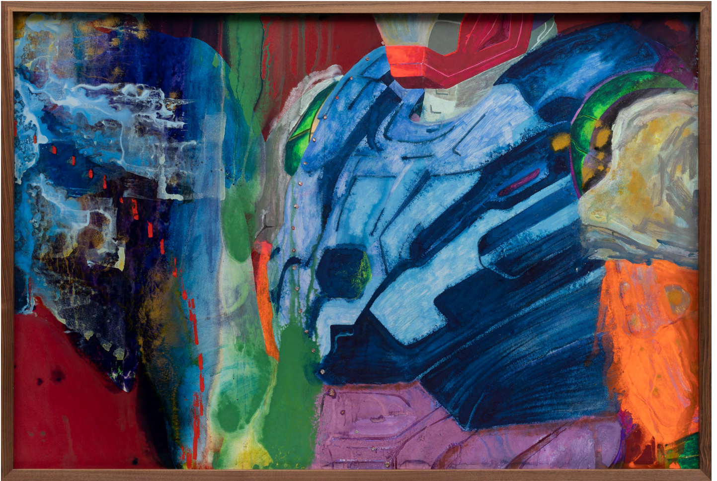
Dream Police (My shoulders) , 2023 Acrylic dispersion, oil, and watercolour on panel in artist's frame 49 7/8 inches x 73 7/8 inches x 2 7/8 inches