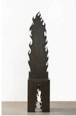
The Time is Near (Middle) , 2023 Patinated steel 84 x 18 x 18 inches (213.4 x 45.7 x 45.7 cm)