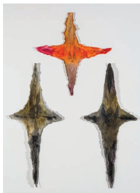
Find Me in the Fog, 2023 Acrylic ink, charcoal, and oil pastel on paper Three parts, 39 x 21 inches (99.1 x 53.3 cm)