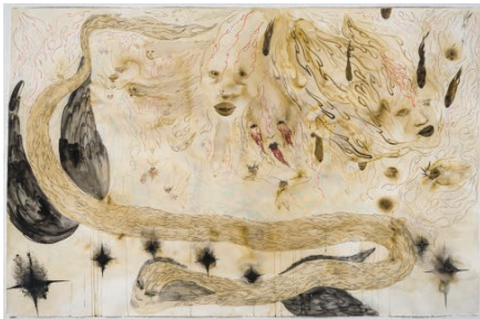
Beyond the Beyond , 2023 Acrylic ink, charcoal, and oil pastel on paper 55 x 85 inches (139.7 x 215.9 cm)