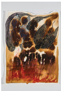
Come What May, 2022

All works courtesy of the artist. Images © Naudline Pierre, courtesy of the artist and James Cohan, New York. Photograph by Paul Takeuchi