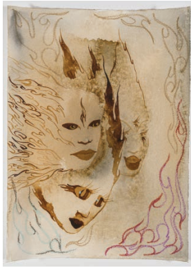
Mist , 2023 Acrylic ink and oil pastel on paper 15 x 11 inches (38.1 x 27.9 cm)