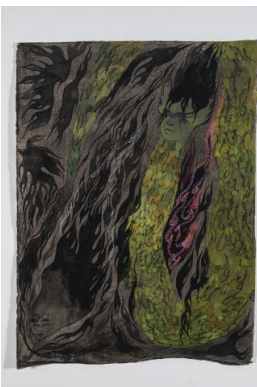
Don't Be Afraid, 2022

Acrylic, ink, and chalk pastel on paper 15 x 11 inches (38.1 x 27.9 cm)