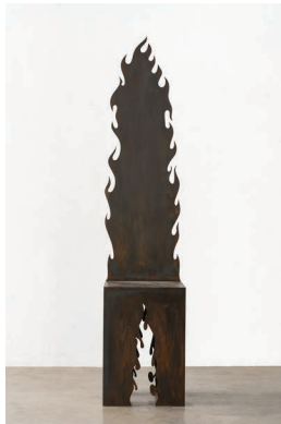
The Time is Near (End) , 2023 Patinated steel 84 x 18 x 18 inches (213.4 x 45.7 x 45.7 cm)