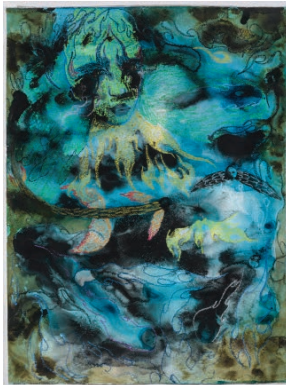
Welcome the Unknown , 2023 Acrylic ink, charcoal, and oil pastel on paper 40 x 30 inches (101.6 x 76.2 cm)