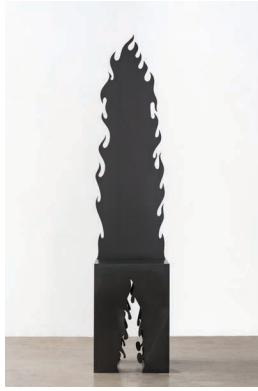
The Time is Near (Beginning) , 2023 Patinated steel 84 x 18 x 18 inches (213.4 x 45.7 x 45.7 cm)