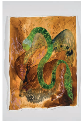
Find What You Need, 2022 Acrylic, ink, and chalk pastel on paper 15 x 11 inches (38.1 x 27.9 cm)