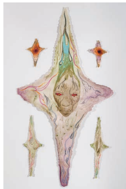
Familiar Being, 2023 Acrylic ink, charcoal, and oil pastel on paper Five parts, 39 x 21 inches (99.1 x 53.3 cm)