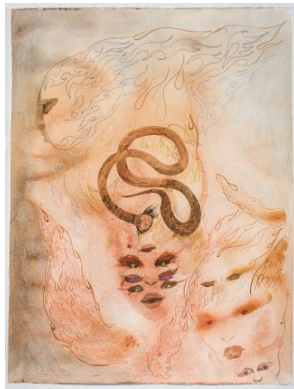
All Ways , 2023 Acrylic ink, charcoal, and oil pastel on paper 40 x 30 inches (101.6 x 76.2 cm)