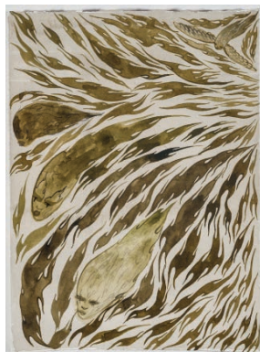
Inside, 2023 Acrylic ink and charcoal 15 x 11 inches (38.1 x 27.9 cm)