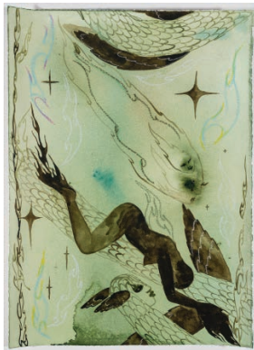
Down, Down, 2023 Acrylic ink, charcoal, and oil pastel on paper 15 x 11 inches (38.1 x 27.9 cm)