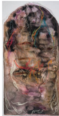
Omnipotent , 2023 Acrylic ink, charcoal, and oil pastel on paper 48 x 24 inches (121.9 x 61 cm)