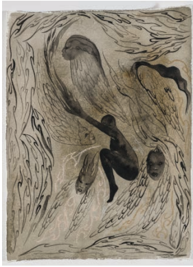
Deeper, 2023 Acrylic ink, charcoal, and oil pastel on paper 15 x 11 inches (38.1 x 27.9 cm)