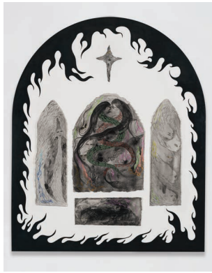
Intertwined , 2022 Acrylic, ink, and chalk pastel on paper Five parts, dimensions variable