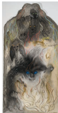
Omniscient , 2023 Acrylic ink, charcoal, and oil pastel on paper 48 x 24 inches (121.9 x 61 cm)