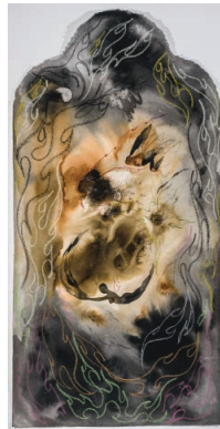
In the Infinite, 2023 Acrylic ink, charcoal, and oil pastel on paper 48 x 24 inches (121.9 x 61 cm)