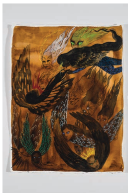
Into the Abyss, 2022

Acrylic, ink, and chalk pastel on paper 15 x 11 inches (38.1 x 27.9 cm)