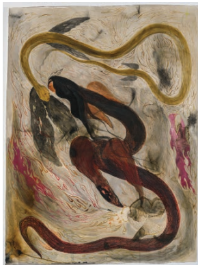
In the Beyond, 2023 Acrylic ink and charcoal on paper 40 x 30 inches (101.6 x 76.2 cm)