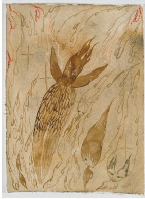
Shadows , 2023 Acrylic ink, charcoal, and oil pastel on paper 15 x 11 inches (38.1 x 27.9 cm)