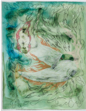
Halted Understanding , 2023 Acrylic ink, charcoal, and oil pastel on paper 40 x 30 inches (101.6 x 76.2 cm)