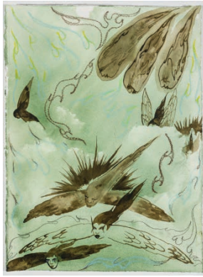
Follow, 2023 Acrylic ink, charcoal, and oil pastel on paper 15 x 11 inches (38.1 x 27.9 cm)