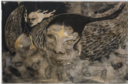
This, I Know to Be True , 2023 Acrylic, acrylic ink, charcoal, and oil pastel on paper 55 x 85 inches (139.7 x 215.9 cm)