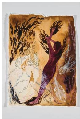
Unto You I Release Myself, 2022 Acrylic, ink, and chalk pastel on paper 15 x 11 inches (38.1 x 27.9 cm)