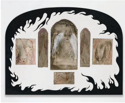
Creatures of Love, 2022 Acrylic, ink, and chalk pastel on paper Six parts, dimensions variable