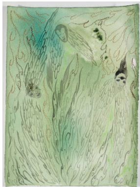
Whirlwind , 2023 Acrylic ink, charcoal, and oil pastel on paper 15 x 11 inches (38.1 x 27.9 cm)