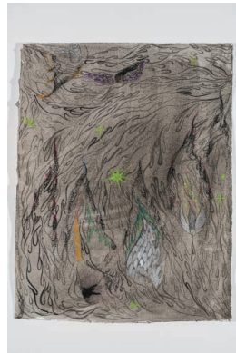
Hide Me Under Your Wing, 2022 Acrylic, ink, and chalk pastel on paper 15 x 11 inches (38.1 x 27.9 cm)