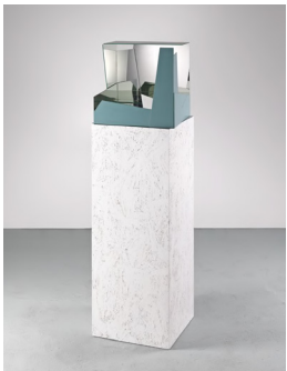
Kutxa Hutsa (for Jorge Oteiza), 2010 mirror glass, plinth acrylic glass 40 × 40 × 40 cm, plinth 93 × 33 × 33 cm