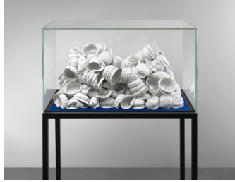
Untitled, 2011 porcelain in glass display, vitrine 36 × 80 × 46 cm, 148 × 87 × 54 cm