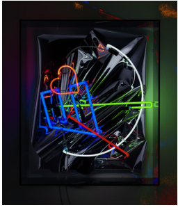
Untitled, 2023 mixed media, neon, cable, acrylic glass 96 × 81 × 24 cm