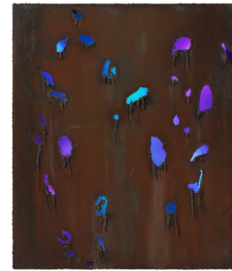
Untitled, 2008 steel, LED 135 × 114 cm