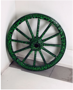
Wheel, 2008 found object, crinkle lacquer Ø 67 cm