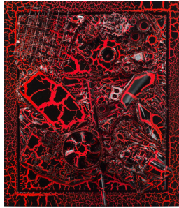
Untitled, 2009 mixed media on canvas, steel frame, crinkle lacquer, frame 36 × 30 cm, 43 × 37 cm