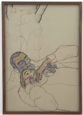
Suggested Occupation 4 , 2015 Charcoal and pastel on seamless paper in artist's frame 42 x 28-1/2 inches