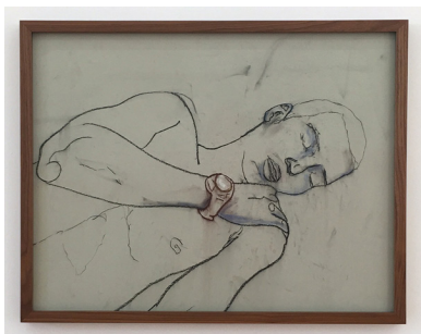
Suggested Occupation 7 , 2016 Charcoal and pastel on seamless paper in artist's frame 25 x 32-1/8 inches