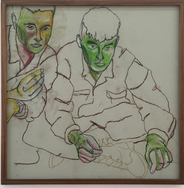
Suggested Occupation 6 , 2016 Charcoal and pastel on seamless paper in artist's frame 34-3/8 x 33-3/4 inches