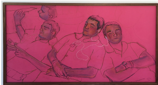
Suggested Occupation 2 , 2015 Charcoal and pastel on seamless paper in artist's frame 34-1/4 x 59-1/8 inches