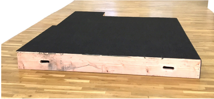
tomorrow will be nothing like today , 2016 carpet, hardware, wood 10-1/4 x 106-1/2 x 92 inches