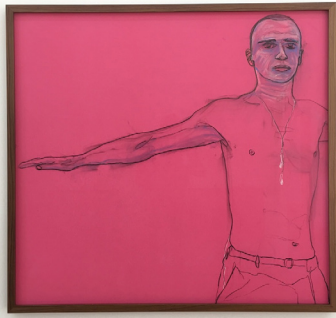
Suggested Occupation 3 , 2016 Charcoal and pastel on seamless paper in artist's frame 41-1/4 x 44-1/4 inches