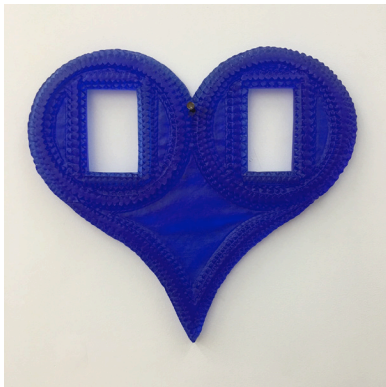
matches , 2016 Cast glass and nail 2 x 16 x 16 inches

closing performance by Madeline Hollander