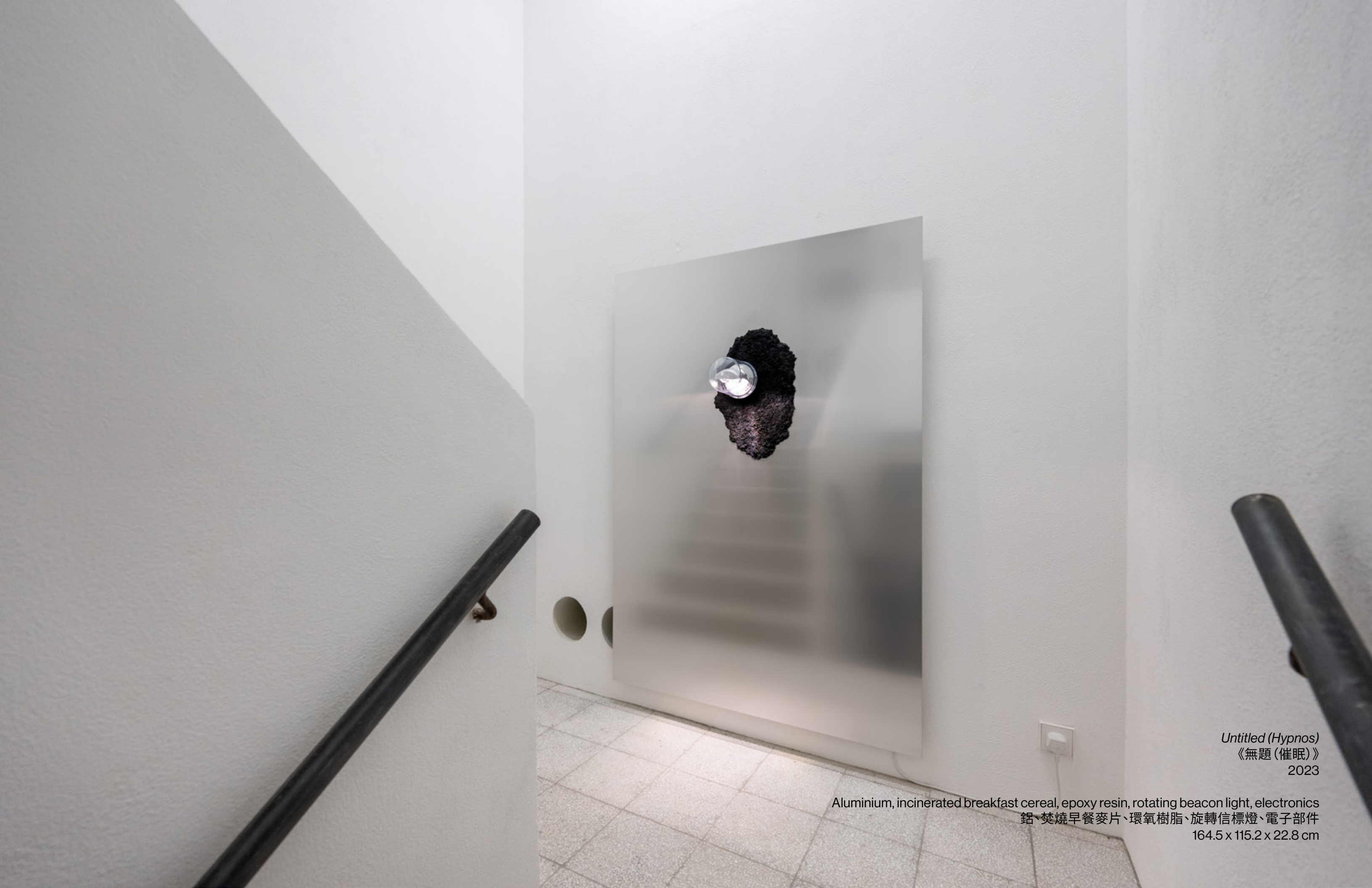
Untitled (Hypnos) 《無題(催眠)》 2023

Aluminium, incinerated breakfast cereal, epoxy resin, rotating beacon light, electronics 鋁、焚燒早餐麥片、環氧樹脂、旋轉信標燈、電子部件 164.5 x 115.2 x 22.8 cm