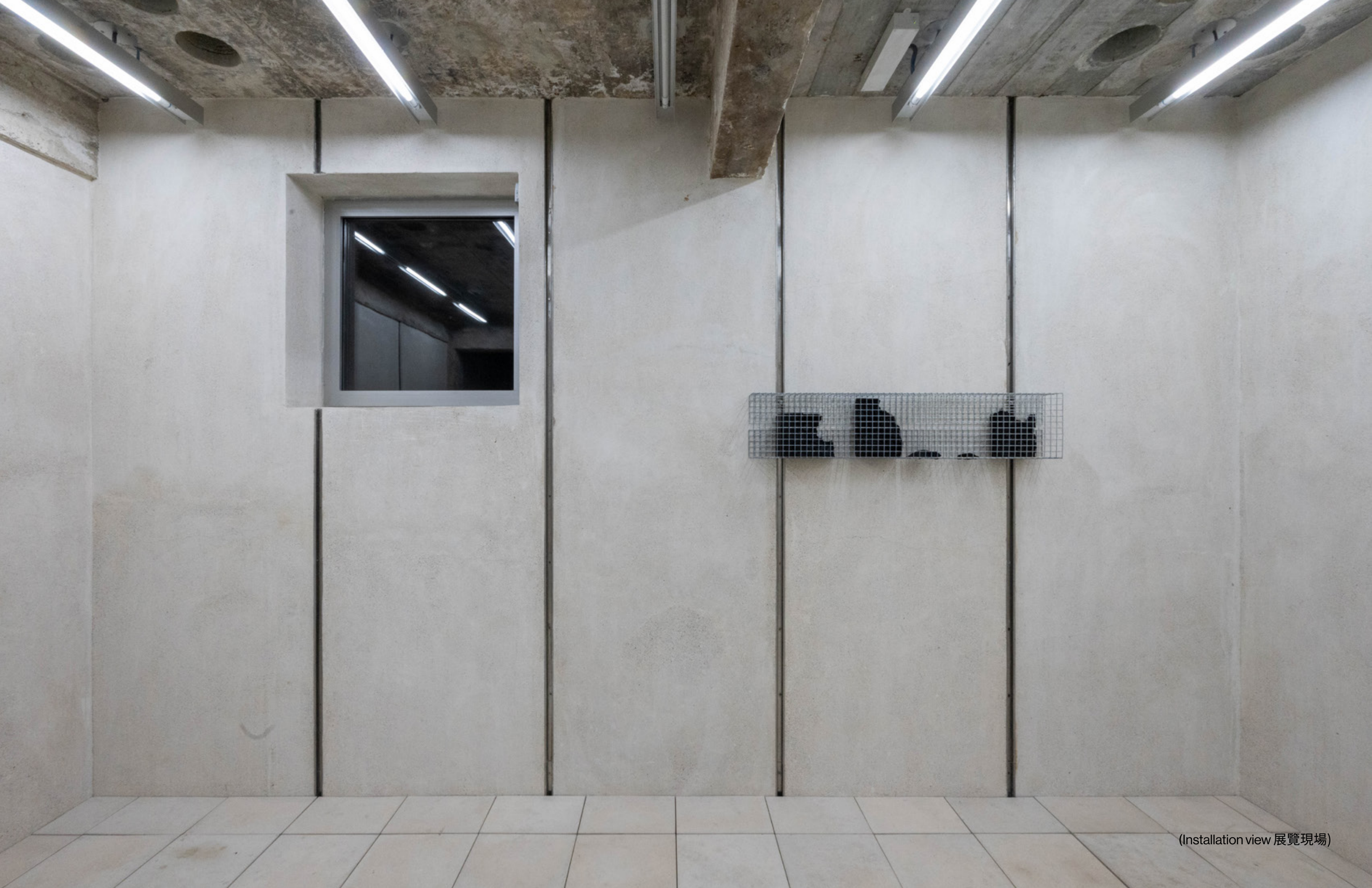
(Installation view 展覽現場)