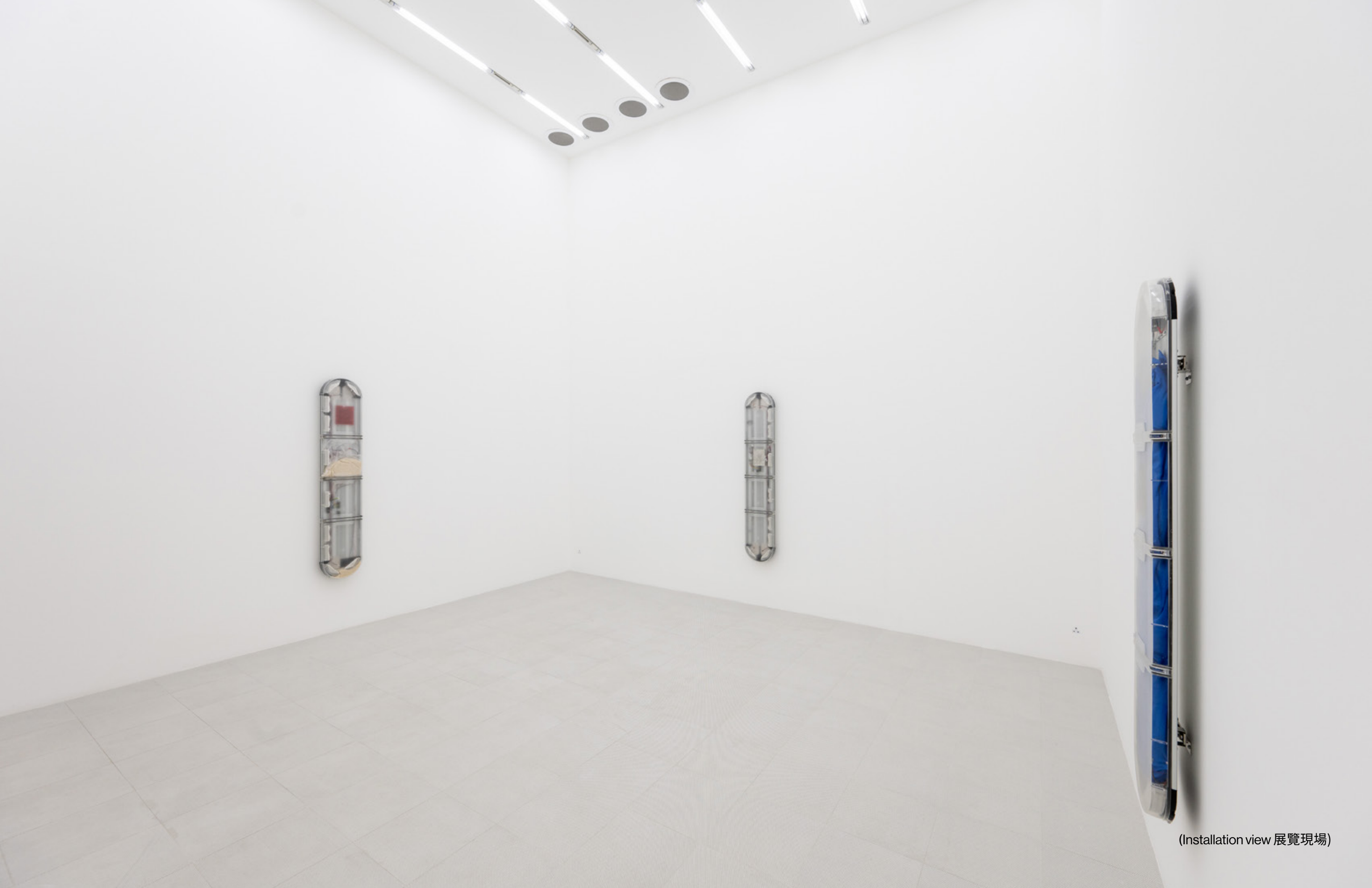
(Installation view 展覽現場)