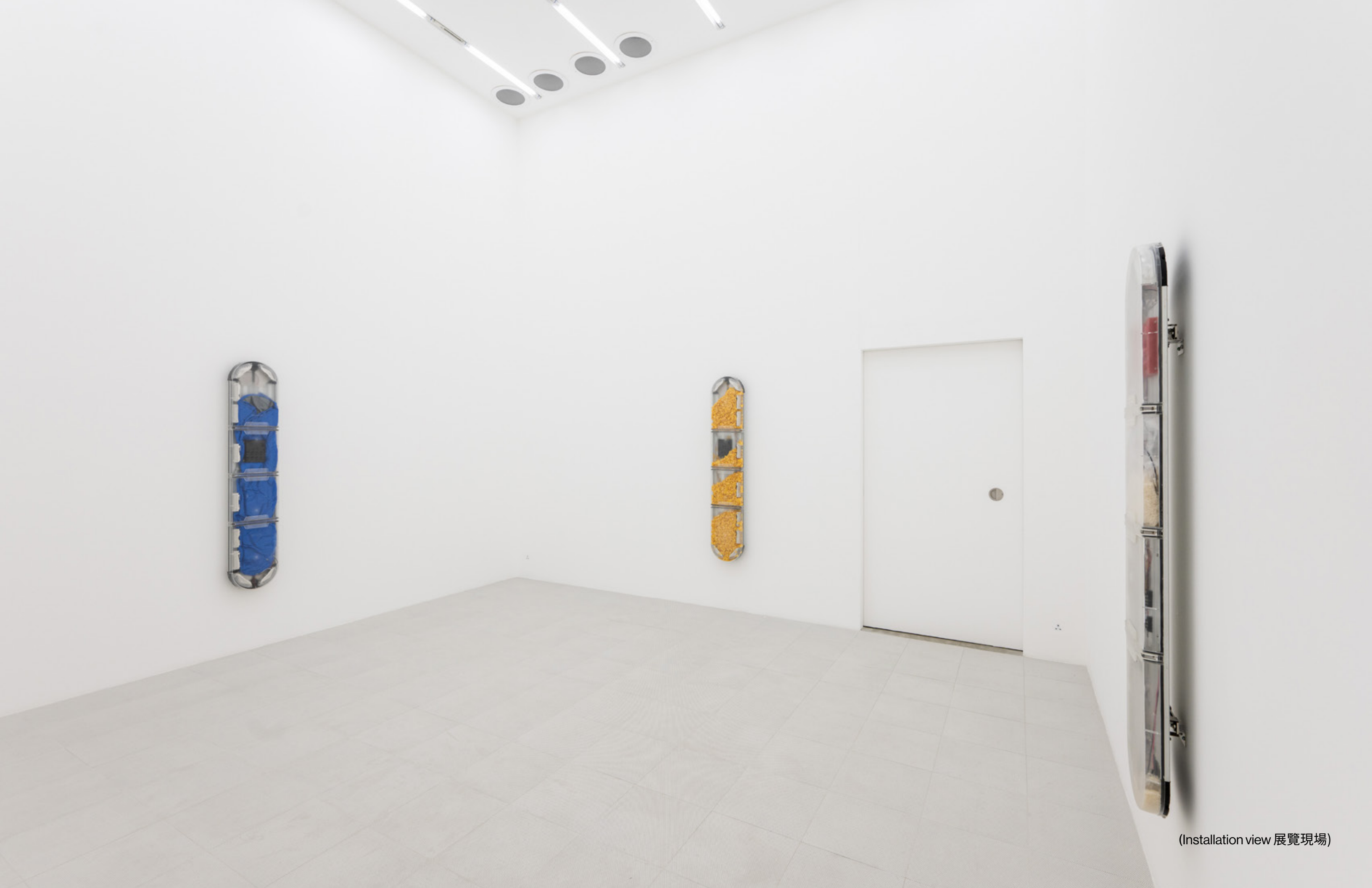
(Installation view 展覽現場)