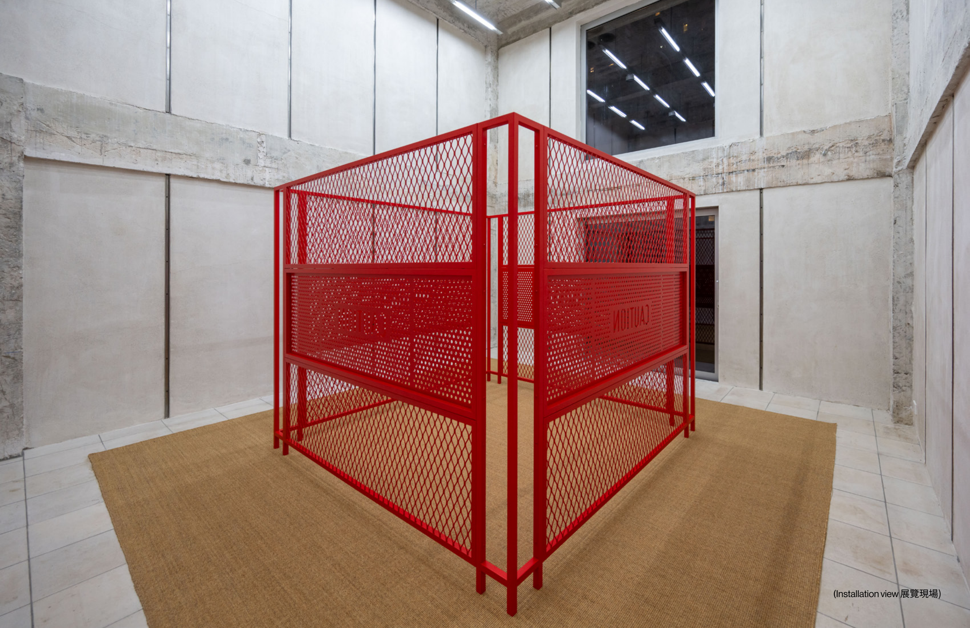
(Installation view 展覽現場)