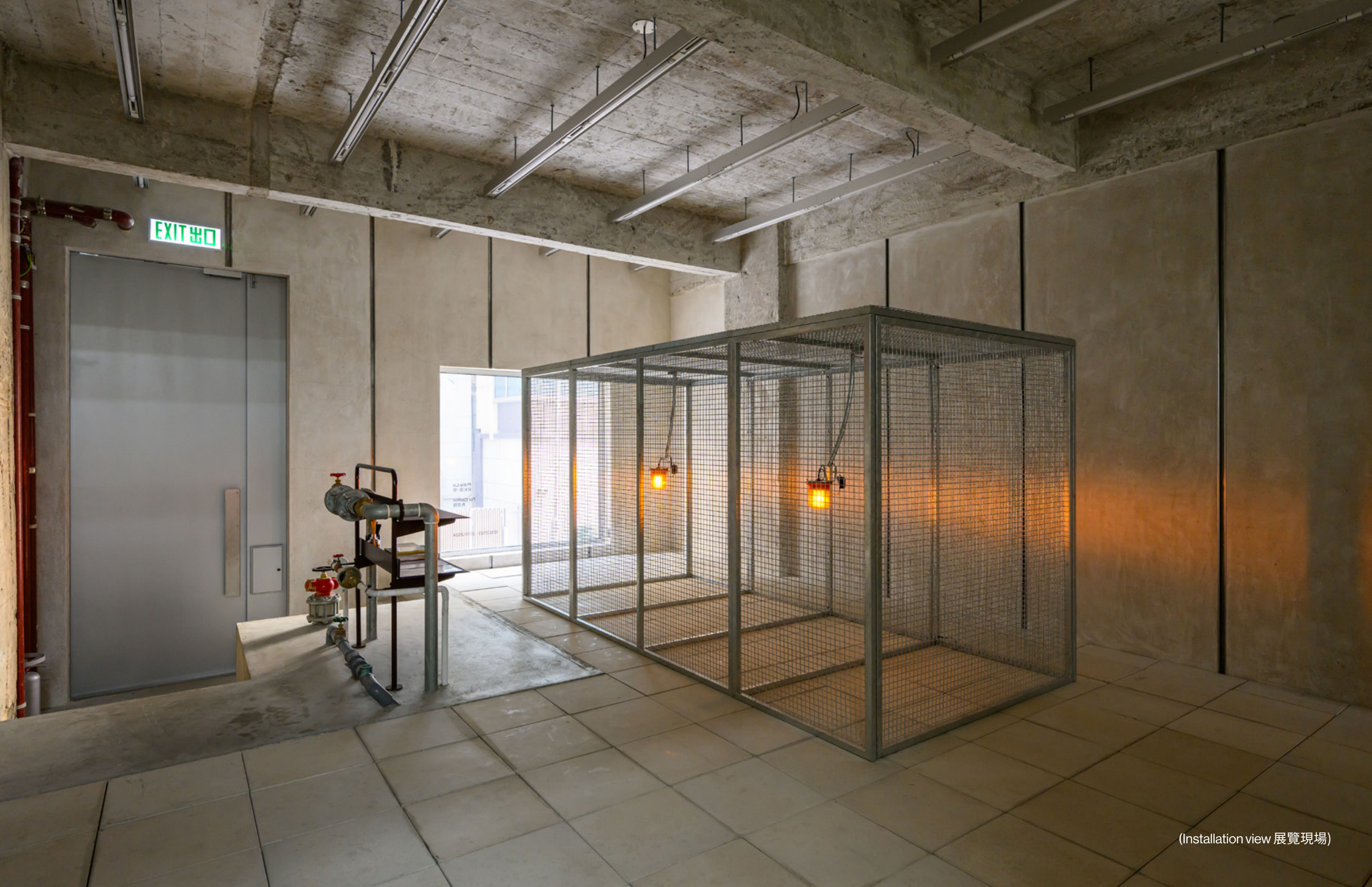
(Installation view 展覽現場)