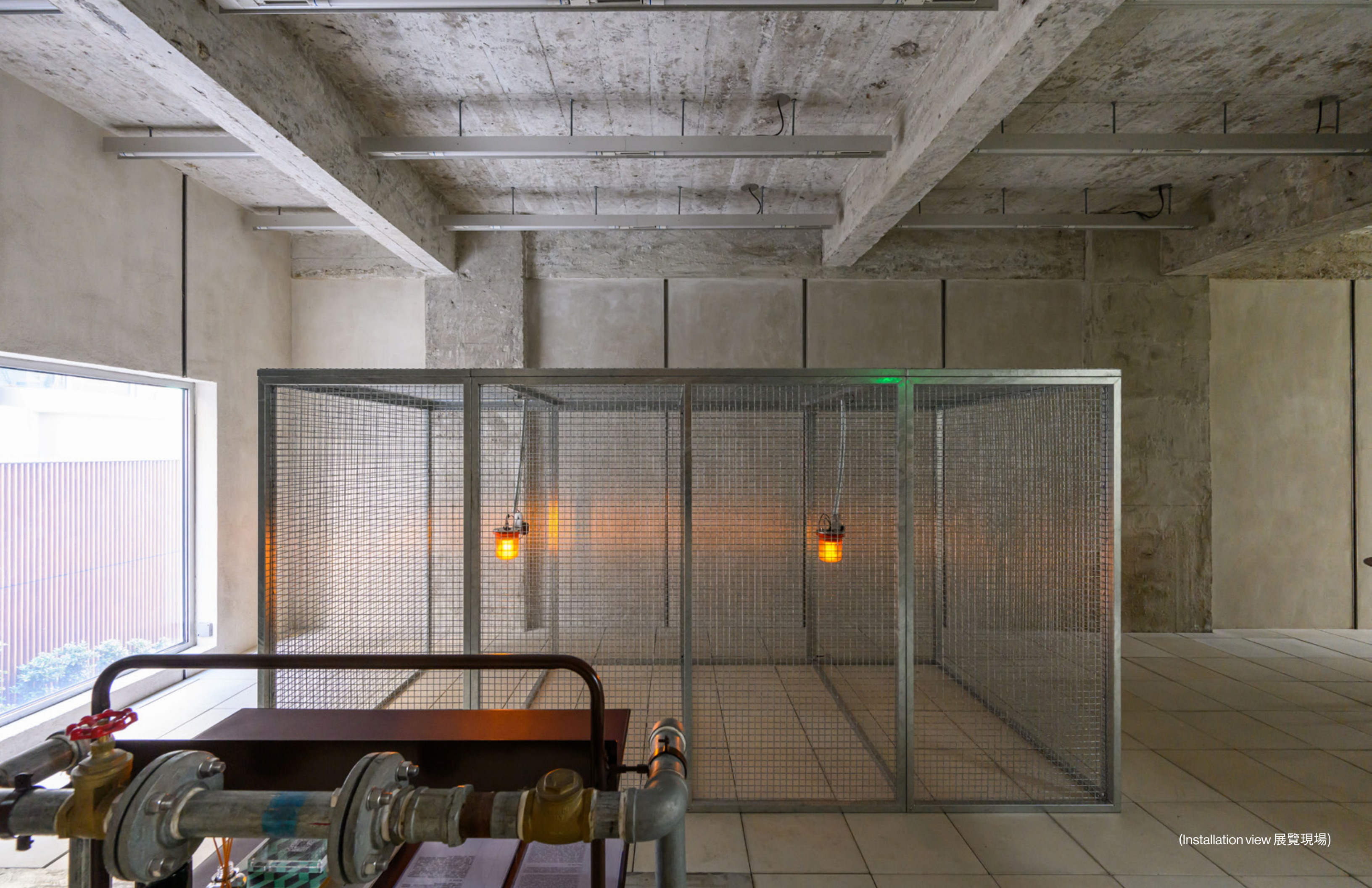
(Installation view 展覽現場)