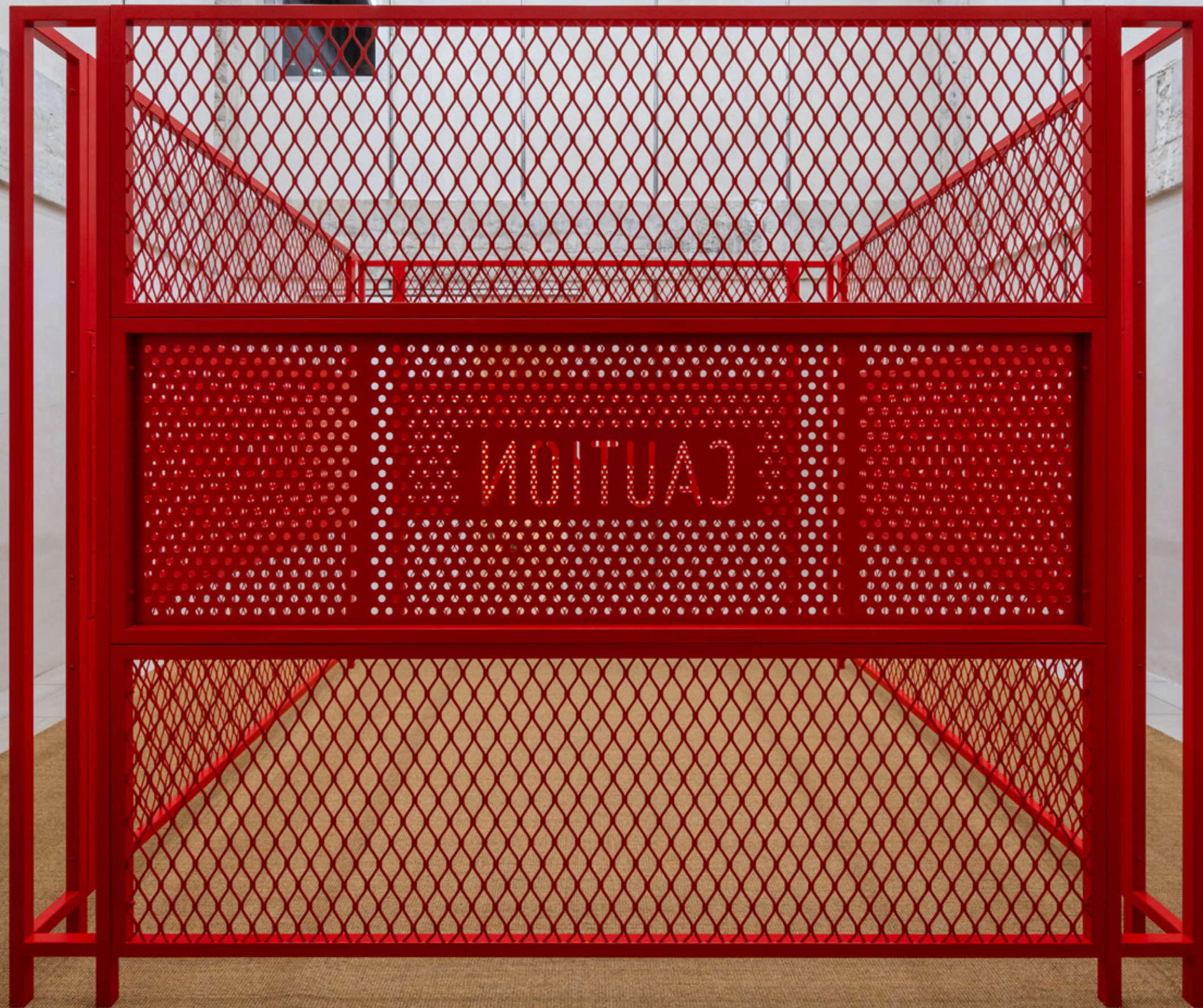
Four Cautions 《四個警醒》 2023

Powder-coated steel 粉末塗層鋼 201.3 x 241 x 241 cm