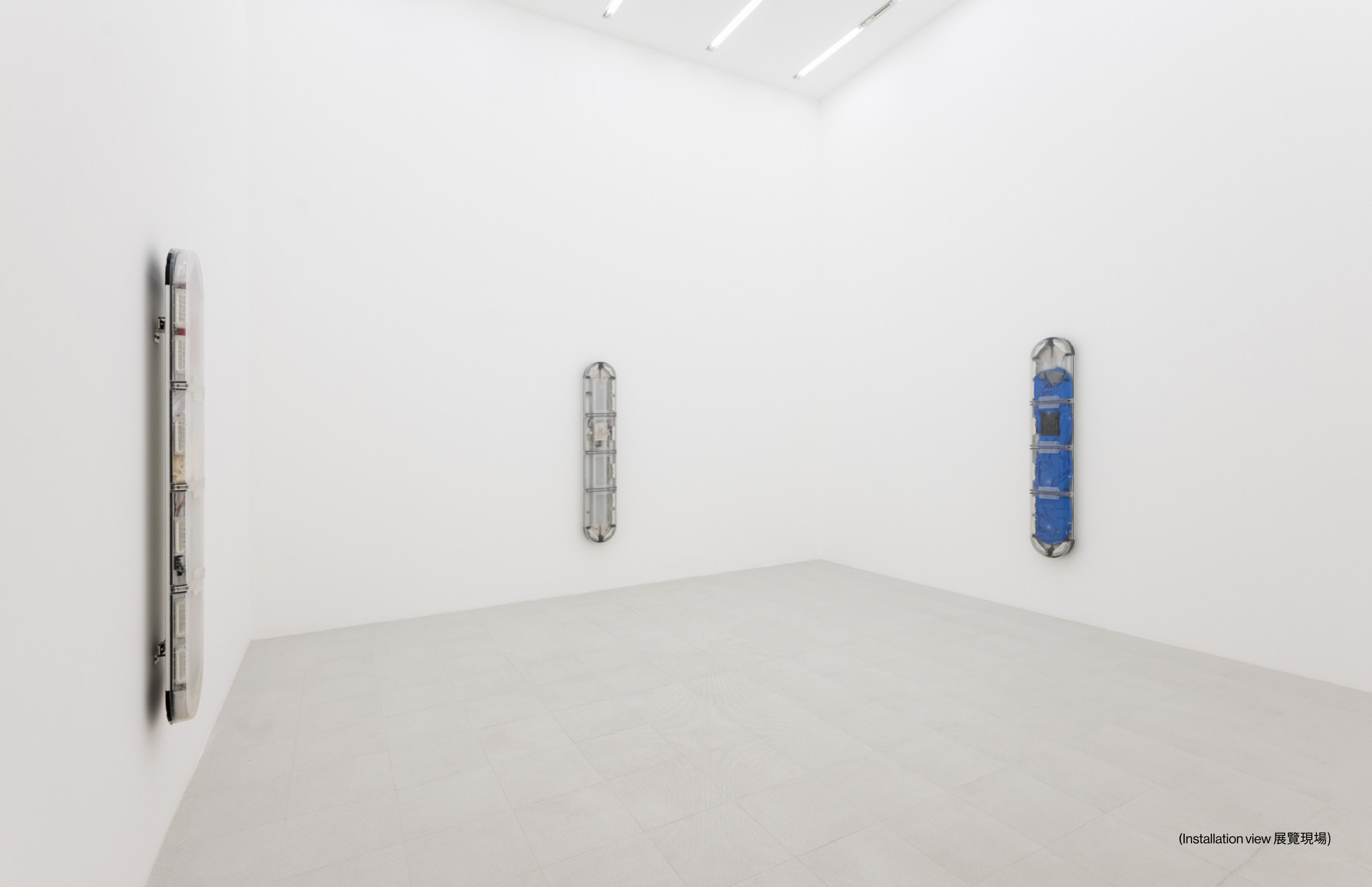
(Installation view 展覽現場)