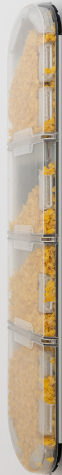
(Installation view 展覽現場)