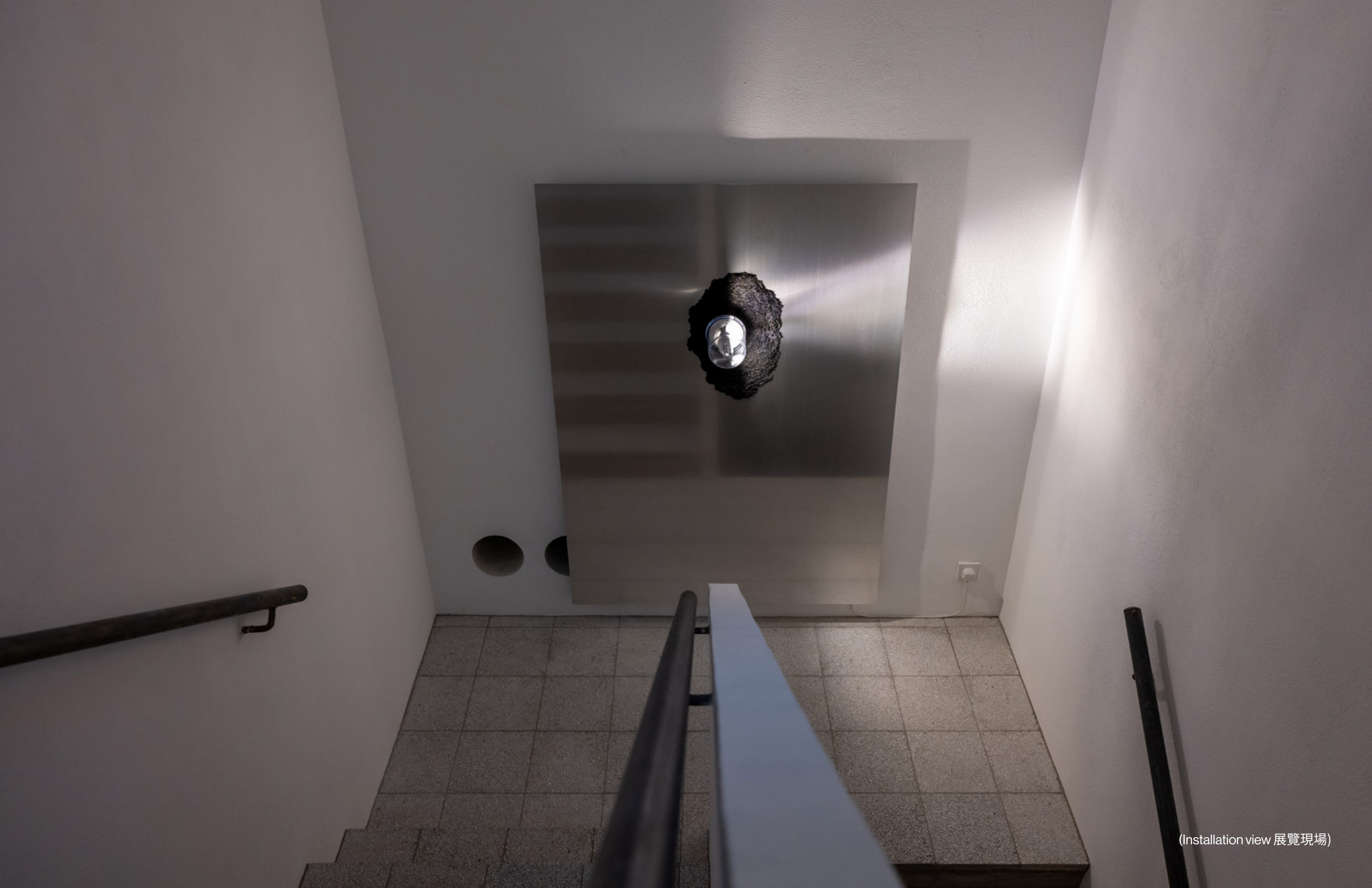
(Installation view 展覽現場)