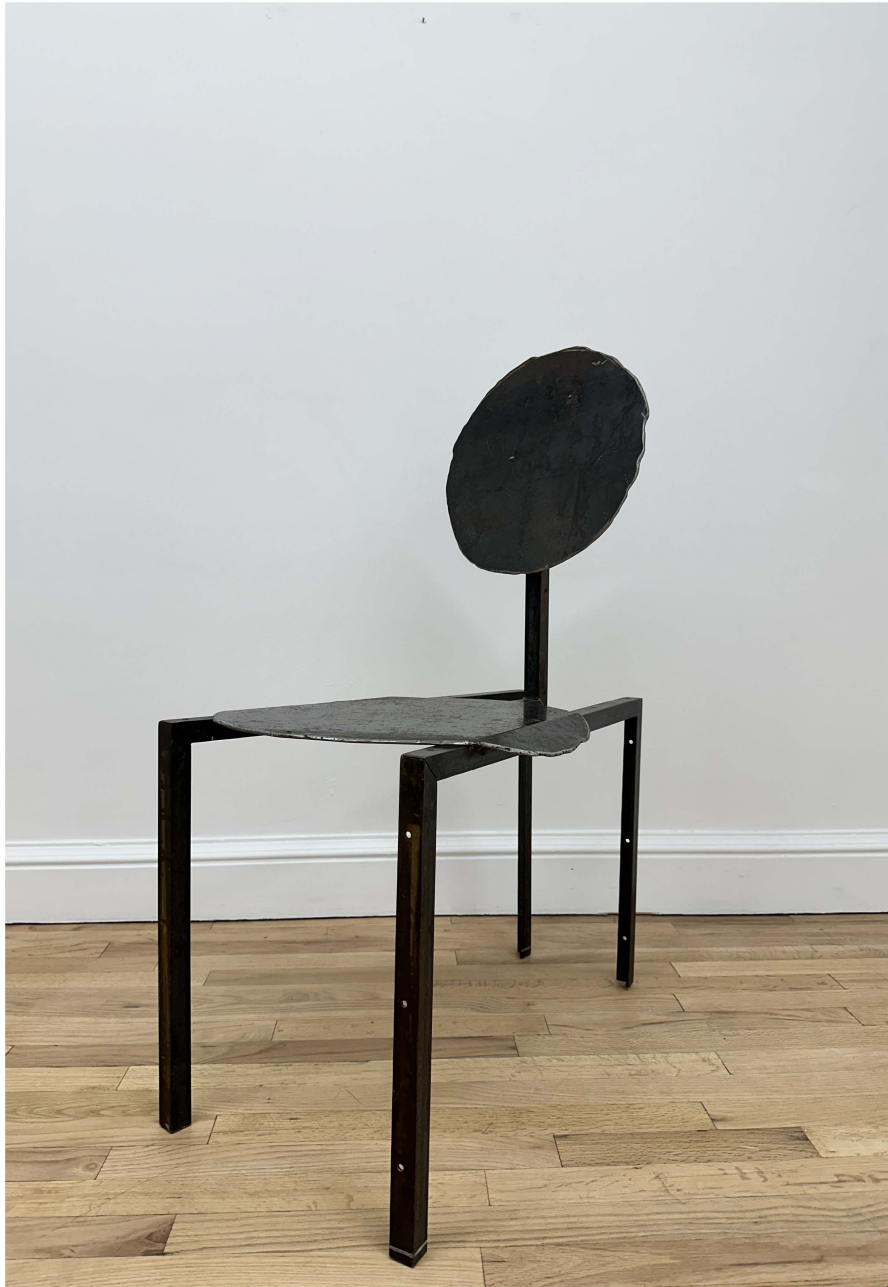
Spider 2 reclaimed steel 26 5/8 x 17 3/4 x 37 5/8 in. | 67,6 x 45,1 x 95.6 cm. | 2020