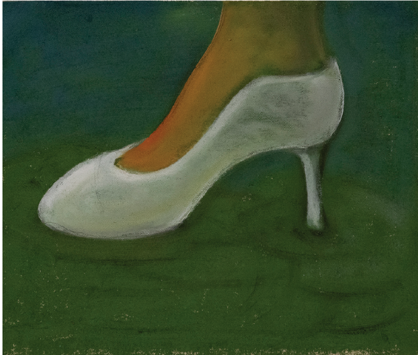
Shoe painting oil & oil stick on canvas wrapped panel 11 1/4 x 13 1/4 x 1/2 in. | 28,6 x 33,6 x 1,3 cm. | 2022