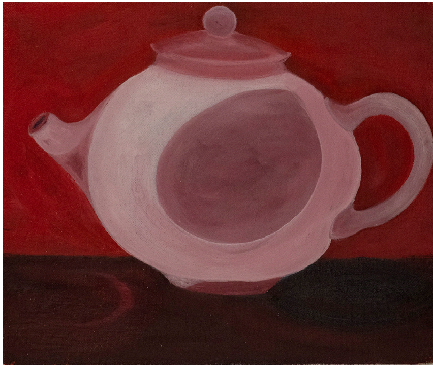
Teapot painting oil & oil stick on canvas wrapped panel 11 1/4 x 13 1/4 x 1/2 in. | 28,6 x 33,6 x 1,3 cm. | 2022