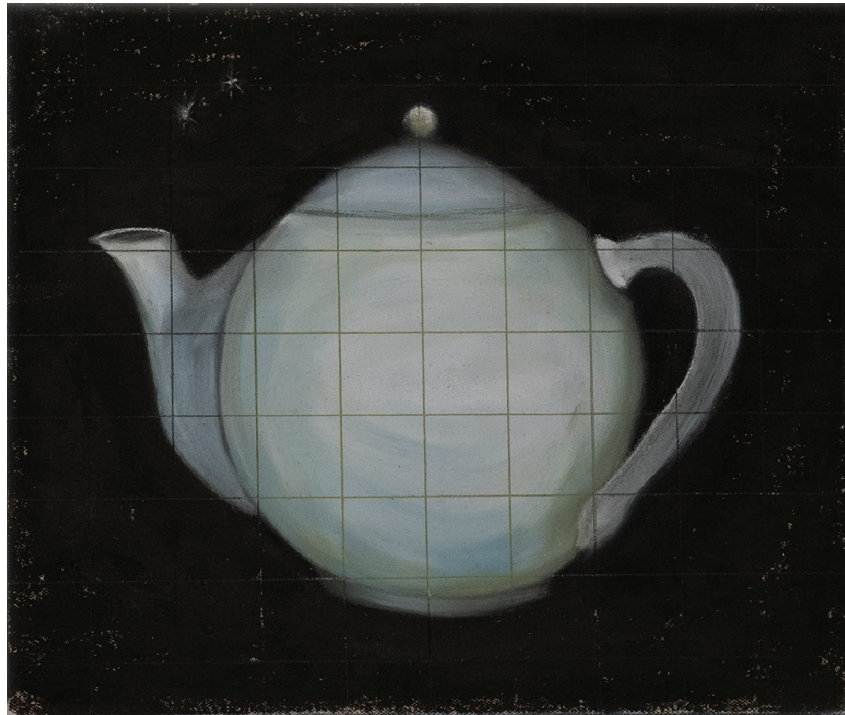
Teapot painting oil & oil stick on canvas wrapped panel 11 1/4 x 13 1/4 x 1/2 in. | 28,6 x 33,6 x 1,3 cm. | 2022