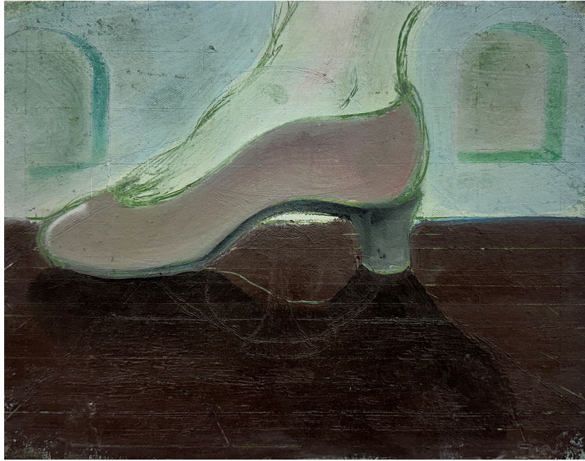
Shoe painting oil & oil stick on canvas wrapped panel 11 1/4 x 13 1/4 x 1/2 in. | 28,6 x 33,6 x 1,3 cm. | 2022