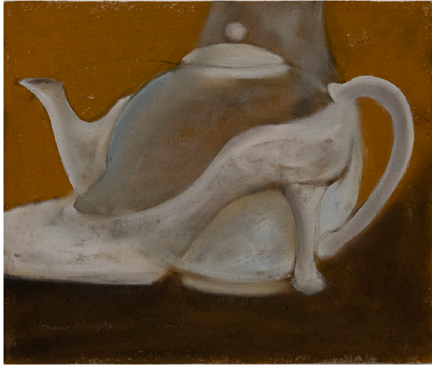
Teapot & Shoe painting oil & oil stick on canvas wrapped panel 11 1/4 x 13 1/4 x 1/2 in. | 28,6 x 33,6 x 1,3 cm. | 2022