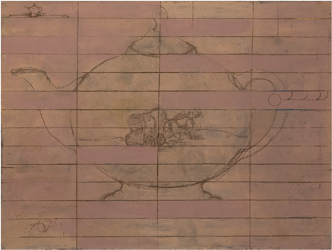
Teapot Wagon oil and oil stick on canvas 18 x 24 1/4 x 1 1/14 in. | 45,7 x 61,5 x 3,1 cm. | 2021