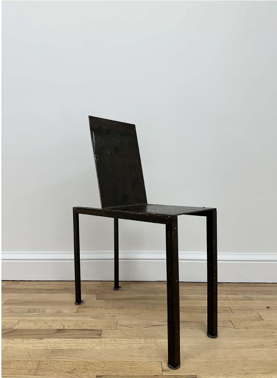
Spider chair reclaimed steel 22 x 10 x 31 7/8 in. | 55,9 x 25,4 x 80,9 cm. | 2020