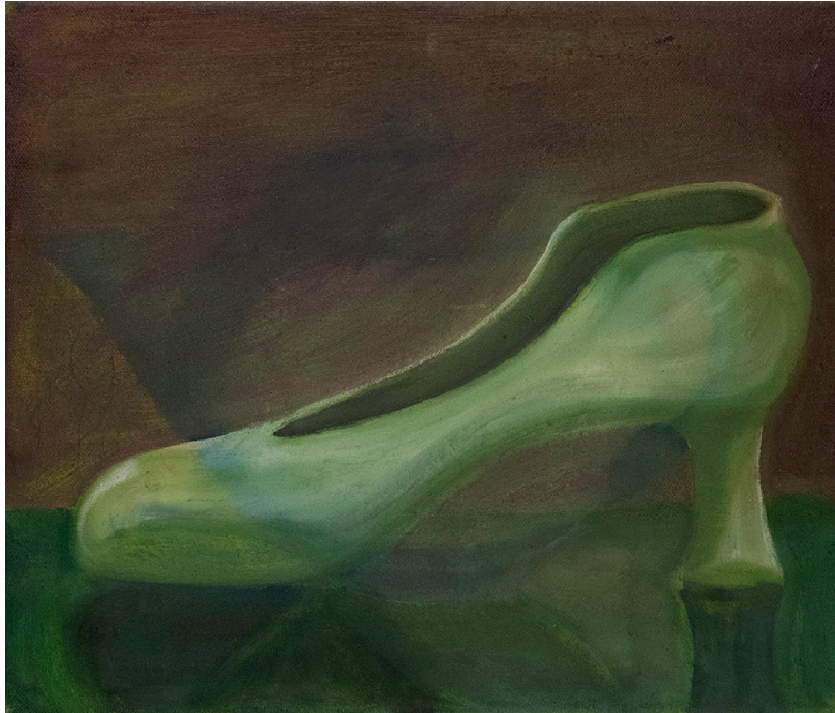
Teapot & Shoe painting oil & oil stick on canvas wrapped panel 11 1/4 x 13 1/4 x 1/2 in. | 28,6 x 33,6 x 1,3 cm. | 2022