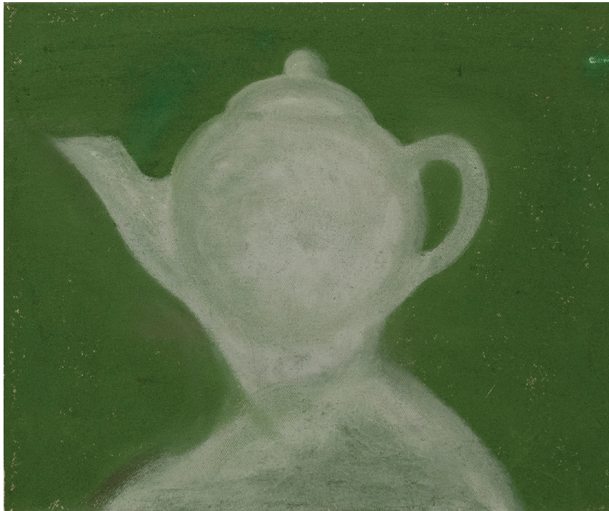
Spirit painting oil & oil stick on canvas wrapped panel 11 1/4 x 13 1/4 x 1/2 in. | 28,6 x 33,6 x 1,3 cm. | 2022