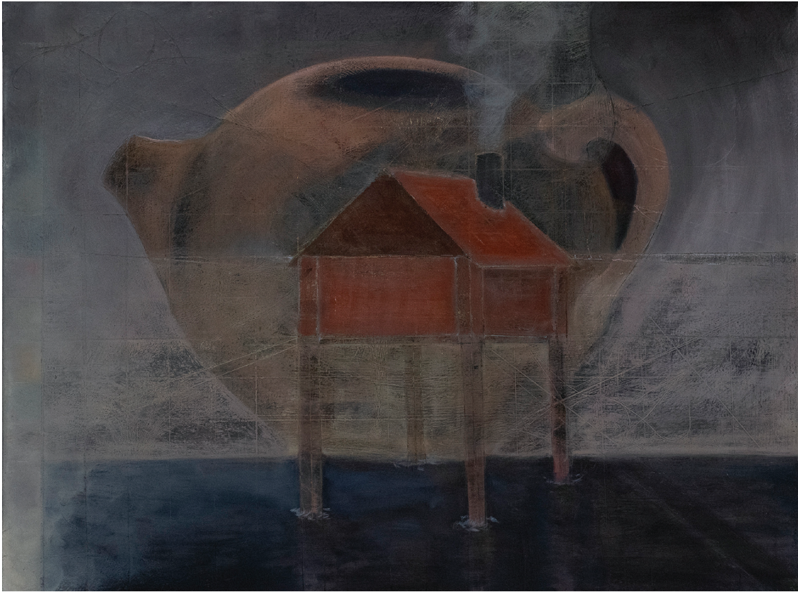
Seahouse oil and oil stick on canvas 18 x 24 1/4 x 1 1/14 in. | 45,7 x 61,5 x 3,1 cm. | 2021