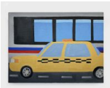
Alex Bradley Cohen Public/Private , 2023 Acrylic on canvas 12h x 16w in acohen0084