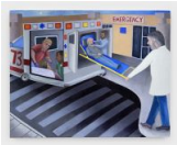
Alex Bradley Cohen Practices of Care , 2023 Acrylic on canvas 24h x 30w in acohen0085