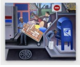
Alex Bradley Cohen Social Construct #4 , 2023 Acrylic on canvas 26 x 32 inches acohen0090