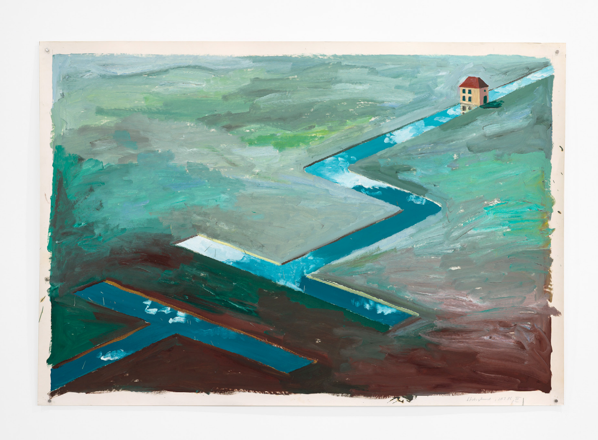
\textit{Widerstand (27.8.86 III)}, 1986, gouache, oil paint, acrylic on card paper, 110 \times 160 \text{ cm}