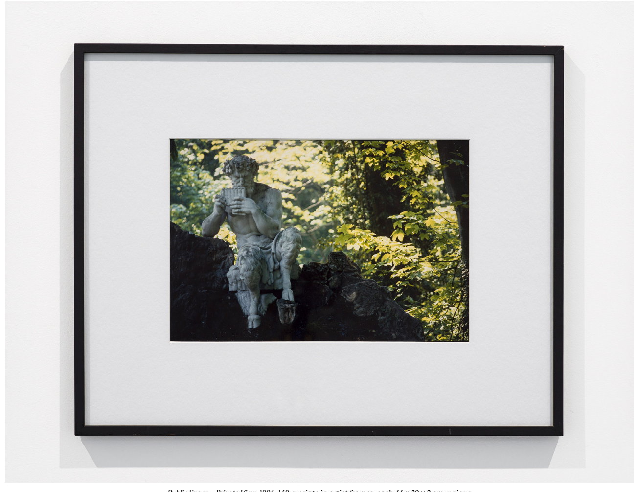
\textit{Public Space - Private View}, 1996, 140 \text{ c-prints in artist frames, each } 44 \times 39 \times 2 \text{ cm, unique}