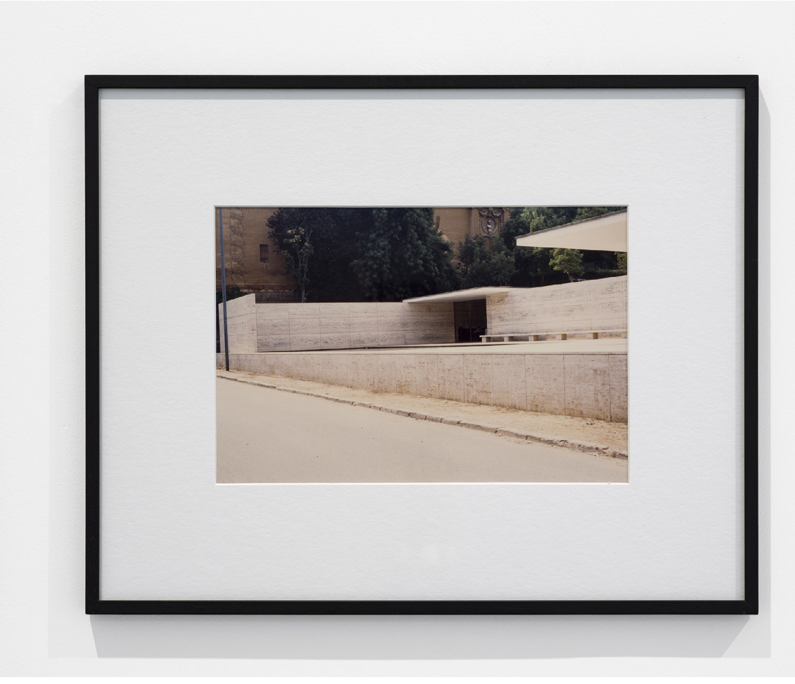
\textit{Public Space - Private View}, 1996, 140 \text{ c-prints in artist frames, each } 44 \times 39 \times 2 \text{ cm, unique}