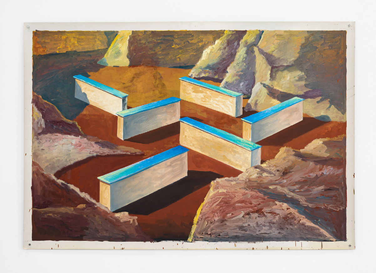
Ohne Titel, 1985, gouache, oil paint, acrylic on card paper, 110 \times 160 cm