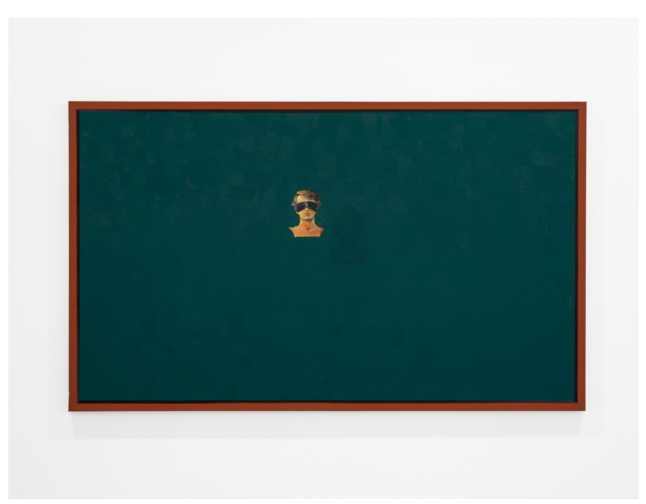
\textit{Maler-Bild (Gr\"un)}, 1988, Oil on canvas, <math display="inline">200 \times 120 \times 3 \text{ cm}