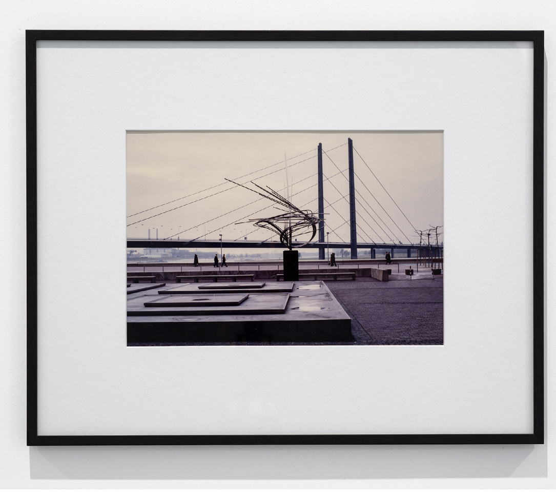
\textit{Public Space - Private View}, 1996, 140 \text{ c-prints in artist frames, each } 44 \times 39 \times 2 \text{ cm, unique}