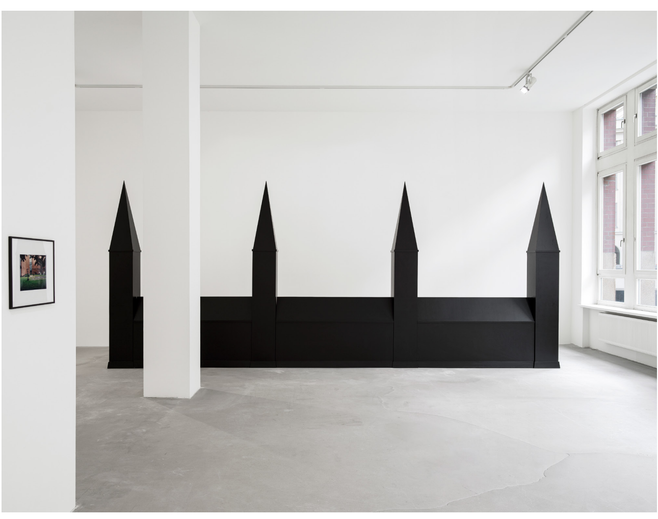
Bau-Bild Kloster, 1988, Paint on wood, 326\times246\times246 cm