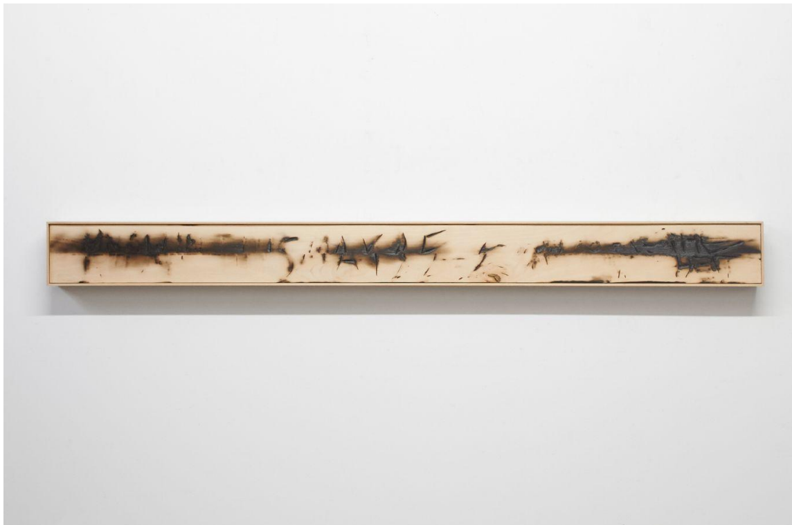
David Lindsay BRUISE (KNOWING THIS MAY BE ENOUGH FOR YOU TO FEEL THE HEAT) , 2023

Linden wood 7 x 78.5 x 3 in 17.8 x 200 x 7.6 cm