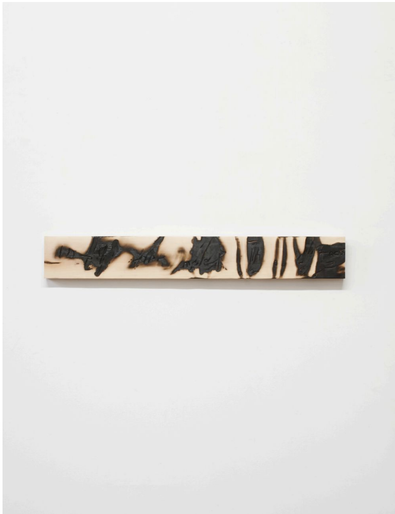
David Lindsay NUDE BRUISE (THEY ARE PRESENT IN HOW I THINK, BELIEVE, FEAR), 2024

Linden wood 5.5 x 38.75 x 1 in 13.9 x 98.4 x 2.5 cm