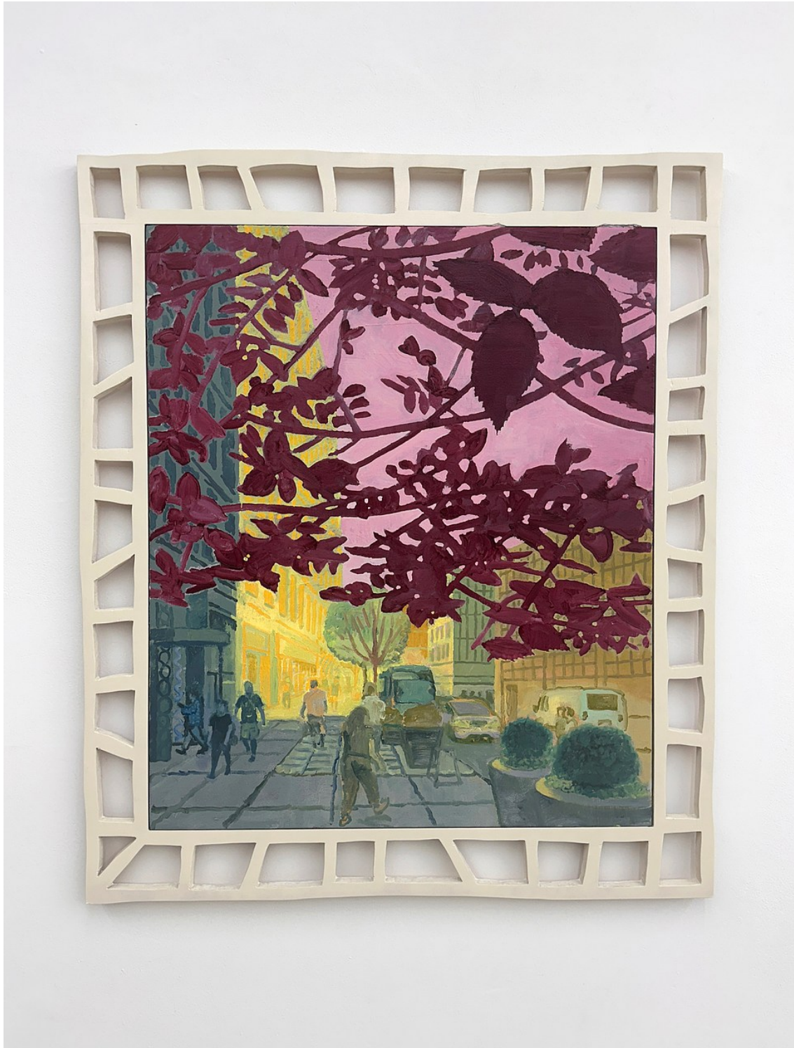
Masamitsu Shigeta A Cityscape Through A Tree Net, 2023 Oil on canvas with wood frame 35 1/2 x 30 inches