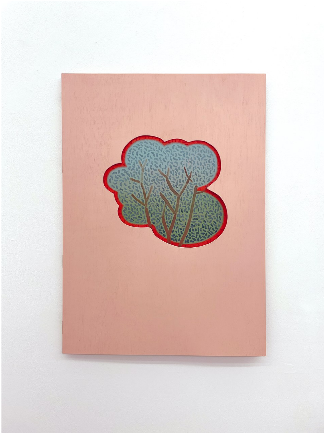
Masamitsu Shigeta A Tree Cover , 2023 Oil on canvas with wood frame 28 3/8 x 20 1/2 inches closed