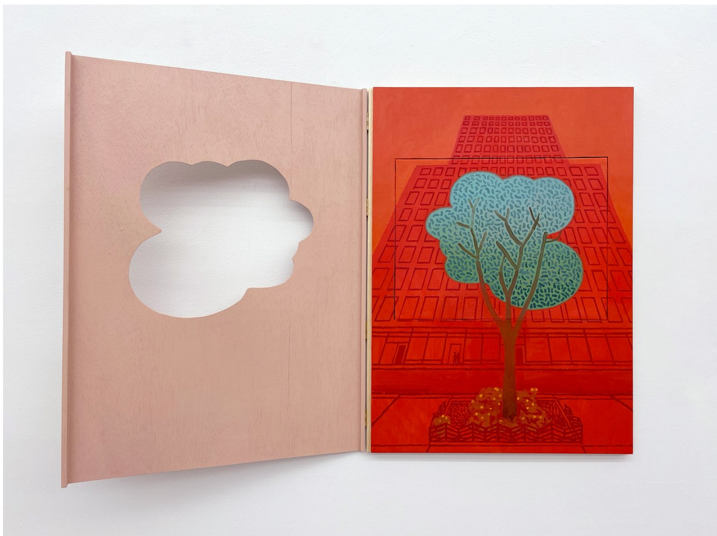
Masamitsu Shigeta A Tree Cover , 2023 Oil on canvas with wood frame 28 3/8 x 20 1/2 inches closed