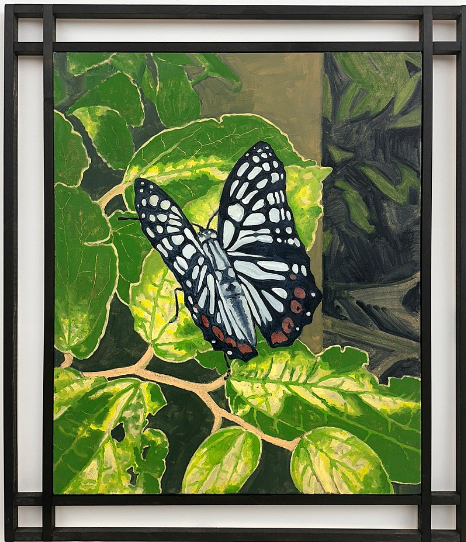
Masamitsu Shigeta A Butterfly , 2023 Oil on canvas with wood frame 34 3/4 x 30 1/4 inches