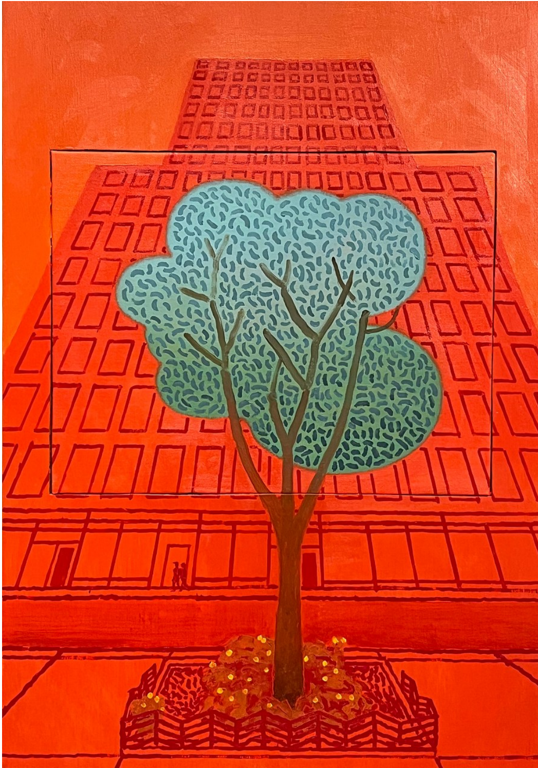
Masamitsu Shigeta A Tree Cover , 2023 Oil on canvas with wood frame 28 3/8 x 20 1/2 inches closed