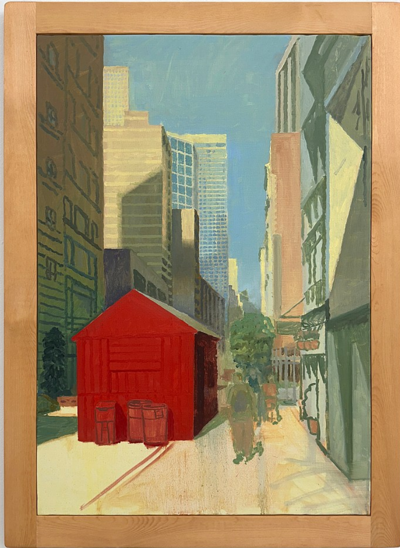
Masamitsu Shigeta A Red House , 2023 Oil on canvas with wood frame 29 1/4 x 21 1/4 inches