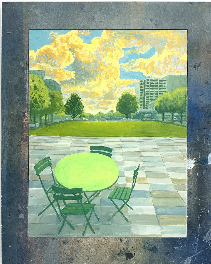
Masamitsu Shigeta A Park View in Dallas, 2023 Oil on wood panel with table top frame 22 x 17 3/4 inches