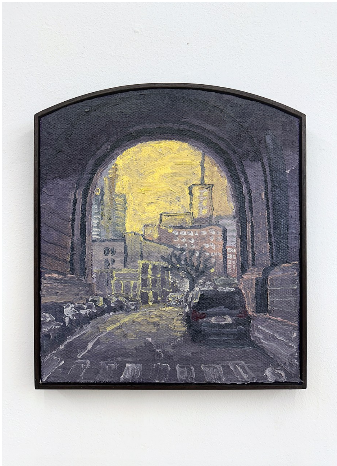
Masamitsu Shigeta Looking Through a Tunnel , 2023 Oil on coffee bag with wood frame 12 x 10 3/4 inches