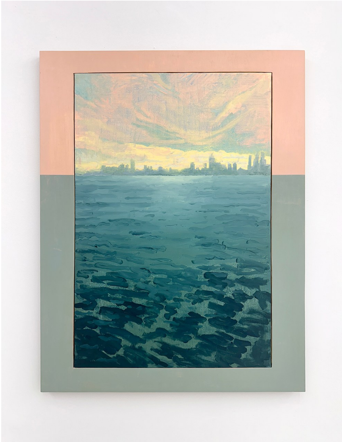
Masamitsu Shigeta New York View From New Jersey, 2023 Oil on canvas with wood frame 36.5 x 28 inches