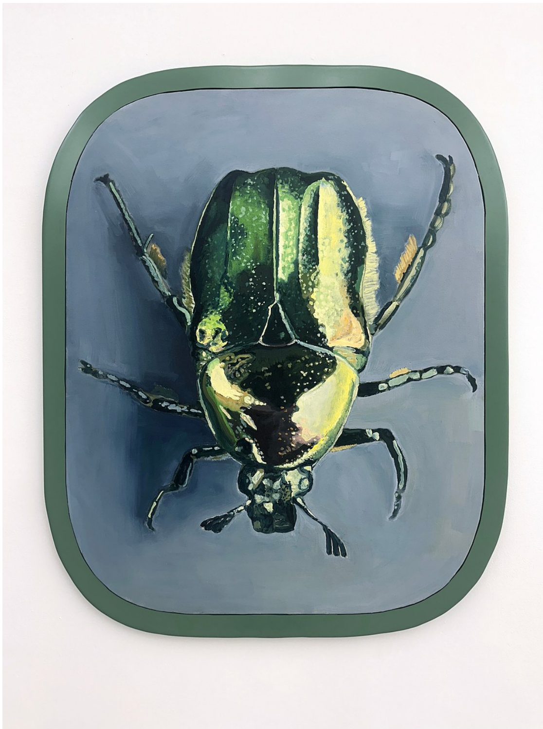
Masamitsu Shigeta A Drone Beetle , 2023 Oil on canvas panel with wood frame 39 3/4 x 32 inches