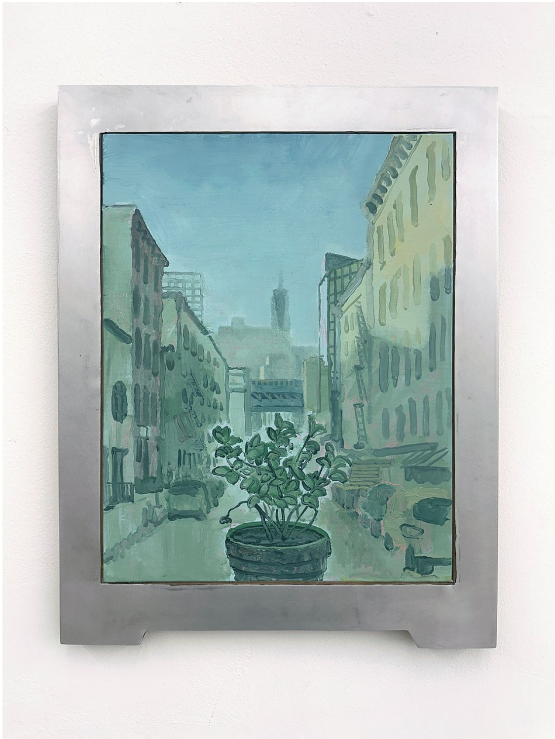
Masamitsu Shigeta Division Street , 2023 Oil on canvas panel with aluminum frame 13 x 10 inches approximately