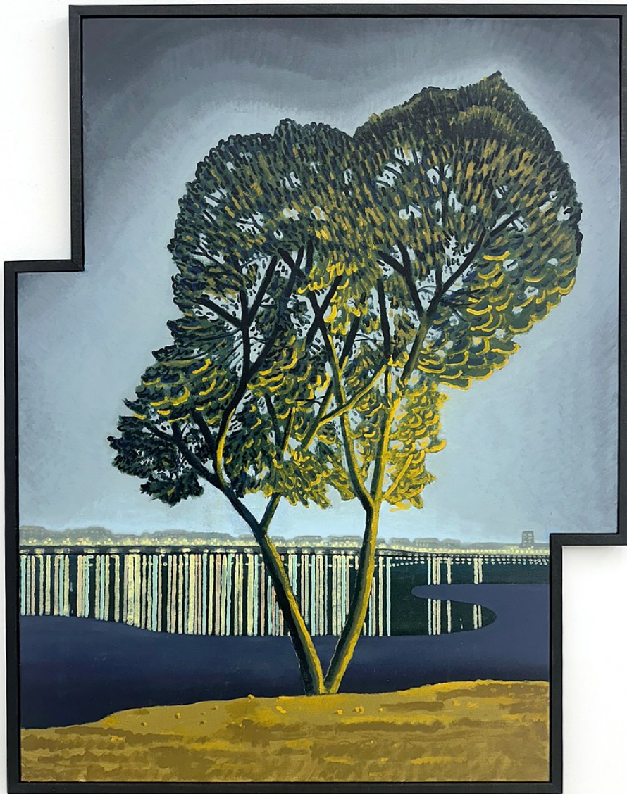
Masamitsu Shigeta A Night View of Hangang River, 2023 Oil on canvas panel with wood frame 37 1/2 x 29 1/2 inches