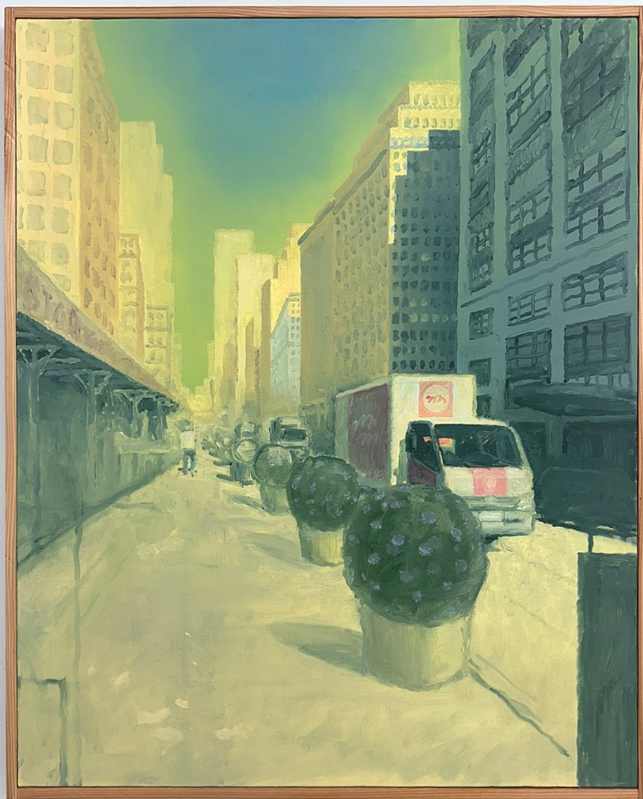
Masamitsu Shigeta A Midtown View , 2023 Oil on canvas with wood frame 32 1/2 x 26 1/2 inches