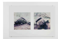
Deimantas Narkevičius Akmenys Po Du (1) , 2023 enlarged double exposure Polaroid prints on paper 35 × 51.5 cm – 13 3/4 × 20 1/4 in