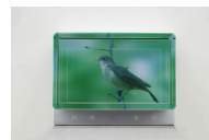
Deimantas Narkevičius (detail of installation) The Fifer , 2019 HD colour video with stereo sound (looped), holographic screen, archival black and white photograph (image: Central State Archive of Lithuania), digitally produced black and white photograph, bronze cast object © Deimantas Narkevičius, courtesy Maureen Paley, London.