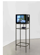
Deimantas Narkevičius Europa 54° 54' – 25° 19' , 1997 16 mm film, colour, sound, duration: 8 minutes, English spoken optical ratio: 4:3 The Fifer , 2024 exhibition view, Maureen Paley, London © Deimantas Narkevičius, courtesy Maureen Paley, London. Photo: Stephen James