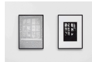
Deimantas Narkevičius (detail of installation) The Fifer , 2019 HD colour video with stereo sound (looped), holographic screen, archival black and white photograph (image: Central State Archive of Lithuania), digitally produced black and white photograph, bronze cast object