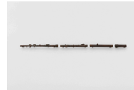
Deimantas Narkevičius (detail of installation) The Fifer , 2019 HD colour video with stereo sound (looped), holographic screen, archival black and white photograph (image: Central State Archive of Lithuania), digitally produced black and white photograph, bronze cast object © Deimantas Narkevičius, courtesy Maureen Paley, London. Photo: Stephen James