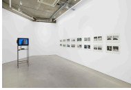
Deimantas Narkevičius The Fifer , 2024 exhibition view, Maureen Paley, London