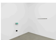
Deimantas Narkevičius (detail of installation) The Fifer , 2019 HD colour video with stereo sound (looped), holographic screen, archival black and white photograph (image: Central State Archive of Lithuania), digitally produced black and white photograph, bronze cast object The Fifer , 2024 exhibition view, Maureen Paley, London © Deimantas Narkevičius, courtesy Maureen Paley, London.