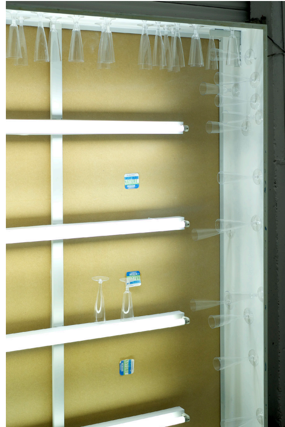
SMALL SORROWS GREAT SOGNS , Mixed media, 2022