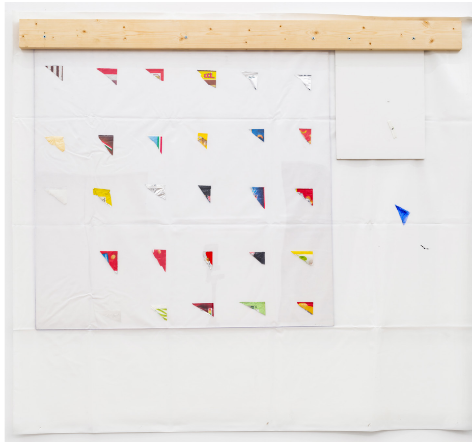
"Untitled" 2023