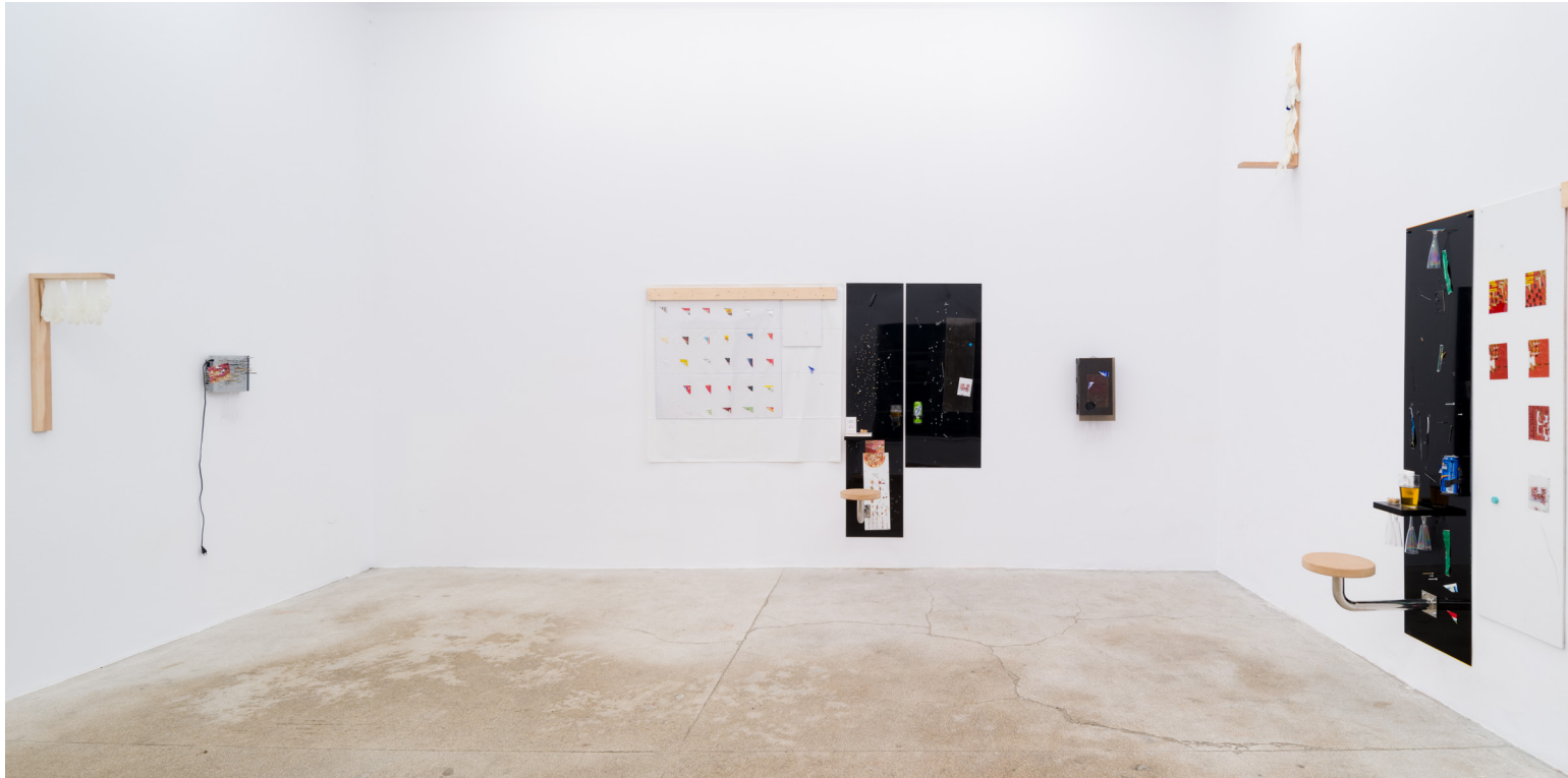
Exhibition view Reinforcement of good responses , 2023, SABOT, Cluj-Napoca, Roumanie