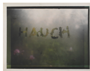
BIRGIT JÜRGENSSEN BREATH , 1995 Color photograph, laminated 50,5 x 60,5 cm Estate Birgit Jürgenssen (ph1771)