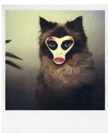
BIRGIT JÜRGENSSEN Untitled (Olga) , 1979 SX 70 Polaroid 10,5 x 8,7 cm Estate Birgit Jürgenssen (ph354)