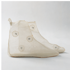
BIRGIT JÜRGENSSEN Flyweight Shoes , 1973 Organza, artificial flies 19 x 25 x 8 cm each Estate Birgit Jürgenssen (s14)