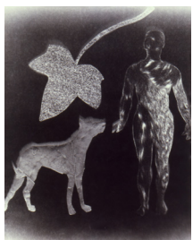
BIRGIT JÜRGENSSEN Untitled , 1975 Rayogram 36 x 29,4 cm Estate Birgit Jürgenssen (ph1075)