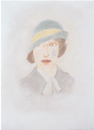
BIRGIT JÜRGENSSEN Untitled , 1977 Pencil, colored pencil on handmade paper 62,4 x 44,5 cm signed, dated Estate Birgit Jürgenssen (z78)