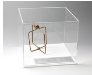
MERET OPPENHEIM Word, Wrapped in Poisonous Letters (Becoming Transparent) 1970 String, engraved brass plate 31 x 14 x 39,5 cm