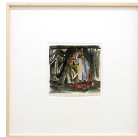
MERET OPPENHEIM Three Murderers in the Woods , 1936 Gouache on paper 21,5 x 22 cm