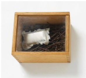
MERET OPPENHEIM The Cocoon (It is Alive) , 1974 Assemblage, wooden box with acrylic glass lid, satin cushion with mercury inlay, leaves and branches 10 x 13 x 16 cm Ed. 22/99