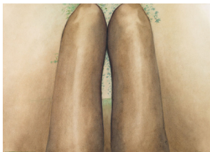
BIRGIT JÜRGENSSEN View into the Garden , 1977 pencil, colored pencil on handmade paper 44,9 x 62,7 cm signed, dated, titled Estate Birgit Jürgenssen (z196)