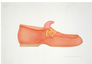
BIRGIT JÜRGENSSEN Gentlemen's Street Shoe , 1972 pencil, colored pencil on handmade paper 31 x 44 cm signed, dated, marked Estate Birgit Jürgenssen (z460)