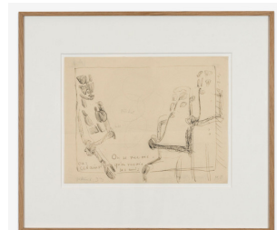
MERET OPPENHEIM Man sieht sich wieder, oder: So sieht man seine Freunde wieder , 1933 Ink on paper 21 x 27 cm