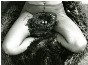
BIRGIT JÜRGENSSEN Nest , 1979/2011 Lambda Print 27 x 39,1 cm Ed. 10 + 1 PP Estate Birgit Jürgenssen (ed42)