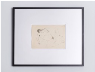
MERET OPPENHEIM Einhornhexe , 1943 Ink on paper 21 x 29,5 cm