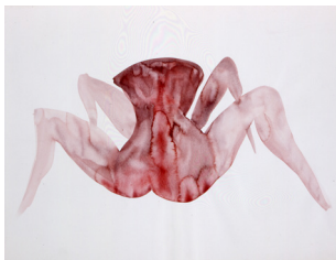
BIRGIT JÜRGENSSEN Untitled , 1978 Gouache on paper 29,6 x 42 cm Estate Birgit Jürgenssen (z351)