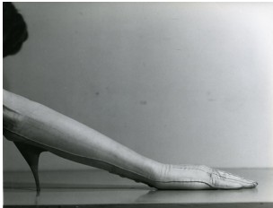
BIRGIT JÜRGENSSEN Shoe I , 1977 B/W photograph 24 x 30,2 cm signed, marked Estate Birgit Jürgenssen (ph1667)