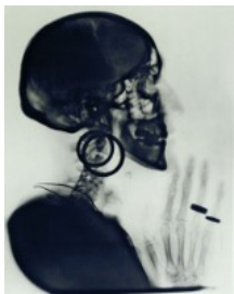
MERET OPPENHEIM X-Ray of M.O.'s skull , 1964 Offset repro from photograph 34,5 x 27,5 cm