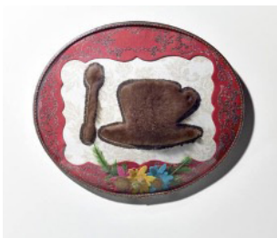
MERET OPPENHEIM Souvenir of Breakfast in Fur , 1972 Mixed media object, collage on fabric, fur, artificial flowers and sequin on cardboard under oval-arched glass 17,5 x 20 x 4 cm Ed. 71/120 + 10 AP