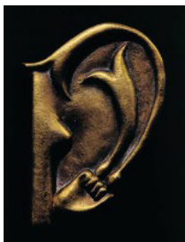
MERET OPPENHEIM Giacometti's Ear , 1977 Bronze 10 x 7,5 x 1,5 cm Ed. 146/500