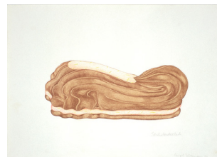
BIRGIT JÜRGENSSEN Chocolate Shoe , 1972 pencil, colored pencil on handmade paper 31 x 44 cm signed, dated, marked Estate Birgit Jürgenssen (z469)