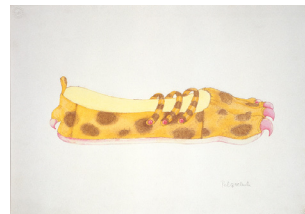
BIRGIT JÜRGENSSEN Fur Shoe , 1972 Pencil, colored pencil on handmade paper 31 x 44 cm signed, dated, marked Estate Birgit Jürgenssen (z468)