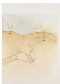
BIRGIT JÜRGENSSEN Lifelines - Little Trees , 1977 Pencil, colored pencil on handmade paper 62 x 45 cm signed, dated, marked Estate Birgit Jürgenssen (z44)