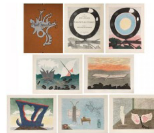
MERET OPPENHEIM Portfolio: Parapapillonneries , 1975 6 colored lithographs and 3 texts 36,5 x 49,5 cm each Ed. 2/100 signed