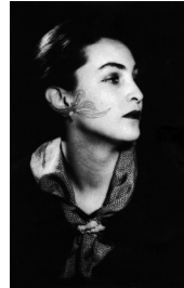
MERET OPPENHEIM Photo von Man Ray, wo ich drauf gezeichnet habe , 1936 Photograph, overpainted (archive-repro) 51 x 41,5 cm