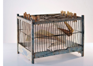
BIRGIT JÜRGENSSEN Caught Happiness , 1982 Found cage, wooden clips, oil on cellophane 35,5 x 49 x 36 cm Estate Birgit Jürgenssen (s43)