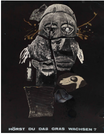
BIRGIT JÜRGENSSEN CAN YOU HEAR THE GRASS GROW? , 1968 Collage 62 x 48,8 cm Estate Birgit Jürgenssen (z524)