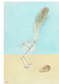
BIRGIT JÜRGENSSEN Untitled , 1974 Pencil, colored pencil on handmade paper 62,3 x 43,6 cm Estate Birgit Jürgenssen (z53)