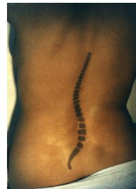
BIRGIT JÜRGENSSEN Untitled (Body Projection) , 1988/2009 Colored Photograph 70 x 50 cm Ed. 2/3 Estate Birgit Jürgenssen (ed40)