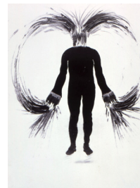
BIRGIT JÜRGENSSEN Untitled , 1975 Rayogram 40 x 30 cm Estate Birgit Jürgenssen (ph1073)