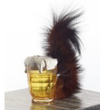
MERET OPPENHEIM Squirrel , 1969 Mixed media object, beer glass, foam, fur 23 x 17,5 x 8 cm Ed. 31/100