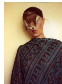
BIRGIT JÜRGENSSEN Untitled (Self with Little Fur) , 1974/2011 Color photograph 17,7 x 12,6 cm Ed. 2/18 Estate Birgit Jürgenssen (ed48)