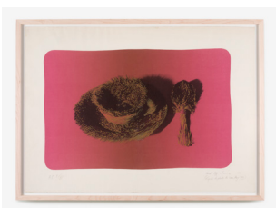
MERET OPPENHEIM Poster Pelztasse (fond rouge) , 1971 Offset print after photo by Man Ray 53 x 76 cm Ed. 190 + 30 H.C.