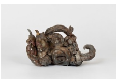
Aaron Angell Snail , 2023 Anagama natural ash, French & English inclusion bodies, Limoges porcelain, yohen, koge, kani-no-me. Lacquer repair 17 x 30 x 11 cm, unique