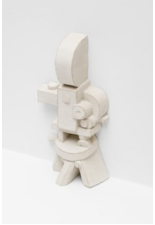
Catherine Story Sentinel , 2012 unfired clay 29 x 16 x 9 cm, unique