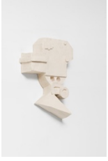
Catherine Story Star , 2011 unfired clay 20 x 16 x 6 cm, AP (cast)