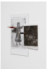
Hamish Pearch Big Fish , 2024 paper, aluminium, bronze, paint 22.3 x 20 x 7 cm, unique