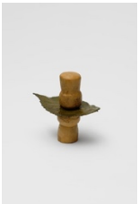
Hamish Pearch Middle Child , 2024 bronze, paint 9 x 10 x 6 cm, unique