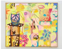
Brian Porray Untitled, 2023 Paper, synthetic polymer, spray paint and ink on canvas in artist's frame 59 x in.49.5 inches