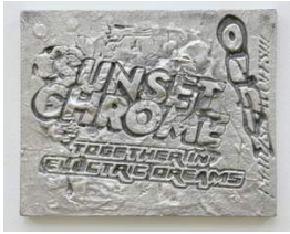
Gabriel Madan Silver Roses 001 , 2023 Aluminum 7.25 x 9 inches