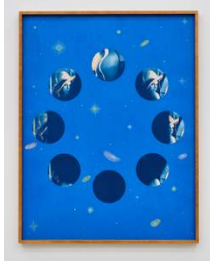
Juliana Paciulli Lena.jpg , 2022 Acrylic, colored pencil, water color and marker on cyanotype 28 x 36 inches