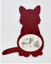
Alexa Almany Dear Vivienne , 2023 Powder coated aluminum, hand embroidery on cotton 49.5 x 40.5 inches