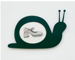
Alexa Almany See you in the Dust , 2023 Powder coated aluminum, hand embroidery on cotton 7.5 x 11.5 inches