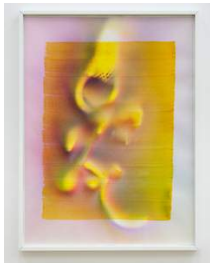
Reuben Merringer Not of an out, 2023 Watercolor and hand applied inkjet 18 x 24 inches

January 13 - February 17, 2024 presented by Gattopardo info: alex@gattopardo.la