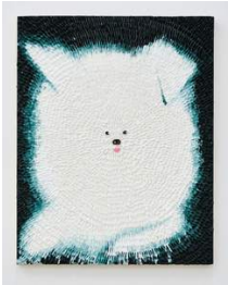
Mike Chattem Sun Angel , 2023 Acrylic and polystyrene on panel 30 x 24 inches