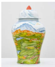
Manyu Gao Tee Time I, 2022 Between glaze painting on porcelain hat-covered jar 26.5 x 18.5 x18.5 inches