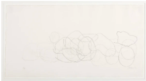
John Cage 2R/9 (Where R = Ryoanji) 1987 Graphite on handmade Japanese paper 10 x 19 in 25.4 x 48.3 cm