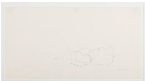
John Cage R/5 (Where R = Ryoanji) 1991 Graphite on handmade Japanese paper 10 x 19 in 25.4 x 48.3 cm