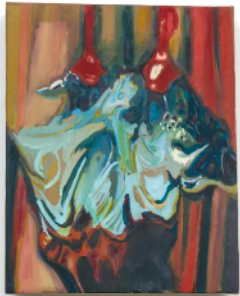
Leah Ke Yi Zheng Untitled 2023 Pigments on silk over mahogany stretcher 8 1/2 x 7 in 21.6 x 17.8 cm