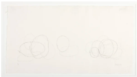
John Cage R/2 (Where R = Ryoanji) (Paris Opera Curtain) , 1990 Graphite on handmade Japanese paper 10 x 19 in 25.4 x 48.3 cm