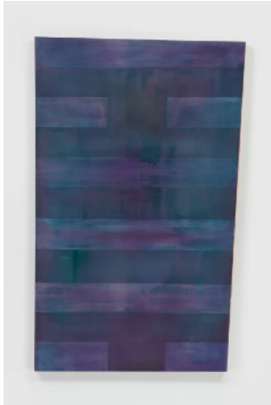
Leah Ke Yi Zheng No. 50 2023 Pigments and acrylic on silk over mahogany stretcher 37 5/8 x 59 in 95.6 x 149.9 cm