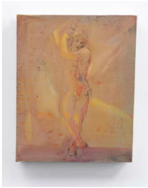
Leah Ke Yi Zheng Untitled (Nijinsky) 2023 Acrylic and pigments on silk over mahogany stretcher 8 x 9 3/4 in 20.3 x 24.8 cm