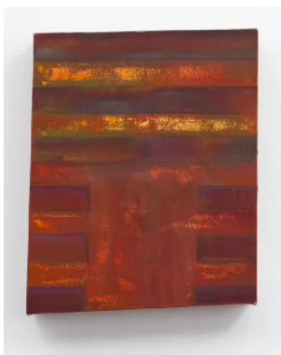
Leah Ke Yi Zheng No. 12 2023 Acrylic and pigments on silk over mahogany stretcher 12 x 9 1/2 in 30.5 x 24.1 cm