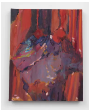
Leah Ke Yi Zheng Untitled (main) 2023 Pigments on silk over mahogany stretcher 12 x 9 1/4 in 30.48 x 23.5 cm