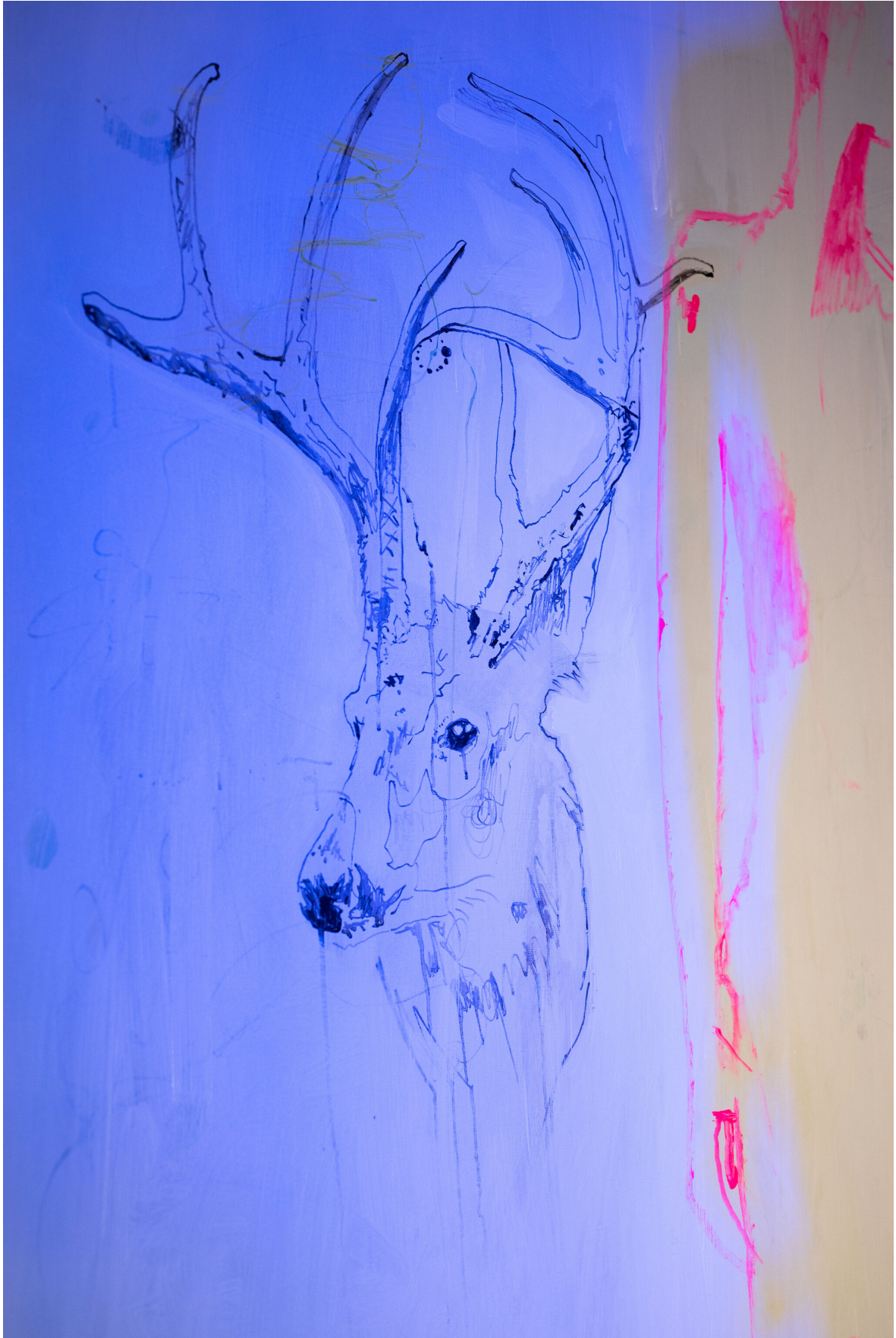
Detail