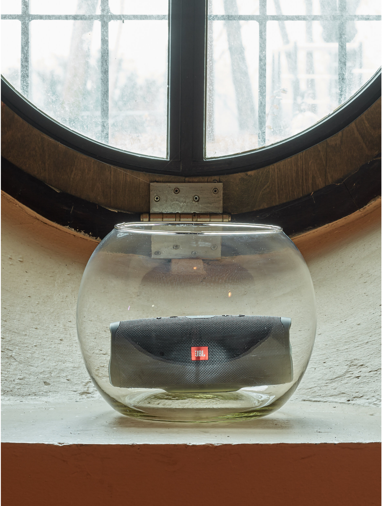
Whitney Claflin Life Hack , 2024 Bluetooth speaker, glass bowl Dimensions variable