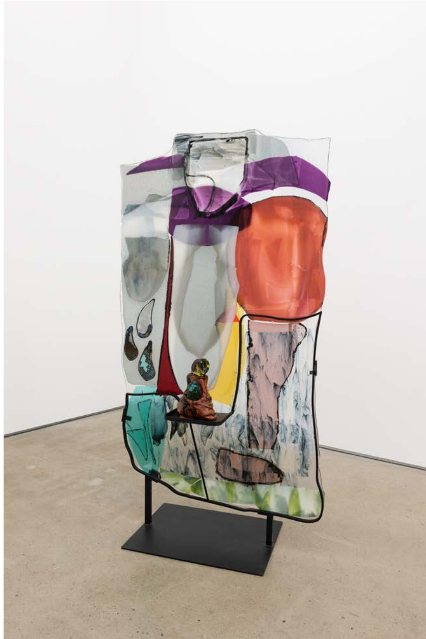
Jessica Jackson Hutchins Presence , 2017 fused glass, ceramic, steel 55h x 30w x 12d in 139.70h x 76.20w x 30.48d cm JJH2017001