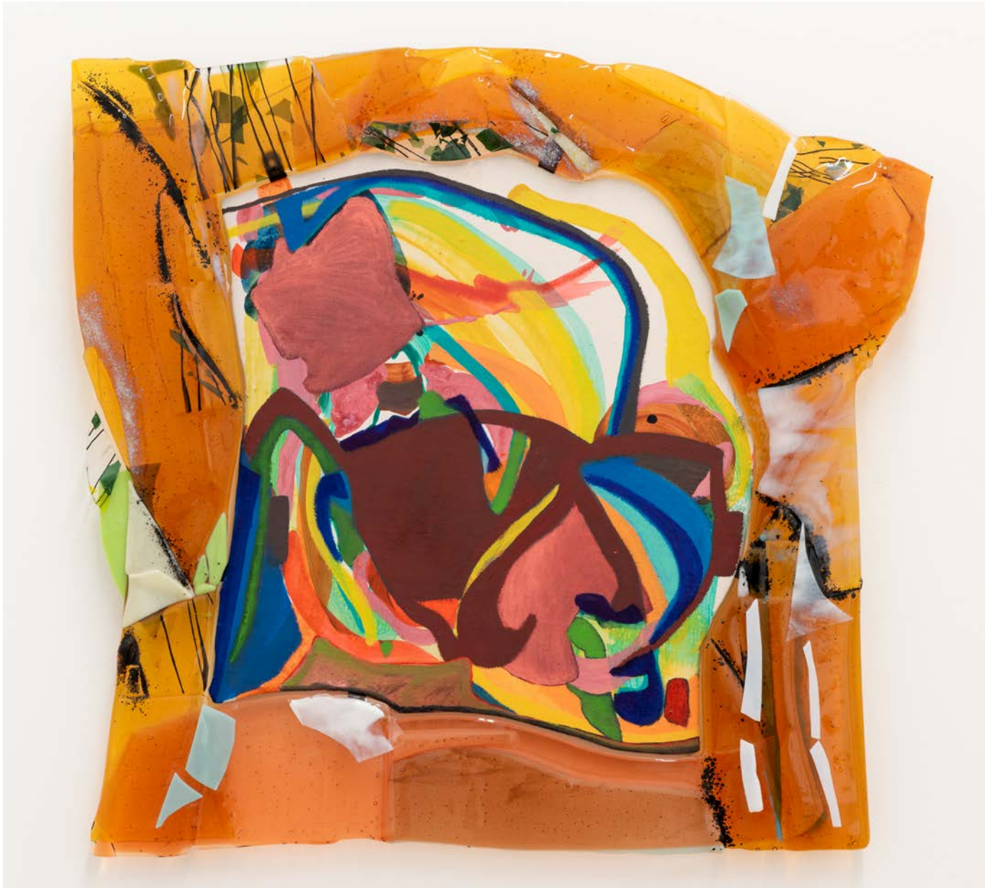
Jessica Jackson Hutchins and Marley Freeman Crush of the Rose 1 , 2023 fused glass, acrylic, and oil on linen 23h x 25w x 2d in 58.42h x 63.50w x 5.08d cm JJH_MFree_001