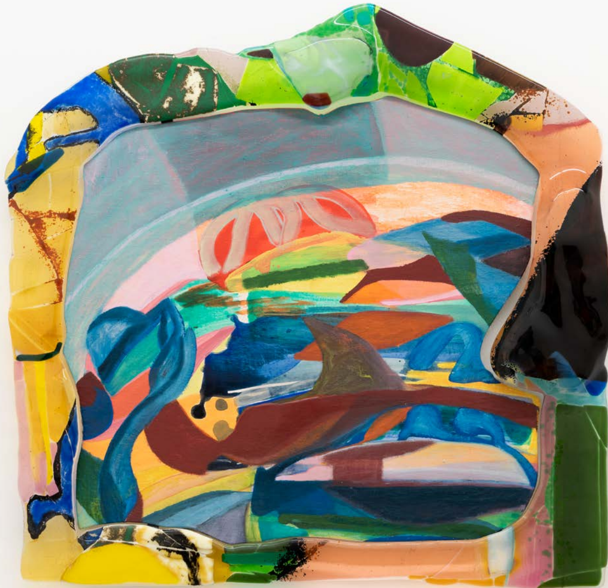
Jessica Jackson Hutchins and Marley Freeman Crush of the Rose 2 , 2023 fused glass, acrylic, and oil on linen 24 3/4h x 26w x 2 1/2d in 62.87h x 66.04w x 6.35d cm JJH_MFree_002