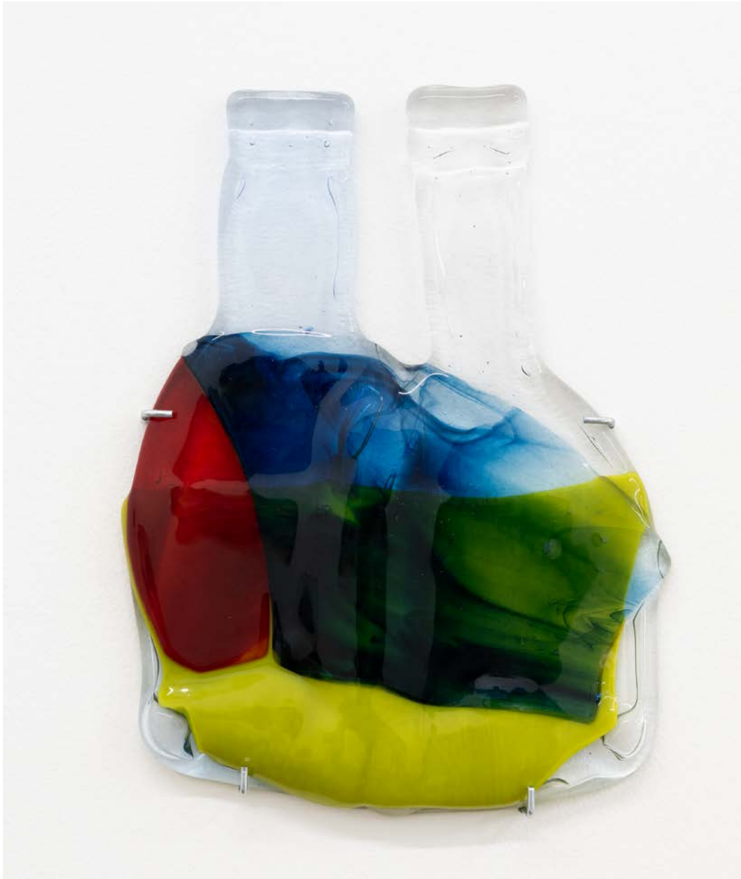
Jessica Jackson Hutchins Red Shoulder , 2023 fused glass 9 1/2h x 7 1/4w x 1/2d in 24.13h x 18.41w x 1.27d cm JJH2023015