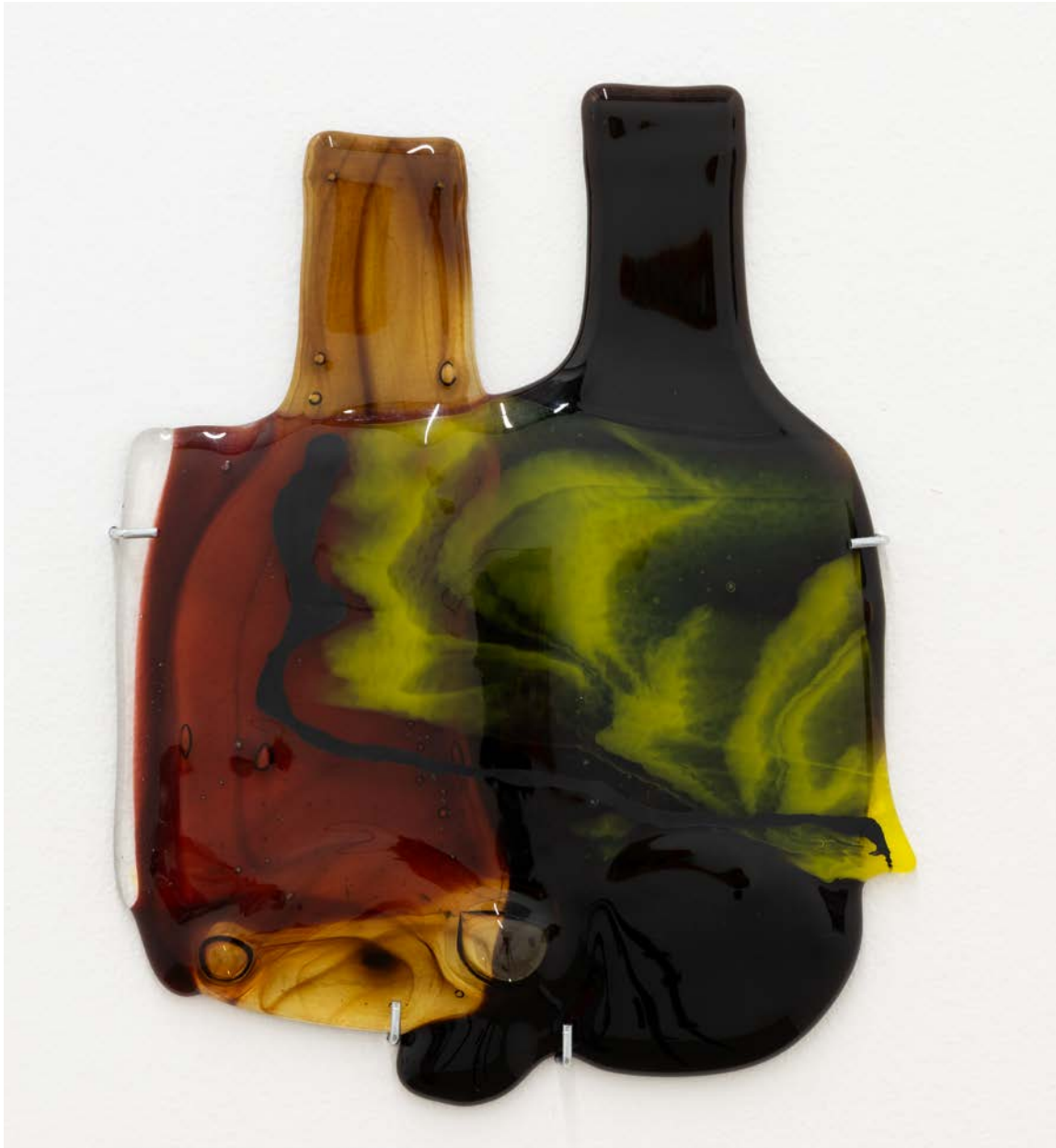
Jessica Jackson Hutchins Cradled , 2023 fused glass 9 5/8h x 7 5/8w x 1/2d in 24.45h x 19.37w x 1.27d cm JJH2023017