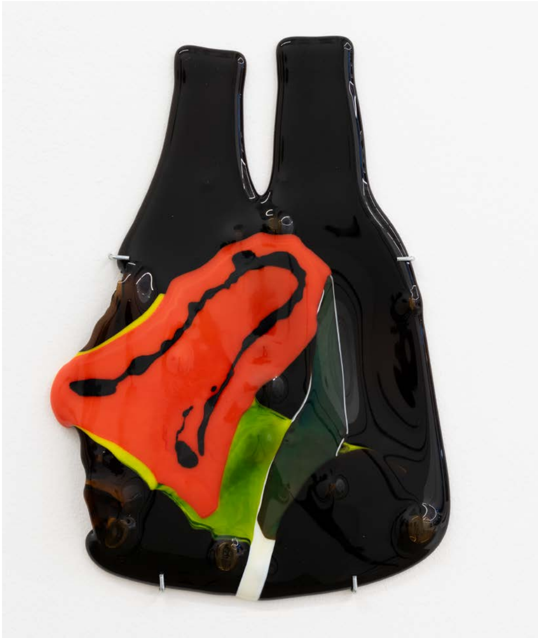
Jessica Jackson Hutchins Drawing Habits , 2023 fused glass 11 3/4h x 8 3/4w x 1/2d in 29.84h x 22.23w x 1.27d cm JJH2023016