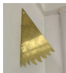
Elly Reitman Sun , 2024 Brass 14 x 7 ¼ in.