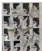
Max Guy Leaf Negative , 2020/24 Cut paper, inkjet print 15 ½ x 11 ½ in. (framed)