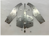
Elly Reitman Jacket (winter) , 2024 Steel, rare earth magnets 48 x 40 in.