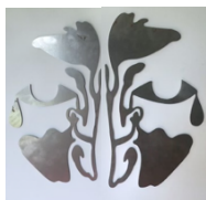
Elly Reitman Sinus Diagram , 2020 Steel, rare earth magnets 16 x 16 in. each