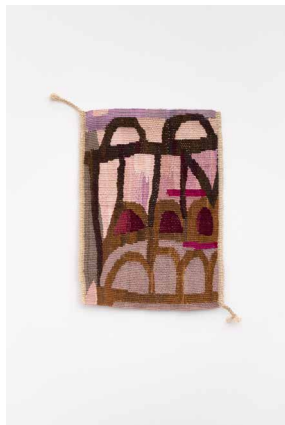
MARIA ADLERCREUTZ Utan titel , 1963 Cotton, linen and wool on linen warp 40.5×29 cm