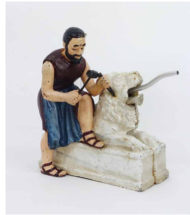
THOMAS HÄMÉN The Artist (sculptor) , 2022 Smokeable kinetic sculpture in cast iron, aluminum and glass 19×18×10 cm