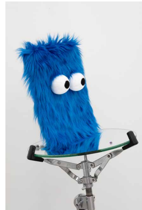
STEFAN TCHERPNIN Wishing Well , 2022 Faux fur, felt, foam and embroidery thread on canvas; mirrors, amethyst, snare drum stand and hardware 94×41×40 cm