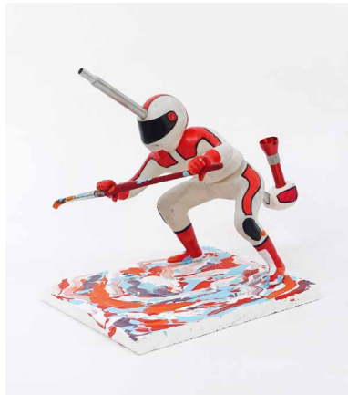
THOMAS HÄMÉN The Artist (painter) , 2022 Smokeable sculpture in aluminum, wood and acrylic 19×19×17 cm