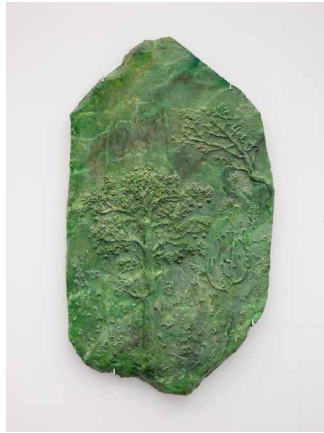
KLARA ZETTERHOLM Orchard Fragment , 2022 Styrofoam, plaster, synthetic clay and acrylics 92×53×7 cm