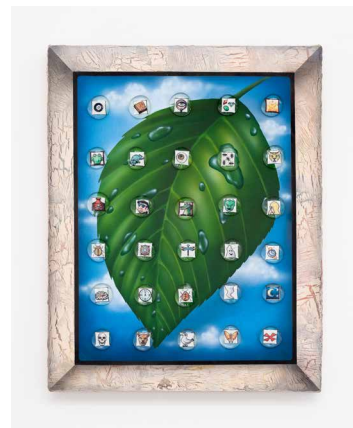
MIA SCARPA No Rain , 2022 Acrylic, collage and glass on canvas 50.8×40.6 cm