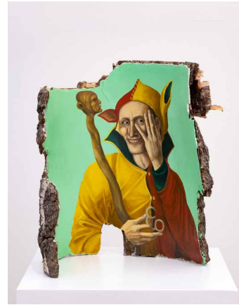
KLARA ZETTERHOLM Knock Knock , 2022 Oil on birch wood 38×34×40 cm