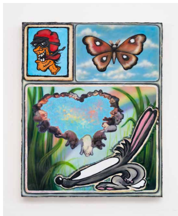
MIA SCARPA Blurry – Acoustic , 2022 Acrylic, oil, beeswax, glue and collage on canvas 50.8×40.6 cm